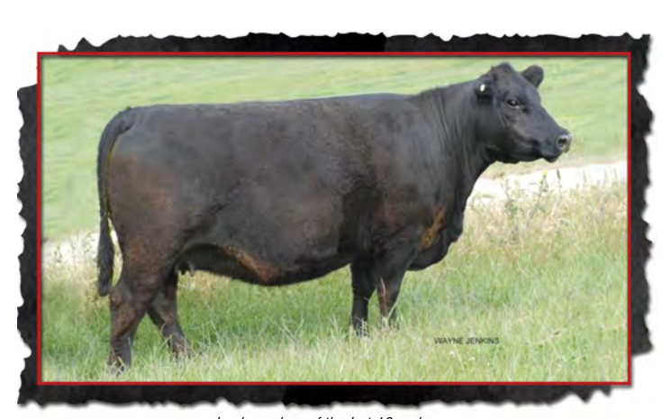
Isadora, dam of the Lot 19 embryos

This mating offers an exclusive combination of fertility, early maturity, muscle power and the ability to finish on grass. Isadora (Genestar M2 T2 FE7) is a half sister to Ardrossan Neron and is one of only 2 daughters of Broken Arrow Opal Nera. She has a wonderful temperament and is a complete cow with fertility, perfect udder, great feet, depth and muscle and obvious longevity. GTL Unique, co-owned with Grassline Cattle Co., was selected in this mating for the correctness, muscle, early maturity and growth of his dam and sire.