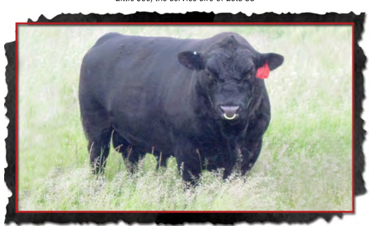
Jamberoo, the sire of Lot 32