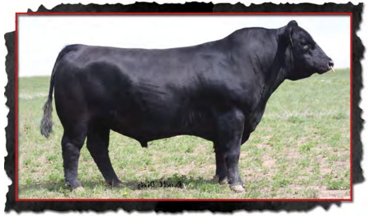
Cajun Red, sire of percentage bulls

Lot 80: Black 3/8 bull Nick 037X born 5/19/10 BW: 51, Red Angus dam.