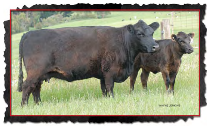
Nardia, dam of the Lot 18 embryos

This is the first time release of this exciting mating. Nardia (GeneStar FE7 T4 M3), the dam of Jamberoo, is a very feminine, fertile cow. Sire Vitulus Yes Yes (Genestar T4) was Junior and Grand Champion at the Brisbane Show and has sired many US champions. He is a moderately sized bull with a height of 45" and REA of 39 sq in with minimal fat cover. This combination will provide cattle that will produce in all climates.