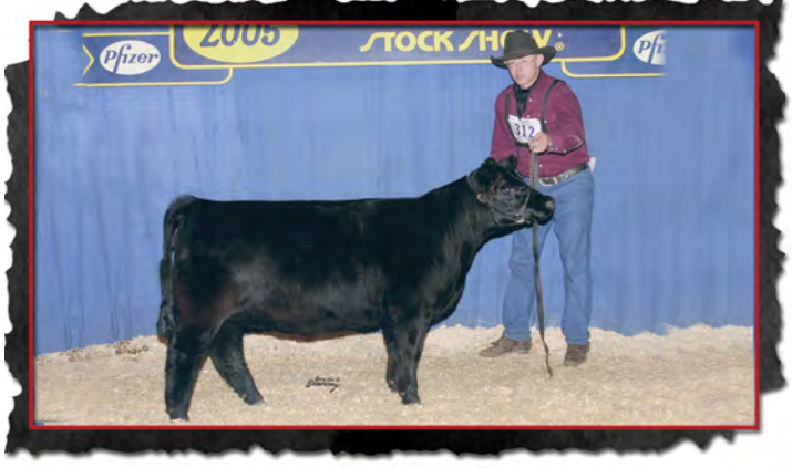
Bar J Nadine, National Champion and full sister to Lot 3.

She is a full sister to the 2005 National Champion Female. She was Al bred to Jackaroo FM8279 on June 28 then pasture exposed to GTL Waylon W09 FM9956.