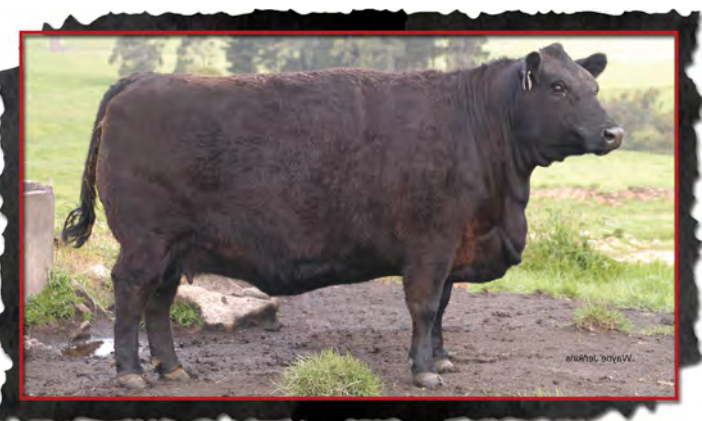
Delvene, dam of GTL Unique, sire of the Lot 19 embryos