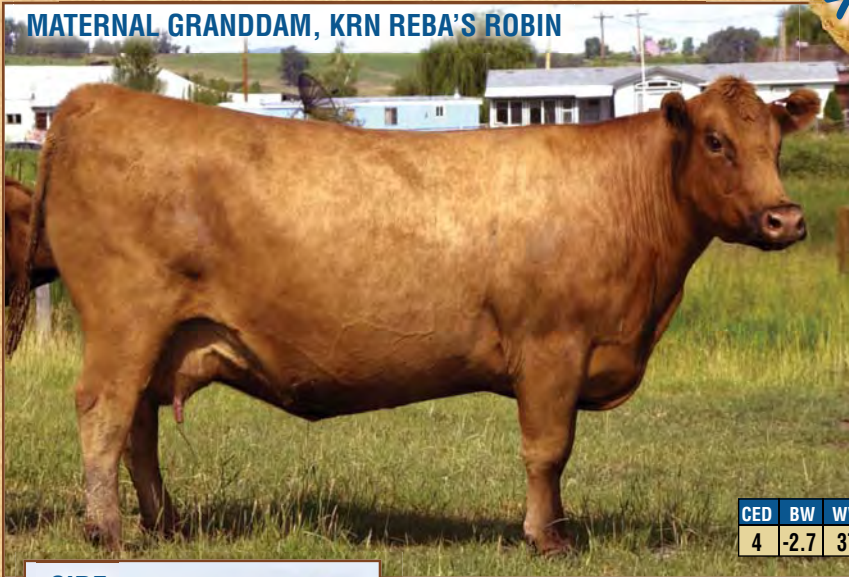
MATERNAL GRANDDAM, KRN REBA'S ROBIN