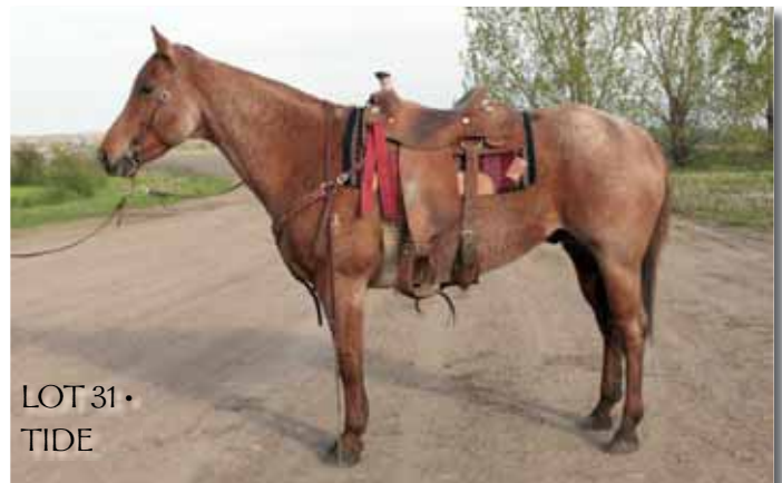
LOT 31 • TIDE

Tide is a good, solid ranch horse who has drug calves to the fire, gathered big pastures and sorted pairs. He is a very nice head/heel horse and has a big stop. He stands 14.3 hh and weighs 1,100 lbs. Consigned by Matthew Wznick • (406) 489-2414 MZ