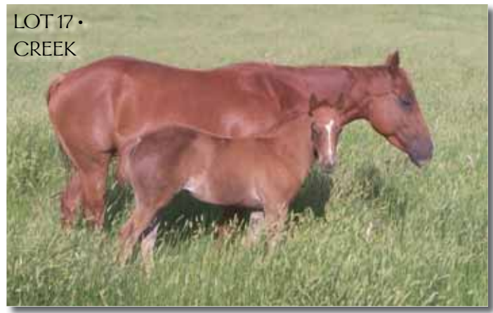
LOT 17 • CREEK