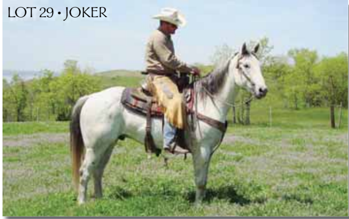
LOT 29 • JOKER