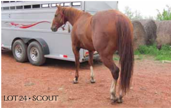
LOT 24 • SCOUT