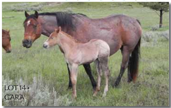
LOT 14 • CARA