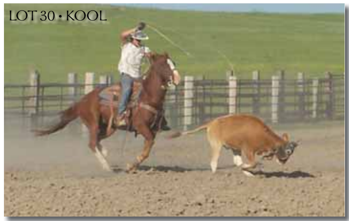
LOT 30 • KOOL