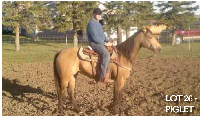
LOT 26 • PIGLET