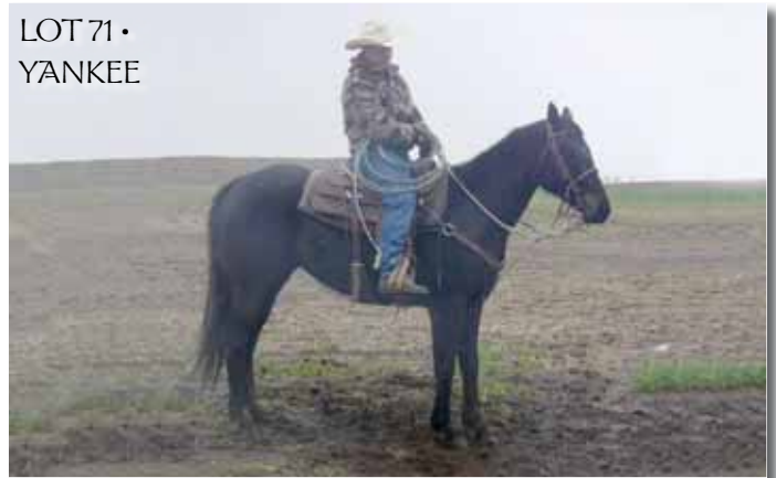
LOT 71 • YANKEE