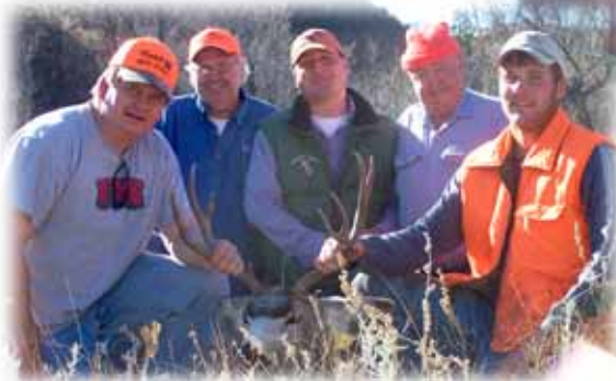
A successful mule deer hunt in the Badlands.