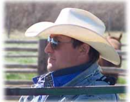
Working cows – another good day at the office.