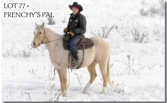
LOT 77 • FRENCHY'S PAL