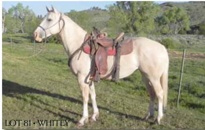
LOT 81 • WHITEY