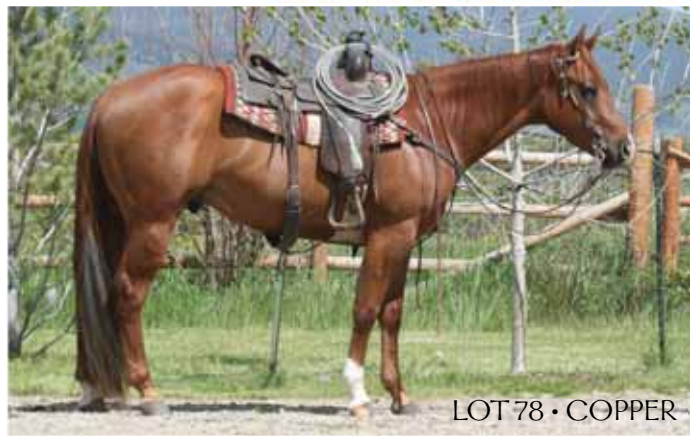
LOT 78 • COPPER

Consigned by Turner Performance Horses • (406) 381-2347