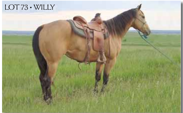
LOT 73 • WILLY