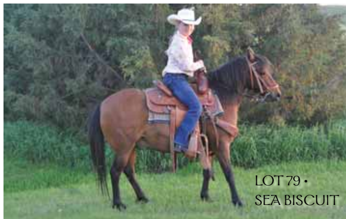
LOT 79 • SEA BISCUIT

Consigned by Cody Miller-Kraft • 701-622-3151