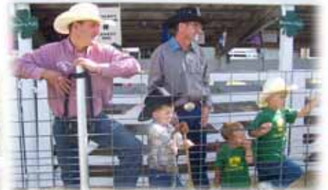
Waiting for the stick horse race in Wibaux.