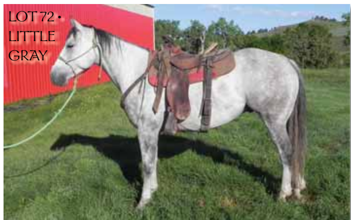
LOT 72 • LITTLE GRAY