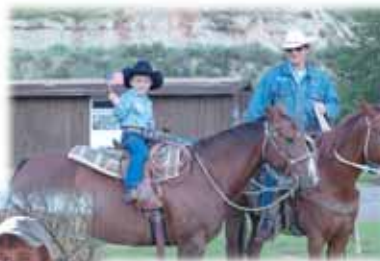
The Sperry crew rode sale horses in the Flag Day parade in Medora.