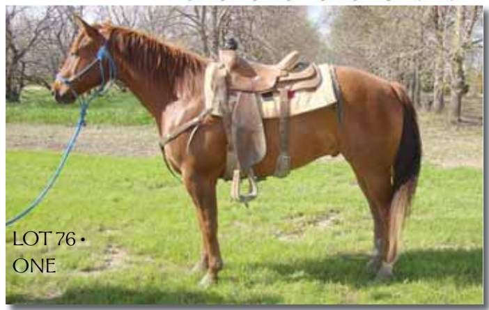
LOT 76 • ONE

One is a stout, sorrel 5-year-old gelding that is in training for heading, heeling, breakaway, barrels and poles. He has exceptionally smooth flying lead changes, spins and a great stop! Check out www.anchorhorses.com for video! Consigned by Anchor Horses • (701) 898-8977 or (701) 570-9219