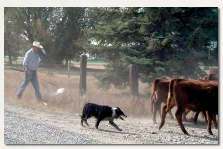
Our other best hired hand

X122 is a product of our ET program. We flushed 041 for Australian export, and we had more eggs than they agreed on, resulting in this female. 041 is a powerful female with a perfect udder attachment and very small teats. We flushed her several times, and then sold her to Wildcat Creek at 10 years old. This young female is a bit bigger frame than most of our cattle.