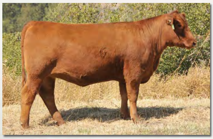
LOT 103 - GMRA VENICE 118

This nice, smooth Larkoba heifer brings a lot of maternal power to the table. Her dam has an MPPA of 103.1, with an average weaning ratio of 104 on 4 and her granddam has an impressive 108.5 MPPA, with an average weaning ratio of 111 on 6. Six of Larkoba 107's EPDs are in the top 7% of the breed or higher – HPG is in the top 7%, YW and CW are in the top 5%, and WW, TM and Stay are in the top 4%.