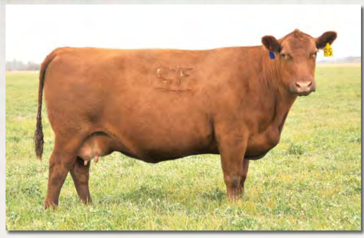
LOT 61 – FEDDES BLOCKANA R5