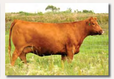
FEDDES LAKINA 310