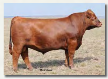
C-T GRAND STATEMENT 1025