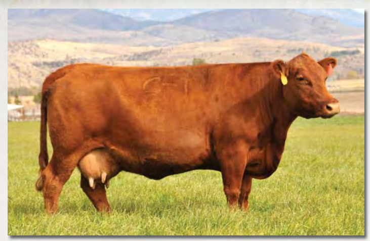
LOT 56 - CTDB MISS PAN 220