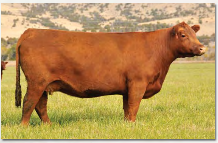
LOT 40 - C-T VERDI 0814

A good young Rambo 323 daughter from the very maternal Tina cow family. Will make a great cross with Pasquale 923.