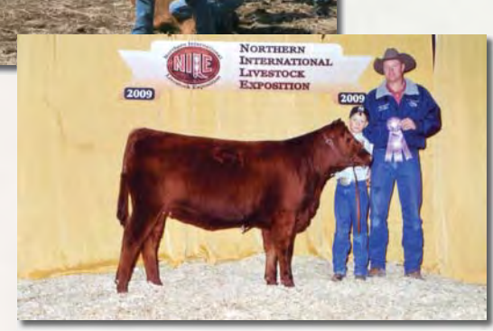
Traig at the 2009 NILE