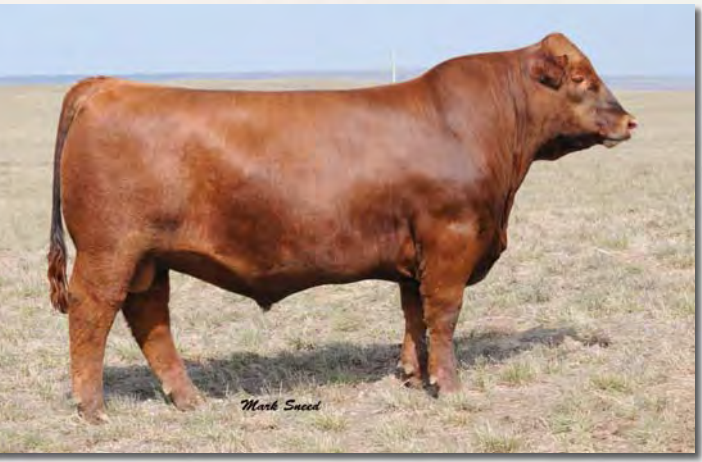
C-T Grand Statement 1025