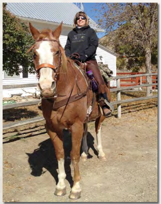
Julie and Flash

We hate to see this Laubach heifer go, but she's just too far out of our calving season. She is dam to an outstanding bull calf that ratioed 113 at weaning, giving Nexa 0093 an impressive 105.2