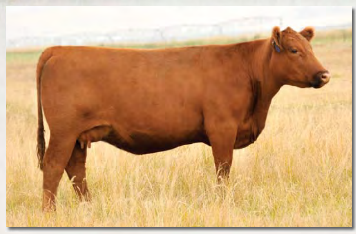
LOT 32 – DKK DAZZLE 031