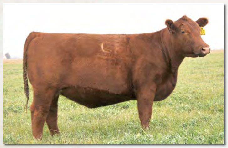
LOT 75 - FEDDES SLEEK X22

X142 is a granddaughter of 4225, who we flushed until she was 15. Grand Canyon, Red Lightning, Hobo 1961, Chateau 744 and Rambo 502 are all stacked in a 5-generation pedigree.