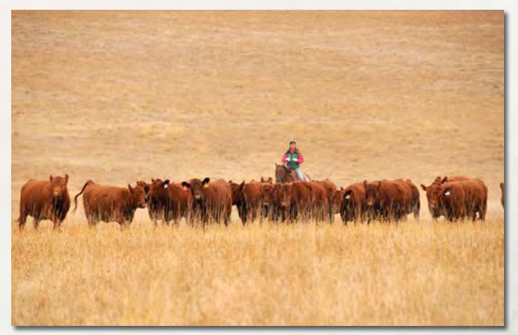
Fall heifer gather