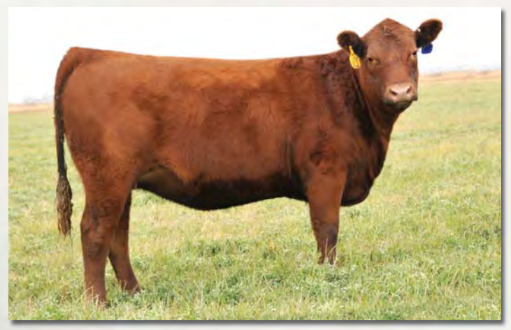
LOT 97 - FEDDES BLOCKANA Y96

Y75 is another heifer that is hard to sell. We really like the looks of the Big Chief replacement heifers at this point. The Big Sky daughters are making great cows all across the country and I expect the Big Chiefs to do the same. There is a lot of power and balance in this lot.