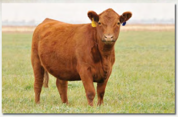
LOT 98 – FEDDES BLOCKANA Y146