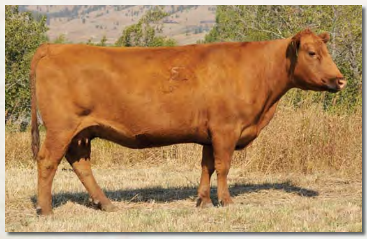
LOT 9 - GMRA PEACHA 671

This deep, thick Chateau daughter is a full sister to GMRA Citadel 6109, our high-selling bull in 2007, purchased by ABS. Her 2011 bull calf, Merit 1302, was a featured picture bull in our 2012 bull sale catalog and sold to longtime customer, Clyde Thompson, for $5250. Merit 1302 had an excellent phenotype combined with an outstanding disposition. Nexa 564 is bred to EPD growth leader, Justice, who had our high-selling sire group in our 2012 sale. Imagine the power of the calf that will hit the ground next spring!