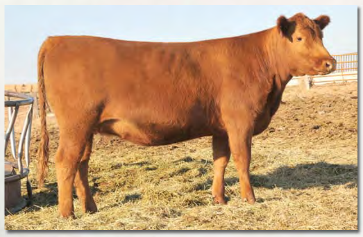
LOT 79 - DKK DAZZLE 188

This is a low-maintenance, classy young lady. Her mother, DKK Eleanor L01, is easy on the eyes and this bred heifer follows in her footsteps. Bred to Beckton Epic R397 K, the calving ease, growth, low-maintenance, carcass specialist.