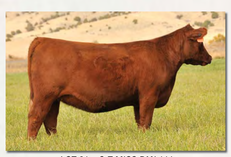
LOT 91 - C-T MISS PAN 111

Another nice Mission Statement daughter from the strong Honest Girl cow family. Will be a great mating with Right Design 107.