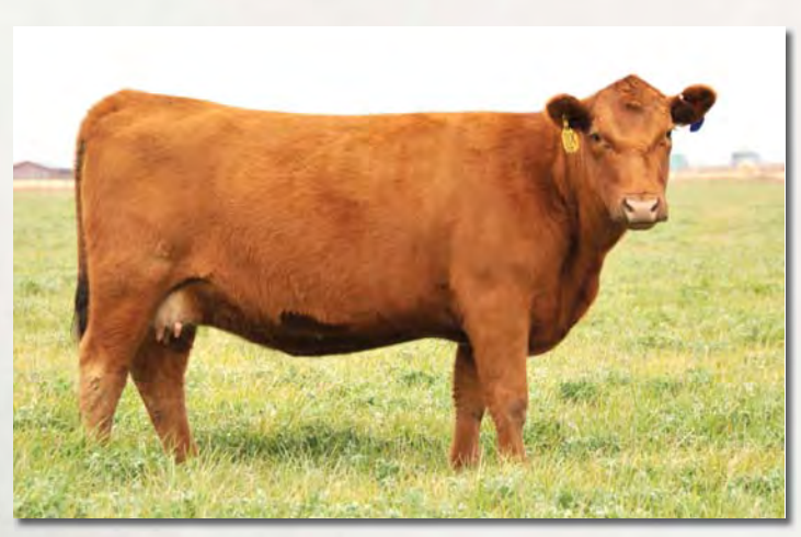
LOT 72 - FEDDES BLOCKANA X112

X92 has a very balanced set of EPDs. Her first calf had a ratio of 100. Her maternal sister by Feddes Atlas 12S is one of the top bred heifers in our replacements.