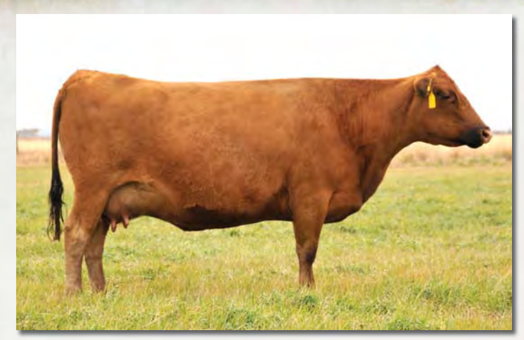
LOT 58 - FEDDES LARKABA 322