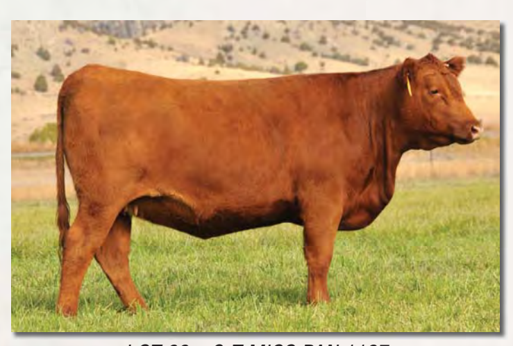
LOT 88 - C-T MISS PAN 1127

If you are looking for a bred heifer with amazing individual performance and EPDs, this heifer will fit that bill. She is in the top 1% for three traits and has a 116 WR and a 118 YR. These Jackhammer daughters look like they will make great cows. This will also be an exciting mating bred to our powerful new Right Kind son.