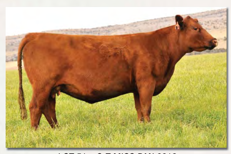
LOT 51 - C-T MISS PAN 0918

A solid, young Grand Canyon, Make Mimi bred cow with loads of volume and performance. MPPA