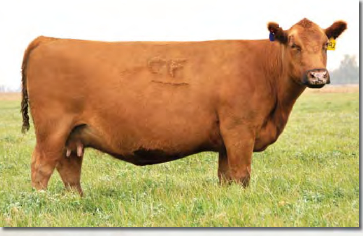
LOT 60 - FEDDES BLOCKANA 392

The 351 cow has been a favorite of mine for many years. If you are looking to add some depth and power to your cowherd, don't overlook her. Her bull calf last year sold to Ğill Red Angus and Lucht Red Angus in our 2012 spring sale. We are flushing a daughter. A granddaughter was chosen as the Pick of the Feddes heifer calves in 2011 Big Sky Elite sale. I am sure glad we have several really good daughters and granddaughters, or selling this cow would be even more painful. We decided to sell all the 2003 females (or embryos on them), or this cow would not be for sale.