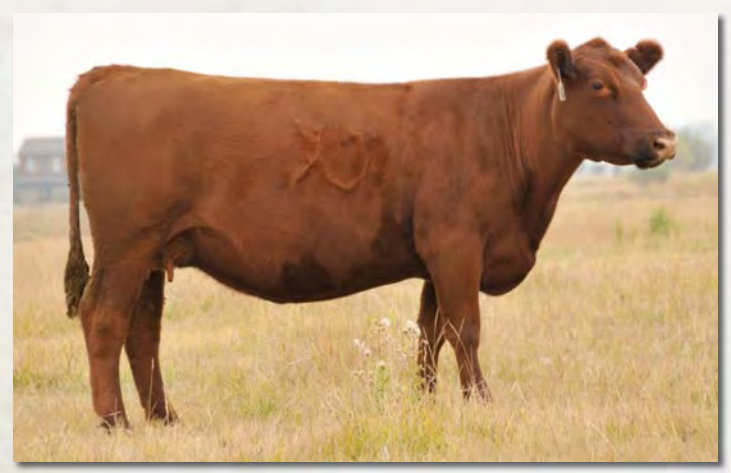
LOT 31 - DKK 9058

This beauty was selected by Klompien & C-T as the 2009 pick of the Milk Creek replacement heifers. She has 10 traits in the top 30% of the breed. Her amazing 2011 heifer is retained in the Klompien herd. MPPA: 102.8. Mated to DKK Authority; the calf should definitely be a "keeper."