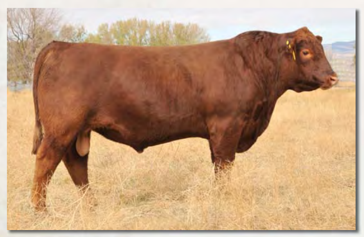
Loosli Right Design 107

This Red Smoke x Shoco Data has a unique pedigree, with a very solid set of EPDs and a nice phenotype.