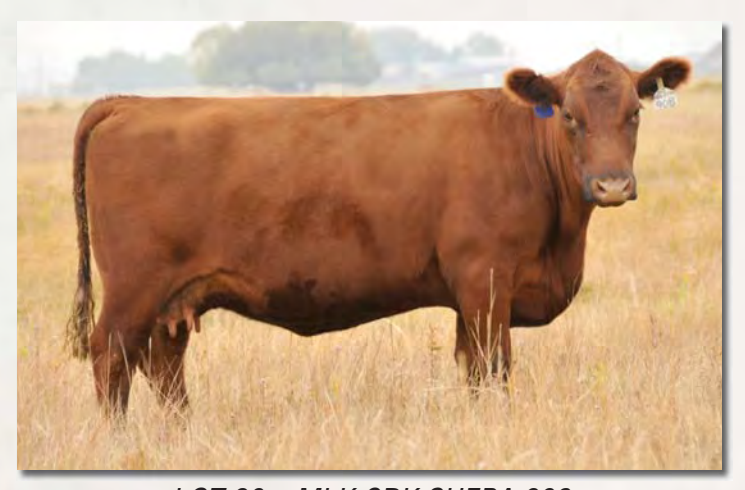
LOT 30 - MLK CRK SHEBA 908

This is a Major League daughter that goes back two times to Rambo 502 on the dam's side. She is a moderate-framed, clean-made, very quiet cow. Her 2012 Grand Statement bull calf will be in the Klompien Bull sale next spring. Wait until you see her 2013 Ultimate calf. DKK Ultimate proved to have superior RFI at Midland Bull Test and sold to Sun River Red Angus. The calves are consistent, eye catching, and all who have used him have been very impressed. DKK Ultimate should really complement this cow.