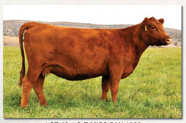
LOT 46 - C-T MISS PAN 1083

A solid young Make Mimi bred cow from the very maternal Tina cow family. She is in calf to the exciting young Loosli Right Kind 107 that we purchased with Feddes and Wildcat.