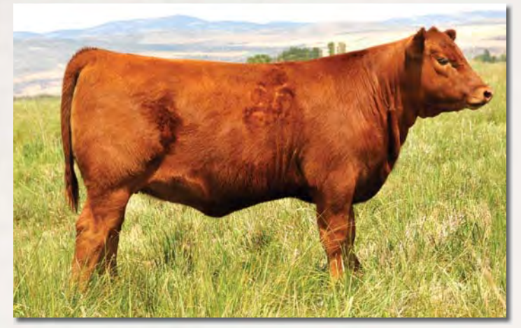
FEDDES BLOCKANA Z22

It takes great cows to make great bulls!