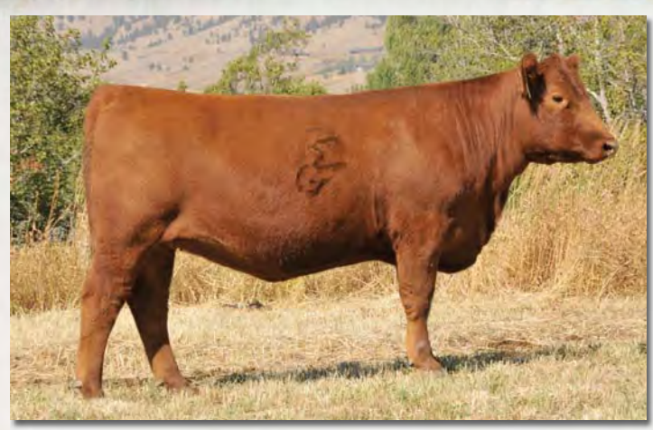
LOT 101 - LGR VENICE 103