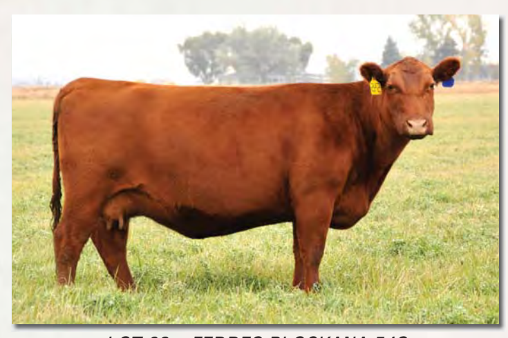
LOT 62 - FEDDES BLOCKANA 54S

R5 is a moderately framed female that is powerful and easy fleshing. She comes from the Blockana cow family