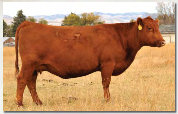
LOT 52 - C-T VERDI 0904