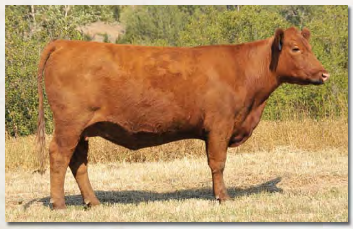
LOT 16 - GMRA ANGIE 031

A young female that features a low-birth-to-high-growth spread. Her BW EPD is in the top 27% of the breed, while WW is in the top 26% and YW is in the top 16%. And she doesn't stop there! Eleven of her 15 EPDs are in the top 30% or higher, topping out with a REA in the top 4%.