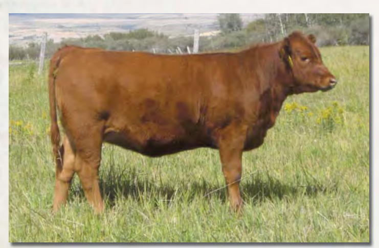
Feddes Rainbow X108, Big Sky Elite Alum that sold to Wildcat Creek Ranch.