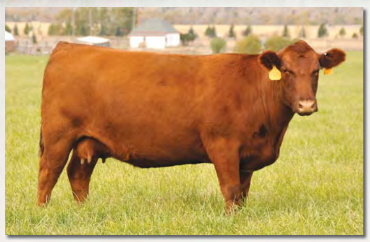
LOT 50 - C-T MISS PAN 0984