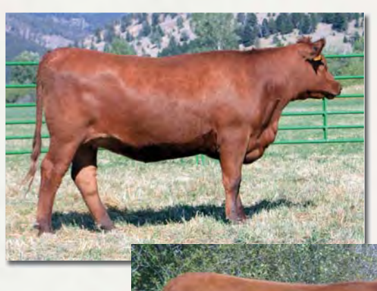
GMRA Bred Heifers

Don't miss this tremendous opportunity to have complete control in purchasing a foundation female.