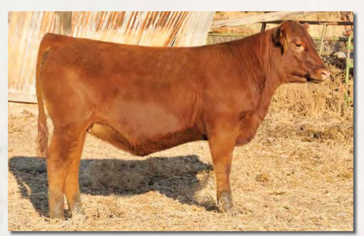
DKK ANGIE ROSE 2079

Now, let's look at her phenotypically ... simply put ... sweet, sweet style, class and ... wow! To sweeten the pot even more; if you have the highest bid on our elite pick, you may choose Angie Rose 2079; OR you are welcome to select any other heifer calf from all of our replacement heifers (47 head).