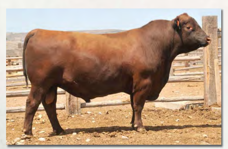
Luchts Pasquale 923

A nice productive young cow from the famed Miss Pan Cow family. She will cross well with Pasquale 923. MPPA 100.