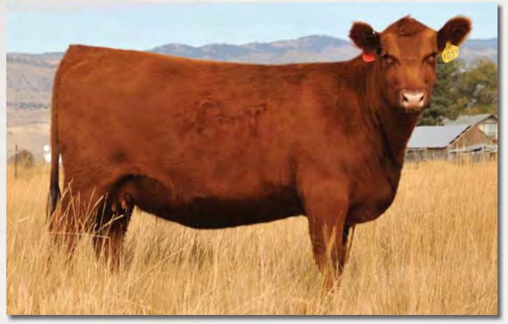
LOT 44 - C-T VERDI 1054