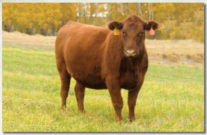
LOT 87 – C-T HONEST GIRL 1180