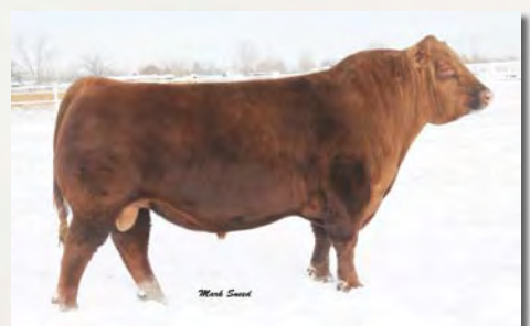
FEDDES BIG SKY R9