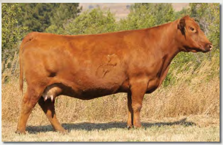
LOT 7 - GMRA FIREFLY 358