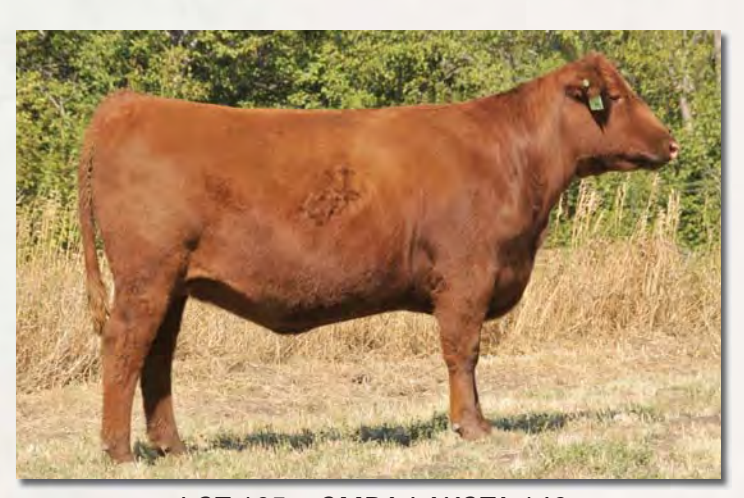
LOT 105 - GMRA LAKOTA 146

This bred heifer has great depth of rib with lots of capacity. She has cutting-edge EPDs - 11 of her numbers are in the top 44% or higher, with a negative birth EPD while WW and YW are in the top 21% and 11%, respectively.