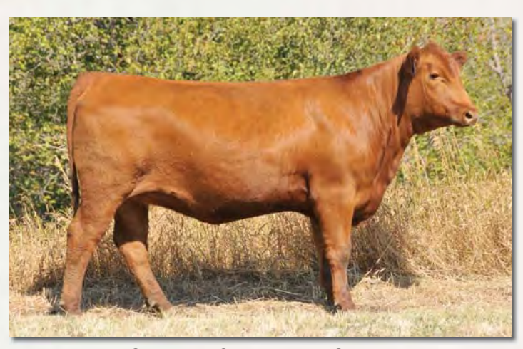
LOT 102 - GMRA LARKOBA 107

The Justice calves are some of the most sought after in the country and here is the only bred heifer sired by Justice in the offering. She has great length and is nice and deep. Her breeding gives her top-notch growth numbers, with a WW EPD in the top 1% of the breed, a YW in the top 2%, and a CW in the top 3%.