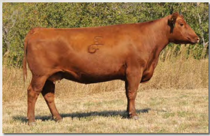
LOT 10 - GMRA LARKABA 716