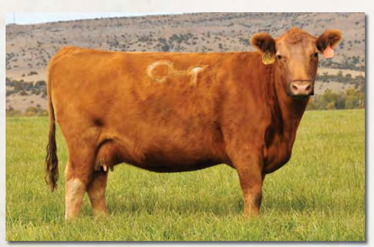
LOT 37 - C-T MATTIE 0525

Powerful and good comes to mind with this solid Red Lighting daughter. She has produced some great progeny selling a beautiful heifer calf to VF Red Angus at Reno in 2011 and making a 108 WR Grand Statement daughter in 2012. This cow has donor quality with one of our highest MPPA of 106