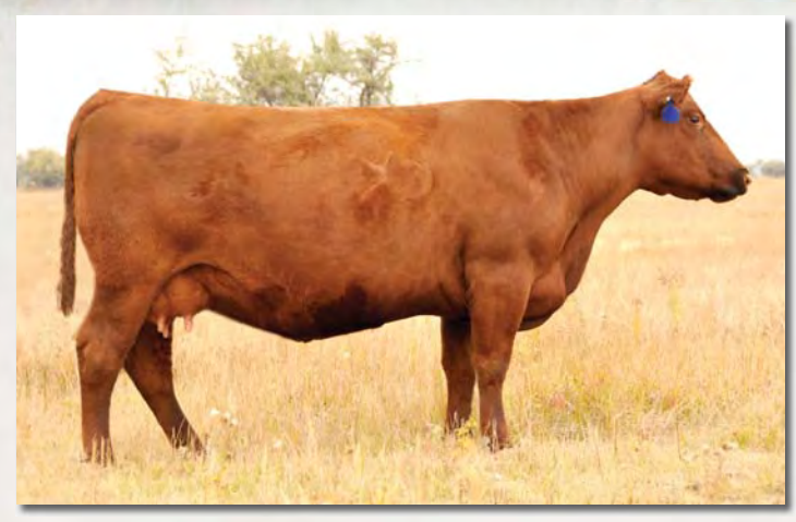
LOT 26 - DKK DAZZLE N30