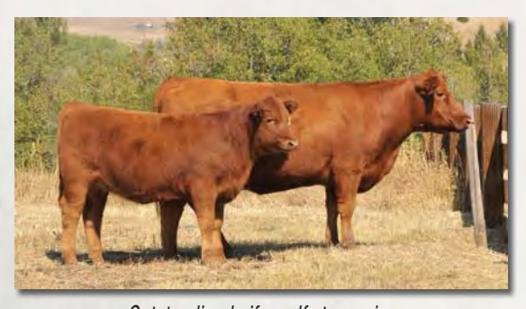
Outstanding heifer calf at weaning Catalog online at www.redcows.net • Video online at www.billpelton.com