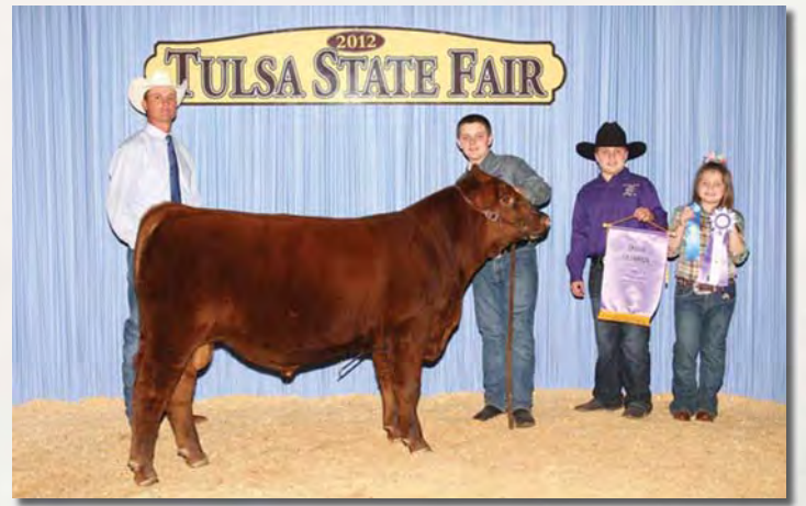
SON OF FEDDES RAINBOW X108 Wildcat Creek Ranch of Newton, Kan., purchased Feddes Rainbow X108 in the 2010 Big Sky Elite Female Sale. Her first calf was just named the 2012 Grand Champion Bull at the Tulsa State Fair.