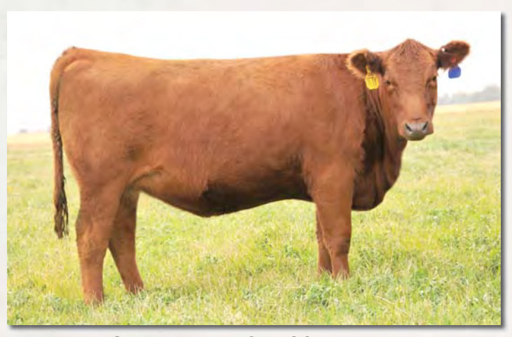
LOT 99 - FEDDES BLOCKANA Y171

Y146 is as good as her picture and equally good on paper. She combines our "Osce and Blockana" cow families. She is due to calve to our Makin Designs bull (Hobo Design X Right Time) who we are really excited about. This should be a very good mating, as they should complement each other very well. Females like these gives breeders a lot of options in matings, because there aren't big holes to worry about.