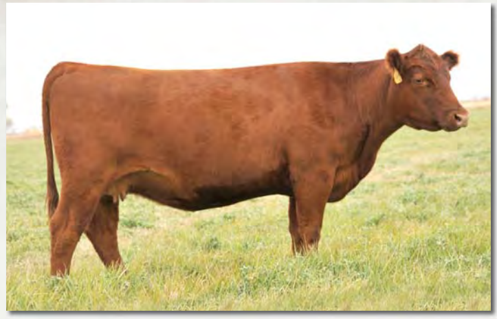
LOT 66 – FEDDES RAINBOW 9141