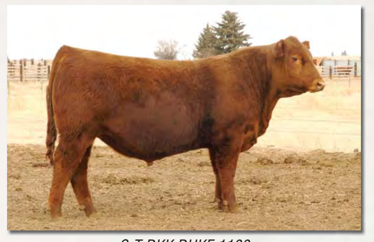
C-T DKK DUKE 1100 C-T DKK Duke 1100 was the high-selling bull in the 2012 Feddes and C-T Bull Sale, selling to Josh Rush, Rust Mountain View Ranch, Turtle Lake, N.D., for $27,000.