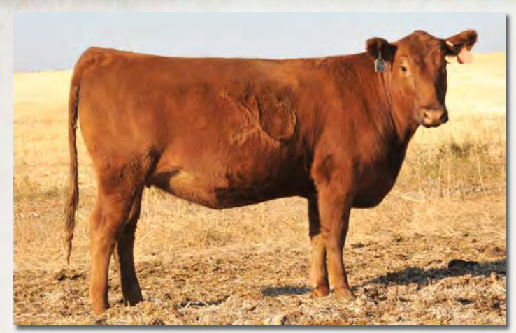
LOT 84 - DKK STARLETTE 1108