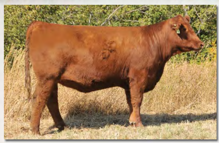
LOT 107 - GMRA LAKOTA 179Y