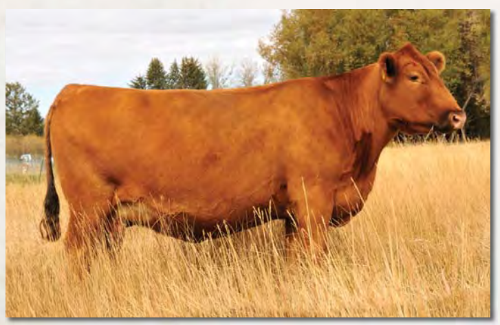
LOT 55 - C-T MISS LASS 411