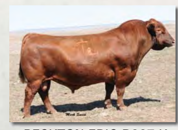
BECKTON EPIC R397 K