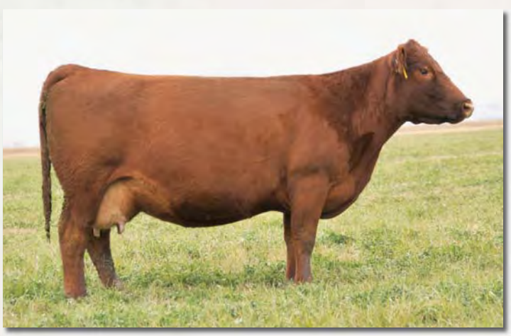
LOT 59 - FEDDES BLOCKANA 351

322 has been a solid producer and has some good years left. She has an MPPA of 100.1, and she has sound feet and legs with a very sound udder. We sold a daughter in the 2010 Big Sky Elite Sale to Wildcat Creek Ranch. Her first calf is their consignment to Bet On Red sale in Reno in Nov. 2012.