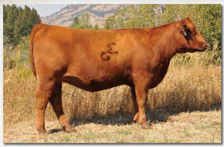
LOT 110 - GMRA INDIGO 190