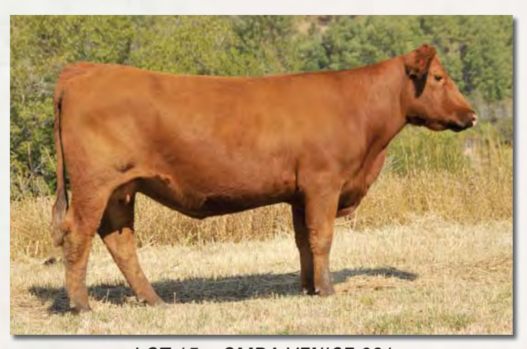
LOT 15 - GMRA VENICE 021

Estonia 964 comes from the great Estonia foundation cow family. You can read more about this family in the footnote of Lot 108. She has been off to a great start in her career here at GMRA. Her calves have performed well above average at weaning – 108 and 104 NR - backing up an impressive Milk EPD in the top 5% of the breed. She posts an impressive MPPA of 103.4.