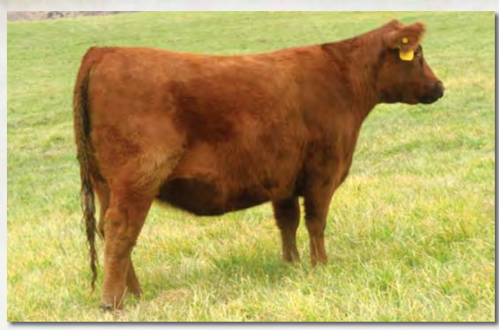
LOT 93 - C-T MISS PAN 1148