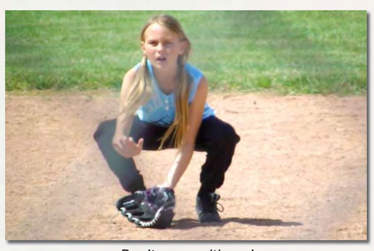
Don't mess with me!

X72 is a Mimi daughter that has a bright future. Her bull calf in 2012 has a BR of 92 and 101 WR.