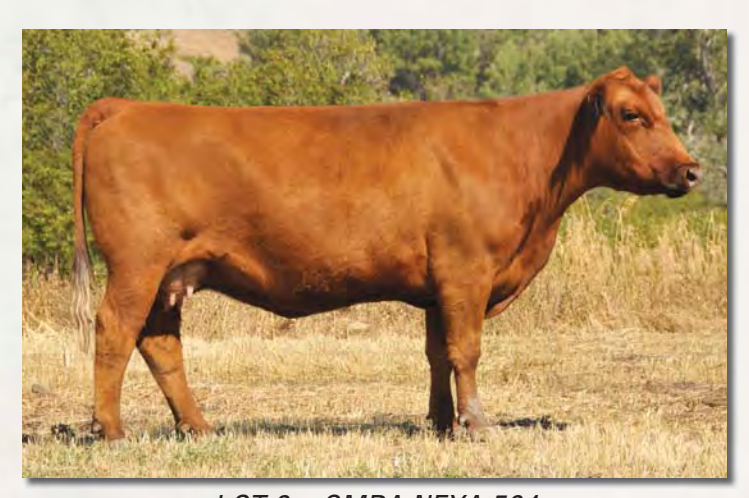
LOT 8 - GMRA NEXA 564

Grand Canyon has produced some of the most productive females in the Red Angus breed and Firefly 358 is no exception. She has an MPPA of 102.5 on 8 calves and has consistently produced top-end progeny. None of her calves have been culled – all have gone into production here at GMRA or been in a production sale. Her bull calves have always made the cut as 'picture bulls' for our bull sale catalog. Firefly 358 is just a true, solid-performance cow with no holes, and posts 5 of her 15 EPDs in the top 29% of the breed or higher. Grand Canyon is OSC, but it should be noted that Firefly 358 has been tested OSF.