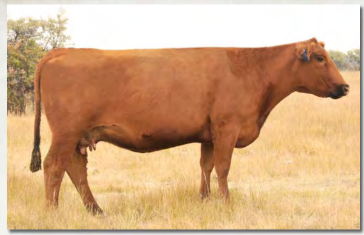
LOT 29 – DKK ROSE 8058