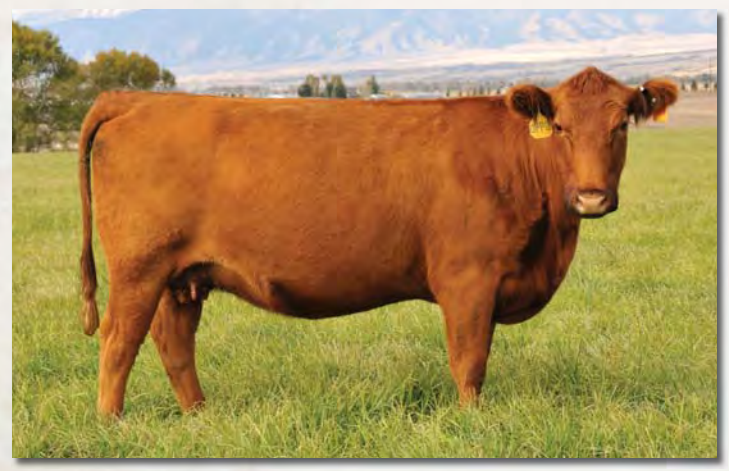
LOT 49 - C-T BLOCKANA 0940

Don't miss this young Make Mimi cow if you like production. She had a 119 WR, 115 YR and has five traits in the top 20% of the breed. Pasquale 923 will cross well with this Mischief cow. MPPA