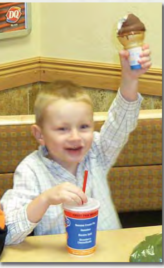
Dairy Queen ... nothin' better!