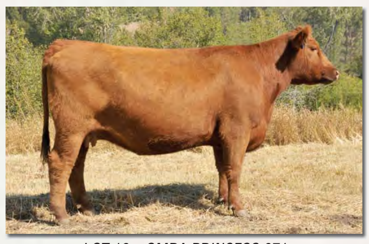
LOT 19 - GMRA PRINCESS 071

Angie Rose 032 is from the Angie Rose cow family that produced GMRA Angie Rose 944, the topselling bred heifer in our 2010 Big Sky Elite Sale. She went on to produce C-T/DKK Duke 1100, who sold for $27,000 at the Feddes/C-T Bull Sale last spring. Angie Rose 032 has an MPPA of 103.6, with her first calf posting a 109 NR after hitting the ground with a 68-lb. birth weight. She is bred to Justice and this mating puts the calf's projected EPDs in the top 10% for Total Maternal and the top 1% for CW, WW and YW. Just imagine the potential of this young female!