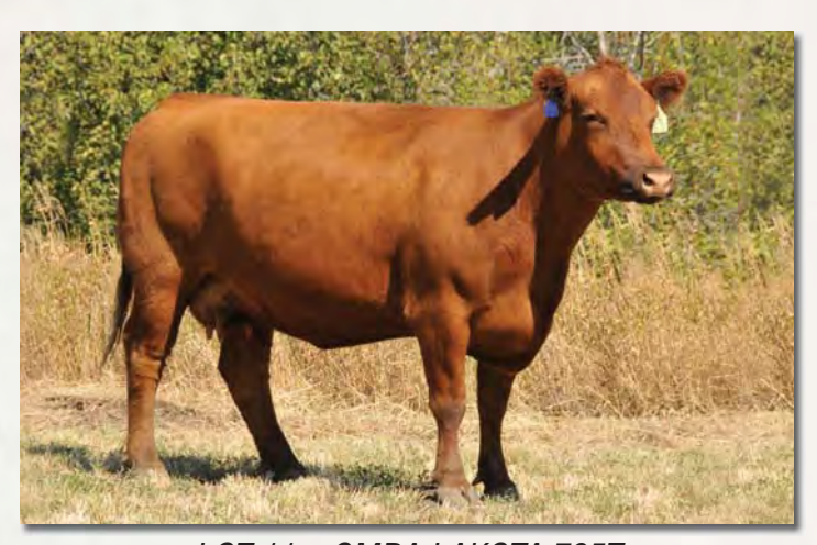
LOT 11 – GMRA LAKOTA 735T

Larkaba 716 comes from a strong line of maternal longevity in the GMRA herd. Most of the females in her pedigree have stayed with us well into their teens and some have gone on to be embryo donors. Larkaba 716 holds her flesh well and will keep easy.