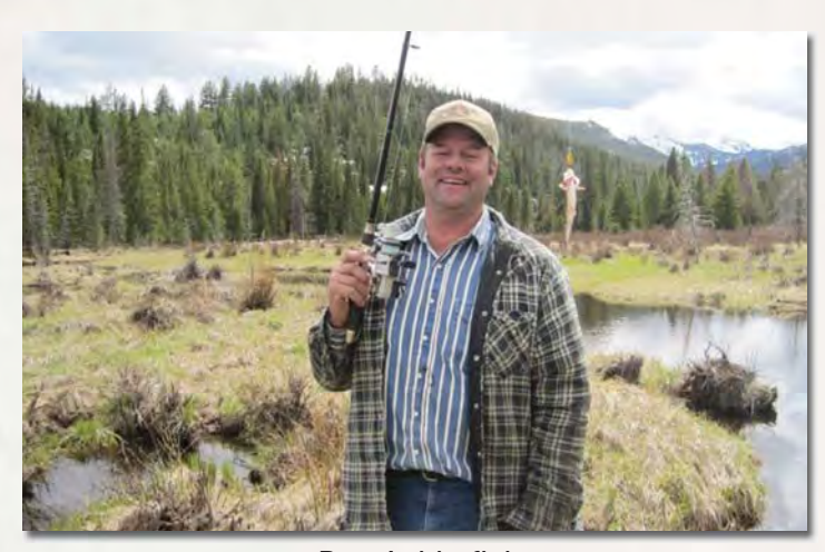
Dave's big fish

This low-birth, high-carcass, high-maternal, fancy heifer comes from a great cow family. With eight traits in the top 30%, she posts a milk EPD in the top 8% and stayability in the top 6%. Definitely a heifer to put a mark by in your catalog. Mated to Beckton Epic R397 K; expect great things out of