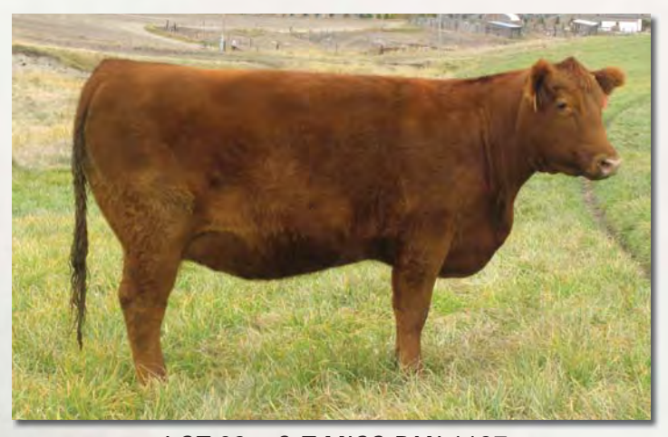
LOT 92 - C-T MISS PAN 1137

This Red Smoke daughter has as balanced a set of EPDs as she has phenotype.