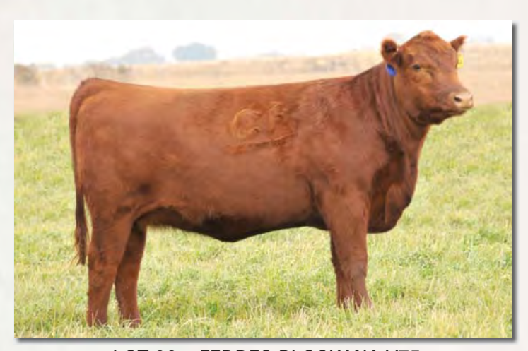
LOT 96 - FEDDES BLOCKANA Y75

Y14 is very hard to let go of. We are excited to see the Hobo Design females in production, but we have a number of them in the replacement group. She sports a "no holes" EPD profile, and is very easy on the eyes. Her dam is a beautiful Feddes Atlas 12S daughter. You will also find Norseman King, Grand Canyon, Mimi and Hobo 1961 in five generations.