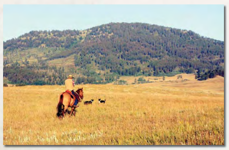
Jeremy heading to gather off of Green Mountain

A nice, deep, broody Lakota female. She's a complete package with a powerful set of numbers. Three-fourths of her EPDs are in the top 50% of the breed or higher, and 2/3 of those are in the top 30% of the breed or higher.