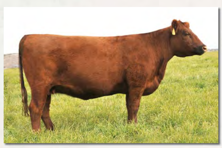
LOT 48 - C-T MISCHIEF 1091

Another nice, young Mattie cow, with a double-bred Grand Canyon pedigree. TM is in the top 13%