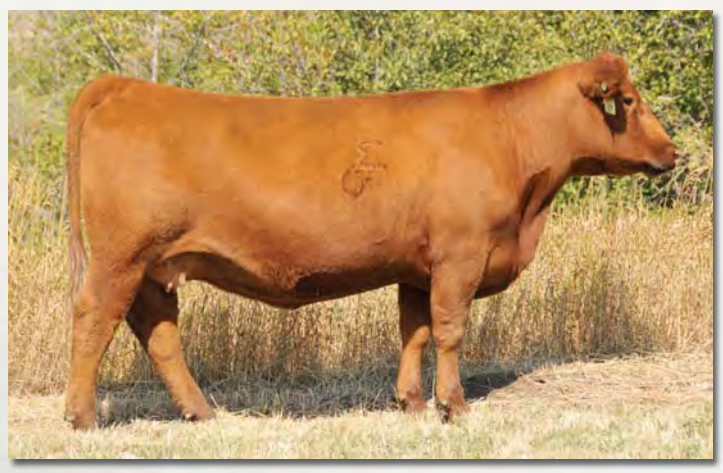
LOT 20 - GMRA INDIGO 075

Princess 071 is deep ribbed with lots of capacity. She comes from a strongly maternal line known for their longevity. Her dam is still in the herd with a 105.8 MPPA on 9 calves, her granddam had 11 calves for us with a 104.5 MPPA, and her great granddam was in production late into her teens. 071 has one of the most complete sets of EPDs in the offering, with 12 of the 15 in the top 31% of the breed. Just imagine the potential of her Justice calf.