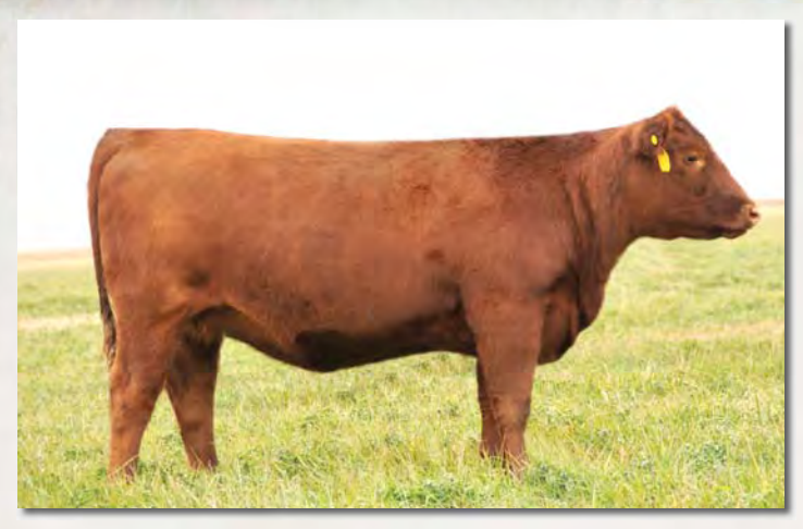
LOT 95 - FEDDES MISCHIEF Y14