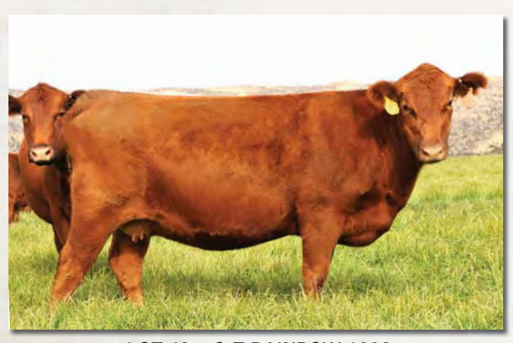
LOT 43 - C-T RAINBOW 1098

If you like Brown Vacation daughters don't miss this one. She is a cow we purchased from Sun River Red Angus and has proved herself to be a good one. She has a solid set of EPDs and a 101.3