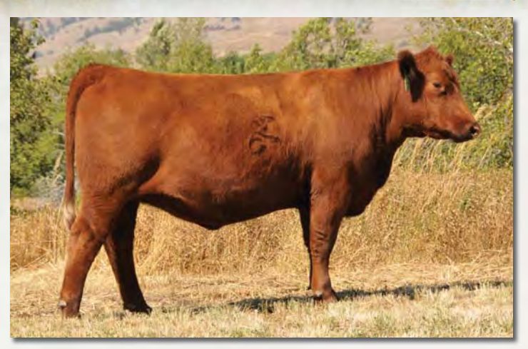
LOT 104 - GMRA LARKABA 119