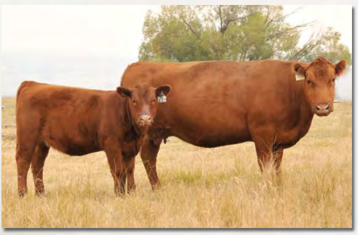
LOT 28 - DKK DAZZLE 701

Here is a Cheyenne daughter that goes back to the great Rambo 502. She has five traits in the top 30% of the breed. This is a high-capacity female and transmits this trait to her progeny. Her calving interval is 366 days. DKK Authority should cross well with this cow.