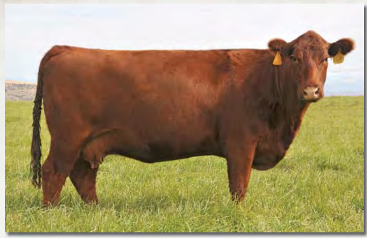
LOT 41 - C-T MISS PAN 0835