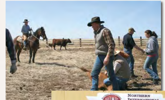
C-T Red Angus branding

C-T GRAND STATEMENT 1025 FEDDES BIG SKY CONQUEST 4405 OLE'S OSCAR RED SMOKE LUCHT PASQUALE 923