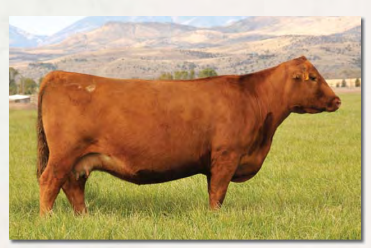
LOT 42 - SUNR FLO MARIE 770

A very productive young Miss Pan cow, with a great set of numbers. Her mating with Red Smoke should be an exciting one. MPPA 102.