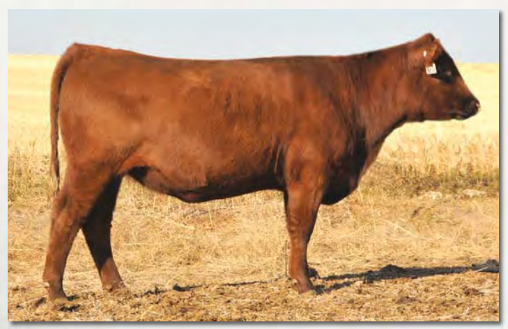
LOT 86 - DKK RAZZLE 1138

Roxy 1122 posted a WR of 107 and a YR of 104 which is pretty awesome; but also look at the fact that mama is 15 years old and still going strong. Dam's calving interval is 368 days and she is bred up and looking forward to a 2013 baby. The dam has calved unassisted every year and brought home a calf every fall.