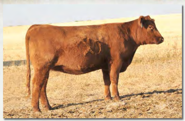
LOT 80 - DKK IMPRESS 189