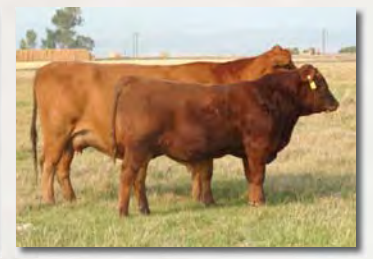
FEDDES LAKINA 87S