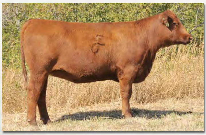
LOT 109 - GMRA MESA MAID 188

Estonia 183 is a member of the elite Estonia cow family that has produced such notables as GMRA EBV 266 and CCF Estonia 626-920. GMRA EBV 266 was the high-selling bull at Midland Bull Test in '93. His dam, BJR Estonia 9S-1210, eventually moved in to the program at Chicken Creek Farms of Tennessee. Her granddaughter, CCF Estonia 626-920 was the 2004 National Red Angus show Produce of Dam champion, and she sold in the 2007 Stocking Stuffer sale in Marshfield, NC, to Polzin Cattle in MN, for $10,000. Outstanding growth and performance potential here, with a WW EPD in the top 7% of the breed, a YW in the top 4%, and a CW in the top 2%.