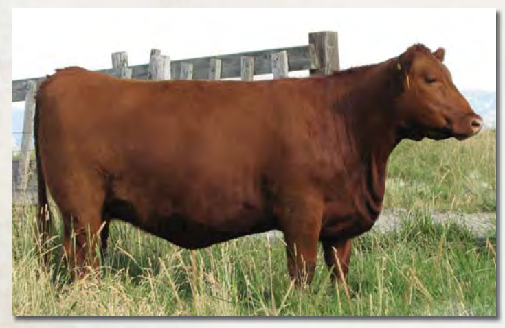
C-T Red Angus bred heifer