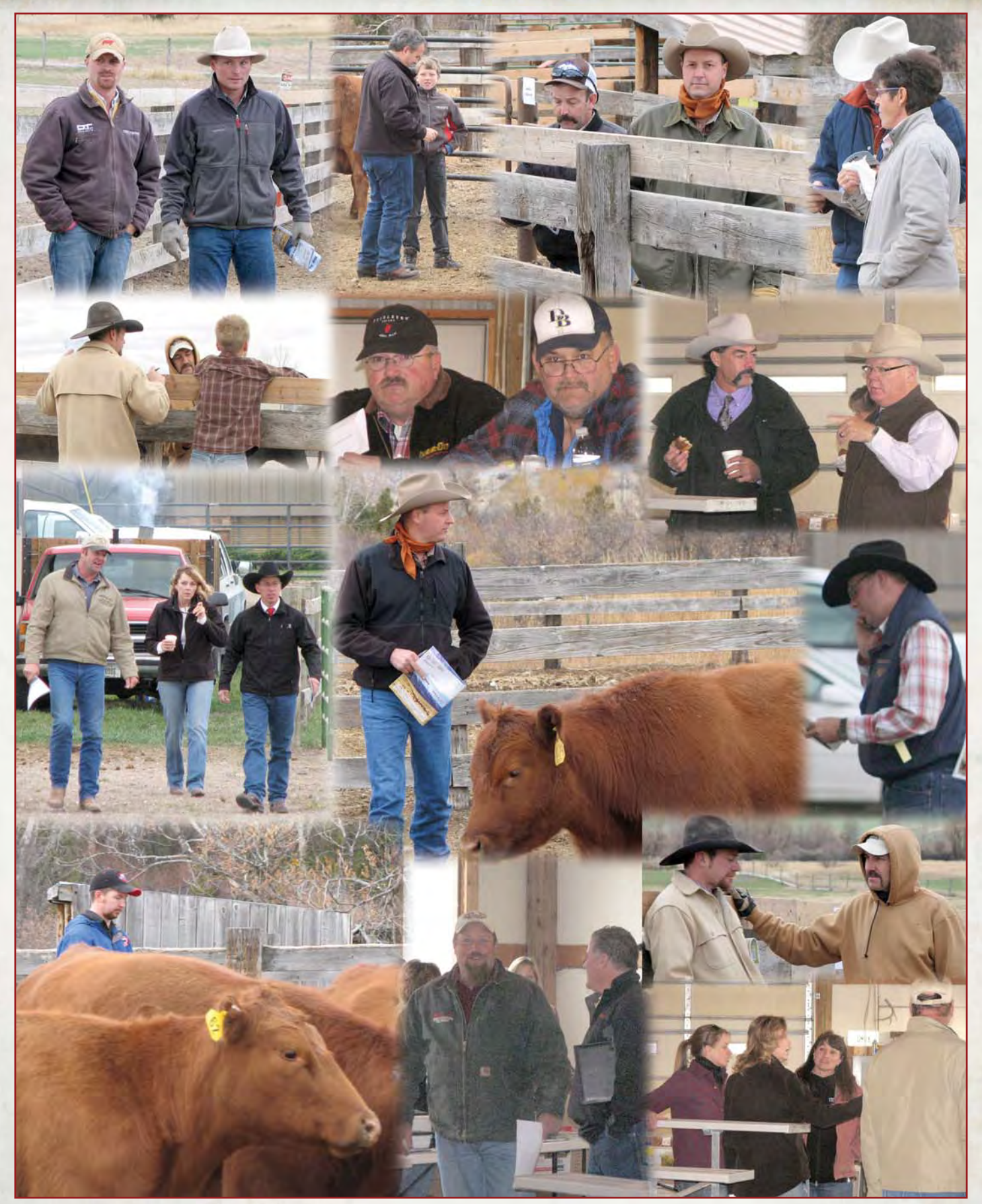
Catalog online at www.redcows.net • Video online at www.billpelton.com