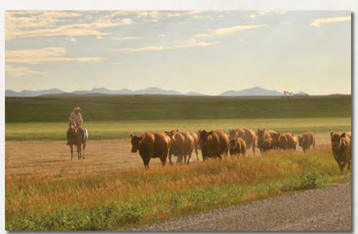
Bringing 'em home