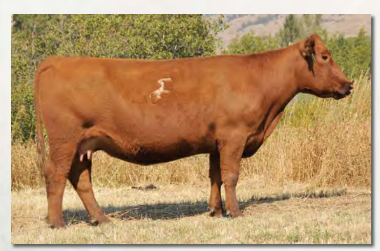
LOT 12 - GMRA NEXA 862

Lakota 735 is a maternal sister to the dam of Al sires, GMRA Trilogy 0226, and GMRA Make It Easy 8226, who both sold to Accelerated Genetics. She comes from a long line of maternal power. Her dam has an MPPA on 100.5 on 8, and her granddam has an impressive MPPA of 108.5. Lakota 735 has good depth and shows a great rear quarter.