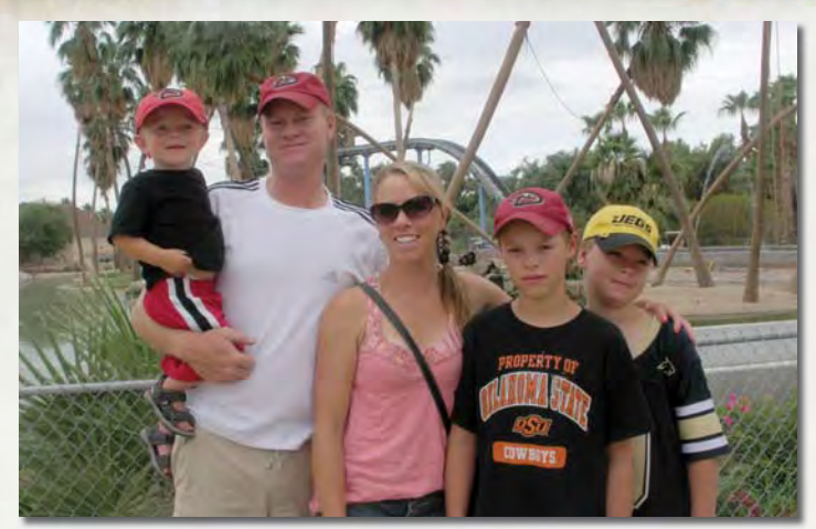
DeBoer family in Arizona