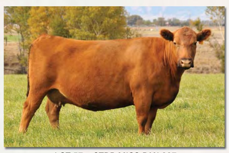
LOT 57 - CTDB MISS PAN 227

This Red Lightning daughter is worth a look if you like power and performance. She still has a great udder and feet, and her calf will not disappoint you in the fall. We have retained daughters in our herd and she weaned an 800-lb. bull calf this fall. She has four EPDs in the top 10% of the breed, with a 61 TM and a 108 MPPA.