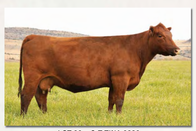
LOT 39 - C-T TINA 0820

Here is a Grand Canyon-bred cow that will pay her way. She comes with a beautiful phenotype and udder, and a great set of EPDs and a 102.5 MPPA. She weaned off a Packer bull calf this fall with a 106 WR.