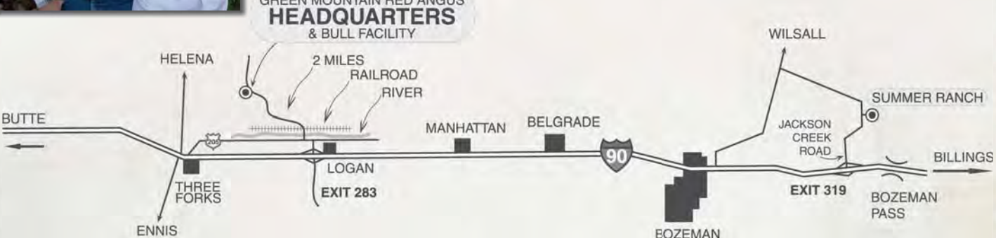
Get off 1-90 at the Logan Exit, #283. Go north and take a left on the frontage road. Proceed west toward Three Forks, about 1/2 mile. Take a right onto Logan Trident Road, heading north. The road immediately crosses the Gallatin River and the railroad tracks, as shown on the map. Green Mountain Red Angus is 2 miles from the railroad tracks. Watch for the large Green Mountain Red Angus sign.