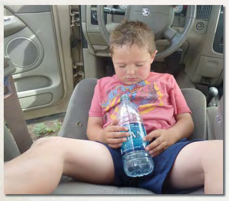
Exhausted after moving cows

Y171 is another Hoss X 041 ET female. Her dam has a MPPA of 106.5. She will be a little bit larger frame than most of our cattle, but if she produces like her dam she will have a happy owner.