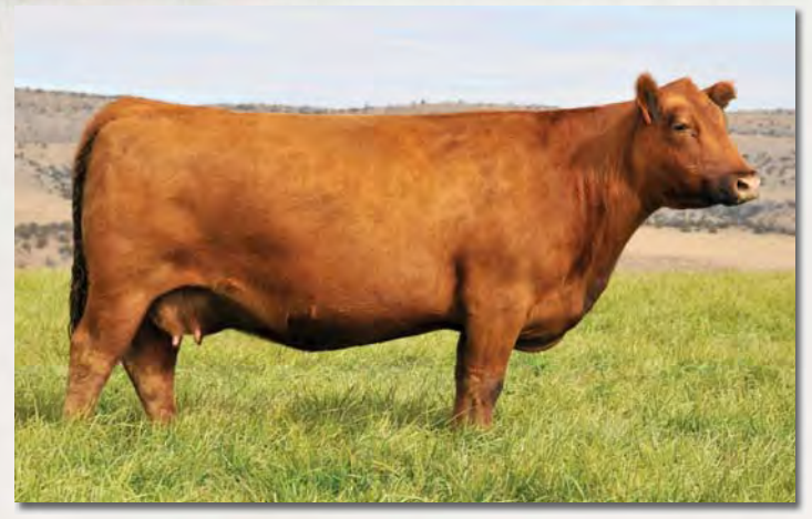
LOT 38 - C-T MISS PAN 0554