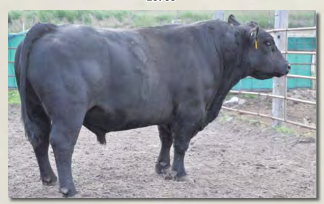
Double J's The Brick 281