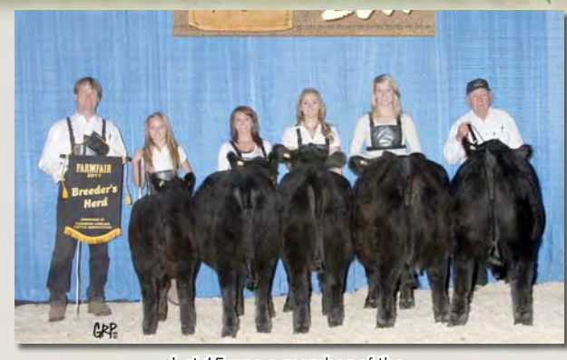
Lot 15 was a member of the Champion Breeders Herd at the 2011 Farm Fair

"Alta Rachel BIL 510Y has loads of eye appeal and style and an outcross pedigree. She was part of the Grand Champion Lowline Breeders Herd at the 2011 Farm Fair. This fancy heifer stood at the top end of her class at Armstrong, BC and at the Canadian National in Edmonton. She is calfhood vaccinated for