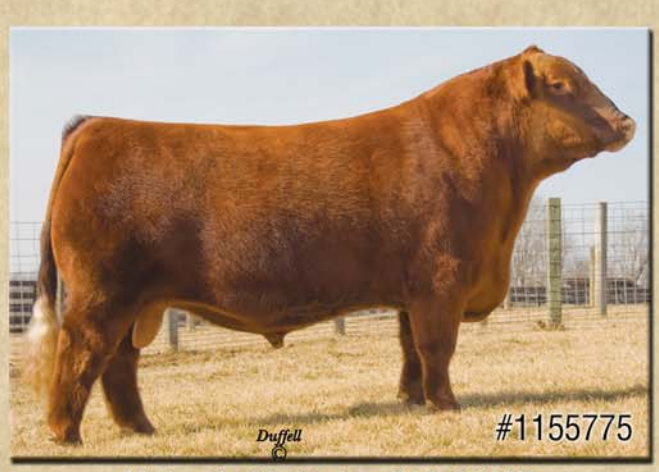
Majestic Lightning 717 SGMR