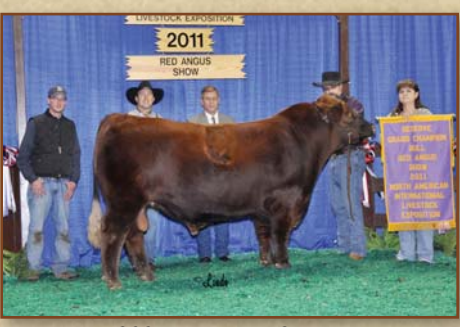
HSCC Lightning McQueen 3X