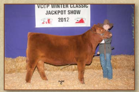
Majestic Girlie Girl Y27