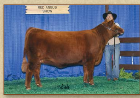
Majestic Blockana X43