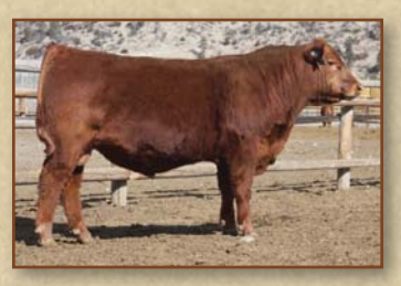
Hip Tag #839 - Midland Bull Test