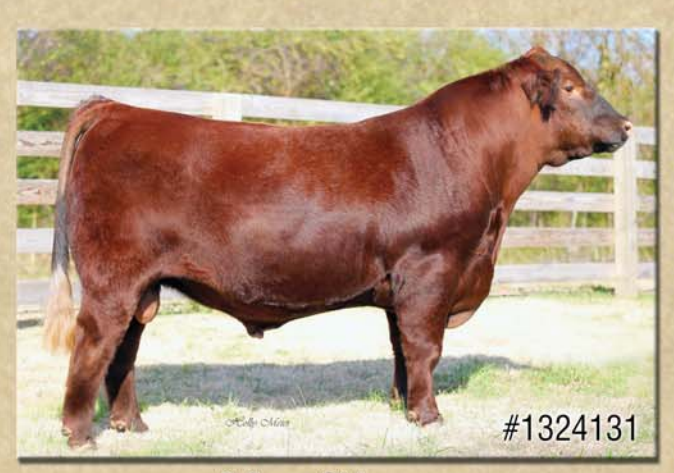
3 Aces Sideways