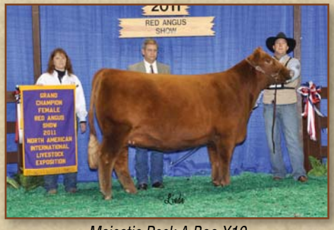
Majestic Peek A Boo X19