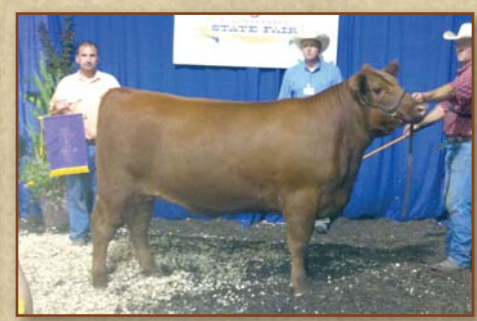
Majestic Serabelle Y32