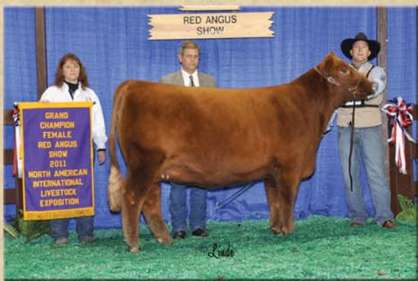
Majestic Peek A Boo X19

Live Online Bidding December 26 - 27, 2012 www.anguslive.com