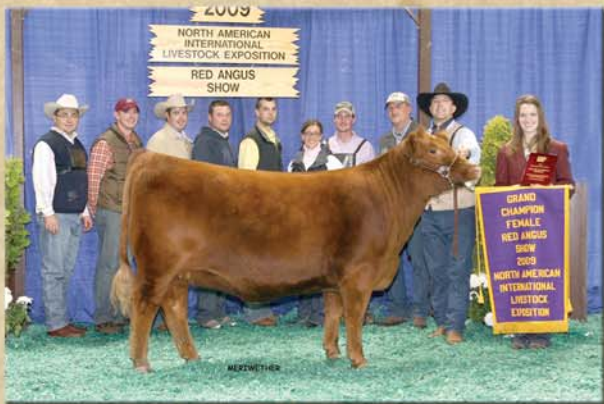
Majestic Blockanna 728