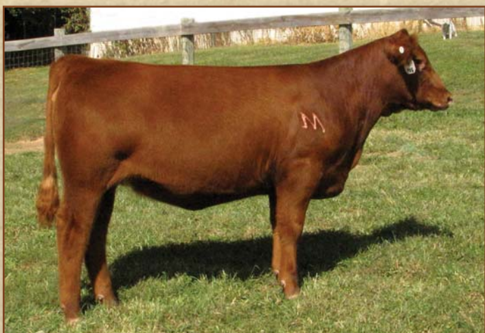
Majestic Firefly 109 Majestic Lightning 717 SGMR x LCOC Firefly UA001