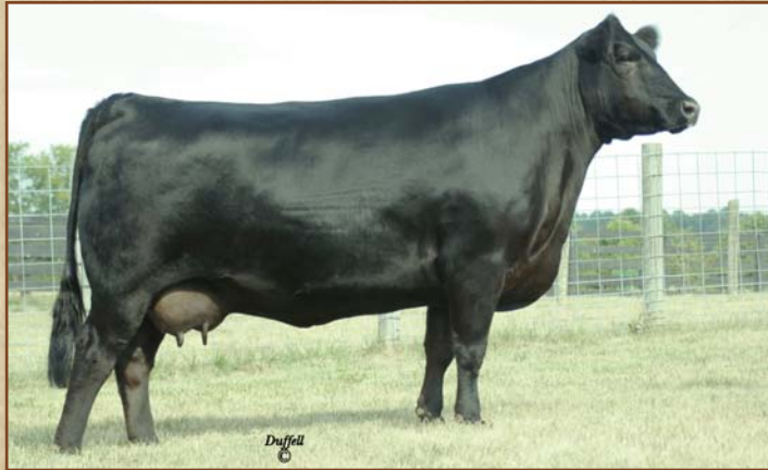
4005 - Full sister to C Q S Georgina 0597