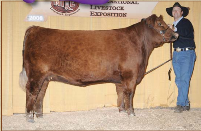
Majestic Serabelle W118