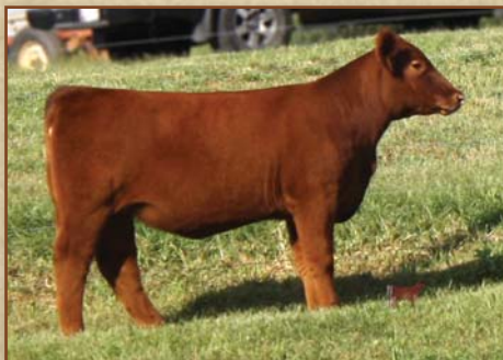
Majestic Serabelle Z205 VDAR Rambo 323 x Majestic Serabelle W118