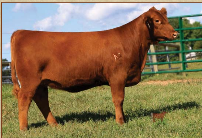
Majestic Firefly 110 Majestic Lightning 717 SGMR x LCOC Firefly UA001