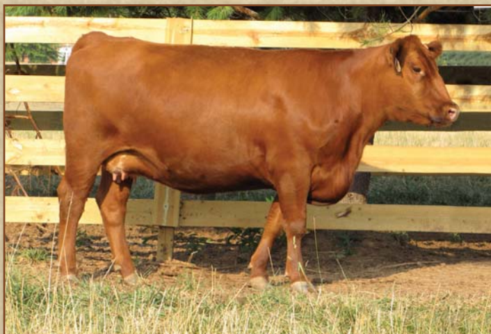
LSF Rebella R5008 U8245