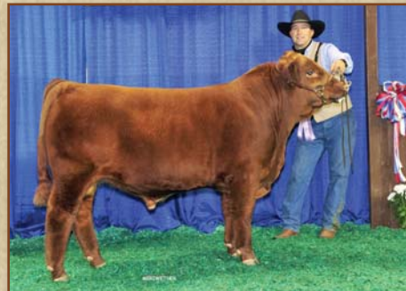
Majestic Wolfpack X39 Majestic Lightnng 717 x Majestic Serabelle W118

Terms: Buyer can flush to the bull of his choice and must provide no less than four units of semen. There will be a guarantee of six embryos and two pregnancies, if implanted within one year of the recovery date. After one year there is no guarantee of conception. Any amount above six will be prorated if the buyer elects to do so. The embryos above six will be split on a 50/50 basis with the seller getting the seventh and buyer getting option on eighth and so on. Flushing will take place at Trans Ova and flush expenses and freezing expenses will be paid by the buyer. Seller will pay freezing costs of any retained embryos and donor board fees during the flush.