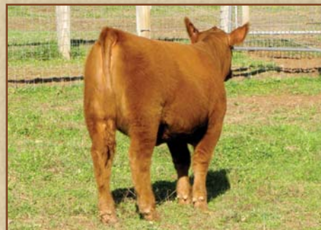
Majestic Serabelle Y23 Majestic Lightnng 717 x Majestic Serabelle W118