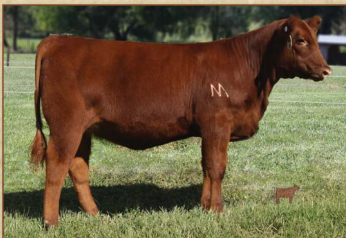
Majestic Rebella Z115 HSCC Lightning McQueen 3X x LSF Rebella R5008 U845