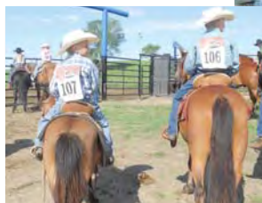
Lot 36, Rocket (left) and Lot 85, Sugar (right)