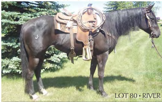
LOT 80 • RIVER