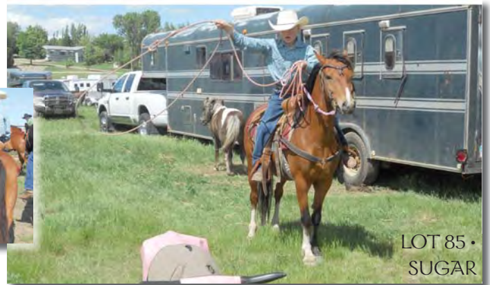
LOT 85 • SUGAR