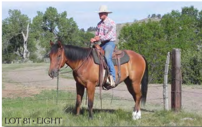
LOT 81 • EIGHT