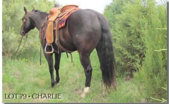
LOT 79 • CHARLIE