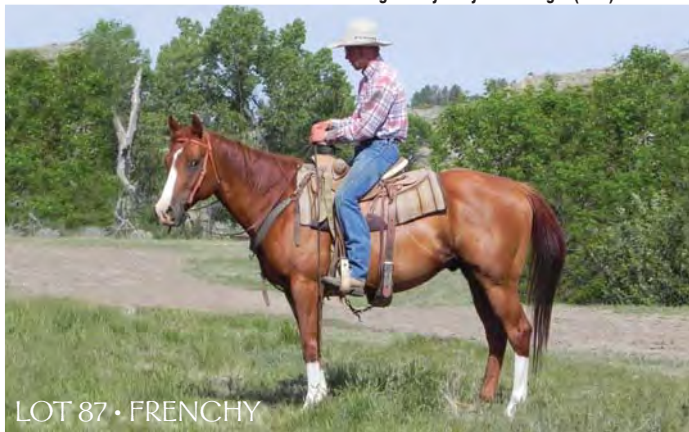
LOT 87 • FRENCHY