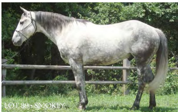
LOT 89 • SMOKEY

Consigned by Rita Hardy • (406) 230-2720