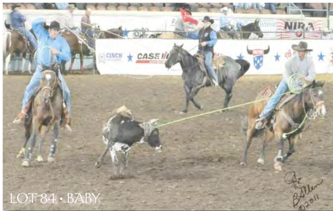
LOT 84 • BABY