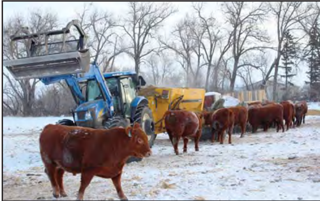
Jodi feeding bulls this winter