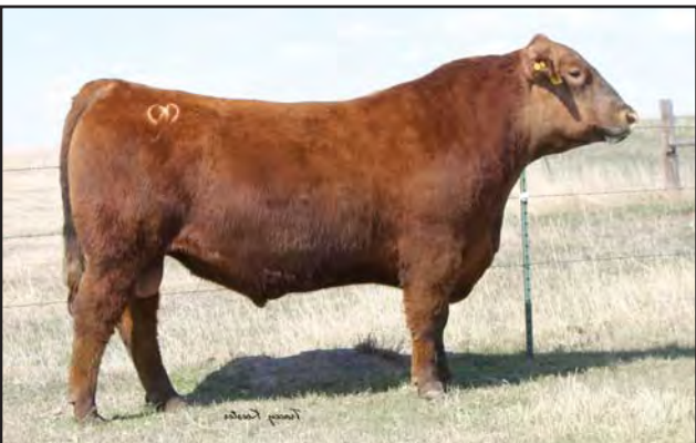
LSF High Yield 8088U

BKT JULIAN 7526 G BKT MARTA 9A13 JL LELAND MARIAS 271K MESSMER PANDORA 9976 NEO-SHO MILLENIUM 065G VGW KURUBA-RAM 9308 BUF CRK CHF 824-1658 NODAKLADY POUNDMAKER