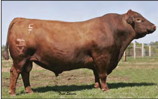
HXC Conquest 4405P, grandsire of Lots 22 and 23