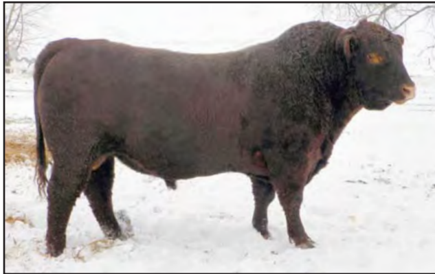
CBR Barn Boy 4340-7330