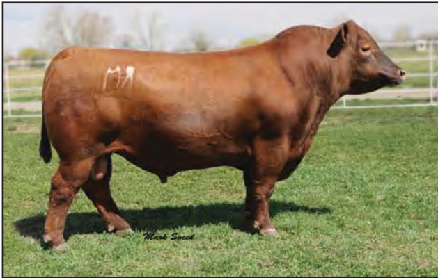
Messmer Packer S008

BECKTON LANCER 9380 BECKTON COCA 9119 TJ LCC HEAVEN OR BUST1000B LJC HEAVENLY QUEEN BEE HOLDEN HI HO 574 BIEBER MIMI 4151 LMAN KING JAMES 8665 SALL BAMBI 939