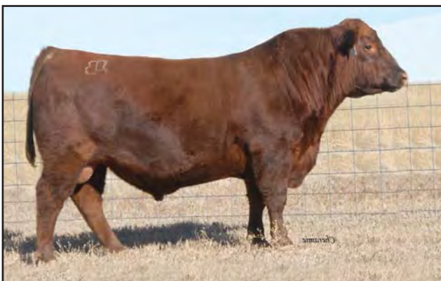
Brown Endorsement W7671

BECKTON JULIAN GG B571 MESSMER PANDORA M186 VGW TOP PICK 130 MESSMER MILLIE 9416 BECKTON JULIAN GG B571 LCHMN FLOWER C1161 LEACHMAN COWBOSS 1129G LSF CLASSIC H1375