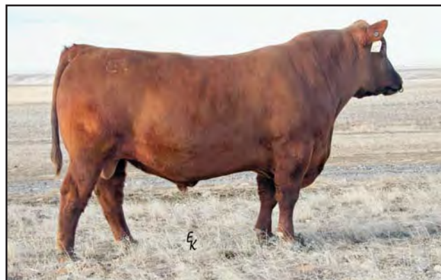
Brown Commitment S7206

CBR SHOTGUN CBR DYNETTE 714-822 SODAK OSCAR 3387 DALNICE 924-979