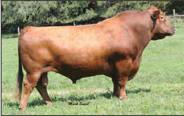
LJC Mission Statement P27