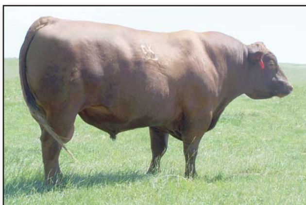
HRR Trojan 709

Trojan was our pick and the high seller at the 2008 Heart River Ranch Sale. His sire is a Canadian-bred bull that is well known for his maternal traits and for having many sale toppers throughout Canada. His individual ultrasound ratios were 128 %IMF and 107 for REA.