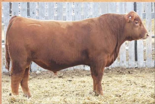
NS BRONSON X079

2 p.m. CST • Williston, ND Sitting Bull Auction