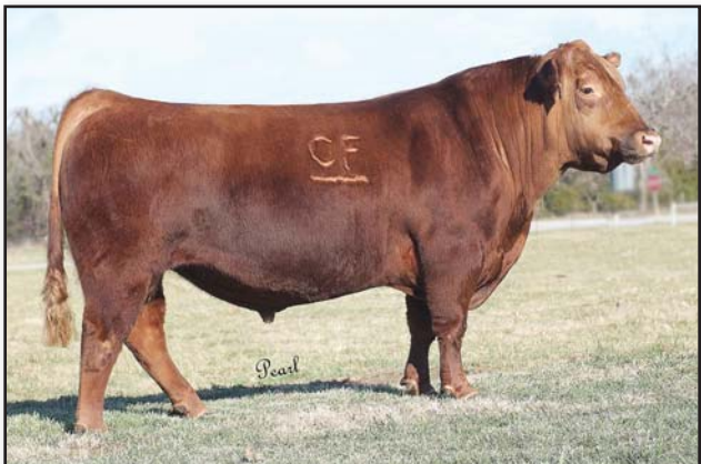
Feddes Big Sky R9