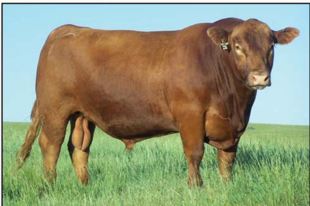
BMRA Mr Statement 998