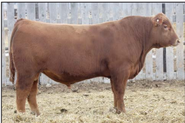
NS Bronson X079