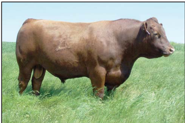
DK Trojan V4001