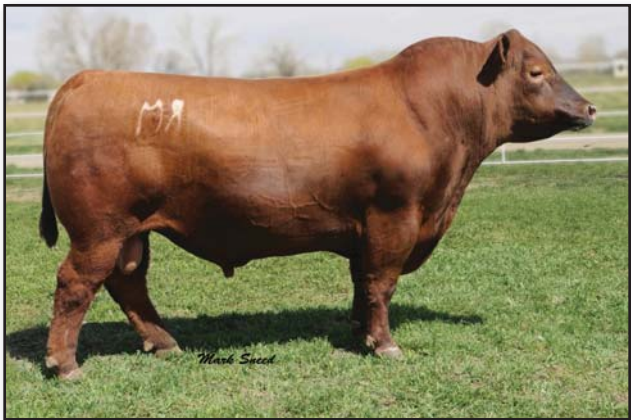
Messmer Packer S008