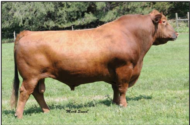
LJC Mission Statement P27