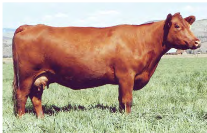
CTDB Verdi 904, dam of Lot 47