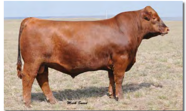
CT Grand Statement, sire of Lot 1