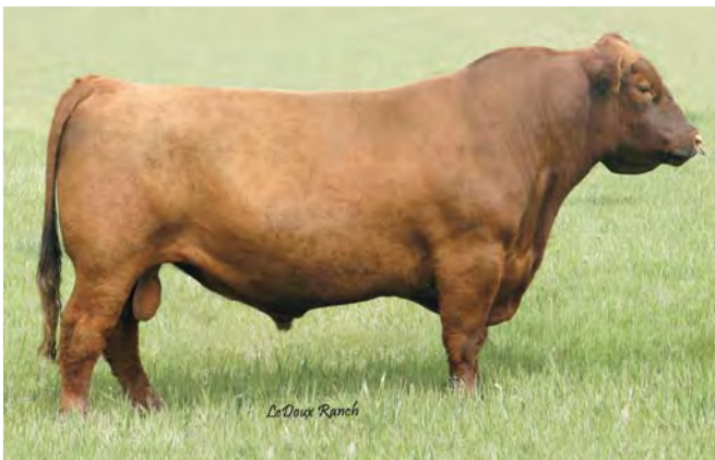
HXC Jackhammer 8800U