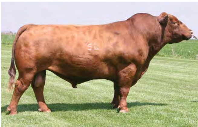
5L Norseman King 2291, sire of Feddes Royal Norse 9120

This is a big growth ABS sire. He sires calves that have great performance and carcass.