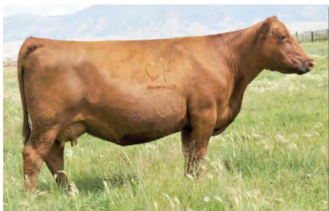
Dam Lot 70

A bigger framed bull with lots of growth. His dam is one of our best phenotypically. This bull should sire really good females. He had an IMF ratio of 127.