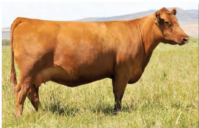
Feddes Blockana 9130, dam of Lot 107