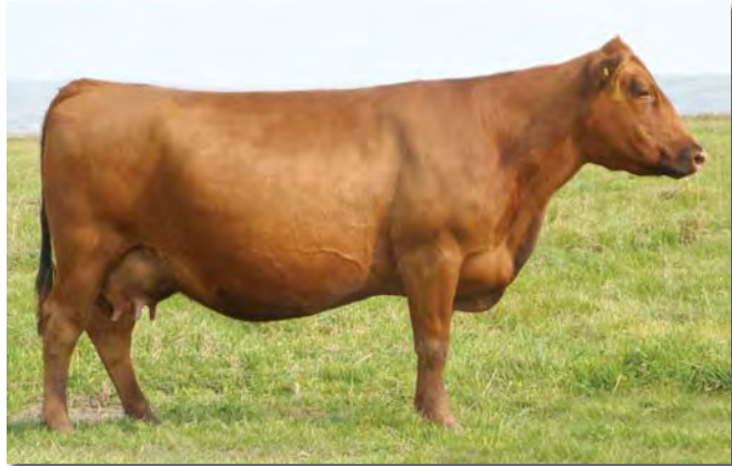
Feddes Blockana R98, dam of Lot 85