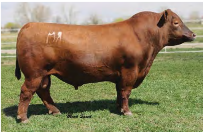
Messmer Packer S008

Feddes Oscar X28 was sold through our sale in 2011 to Camp 1A in St. Francis, KS. We sampled him a bit on some heifers and will certainly be using him more. His sons have more depth and muscle shape than the Oscar cattle we have seen. We don't have very many calves, but everyone is a good one. They are consistent. His dam is a Romeo 9136 daughter that is working her way toward the donor pen. Her mother is the dam of the Lot 4 bull in this sale - Feddes Granite Z132, who we plan to sample also.