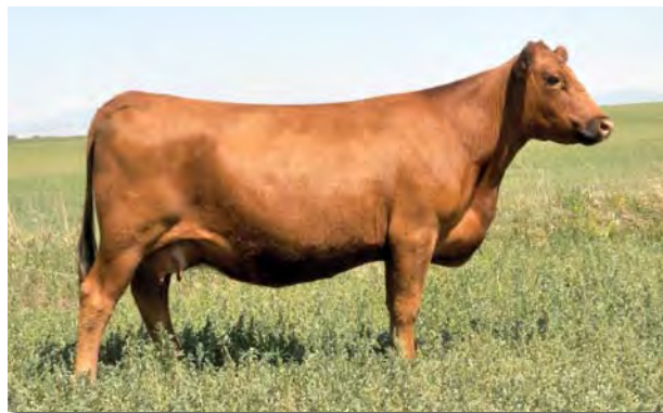
C-T Miss Pan 0760, dam of Grand Statement