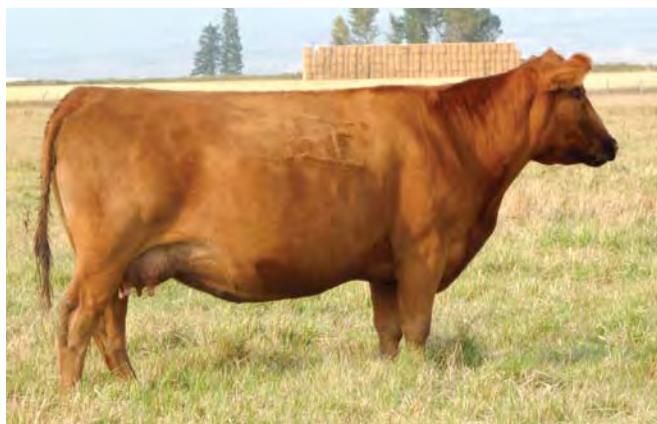
Feddes Lakina 87S, dam of Lot 18

His picture is worth a thousand words. He has big-time growth with below breed average BW. His ME is top 19%, HPG 3%, ST 10%, MA 20%, CW 12%, REA 6%, WR 109, YR 108, REA ratio 110. His dam is a poster cow for udder quality with sound feet, legs and body structure earning her donor status at Feddes Red Angus. She comes from the Lakina tribe that has done a great job for us. We used a full brother to Cascade Z157 last year.