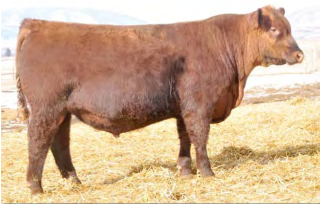
Feddes Oscar X28

Feddes Big Sky R9 sold to Genex and a group of breeders in our 2006 sale. He is continuing to make a mark on the breed mostly through his daughters. He shows up a Maternal Grand Sire on many top end bulls and sire of many highly sought after females. Several astute breeders have commented that his feet and leg structure is one of the best in the Red Angus Breed. Genex is selling more semen each year, which is amazing on an 8-year-old bull.