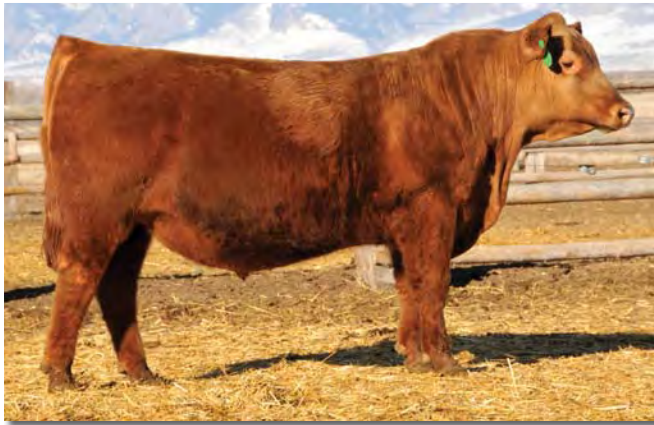
Lot 11, son of LSF Night Calver 9921W

5L Red Smoke 1246: Red Smoke was our pick of the 2008 Blazin Red sons at 5L's Bull sale. He is a total outcross tour herd and has done a real nice job on his first set of calves. He throws moderate calves with lots of muscle.