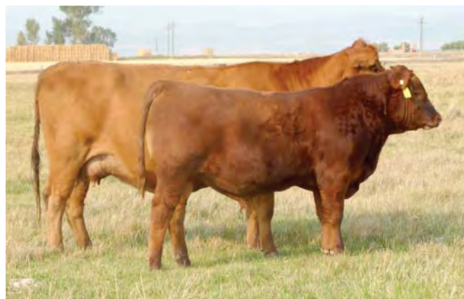
Feddes Lakina 87S with Lot 18 at side