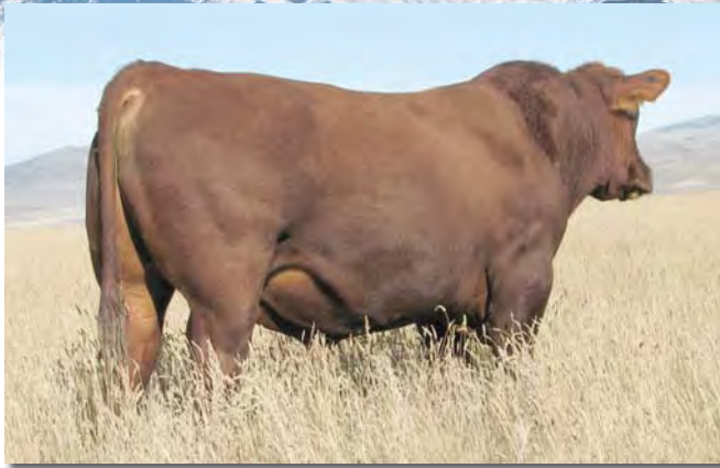
5L Red Smoke 1246-42V