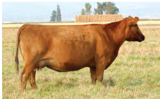
Paternal sister to dam of Lot 4