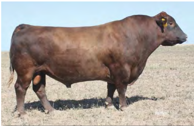
Red Crowfoot Ole's Oscar, sire of C-T Big Oscar 1020