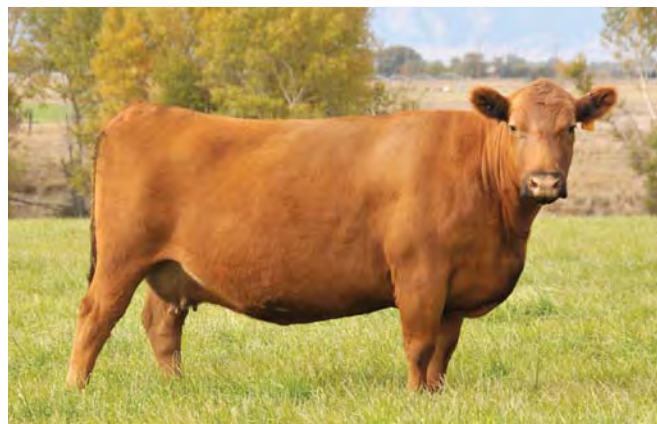
CTDB Miss Pan 227, dam of Lot 113