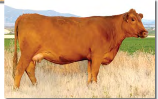
C-T Blokana 0543, dam of Lot 5