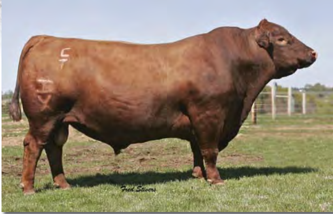
HXC Conquest 4405P