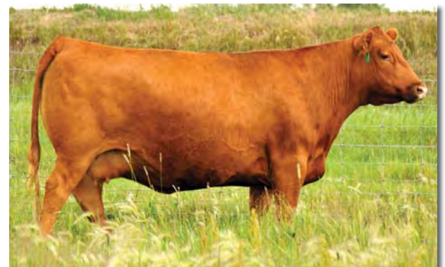
Feddes Lakina 310, granddam of Lot 2 and dam of Big Sky