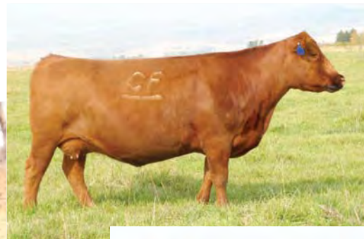
Feddes Lass 7150, dam of Lot 6

This bull is as balanced as you will find. He balances a low BW (-3.3) 13%, YW top 13%, and for extra bonus is ME top 19%, HPG 1%, ST 7%, MA 28%, YG 14%, CW 23%, and REA 2%. His dam is a gorgeous Big Sky daughter with a 103.6 MPPA. She has earned her donor status here at Feddes Red Angus. Custer Z138 sports a BR 90, WR 105, YR 107, IMF ratio 101, REA ratio 117. A full brother sold to Leland Red Angus in 2012.