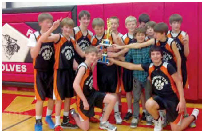
Manhattan Tigers Undefeated!

A Miss Pan daughter with a pretty phenotype and lots of volume. These Red Smoke daughters are making nice cows.