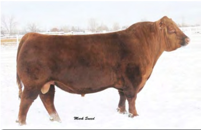
Feddes Big Sky R9

C-T's high selling bull in 2011 to ABS, Gill Red Angus, Lucht Red Angus. He is siring a real complete set of calves with moderate birth, big growth, and lots of volume, and great dispositions.