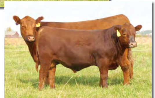
Feddes Lass 7150 with Lot 6 at side