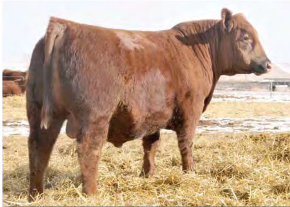
Feddes Montana X44

Feddes Montana X44 sold to North Santiam Red Angus in our 2011 sale, and later was sold to VF Red Angus with the North Santiam cows. He has done a very good job there and here at our ranch. He is moderate and thick, and that is how he stamps them. We think his females should make moderate, easy fleshing cows with great maternal traits (not just EPDs).