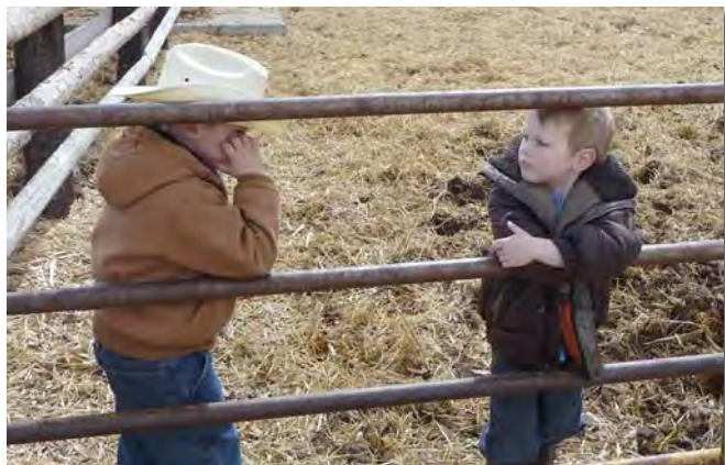
So ... how many bulls do you need this year?

Comes from one of our top cow families. 4225 was working here natural and in our elite ET program until she was 15 years old. Royal Norse daughters show great promise, being moderate framed, easy flushing, with that SOFT look. Z103 is not extreme in any trait, but solid in all traits. REA ratio - 103. DONT MISS HIM.