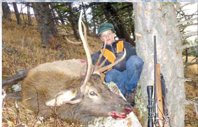
Traig's first elk