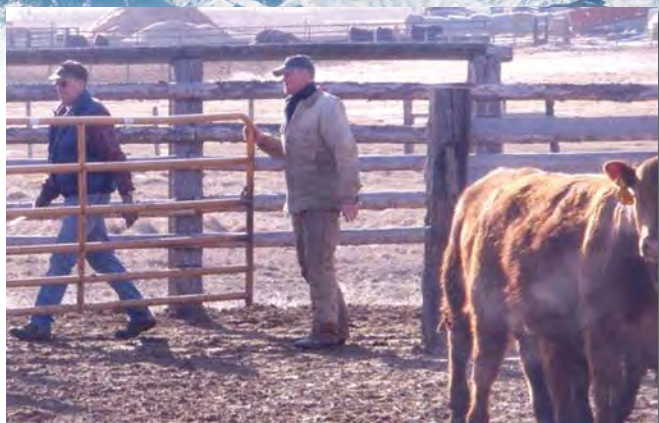
Working hard – OR hardly working?