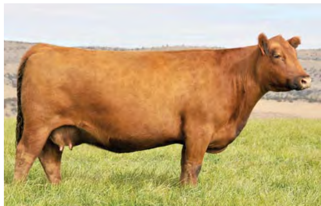
Dam Lot 71