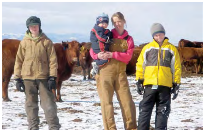
C-T Feeding Crew

This is a powerful growth bull, top 9% WW & YW, MA 9% and REA 12%, HPG 2%, TM 3%, WR 107, YR 104, IMF ratio 145, REA ratio 101. His dam is a beautiful Big Sky daughter with near perfect udder, feet, and big structure. MPPA 102