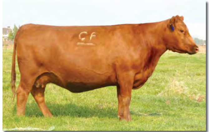
Feddes Blockana 7112, dam of Lot 19