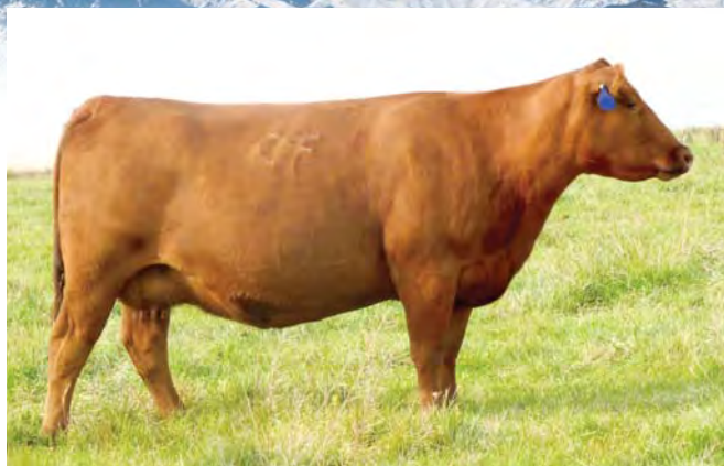
Feddes Blockana 882, dam of Lot 110