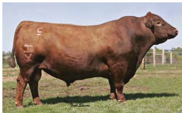
HXC Conquest 4405P, sire of Lot 3