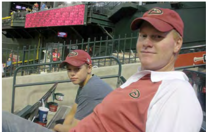
Goldschmidt and Putz

This heifer has a nice shape to her, with calving ease, maternal and carcass. This heifer could be mated a lot of different ways with her strong calving ease and maternal traits.