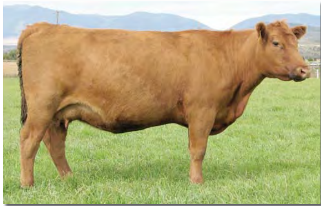
C-T Copper Queen 0833, dam of Lot 53

CED in the top 10% of the breed and BW in the 25%. He excels in marbling ranking in the top 15% of the breed in MA and ratioing 118 on his IMF scan. WR – 104 and YR – 103.