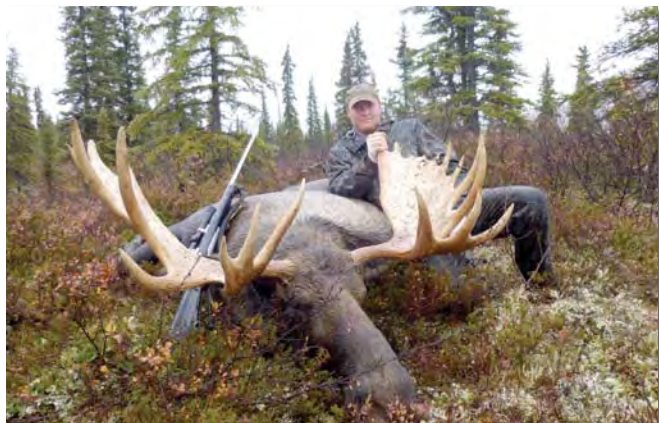
Craig's Alaskan Moose

A three-quarter brother to Lot 39 who is very similar in type. Moderate BW, big growth and carcass numbers and low ME.