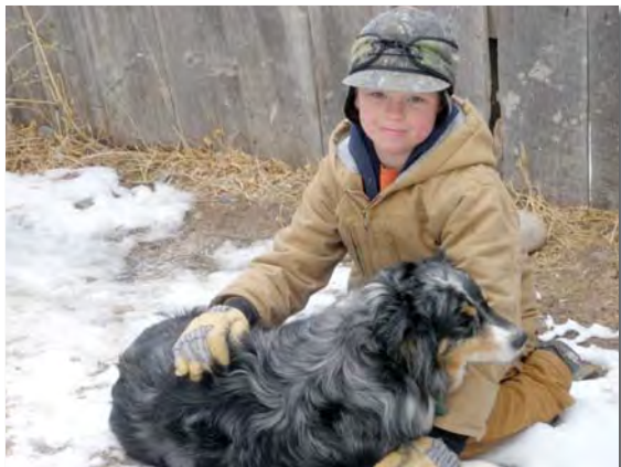
Cayl and Teal

This bull has lots of balance with extra milk and carcass traits.