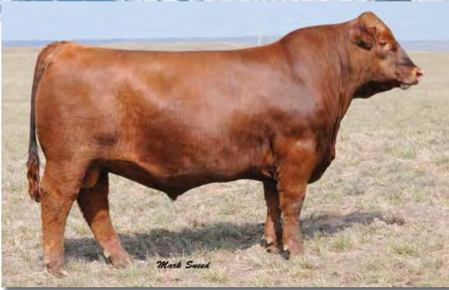
C-T Grand Statement 1025