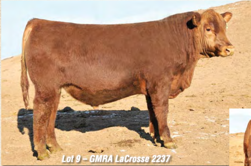
Lot 9 - GMRA LaCrosse 2237

Lacrosse is the REA powerhouse in the offering. He turned in the highest actual and adjusted REA scan, posting a 122 ratio. He also turned in a 104 IMF scan. He is incredibly complete, with 12 of his 15 EPDs in the top 37% of the breed or higher. Standouts are a REA in the top 2%, a HPG in the top 5%, a YG in the top 6%, and a STAY in the top 7%. In the offering he boasts the 2nd best YG EPD, he is tied for the 2nd highest HPG, and has the 5th highest REA EPD. His dam is a Minotauro daughter, which have been solid producers for us with great dispositions. A Minotauro daughter from Laubach Red Angus produced the high selling 2012 NILE bred heifer, selling for $11,500. If you are looking