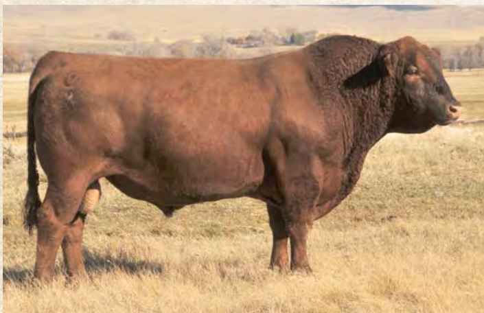
GMRA Secret Mission 8258

Conquest was our top AI sire for heifers for the last three years and we have had great results. His calves are moderate birth and easy calving. In fact, Conquest had the lowest average birth weight of any sire we used in 2011 and 2012. Conquest has an incredible birth to growth spread, and compliments that with outstanding carcass numbers. Look for his progeny to be moderate framed with an average MPPA of 102.8. They have great udders and are easy fleshing. The bulls on test are