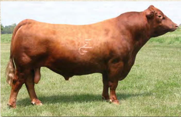
GMRA Laramie 5110

outstanding Marbling EPD. Laramie calves are very long and visiting customers always pick them out because of their extra length. They also show thick muscling with excellent fleshing ability. A quick glance at his pedigree will show the tremendous Lakota cow family, which is one of the foundations of the Green Mountain Red Angus herd.