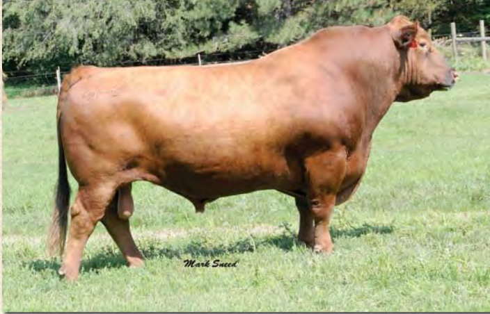
LJC Mission Statement P27