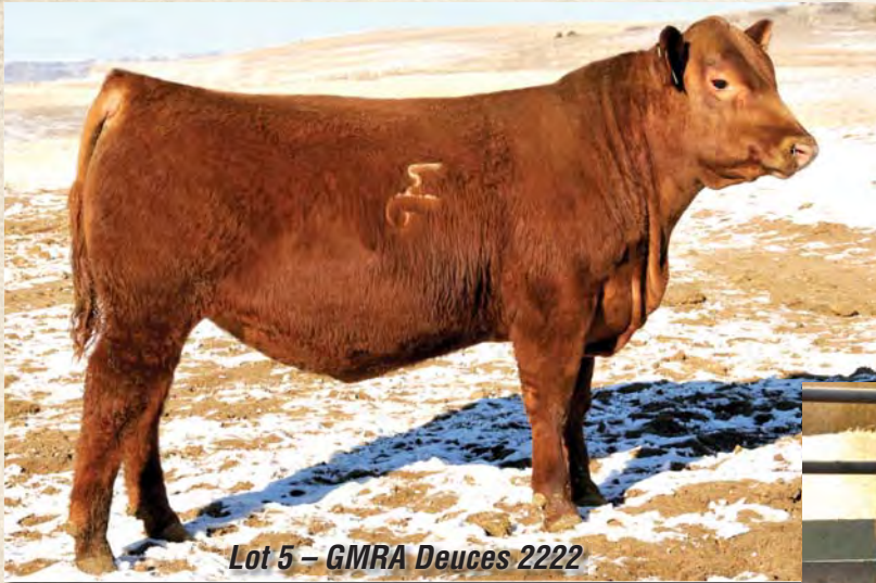
Lot 5 - GMRA Deuces 2222

Deuces has turned in some very impressive performance data. He started out with a nice moderate birth weight and has not stopped growing since he hit the ground. His weaning ratio is one of the highest in the offering and his yearling ratio is the 2nd highest. As of mid-test he is the highest ADG bull in the offering. He also turned in the best IMF scan with a 138 ratio, while still having a 107 REA ratio. His numbers back up all of the performance. 11 of his EPDs are in the top 36% of the breed or higher, with an impressive WW EPD in the top 8%. All of this is supported by a stacked maternal pedigree topped off by a dam with a 105.2 MPPA. Don't miss the opportunity to put this bull to work for you.