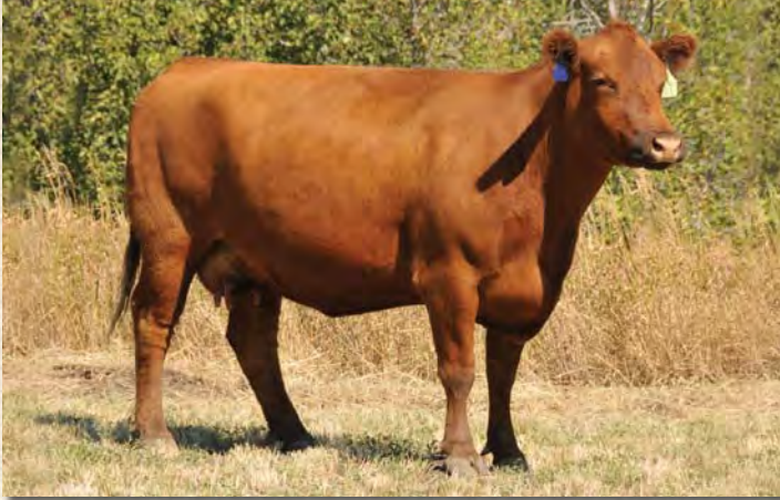
GMRA Lakota 735T, dam of Lot 61