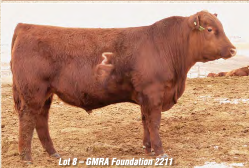
Lot 8 - GMRA Foundation 2211

50K data coming soon. Please check www.gmracattle.com for updated EPDs.