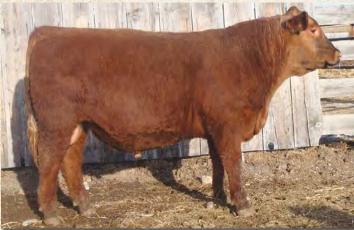
GMRA Mountain 9287

Trilogy was Accelerated Genetics' pick from our 2011 sale. He is a maternal brother to GMRA Make It Easy 8226, who was also purchased by Accelerated Genetics. We used this moderate framed, muscular young sire heavily this past year. His calves were powerhouses from early on, showing excellent muscling and broad tops, and have carried that on through weaning and yearling.