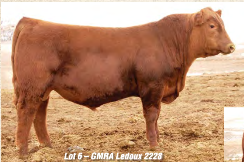
Lot 6 - GMRA Ledoux 2228

Here is a Laramie son that does everything right. He is as complete as it gets, from personal performance to phenotype, to EPDs. He has posted outstanding growth ratios and he also turned in top end carcass ultrasound, with a 117 IMF ratio and a 110 REA ratio. This gives him the 8th highest IMF ratio and the 9th highest REA ratio in the offering. Overall, 10 of his EPDs are in the top 1/3rd of the breed or higher. LeDoux really shines with maternal power, posting a TM and a Stay EPD that are in the top 2%, and a Milk in the top 4%, which ties this EPD for the 3rd highest in the offering. Speaking of maternal power, when you look at this bull's pedigree you see a who's who of the GMRA herd. On the maternal side you have Lakota females with strong MPPAs, starting with his dam posting a 106.3, grand dam is 103.7, great grand dam is 107.4, and a great great grand dam with 108.5. On the top you have Laramie's maternal strength's that take you back to the great foundation female, GMRA Lakota 912. LeDoux is stacked with Lakota power!