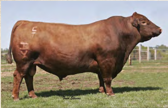
HXC Conquest 4405P

with excellent eye appeal. The Conquest daughters in production are making outstanding mothers, with broad topped and deep with tons of muscle and had the 2nd highest marbling scores of any sire group.