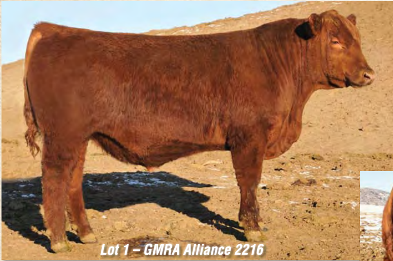
Lot 1 – GMRA Alliance 2216

Alliance has been a standout since early spring and catches the eye of anyone who walks through the bulls. He carries great muscling with a great rear quarter and depth of rib. His dam posts an impressive MPPA of 108.5 on 6 calves. She has an average weaning ratio of 111 and all of her calves have gone on to be replacements or been in the bull sale. Alliance has been great at converting feed to pounds, with the highest weaning ratio in the offering, and has kept on going while on test. He has the 3rd highest yearling ratio and has the 4th highest ADG at mid-test. His numbers place him at the top of the breed where he is tied for the highest WW EPD in the offering and is tied for the #7