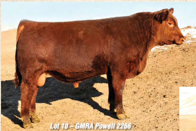
Lot 10 - GMRA Powell 2266

Powell is a deep cherry red with a smooth finish. He is a powerhouse of performance. He has a 118 weaning ratio that is #2 in the offering. He turned in an outstanding IMF scan, ratioing 117. He has some of the most powerful growth numbers on test. His WW, YW, TM, and CW EPDs are all in the top 7% of the breed or higher. His YW EPD is tied for the 3rd highest and his WW EPD is the 4th highest of all sale lots. He has a strong maternal background with a dam posting an MPPA of 105.8 and a great grand dam with a 104.5. His maternal brother, GMRA Make It Red 1243, sold to Bar Open A Red Angus last year for $5500.