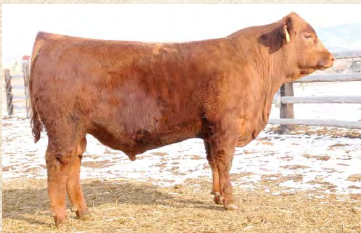
C-T Glacier Berry 1021

Secret Mission was the high selling bull at our 2009 sale, selling to Laubach and Redland Red Angus. He is the type of bull that showcases all the strengths of the Red Angus breed, from conformation to breed leading EPDs. Over half of his EPDs are in the top half of the breed and 1/3rd of these are in the top 21% or higher. He is a maternal brother to GMRA Laramie and boasts that impressive maternal background. His sons are powerful and thick, with outstanding muscling and a good rear quarter.