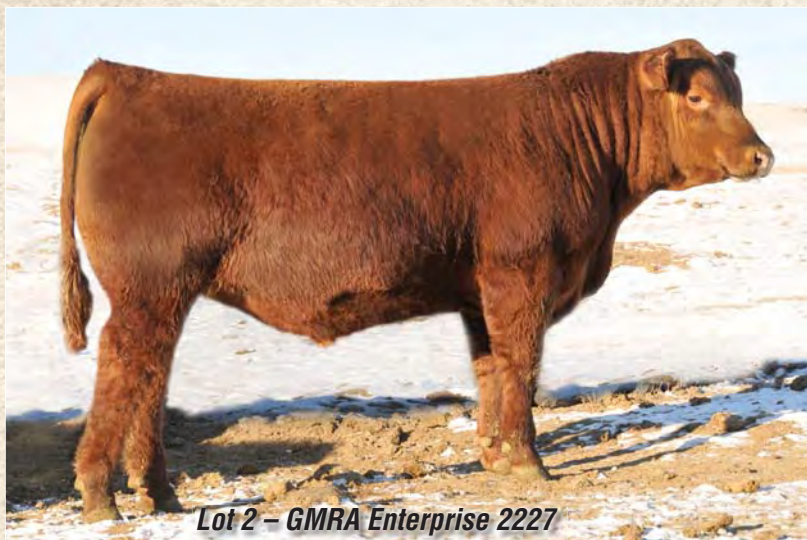
Lot 2 – GMRA Enterprise 2227

LMAN KING ROB 8621 GLACIER REBALA GMRA VERMILLION 796 GMRA LARKOBA 649