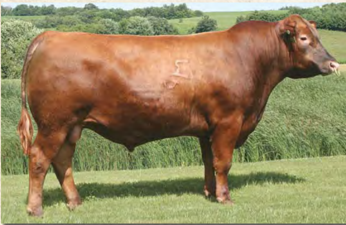
GMRA Trilogy 0226

Laramie was our high selling bull in our 2006 sale, selling to ABS. His calves are attracting lots of attention. The birth weights are moderate and the calves' growth has been explosive. In fact, the Laramie sons on test had the 2nd highest average weaning ratio in 2011 and were the 3rd highest in 2012. His 2012 bull calves on test averaged 102 on their IMF ultrasound, backing up his