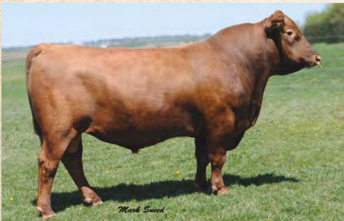
GMRA Make It Easy 8226

Packer is an exciting sire in our line up with extremely well balanced numbers. He is a high volume bull with lots of muscling that he passes on to his calves. The bulls on test are extremely thick with good depth and a nice broad top. Several Packer sons are standouts in the feedlot, posting outstanding growth and carcass ratios. Packer bulls on test turned in a 109 average REA ratio, making them the top sire group. They also turned in the highest average weaning ratio of 105.8 and the highest average yearling ratio of 103.7. Look for Packer sons to follow in their sire's footsteps, producing above average REA and top performing calves.