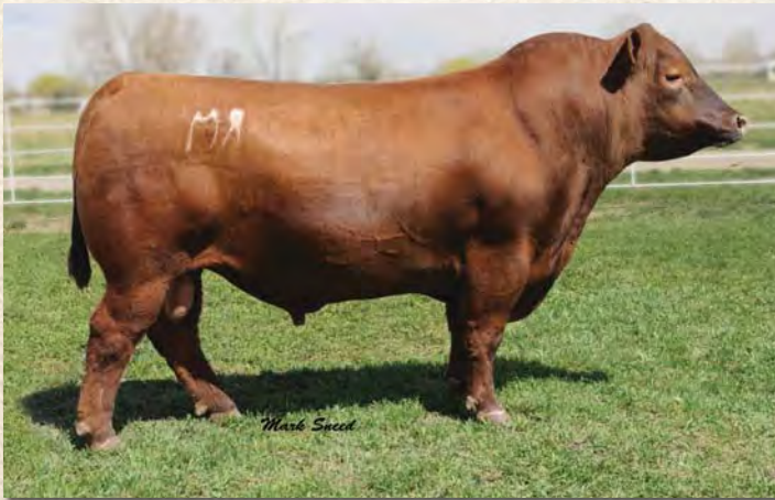
Messmer Packer S008

Mission Statement is truly a "no holes" sire. It's not every day you can find a sire that is at the breed average for birth weight, yet gives you the power of a weaning EPD in the top 17% and a yearling EPD in the top 6%. This high growth bull also provides you with outstanding carcass potential. His REA EPD is in the top 1% of the breed and YG EPD is in the top 2%. The Mission Statement calves offer excellent eye appeal and conformation. The daughters in production are doing an excellent job, with MPPAs as high as 108.3.