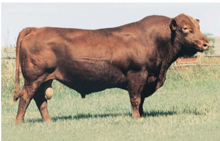
Reference Sire G – Beckton Julian GG B571