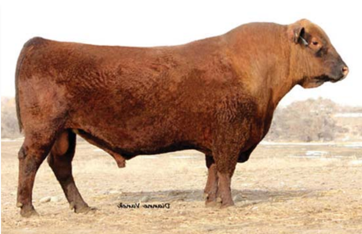
Paternal Grand sire —Beckton Nebula P P707