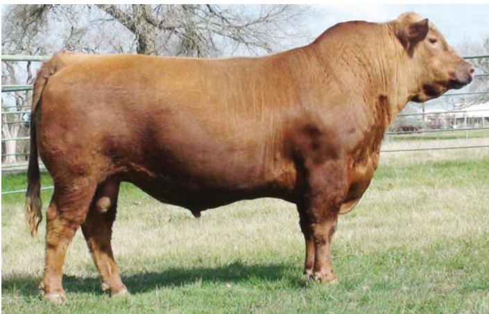
Reference Sire F – Halfmann Dividend U398

One of our best L416 Sons. A good footed, easy keeping bull. He has great length, extremely smooth muscle on a moderate frame that is passing these traits on to his progeny. Co-owned with Silver Spur Ranches, WY. Semen available.