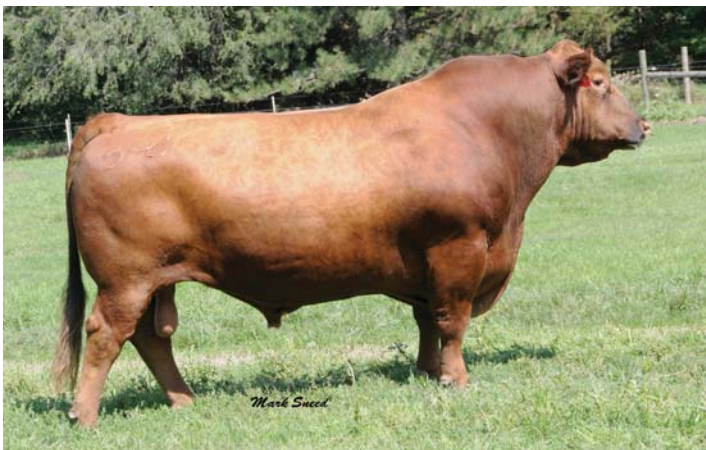
Maternal Grand sire - LJC Mission Statement P27

This Packer son is one of the bulls we are most excited about this year. We used him extensively in our program this year. His dam like Lot 11's raised one of our herd sires as a first calf heifer. Lot 12 is probably the most balanced bull in the sale ranking in the top 26% for BW, 15% WW, 6% YW, 24% ME, 9% Stay, 24% Marb and 1% for REA. His maternal side is one of the best lines of females in our herd in terms of production, consistency, udder development and mothering ability.