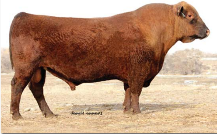
Reference Sire A – Beckton Nebula P707

Packer has been the hot muscle bull in the breed. Great growth and Stayability along with being in the top 2% for REA.