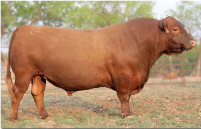
Reference Sire D – Brown Synergy X7838