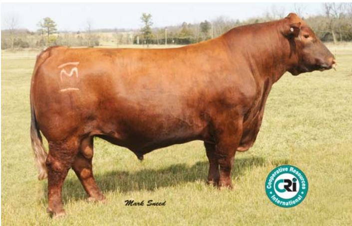
Reference Sire E – Mushrush Impressive CA U236

Impressive is a extreme calving-ease, moderate framed bull with muscle.