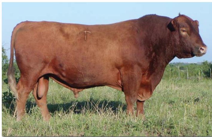
Maternal Grandsire – Halfmann Shrapnel J801