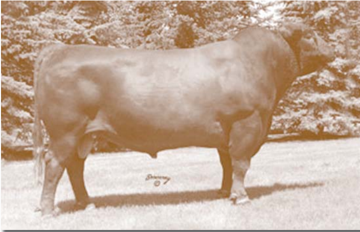
Sire -BJR Make My Day 981

Direct daughter of the famed female-producing Make My Day bull out of one of our original foundation 8207 daughters. Bred to Reference Sire D, Brown Synergy X7838, for a bull with an expected calving date of 3/6/14.