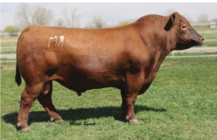
Reference Sire C – Messmer Packer S008

Please visit our website, www.halfmannredangus.com for supplement information.