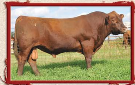
Jacobson Shooter 9055 (#1318493) 5L Summit 1145-6327 x Lorenzen Top Cut