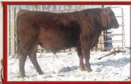
JACOBSON DIRECTION 2070 (#1550986) JACOBSON RED DIRECT 0040 x GLACIER TERRAIN 999