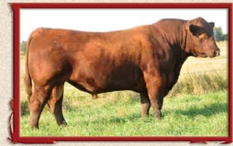
AKO Great North West 901 (#1302801) Red Six Mile Sakic 832S x M L O Mountain High 113