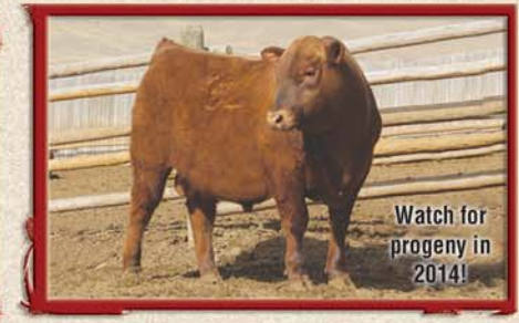
5L Independence 560-298Y (#14503090) BUF CRK The Right Kind U199 x TC Stockman 365