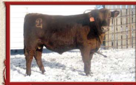
JACOBSON BLAZE ON 2107 (#1551057) JACOBSON BLAZIN ON 0057x LCHMN GRANDCANYON 1244G