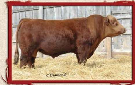
WS Beef King W107 (#2499589 ASA) WS Beef Maker R13 x CNS Dream On L186