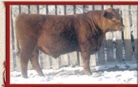
JACOBSON KING 2069 (#1551032) SimAngus™ WS BEEF KING W107 x SCOTT INCUMBENT P13-792