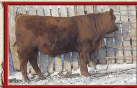
JACOBSON BLAZE ON 2005 (#1551045) JACOBSON BLAZIN ON 0057 x JACOBSON GOLD 7991