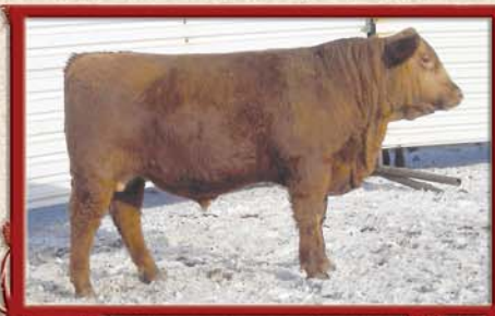
JACOBSON DEPOSIT 2016 (#1550959) SCOTT DIRECT DEPOSIT 907 x 5L HOB0 BEN 04-4422