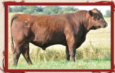
Jacobson Blazin On 0057 (#1370188) 5L Double Blaze 1134-8576 x 5L Explorer 589-7414