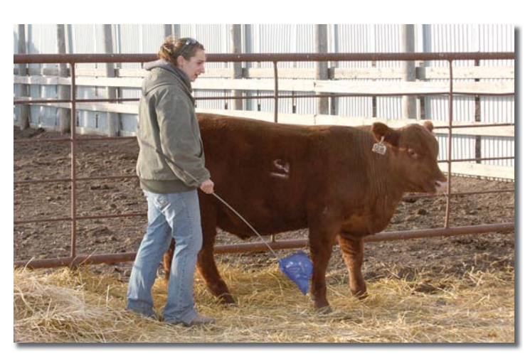
It's hard to take pictures when the bulls are so tame!

A Norseman King son out of one of Sodak's great females. He was in our showstring for the SD State Fair. He is a nicely designed calf with balanced traits. He ranks in the top 8% for REA and 32% for maintenance and 21% for milk. If you are looking for a calf that can do it all, here he is. Full brother sell as Lot 107.