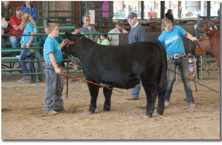
Kale showing Licorice, Jacob's heifer, a maternal sister to Lot 95 steer.

If I wouldn't offer all the heifers, I would keep these young ones and make cows out of them. Outcross pedigrees that are unlimited to the sires you could use.