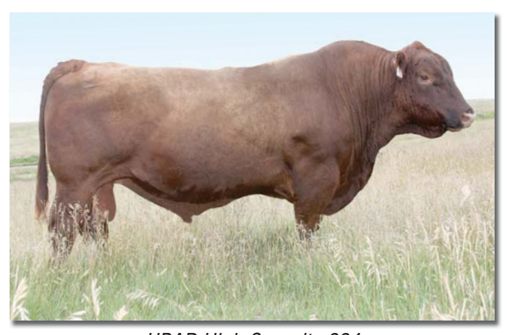
UBAR High Capacity 224

For more information, visit www.ranchersrelief.org.