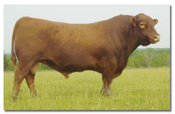
JDB Equals Thunder 302N

The funds will be administered by the Black Hills Area Community Foundation in cooperation with the founding livestock organizations for the direct benefit of the livestock producers impacted by the devastating early October blizzard. The Black Hills Area Community Foundation is a 501(c)3 nonprofit and will receive 1% of the fund proceeds plus any direct administrative costs associated with the fund.