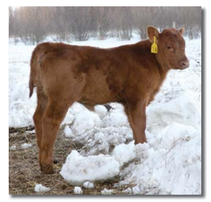
Lot 3E as a baby