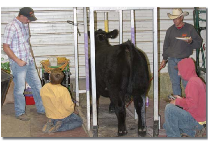
SD State Fair show day

This young heifer is a little greener than the older heifers, but she has nice eye appeal and sound-