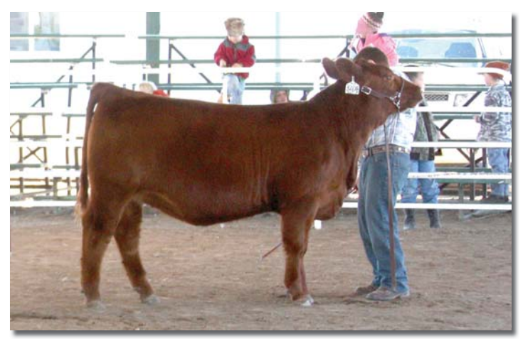
Lot 1 – Champion Red Angus Female at Miller, S.D., Point Show