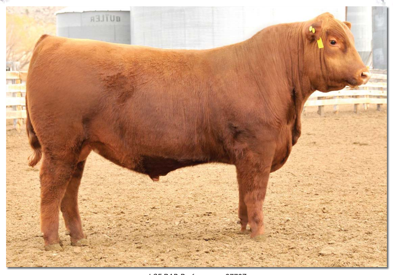
LSF RAB Performance 2772Z