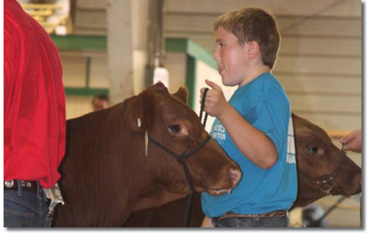
Kale showing at the SD State Fair