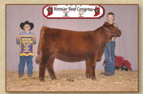
Majestic Girlie Girl Y24