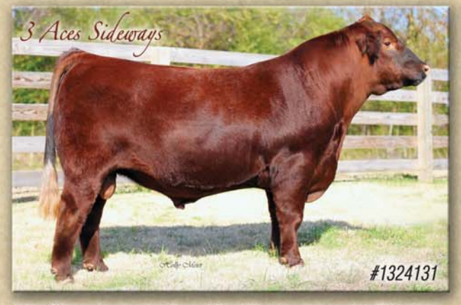
3 Aces Sideways has exceeded all expectations! His calves come easy but still have bone, stellar show ring progeny and a good black foot. His first daughters in production have gorgeous udders. A must use sire for first-calf heifers and an udder fixer. Proudly owned with 3 Aces Cattle Co., TC Reds and VonForell Ranch.