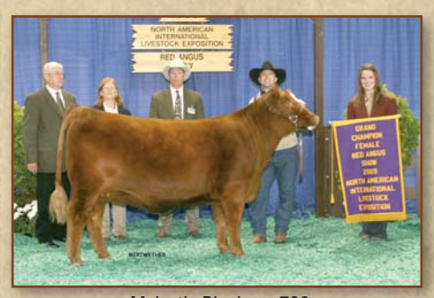
Majestic Blockana 728