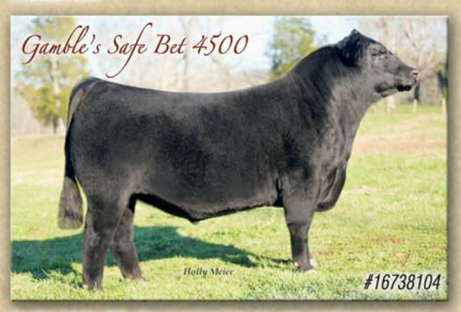
Gamble's Safe Bet 4500 - Our safe bet for calving ease, guts, rocket fronts and good dispositions. Progeny continue to impress. We used him heavily as a junior yearling and we expect he will be highly sought after as more progeny surface. Proudly owned with Gamble's Angus and Safe Bet Associates.