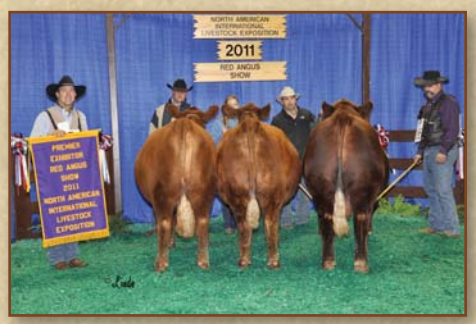
2011 NAILE Champion Senior Get