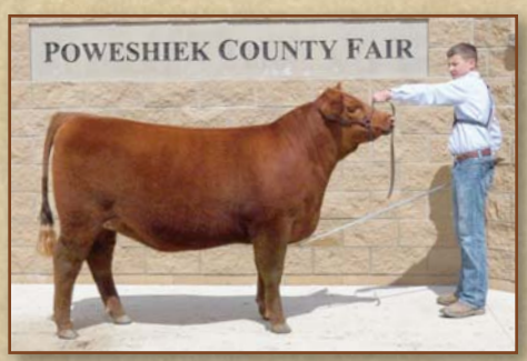
Majestic Rebella Z115