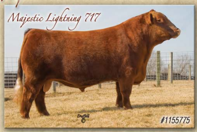
Majestic Lightning 717 is the sire of 2013 NWSS Grand Champion Female and Senior Get of Sire. His progeny are continuing to dominate Louisville and Denver. His recent 50K test again proves him to be a moderate-birthweight sire. Proudly owned with VonForell Ranch