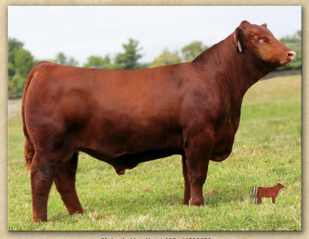
Majestic Lion Heart A25, #1599973