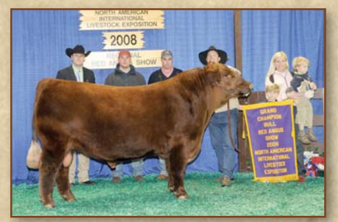
Majestic Lightning 717

We are humbled by our previous success and we congratulate our customers on their past and future success.