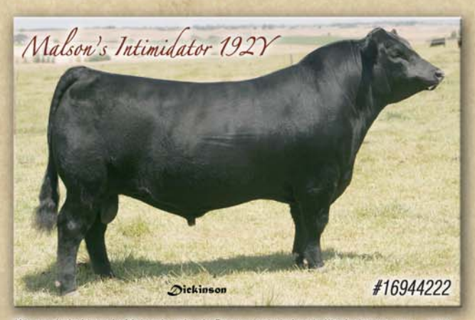
We saw Intimidator in Malson's string in Denver and obviously liked what we saw - great muscle shape, super smooth and sound. Nice outcross opportunity to most SAV and Northern Improvement lineage. Proudly owned with Malson's Angus and Intimidator Associates. Contact Malson's Angus and Herefords for semen inquiries on this bull.