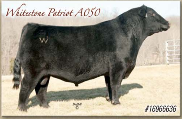
Whitestone Patriot A050 is a rare find. He has thickness, power and grace. He is one of the heaviest muscled Pioneer sons to surface to date. Smooth made, long bodied, extra wide down his top, very good disposition. It is a pleasure to watch him walk. Proudly owned with Whitestone Farms.

Visit our website for a list of semen distributors of these sires.