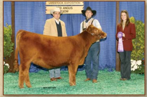
Majestic Blockana Z121