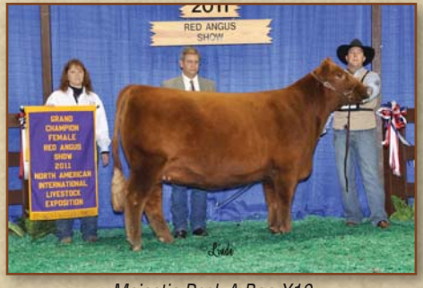
Majestic Peek A Boo X19