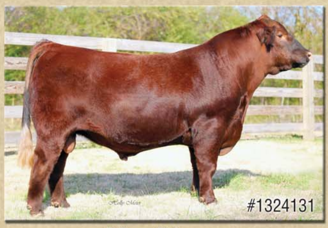
3 Aces Sideways