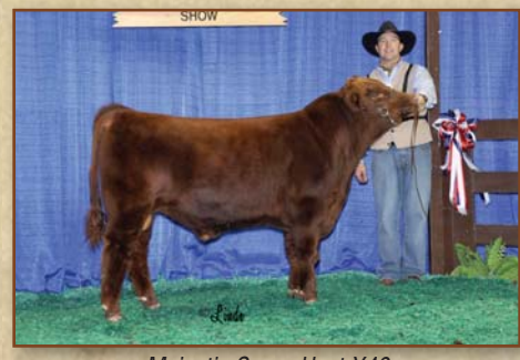
Majestic Super Heat X49