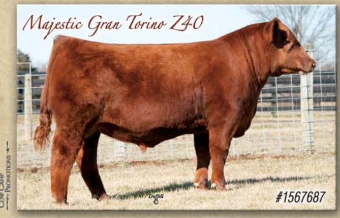
This bull is awesome and posted a weaning weight of 959 lbs. Not only is he the thickest Red Angus bull we have seen, but he may also be one of the prettiest. This is still an English breed of cattle and we can't compromise fertility and shoulders for thickness. However, cattle can always use more natural muscle. He has huge testicles, a giant hip, an awesome dark foot, and no Canadian influence in his pedigree.

Visit our website for a list of semen distributors of these sires.