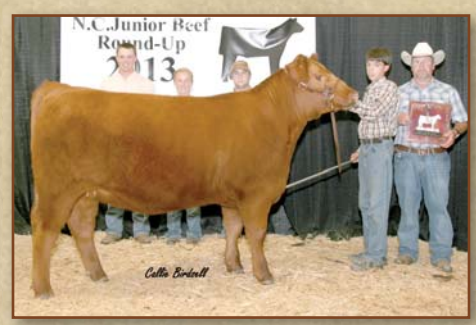
Majestic Blockana Z21