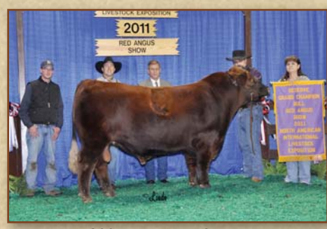
HSCC Lightning McQueen 3X