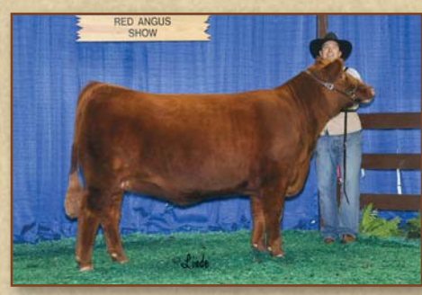
Majestic Blockana X43