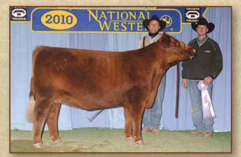
Whitestone Blockana X234