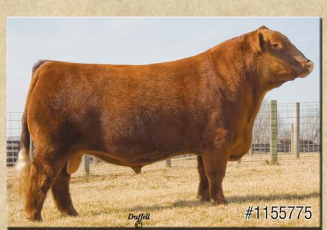
Majestic Lightning 717 SGMR