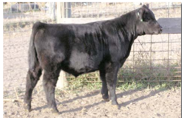
EZ Titan 7T, sire of lot 41

Here's a dandy young 3/4 Titan daughter out of prolific Clout daughter who has been a top producer for 11 years in the EZ Ranch herd and still producing! Lots of longevity here. She is due this spring to EZ Tylor 703Y PM13362.