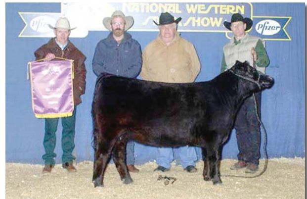
EZ Fantasia 20J, dam of lot 23

This young Sparks daughter is loaded with some of the top show pedigrees in the Lowline breed. Sparks, a former Iowa State Fair Champion, matched up with Fantasia, the 2000 National Champion Female who is also in the pedigree of Muddy Creek's National Champion, Opinionated. She is due this fall to Update.