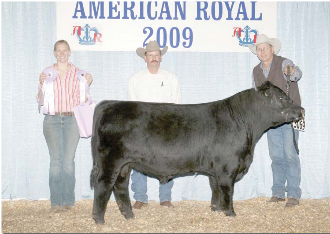
Lot 1 – EZ Update 16U