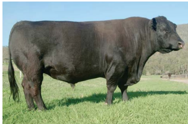
Vitulus Winner, sire of lot 20

This could be a terrific mating, EZ Update 16U bred to this fabulous outcross daughter of the Australian powerhouse, Vitulus Winner, one of the most powerful, beefy Lowline herdsires in Australia. She also traces to the Sydney Royal Grand Champion, The Glebe Woodstock, one of the best looking champions ever to show in Australia. She is due this spring to Update.