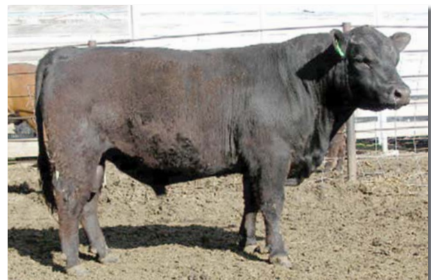
EZ Pete 14P, sire of lot 24

Who's who for Lowline herdsires here...Magnum, Rouseabout, Dakota Pride, Nevada and Clout...she's stacked! And bred to Update for a fall calf - wow!