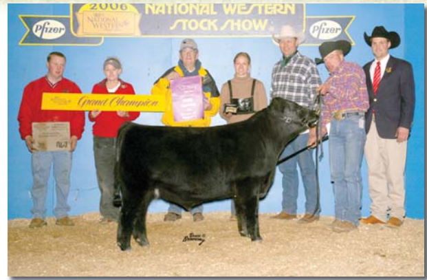
Little Joe, sire of lot 21

Her sire was the 2006 National Champion Bull and the sire of the Grand Champion pen of "Range Master" commercial (halfblood Lowline) heifers at the 2012 National Western. Her dam is a maternal sister to the great Utah bull who has sired so many top selling females in Denver. She is due this fall to Update.