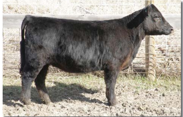
Sweet Jackie Babe 2X, maternal half sister to lot 12 and paternal half sister to the lot 12A embryos.

5 embryos by Jackaroo and out of lot 12 EZ Miss Daisy 40S.