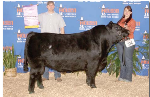
KBW Beau Vine, sire of lots 39 and 40

Here's another nice Beau Vine daughter. She is due this spring to the EZ Tylor 703Y bull by EZ Templeton.