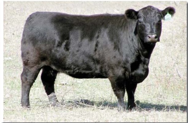
Brambletye W332, dam of EZ Update 16U

One of the most attractive, consistent fullblood Lowline herdbulls ever sired by the great Australian sire, Neron. His dam, the imported Panmure daughter is also the dam of the $15,000 donor cow and Grand Champion Female at the American Royal, EZ Fancy Pants 12R. Update's calf crops are outstanding in every way! Selling half interest and full possession.