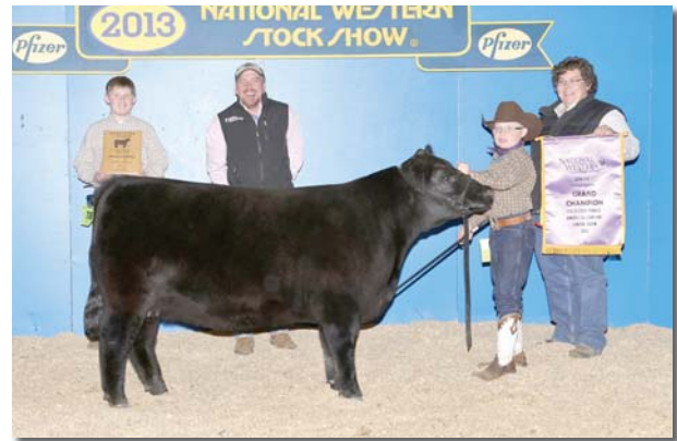
CUP Valentine, 2013 Denver Junior Show Champion, is sired Spring Creek Uri

Her sire, Spring Creek Tommy, is a flush brother to Spring Creek Uri, Reserve Fullblood Bull at Denver and the sire of the 2012 American Royal Grand Champion Fullblood Female. Abby is a bigger cow. Tabby is super feminine, structurally correct female, if you want one to show. She will get better and better with time!