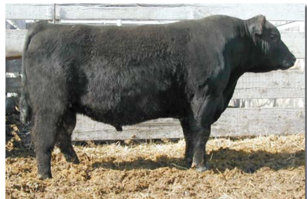
Sherman 24J, maternal grandsire of lot 36

This young 3/4 blood cow has lots of maternal strength when you stack Magnum, Sherman and Midshipman you get good udders with lots of milk. She is due this spring to Update.