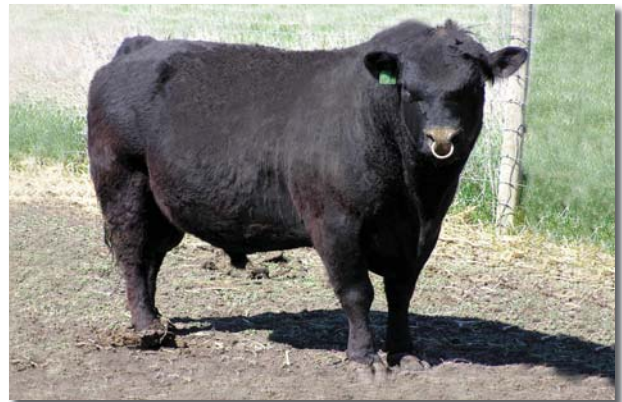
EZ Lexus 18L, sire of lot 12

Here's an extra special Update heifer calf out of the lot 12 donor cow, EZ Miss Daisy 40S.