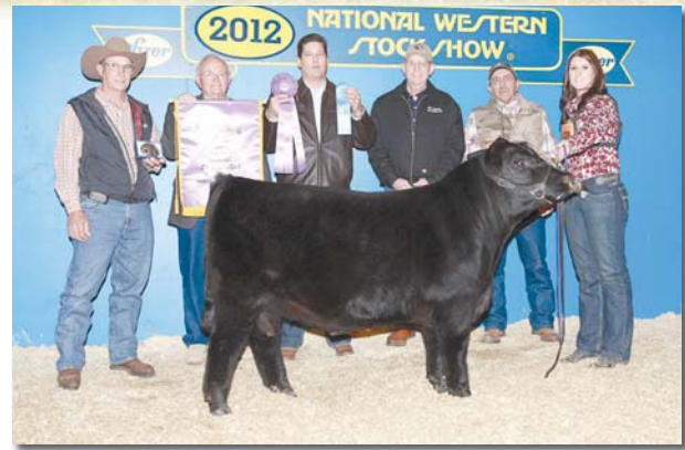
Prince Charming, 2012 National Champion Bull and a paternal brother to lot 37.

These Low Beau halfbloods make great cows. This young female is due for a fall Update calf that should be great.