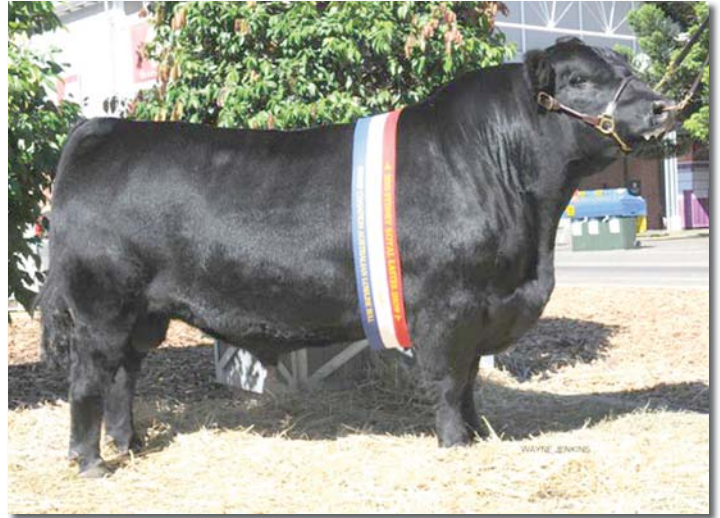
Yarra Ranges Jackaroo, service sire to lots 2 and 5 and sire of lots 11A, 12A, 28.

Look at this Buzz daughter, bred to Jackaroo whose dam comes from one of the foundation cow families of the Bar J herd, Bar J Nellie 7G1. Numerous champions have very similar pedigrees to this mating. AI bred to Jackaroo on June 19 then pasture exposed to Update, safe to the AI date.