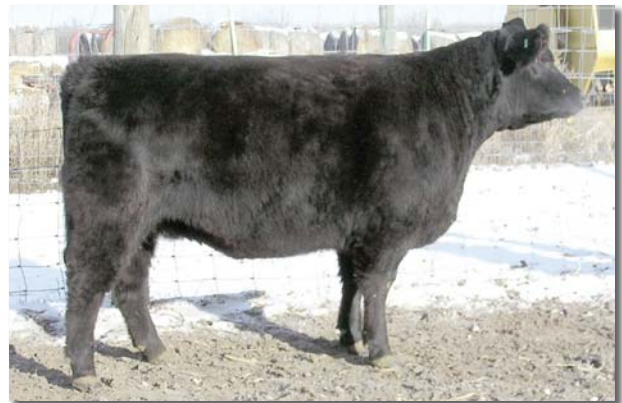
EZ Miss Pamela 9P, dam of lot 14

She is another outstanding fullblood Lowline female from the imported cow family of Miss Panmure L362. The Pamela 9P cow has produced Wilbur, the high selling bull at the 2012 National Sale and is the dam of Piston, 2012 Grand Champion at the Ohio Beef Expo who scanned a 19 inch ribeye area in Denver. 14A: Bull calf WD23Z by Update born 10/15/12.