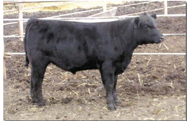
EZ Update 16U as a calf

What a stacked pedigree, absolutely packed with breed leading genetics.