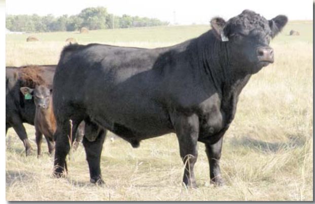
Bar J Sultan, sire of lot 25

25A: Bull calf WD24Z by Update born 10/25/13.