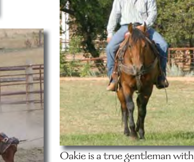
or without a bridle and is one of Robert's main mounts inside and Oakie can work both ends of a steer. outside the arena.