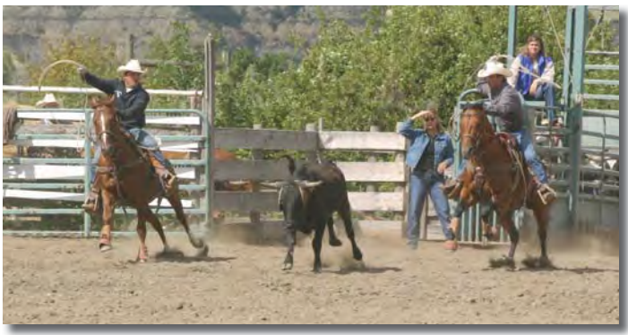
Millie N Docs Oak heads one for Gun Too, Reference Sire B.