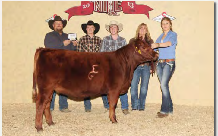
Green Mountain Red Angus GMRA Mesa Maid 329 2013 NILE Futurity Reserve Grand Champion