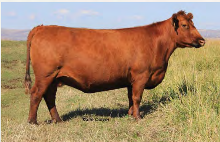
Feddes Sleek 806

Eleanor 318 is a moderate-framed, low-maintenance heifer. Her great granddam is still producing.