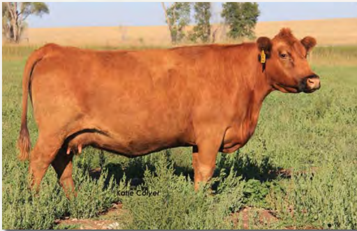
Feddes Sleek 2S, Dam of Feddes Granite Z132, service sire

Bred to: BIEBER GOLDBAR Y379 (#1441761) Due Date: 3/19/15 Look for Fayette 688 to offer depth and capacity. Her EPDs are right in line with current breeding – 8 numbers are in the top 1/3 of the breed or higher.