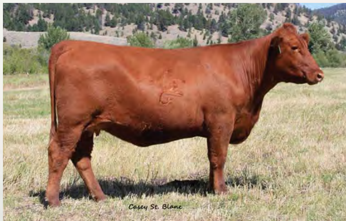
Casey St. Blanc