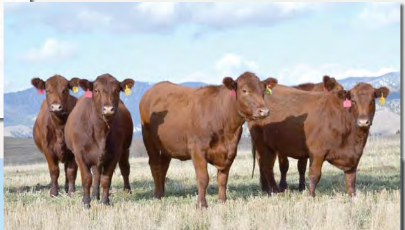
Feddes Big Sky R9