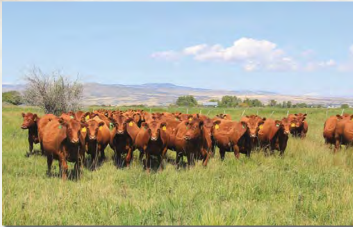
Feddes Bred Heifers