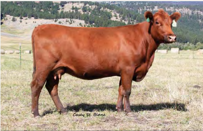
Casey St. Blanc

R98 is a beautifully made cow with loads of power. MPPA 103.0, AWR 104, AYR 104, IMF 102, REA 108. Her REA EPD is in the top 1% of the breed and Milk is the top 4%. Her dam sold to Wildcat at 10 years of age. R98 has been a donor cow for us, following in her mother's footsteps. We have retained two daughters and two more are in the bred heifer replacement group. R98 is hard to let go of, but having two more daughters calving in 2015 makes it a little easier. If you are looking for a donor cow with loads of power, maternal and carcass, take note of Lot 5.