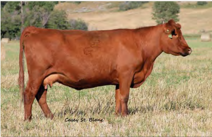
Casey St. Blanc

R42 is a moderate-framed Mimi with excellent feet, legs, and udder structure. The flawless structure is no accident – she is backed by three generations of productive, trouble-free females. She has a small birthmark on her hind leg but none of her calves have it. Don't miss her!! These older cows do not have extreme EPDs but are very well balanced and PROVEN!!!! MPPA 100.9. GridMaster Index in the top 34%.