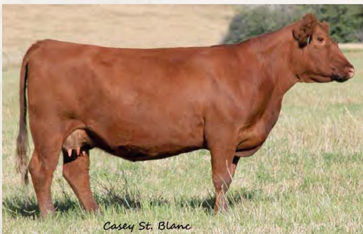
Casey St. Blanc Lot 80

Bred to: BIEBER GOLDBAR Y379 (#1441761) Due Date: 4/20/15 We purchased this Klompien female as a bred heifer at the 2012 Big Sky Elite sale. We just couldn't pass up the phenotype combined with the Rambo breeding. She has done an outstanding job for us, with an MPPA of 105.4, an average WR of 110 on 2, an average YR of 104 and an average REA of 112.