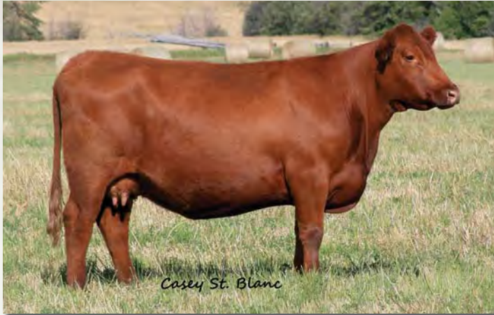
Casey St. Blanc