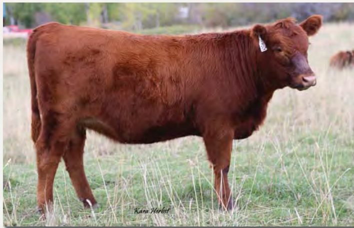
Lot 82's 2014 heifer calf

Feddes Red Angus will pay to sire indentify the calf.