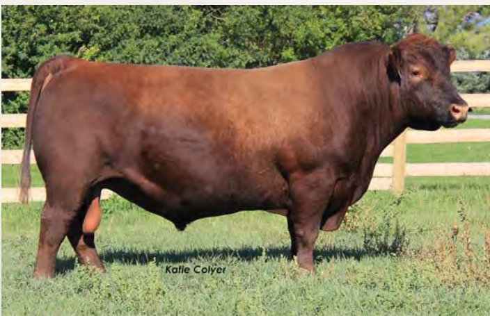
Feddes Montana X44, service sire

What a powerful set of numbers here! All but two of her EPDs are in the top 49% of the breed or higher, with a CW in the top 6%, a REA in the top 4%, and a YW in the top 3%. She also posts a HerdBuilder index in the top 32% of the breed.