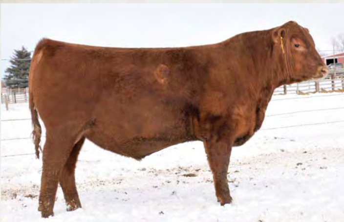
Feddes Conquest Y1 A203, service sire