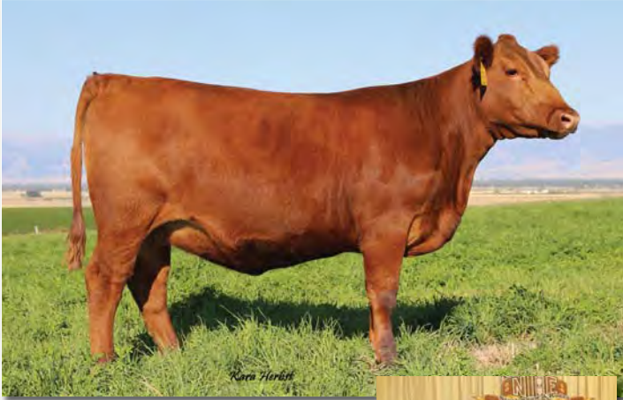
Feddes Red Angus Feddes Blockana 9144 A33 Reserve Champion at 2014 NILE Futurity and the high-selling heifer for $11,500 to Walnut Springs Farm in Michigan.