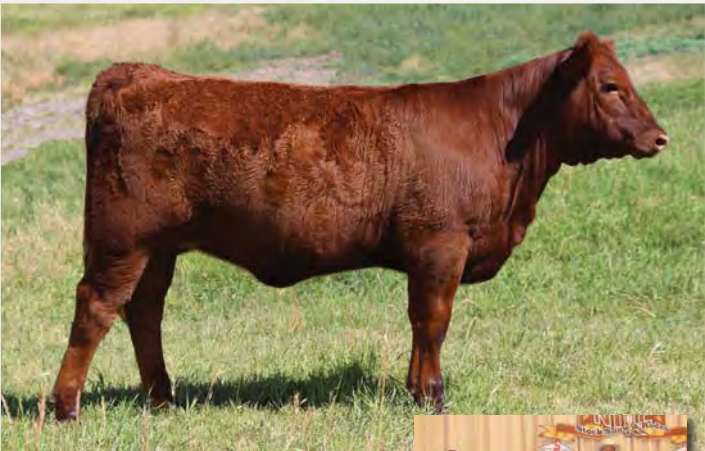
Klompien Red Angus DKK Matteline 443 Third place in the NILE 2014 Futurity