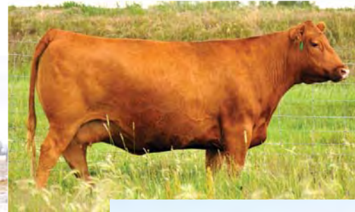
Feddes Lakina 310, dam