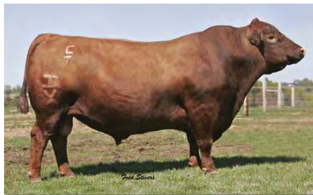
HXC Conquest 4405P, paternal grandsire