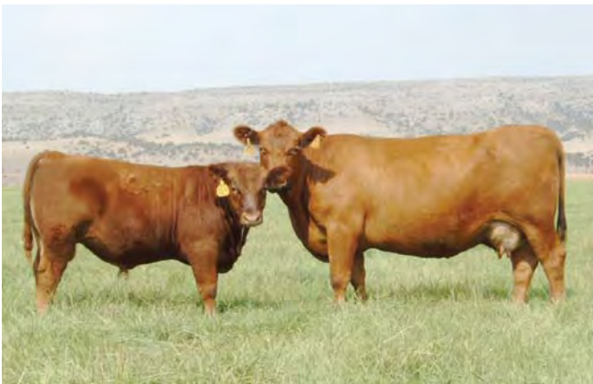
CTDB Vrdale 012, granddam of Lot 102