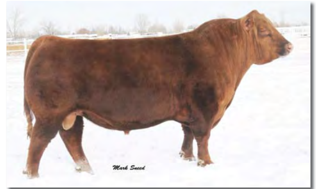
Feddes Big Sky R9, maternal grandsire