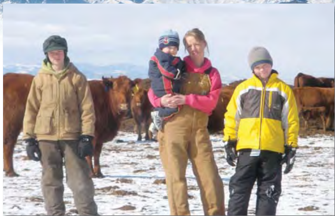
C-T Feeding Crew