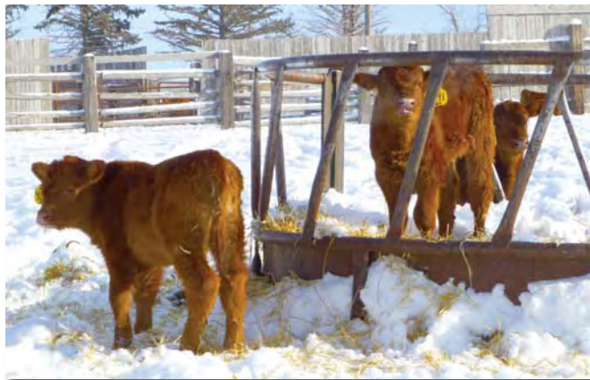
Hanging in the feeder