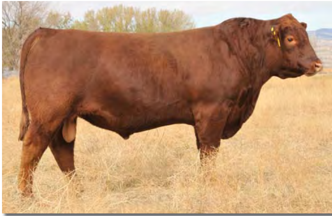
Loosli Right Kind 107

This ABS bull sires moderate frame cattle with a lot of performance. He covers a lot of bases in his EPD profile: growth, maternal & carcass. This is our first crop of bulls and heifers to sell, and we like what we see.