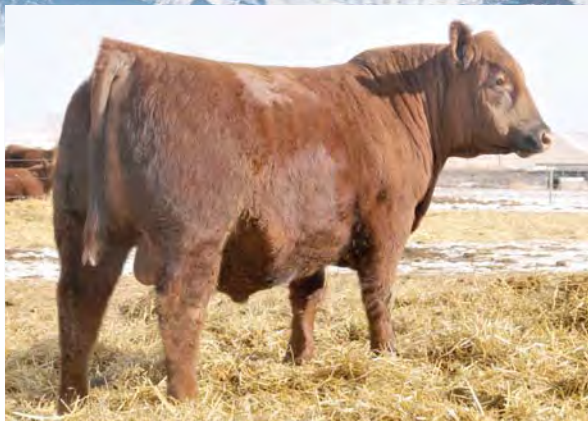
Feddes Montana X44