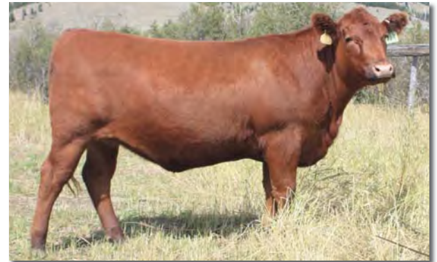
GMRA Angie Rose 944, as a heifer, paternal granddam