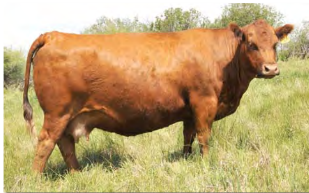
Feddes Blockana 429, paternal granddam