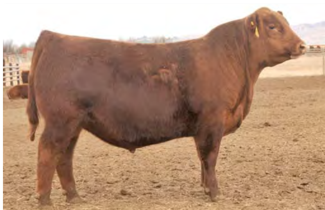
C-T The Quest 1103

C-T's high selling bull in 2011 to ABS, Gill Red Angus, Lucht Red Angus. He is siring a real complete set of calves with moderate birth, big growth, and lots of volume, and great dispositions.