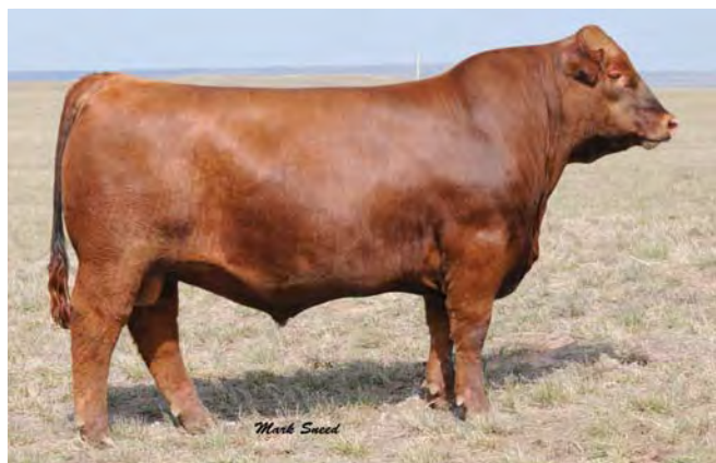
C-T Grand Statement 1025

A Justice son with extra length and eye appeal. Our high selling bull in 2012 to Rust Mountain Red Angus in North Dakota. He has not let us down, making a great set of calves on his first try.