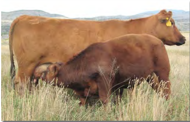
Loosli New Chapter 521, Dam of Lot 11