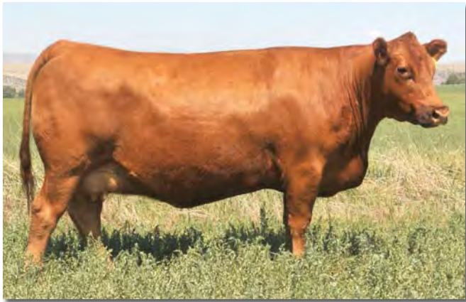
C-T Cris 426, dam of Lot 40 and 44