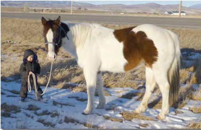
Trac and Doc