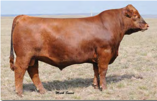
C-T Grand Statement 1025, sire