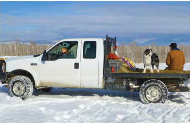
Trac and Craig DeBoer feeding