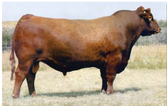
Red Fine Line Mulberry 26P, sire of Fed Flikk Mulberry X648

Y34 sold in our 2012 sale to Sandy Willow Red Angus (Gaikowski family) in South Dakota. We sampled him a bit with very good results. You won't find many bulls with CED, WW & YW in the top 10% of the breed. He has been very easy calving and they grow.