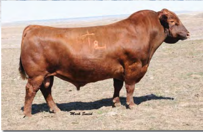
Beckton Epic R397K