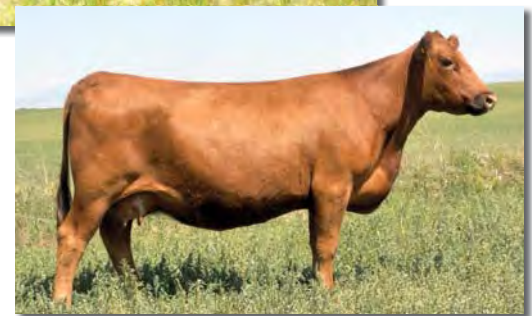
C-T Miss Pan 0760, paternal granddam

• Eagle A202 is one of the most powerful bulls that we have raised. We feed a high roughage ration and don't get many bulls near 1400 yearling weights. He is an ET bull so has no ratios, except for carcass- IMF 114, REA 102. His dam is 310, Big Sky's dam & dam of Feddes Big Horn Z150 (our second high seller in 2013 sale to Barentsen/Bullinger). He has a gain ratio (GR) of 123.3 Flush brothers sell as lot 10 & 45. These three brothers average GR is 122. Dam's MPPA 107.9