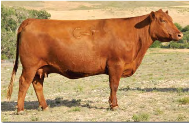
C-T Tina 0972, paternal granddam