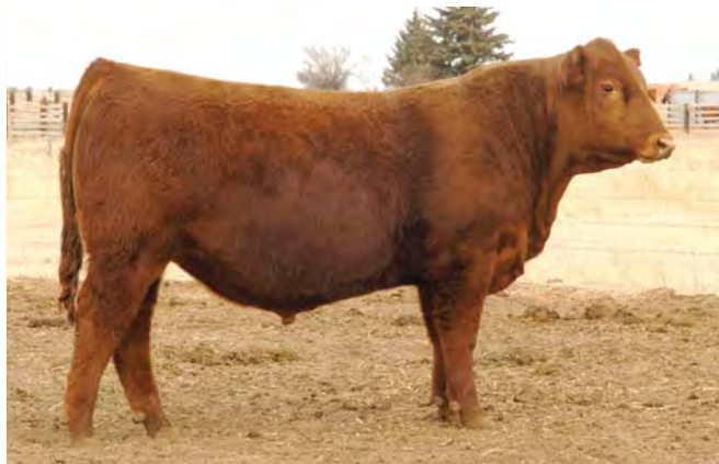
C-T DKK Duke 1100

This is a great maternal calving ease sire from Accelerated Genetics that is siring a very consistent calf crop, with some calves coming to the top of the pack.