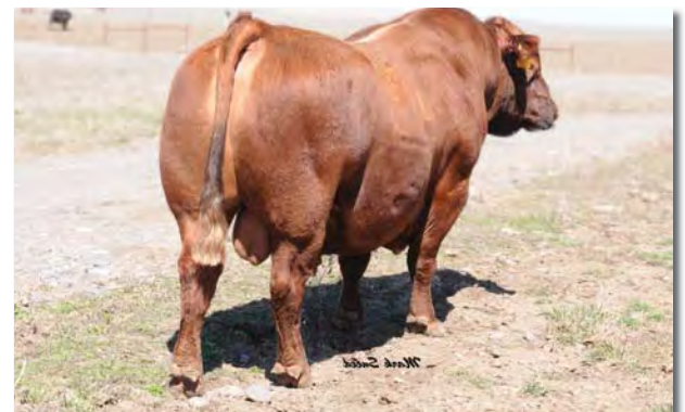
Beckton Epic R397 K, sire