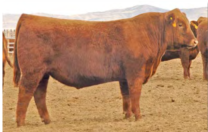
Feddes Conquest Y34

We calved a handful of his daughters this year, and they have done very well. They all calved to AI service and calved unassisted. They are deep bodied, with beautiful udders and are easy keeping. His sons perform near the top of their group with moderate frame. If you are looking for extra performance with moderate frame, take a look at his progeny. We sold X44 in 2011 and bought him back in Nov. 2013.