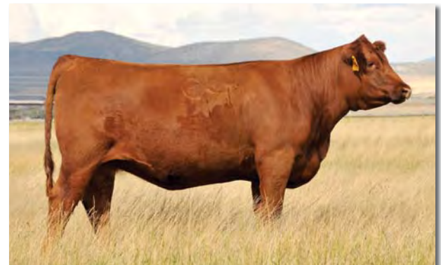
Paternal sib to Lot 1

• What a bull to start the sale. Grand Design has lived up to his name coming in as one of the top bulls in the offering. He is one of the best Conquest sons I've seen with incredible length of spine and extra thickness. He has loads of calving ease with a 79 lb BW, 14 CED (1%), -4.3 BW (9%), Marbling 4%. He has a 14.7 REA with a 117 ratio. He does not give up any growth with over 830 lb 205 (104 WR) and a 1361 YW (110 YR). I can't say enough good about these Conquest cattle. The bulls have been extremely consistent and solid, while the females are making some of the best cows in the breed. Dam C-T Verdi 1142 is a beautiful Hobo Design cow going back to the famous Glacier Chateau. Starting out the sale can be a tough place to be, don't miss this great herd bull with calving ease. Dam's MPPA 101.6