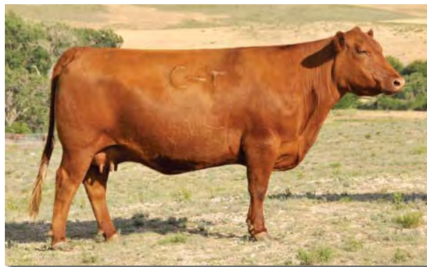
C-T Tina 0972, paternal granddam