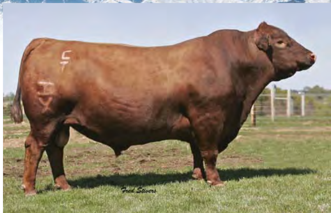
HXC Conquest 4405P