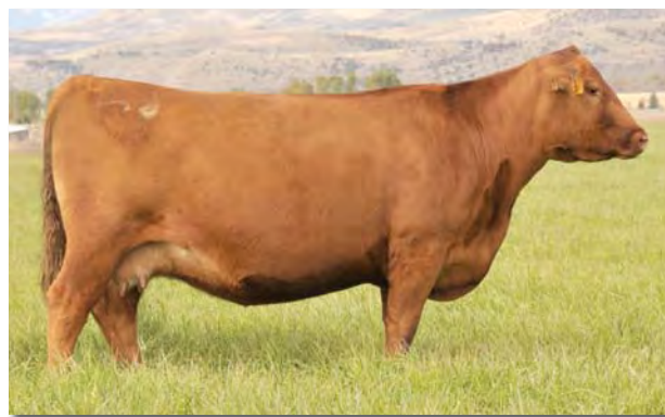
SUNF Flo Marie 770, maternal granddam