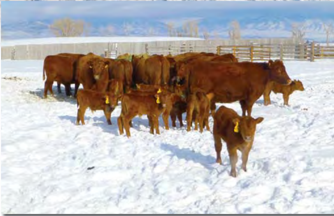
feeding the moms