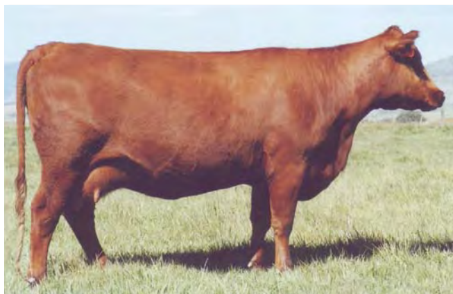
CTDB Verdi 04, dam