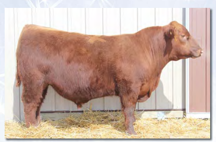
Kuhns James Bond Z071, sire