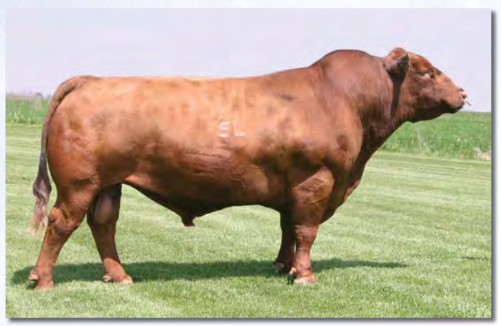
5L Norseman King 2291, sire