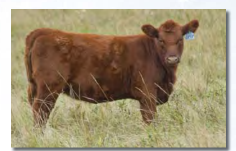
North Dakota Red Select Sale - 9