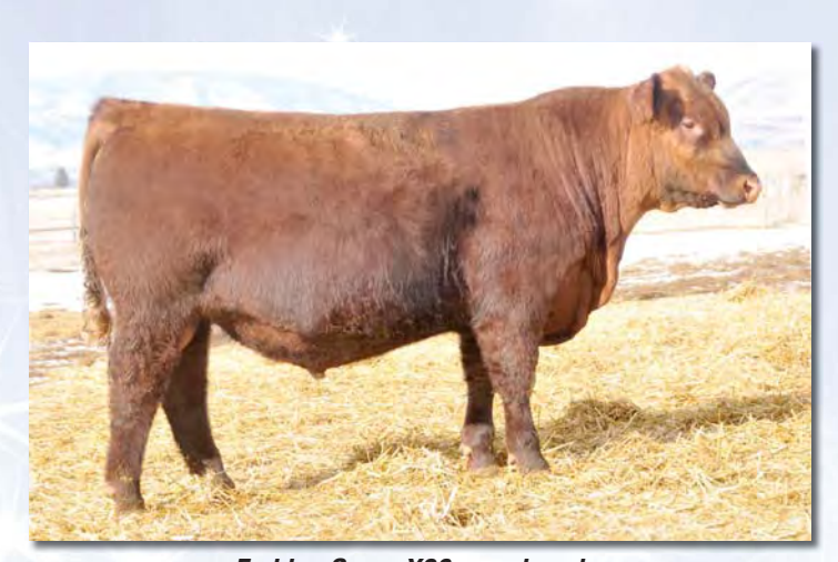
Feddes Oscar X28, service sire

Ultrasound confirmed to KKC Pinnacle 949-109 (#1486656) for a 3/30/15 calf.