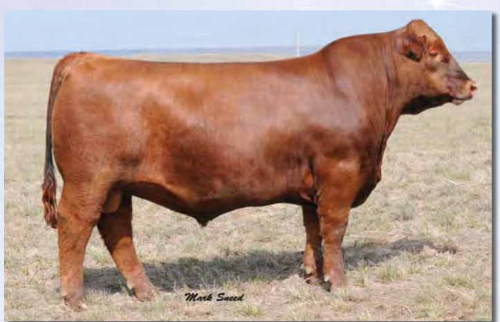
C-T Grand Statement 1025, sire