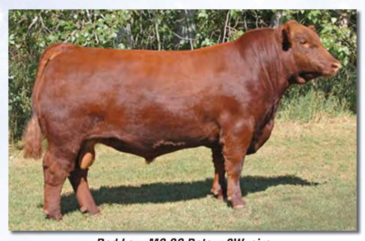
Red Lazy MC CC Detour 2W, sire