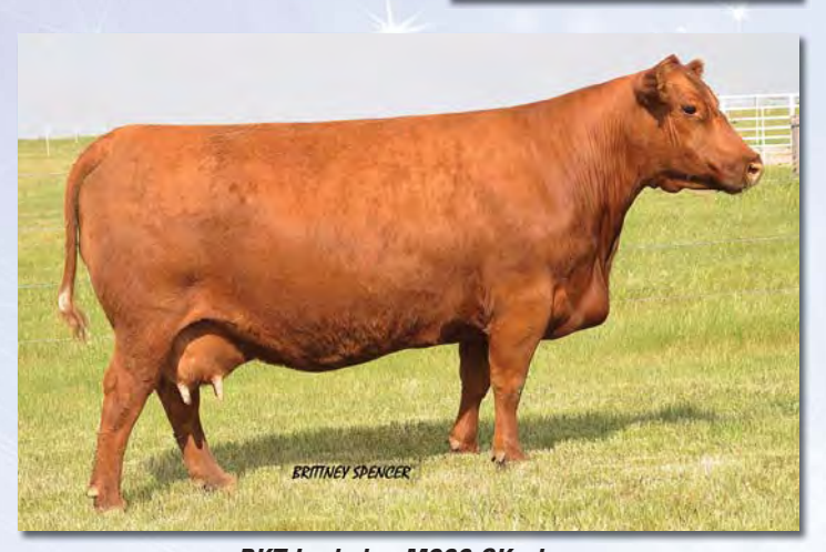
BKT Larkeisa M288 CK, dam

This February Red Corner Creek Cash 2R daughter has had that cocky "look at me" presence since she was just a calf on her recip cow. Her dam is none other than BKT Larkeisa M288 CT which is the mother of both of our consignments today. She is also the dam to Beckton Hustler S426 C2, a herdsire for Genex and TNT Simmental/Red Angus. Whether your plan is to show her or user her to build your Red Angus program, 429B will be a highlight. Please check out our website at www.RustMountainViewRanch.com for videos on this female.