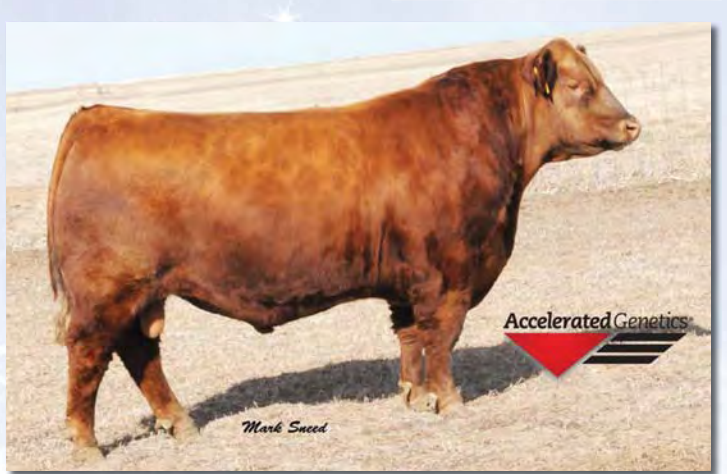
Pelton Statement 225W, sire

Ultrasound confirmed to Bieber Rough Country A523 (#1619833) for a 1/22/15 calf.