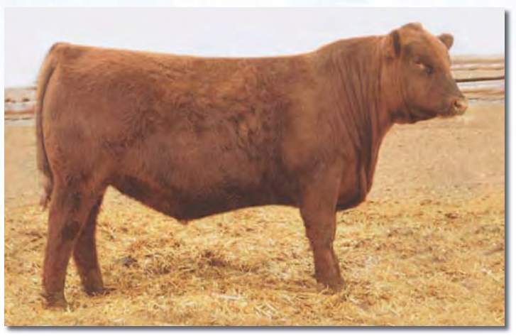
Larson Jubilee 155, sire

Kuhn's Kopper B034 has the potential to really shine in the show ring! She is long and deep, but still angular. Now add in the fact that her grandmother, 6049, worked her until the good old age of