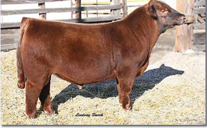
WEBR TC Card Shark 1015, sire

Purchase of three embryos with guarantee of one pregnancy if implanted by certified technician. Embryos are stored at Trans Ova, Sioux Center, IA.