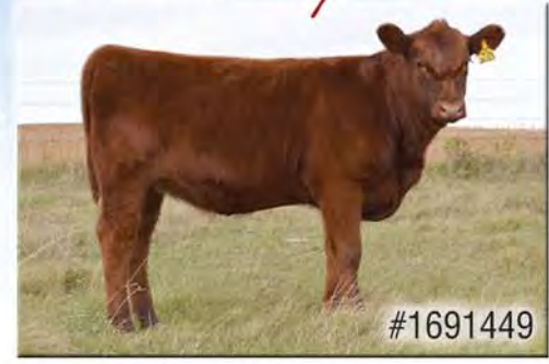
HBR Miss Knight 976-4123 Donated by Huber EY Red Angus Tickets available from NDRAA members or at the banquet or sale.