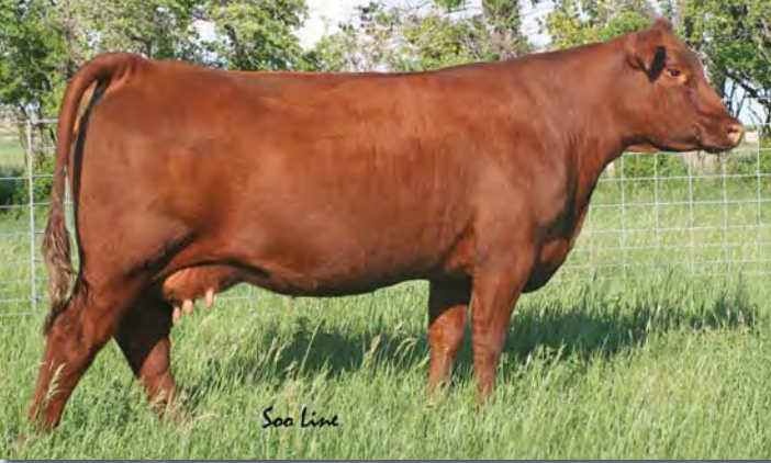
Red Soo Line Julie 5437, dam

Pick of four ET bull calves due March 20 with selection at weaning.