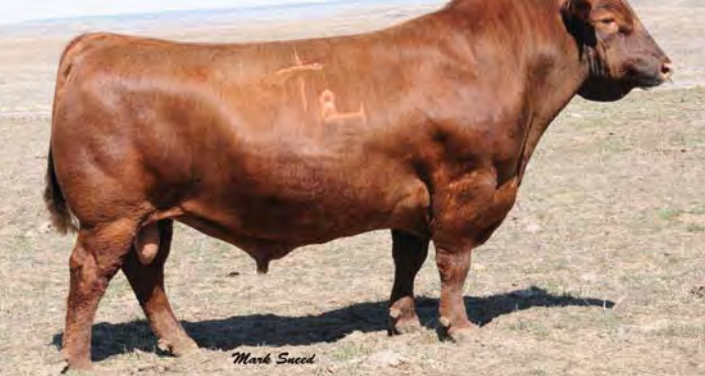
Beckton Epic R397 K, sire