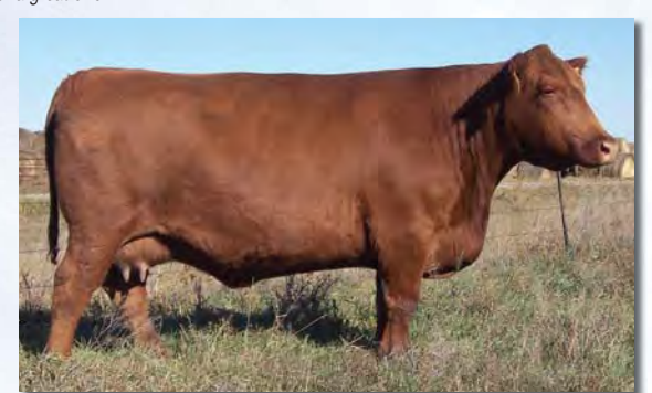
SCHR Dynamic Sally 18K, dam

Dynamic Sally 18K has produced a total of 127 embryos with an average of 11 embryos per flush. She is the dam of our two sale lots. She is a "dynamic" matron – volume, supper udder and length make her a great one.