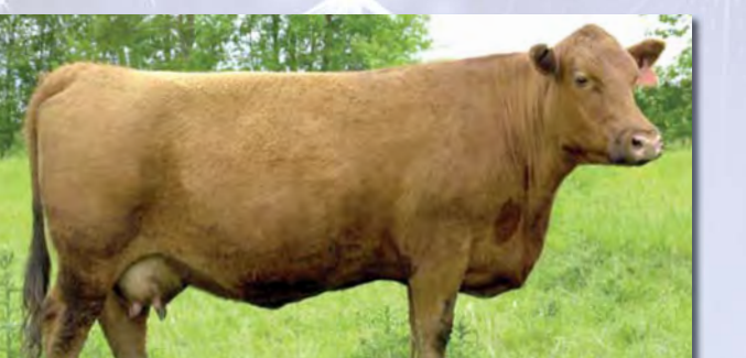
Seeger Red Sadie 334, dam

Selling a package of three embryos in each mating, guaranteeing one pregnancy if implanted by a certified technician.