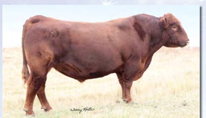
PIE KAR Wagonboss 172, sire