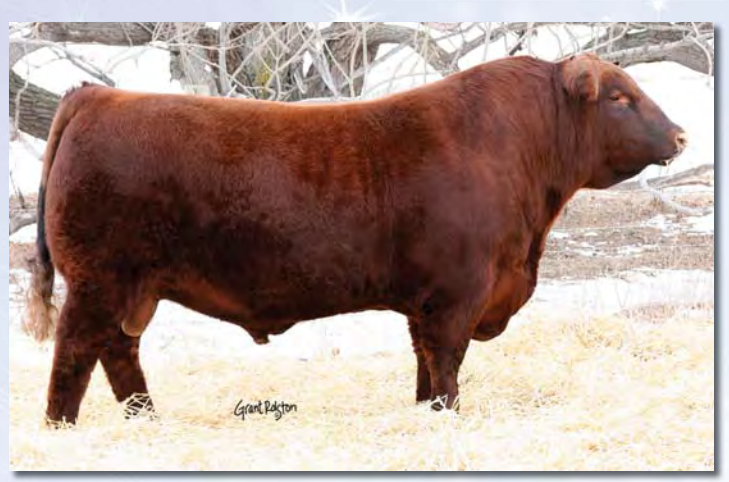
RD Ter-Ron Fully Loaded 540R, maternal grandsire

Confirmed safe to Andras Fusion R236 (#1506931) for a 3/17/15 calf.