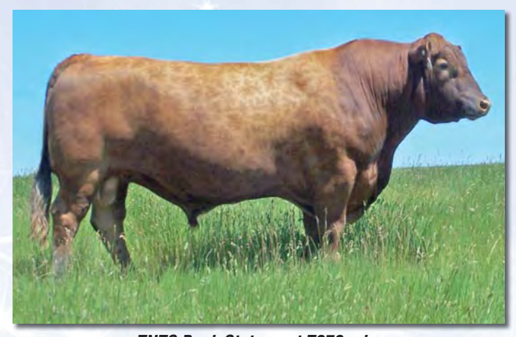
TNTS Bank Statement T272, sire

Broody, sound and attractive are all ways to describe this dark-red Drifter daughter. B413 exemplifies the type and kind we like to produce and we know she will work great in the show ring or in