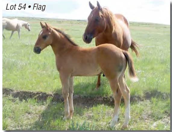
Lot 54 • Flag