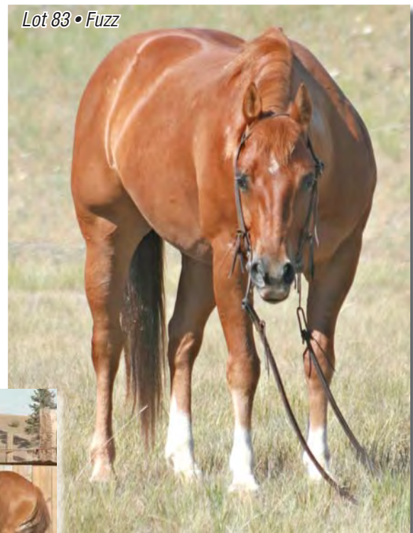
Lot 83 • Fuzz

Consigned by Turner Performance Horses • (406) 381-2347