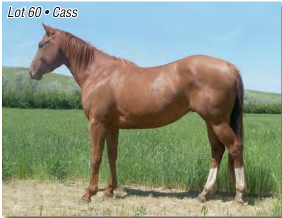
Lot 60 • Cass