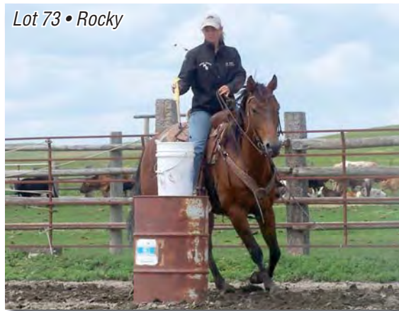
Lot 73 • Rocky