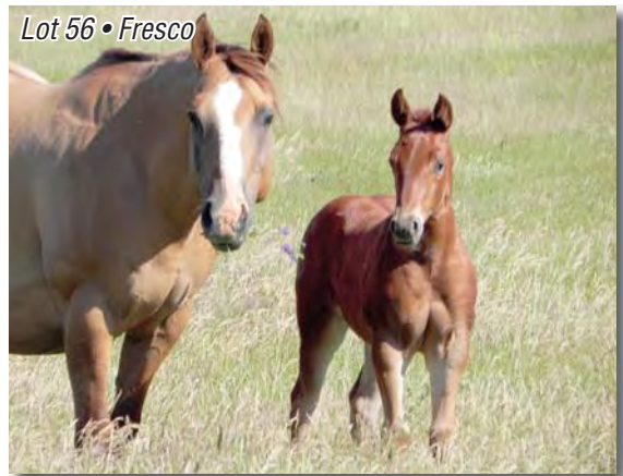
Lot 56 • Fresco