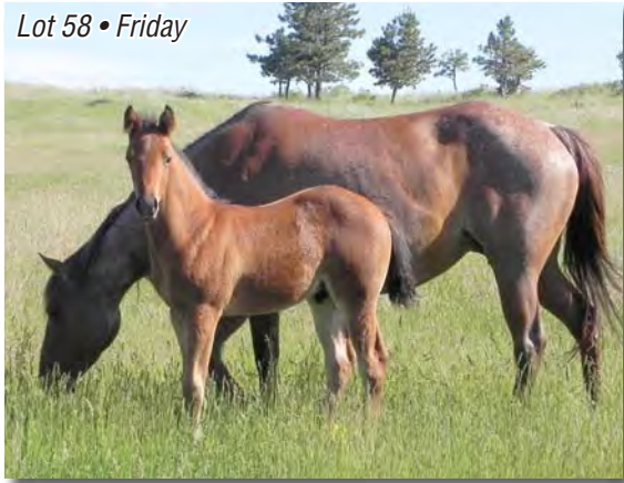
Lot 58 • Friday