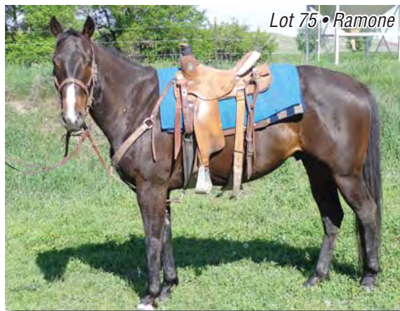
Lot 75 • Ramone