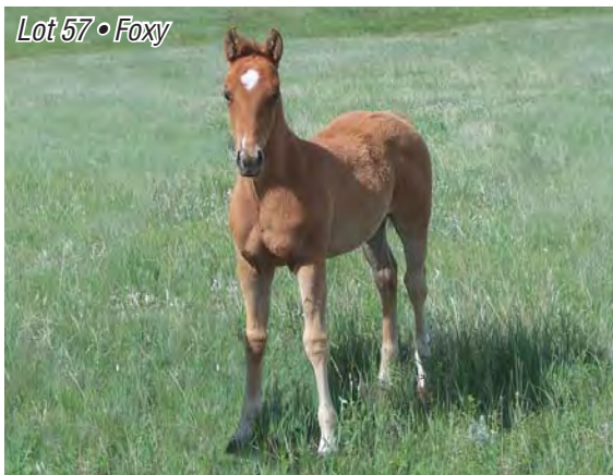
Lot 57 • Foxy