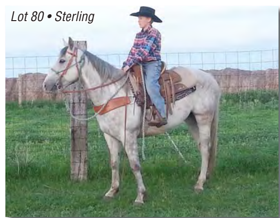
Lot 80 • Sterling