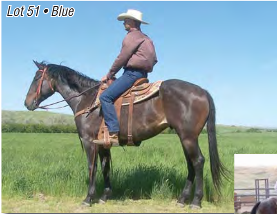
Lot 51 • Blue