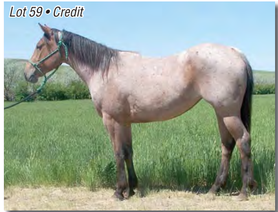
Lot 59 • Credit