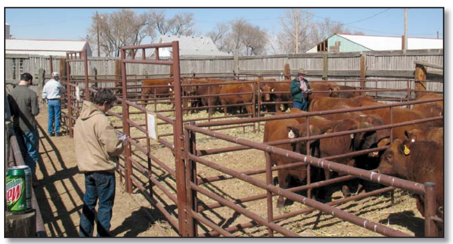
Finding the right ones!

(970) 590-4981 • (970) 222-6094 • (970) 301-3998 (970) 371-0214 • (804) 647-0127 • (816) 661-2289 • (435) 823-0829