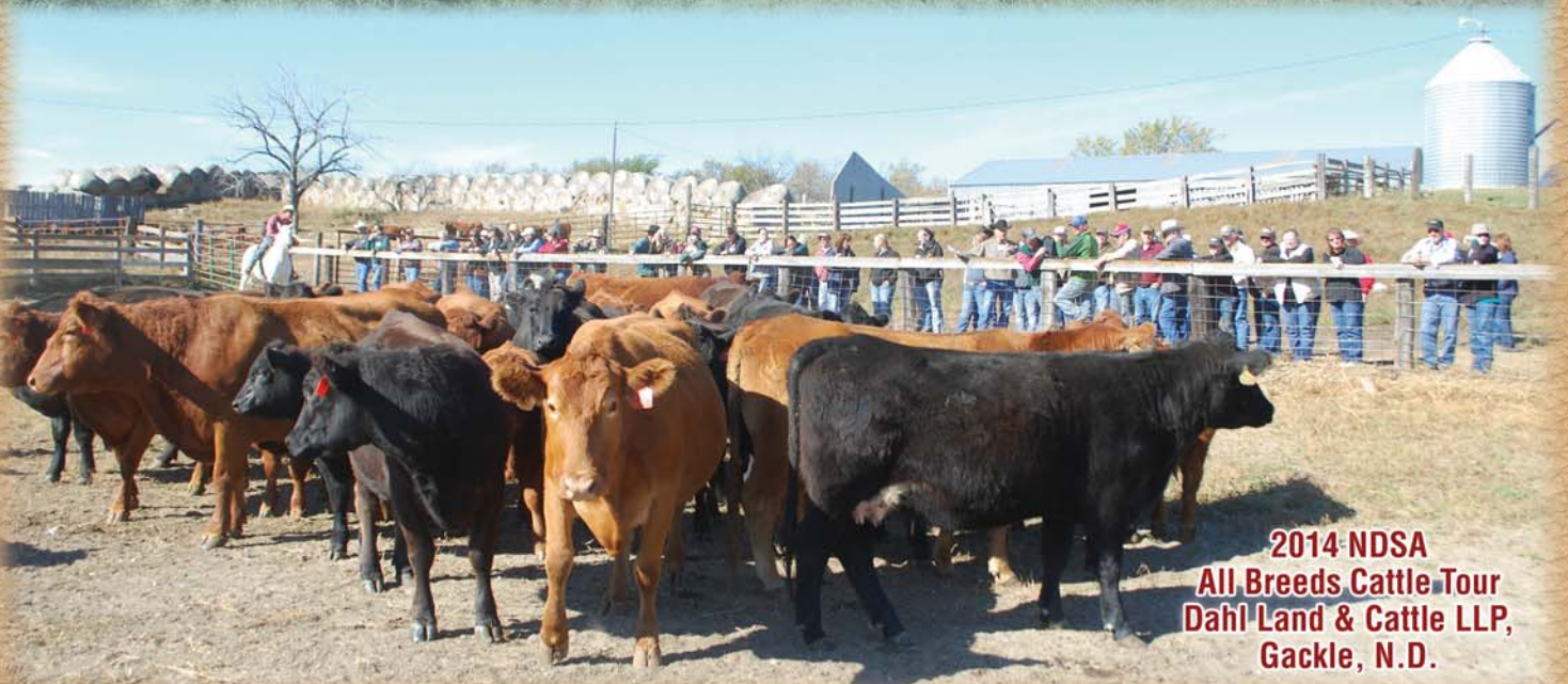
2014 NDSA All Breeds Cattle Tour Dahl Land & Cattle LLP, Gackle, N.D.