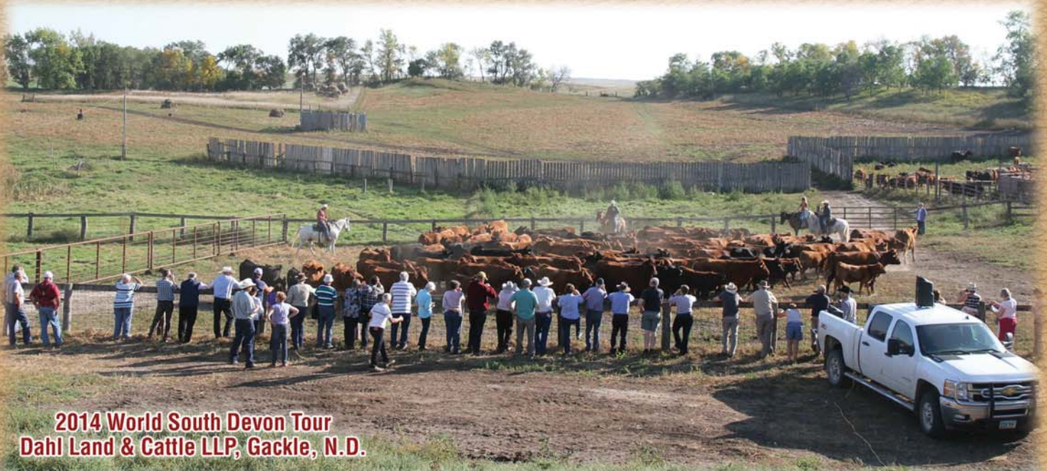
2014 World South Devon Tour Dahl Land & Cattle LLP, Gackle, N.D.