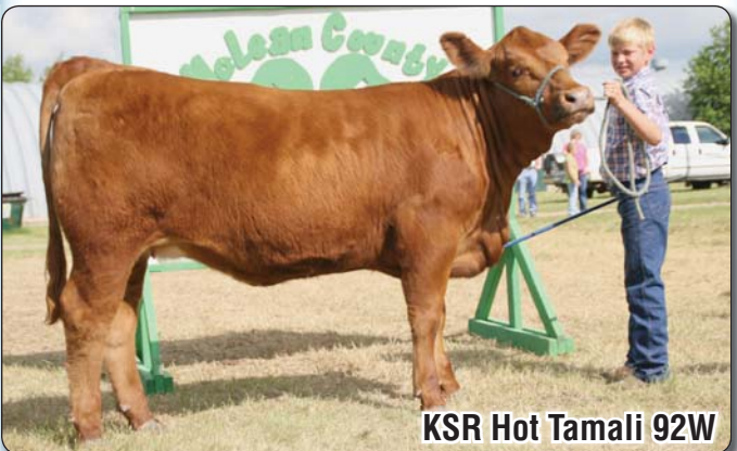
KSR Hot Tamali 92W