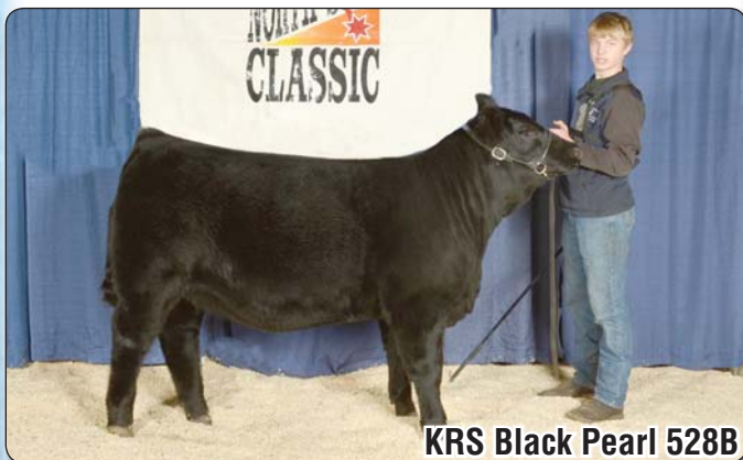
KRS Black Pearl 528B