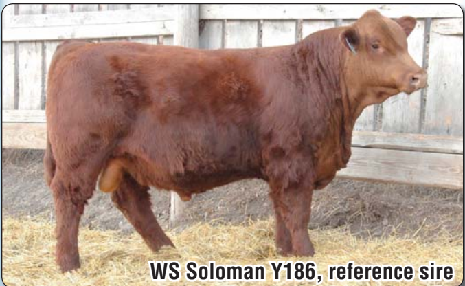
WS Soloman Y186, reference sire