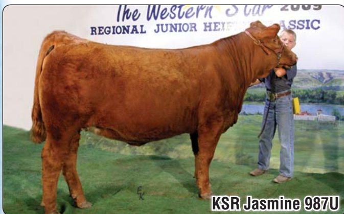
KSR Jasmine 987U