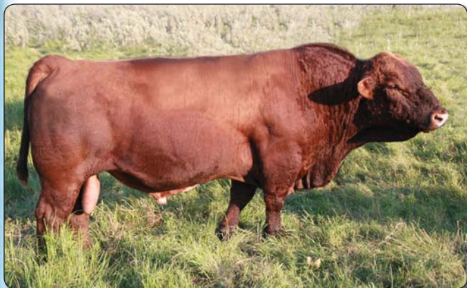
Mr Commandero, reference sire