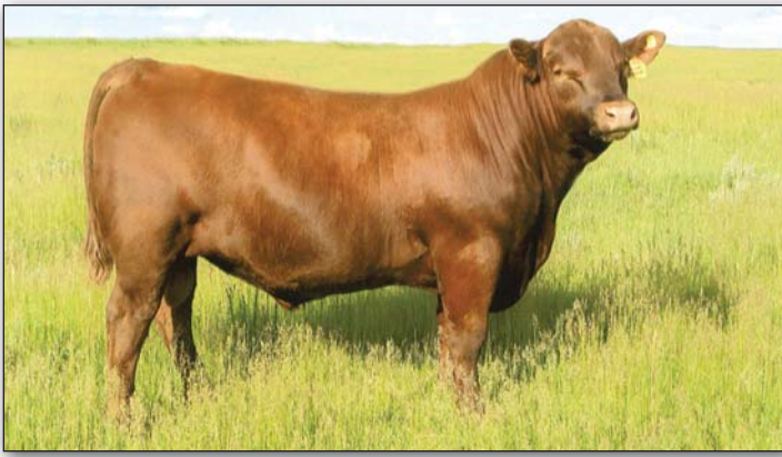
8001 Kuhn's Chey Bond