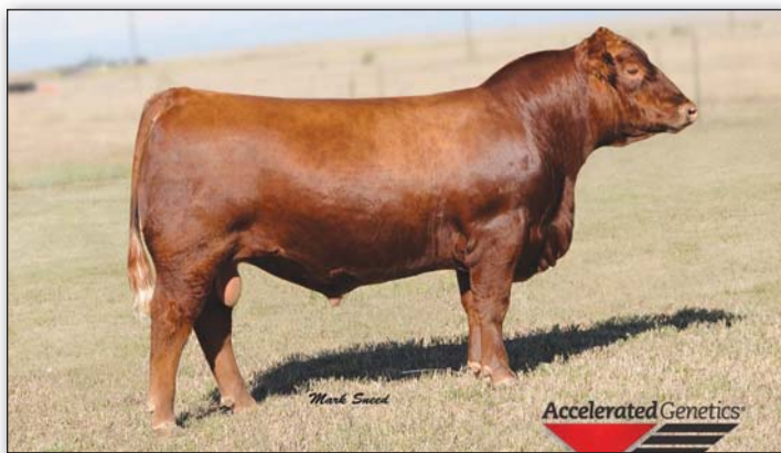
C-Bar Contour 107X