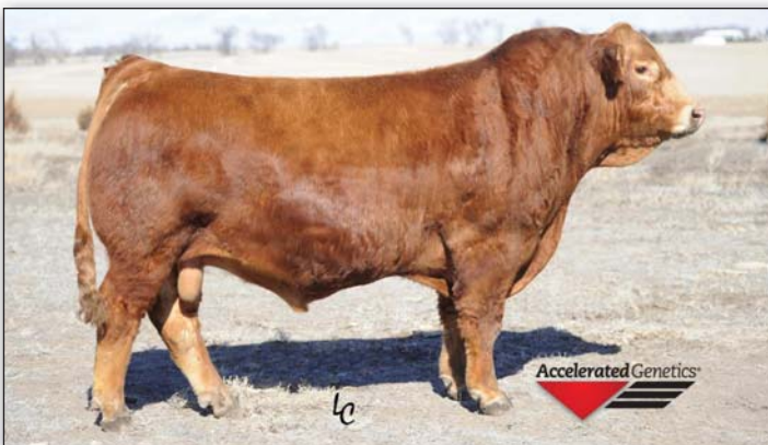
Ellingson Klondike Y123

L ELLINGSON KLONDIKE Y123 #2616685 BD: 2/1/11 PUREBRED POLLED RED BW: 96 WW: 926 WR: 116 YW: 1678 YR: 112 IMF: 2.56 RAT: 102 REA: 20.7 TI: 122 K WS BEEF MAKER R13 R ELLINGSON MS TEDDY U894 HOOKS SHEAR FORCE 38K DCR MS RIBEYE N72 WHEATLAND RED TEDDY 457P ELLINGSON POWERLINE P439