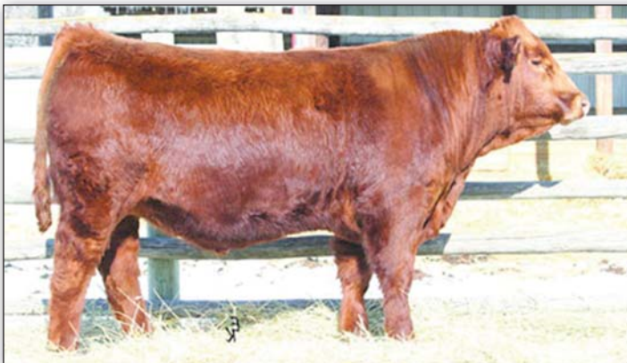
KS Sundance Kid S28

I KS SUNDANCE KID S28 #2353900 BD: 2/16/06 PUREBRED POLLED RED BW: 89 WW: 742 WR: YW: YR: IMF: 3.47 RAT: 100 REA: 14.0 TI: 100 K CNS DREAM ON L186 R KS SHANIA H871 NICHOLS LEGACY G151 CNS SHEEZA DREAM K107W MV RED LIGHT 406 BOZ MISS F578