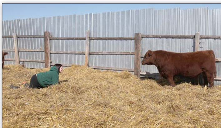
Stephanie, the bull whisperer, on picture day