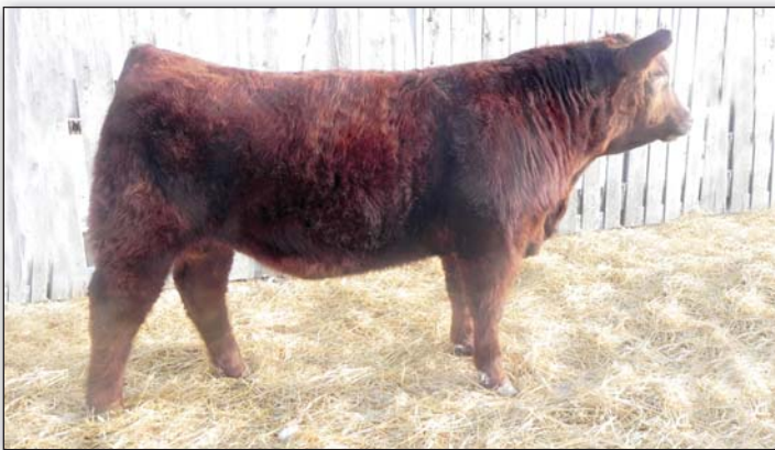
Red SVR Warrior 99X