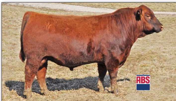
Andras Fusion R236