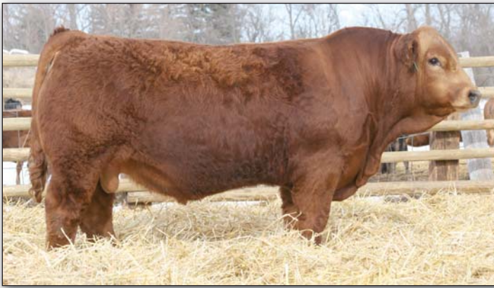
Ellingson Ideal 13X

H ELLINGSON IDEAL X13 #2563890 BD: 1/28/10 PUREBRED POLLED RED BW: 100 WW: 919 WR: 114 YW: 1751 YR: 114 IMF: 1.81 RAT: 82 REA: 18.7 TI: 116 K THSF FREEDOM 300N R ELLINGSON POWERLINE S681 BH TRACKER 998J SAFN MISS ZING 02H ELLINGSON POWERLINE P430 ELLINGSON LONG CUT N343