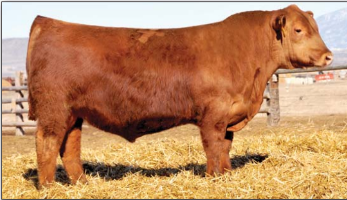
C-T Rio Grand 2044