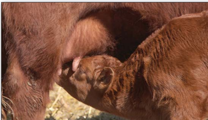
Udder on a Contour daughter