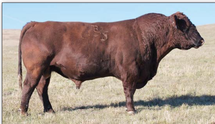
Larson Jubilee 155