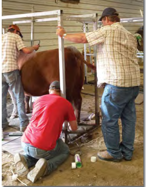
Fitting the Champion Heifer for Final Drive at South Dakota State Fair

Pasture exposed to SODAK FINAL ANSWER A504 (#1721587) from 5/30 to 10/15. Confirmed bull bred for May/June calf.