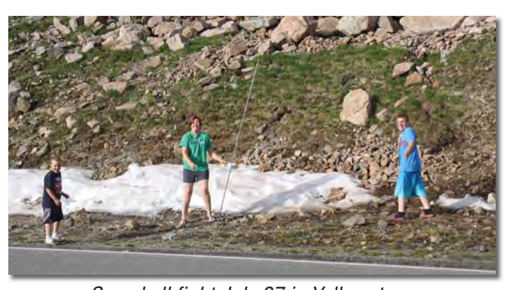
Snowball fight July 27 in Yellowstone