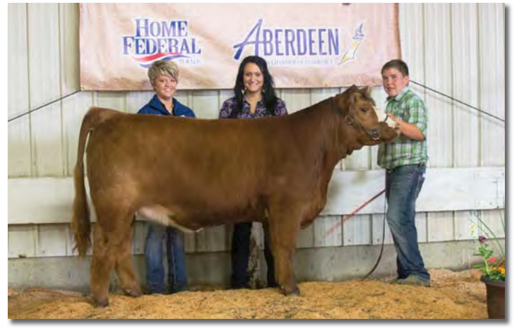
NPLD Champion No-Fit Heifer