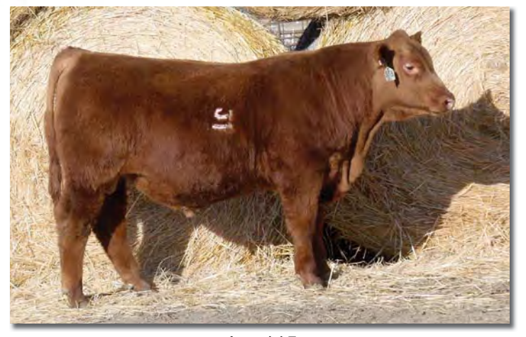
LAZYJ ACCENTUATE 565-9121

BD: 3/5/15 Tattoo: 565 LZYJ Cat: 1A 100% Reg. #1751987