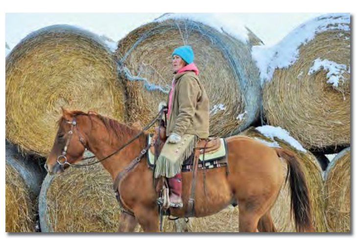
Steph on video day

SWWEEET! That's all that needs to be said!