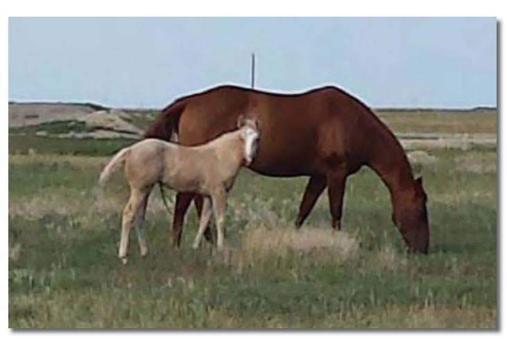
One of the 2015 foals

Here is one of two LimFlex bulls that are in the offering. They are out of my registered purebred Red An-gus cows and Treftz Limousin bull that offers a tremendous amount of power and growth. This bull calf may be young but has the length, power and maternal background to raise highly sought-after progeny. His dam provides an extreme amount of growth with WW and YW – both in the top 15% of the breed. Don't miss him.