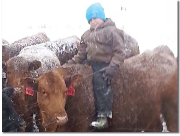
Just a boy and his show heifer