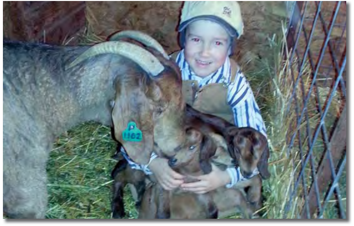
Brownie finally had three brown doe kids!