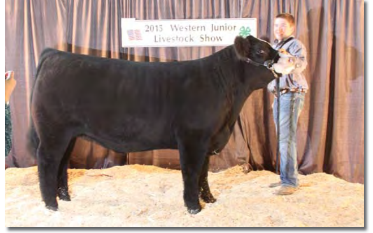
2015 Champ Live Futurity Steer at Western Jr