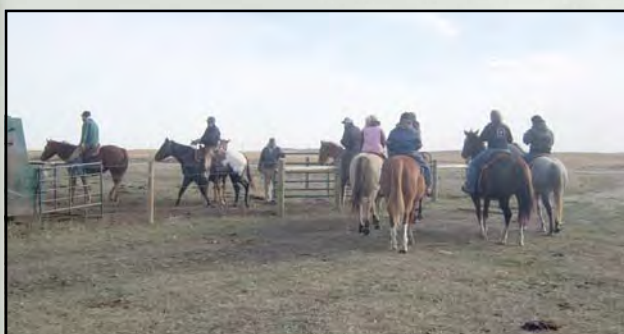
Fall round-up underway