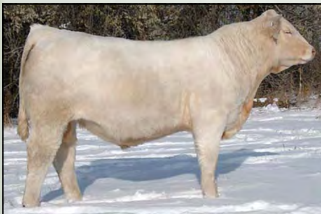
LT Next Stage 3238

A bull we purchased from LT Ranch. He sires clean headed and well made calves that perform well.