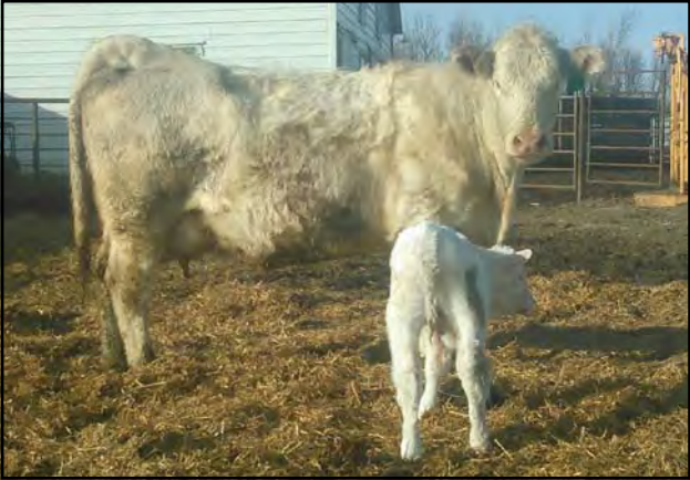
Top Shelf daughter with her second calf.

Fancy, functional and full of quality describes these open heifers. Almost all are Top Shelf influenced. Three are out of proven brood cows and two are out of very good first-calf heifers. These are our five youngest heifers out of our replacement pen. It's pretty rare that we let go this many Top Shelf daughters – they make productive females.