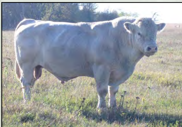
JAB Top Shelf 690 Polled

This bull has done all what has been asked of him to do for us. His bulls have performance, haircoats, style with eye appeal. The progeny sired by his sons have been topping the markets. His daughters are making highly productive cows with great udders.