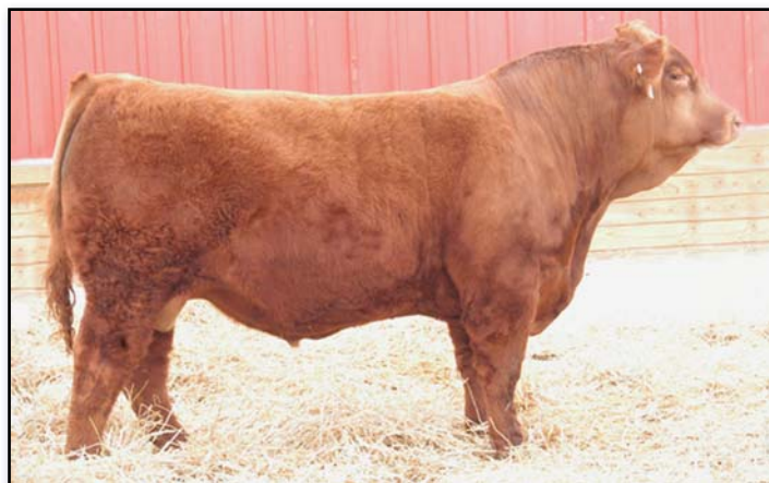
TRAXS Rushmore X103

A well-balanced, thick-topped son of Trojan V4001. His full brother had our heaviest weaning weight this past year and sells as Lot 40.