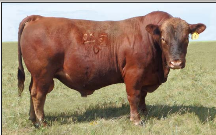
GMRA Bravo 3276