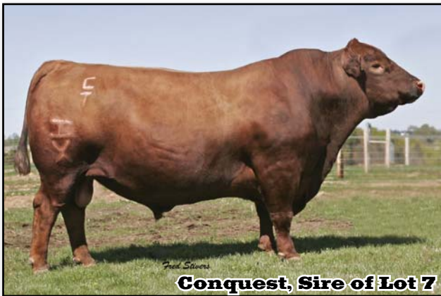
Conquest, Sire of Lot 7