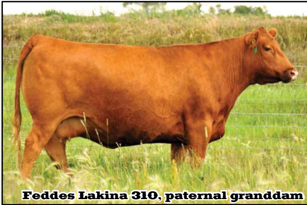
Feddes Lakina 310, paternal granddam