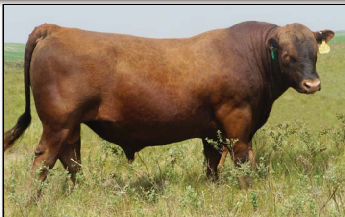
Feddes Eagle A202