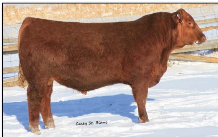
DKK Grand Duke 351

In 2014, Eagle was our pick at the Feddes and C-T Red Angus bull sale. His sire was their 2011 high-selling bull and his dam has produced many of their high sellers. Eagle is a maternal brother to Feddes Big Sky R9 and Feddes Big Horn Z150. His calves have tremendous growth with excellent maternal potential. We are excited to see his daughters down the road.