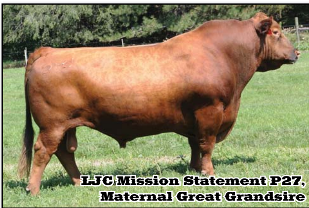
LJC Mission Statement P27, Maternal Great Grand sire