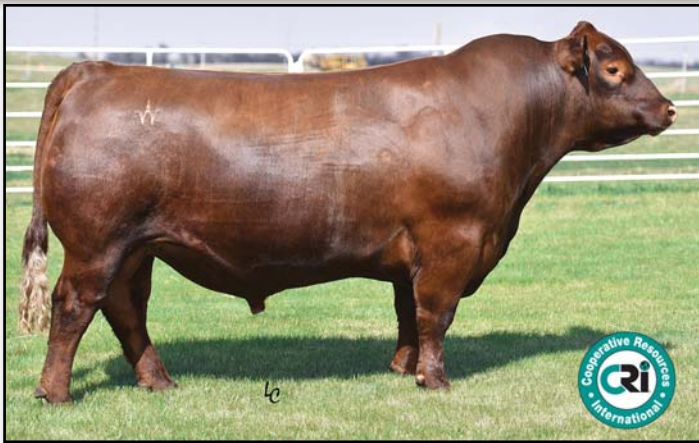
Andras New Direction R240