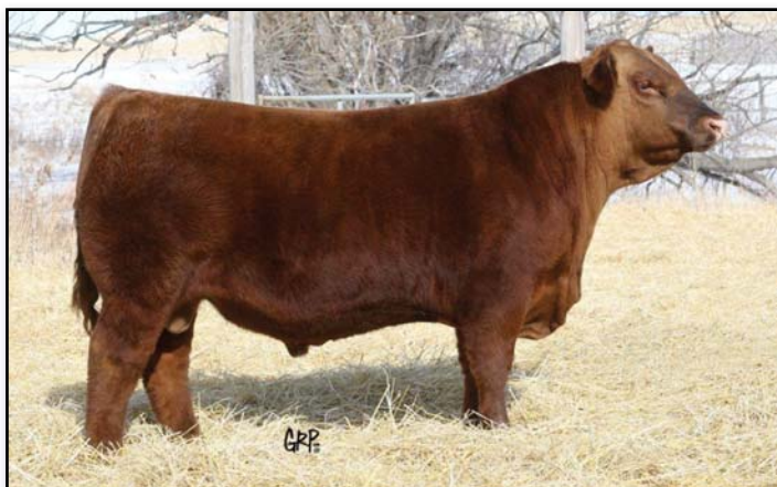
Six Mile Game Face 164Y

Conquest has been one of Accelerated Genetics' most widely used Red Angus bulls. His daughters are really starting to shine. He offers a unique package of depth of body, thickness and excellent calving ease.