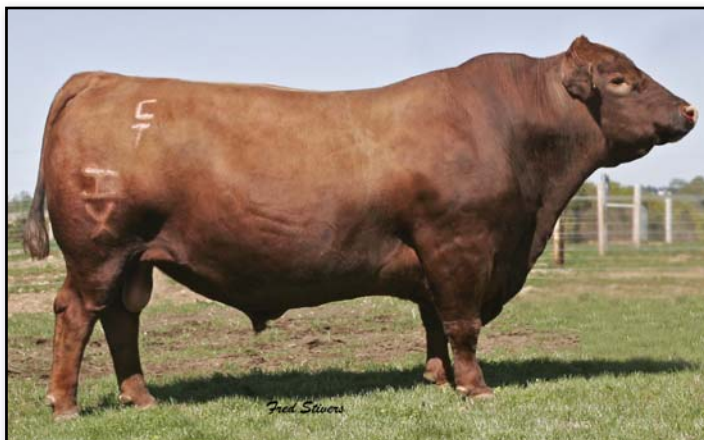
HXC Conquest 4405P

Bravo was the 2014 high-selling bull at Green Mountain Red Angus. He adds a lot of depth and thickness of body to his calves with keeping a moderate frame. His bull calves look really good and his heifer calves look even better.