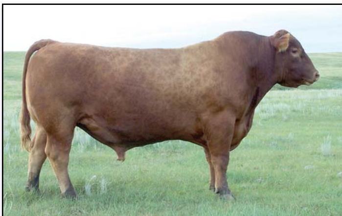
NS Bronson X079

Nexus was the top-selling bull in the 2012 Silveiras Angus sale in California. He is an outstanding Mission Statement son that is from a very strong maternal cow family. He adds a lot of length and capacity to his calves.