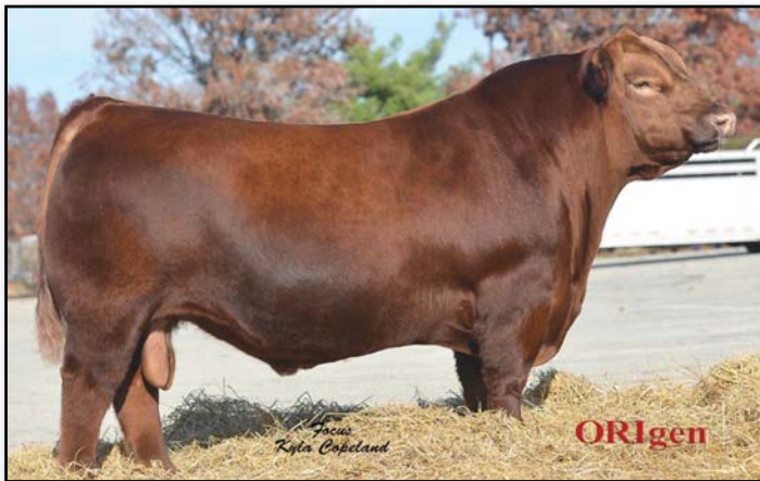
Silveiras Mission Nexus 1378

New Direction is a bull we AI'd some of our heifers to with great results. He offers a new outcross pedigree. His grandsire, Mytty In Focus, is a calving-ease and maternal bull that has been used very heavily in the Black Angus.