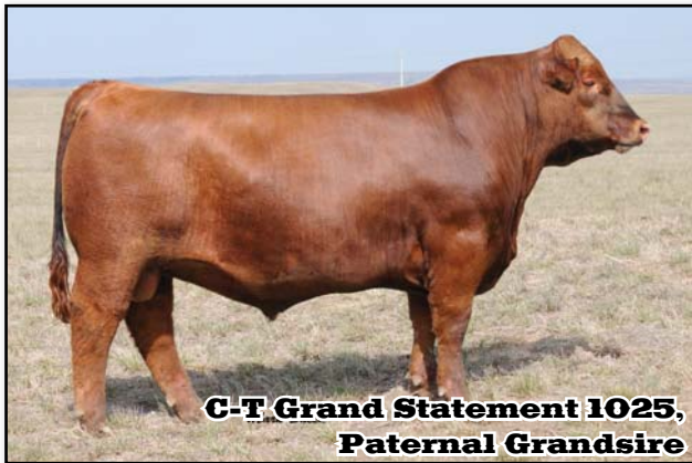
C-T Grand Statement 1025, Paternal Grand sire