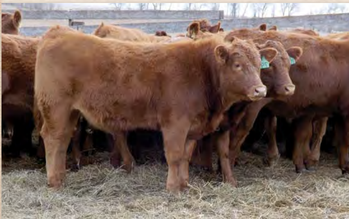
F1 steer calves born in April and weighing 626 lbs. off the cow with no creep feed, have sold at the market top the past five years.

Maternal Weaning Weight EPD (pounds) is a combination of Milk and Weaning EPDs and estimates the genetic merit of the animal to produce a calf at weaning.