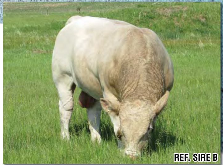
REF. SIRE B

This new, powerful, deep ribbed, deep quartered Canadian bred herdsire is really long with a quiet disposition and great performance. His sons are among our top gaining sire groups – most over 4#/day.