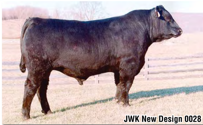
JWK New Design 0028

He's a low birthweight son of our foundation Angus bull New Design 0028.