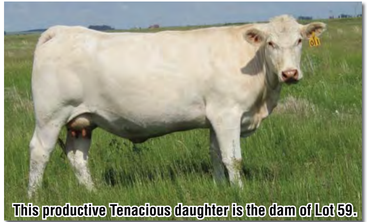
This productive Tenacious daughter is the dam of Lot 59.

It's been a few years since we had McHenry sired bulls in our sale. McHenry has become a very influential sire in the Key Ranch program - many of our top producing cows are his daughters. 71C is long bodied, correct, and very eye appealing.