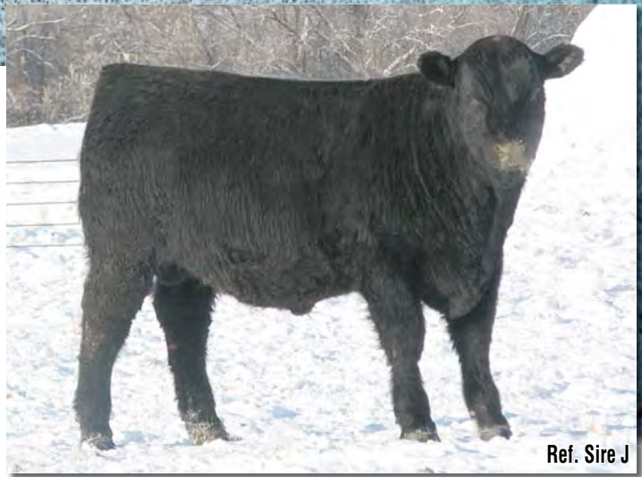
Ref. Sire J

Big time growth EPDs and lots of soundness and longevity in this purebred bull. His modest birthweight calves really grow. He has an outcross purebred pedigree for most Salers herds.