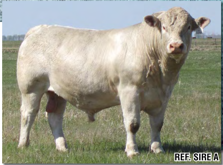
REF. SIRE A

Maximizer is our impressive new herdsire with tremendous calving ease numbers that has left us with a first calf crop that is truly on the mark. Both heifer and bull calves come easy, have excellent growth and a terrific look. Big time numbers and a TT for Leptin!