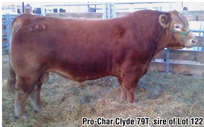
Pro-Char Clyde 79T, sire of Lot 122

He's one of the few Clyde sons in our offering this year. This calf posted an impressive 870# WW, and has continued at 4.5 ADG on our 88 day interim test.