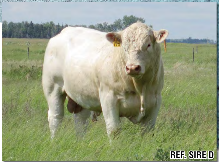
REF. SIRE D

This long sided, Bronson 2U son out of the predictable Meg cow family shows tremendous stretch in his high performance calves. We expect his daughters will really milk and bulls are consistently gaining over 4#/day and most are TT and AA for Leptin and PMCH. You have got to like their look!