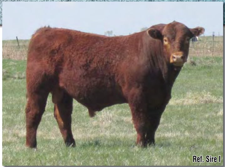
Ref. Sire I

Monument is a very well made, well balanced, good headed bull that really stamps his calves with a great look and excellent performance. He is a TT for Leptin and AA for PMCH.