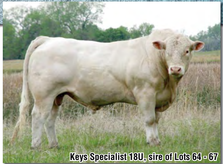
Keys Specialist 18U, sire of Lots 64 - 67

A stylish, well made son of our proven and still going herdsire Specialist. He will be eight this year and is still producing offspring that excel in good looks, soundness, muscle design and expression.