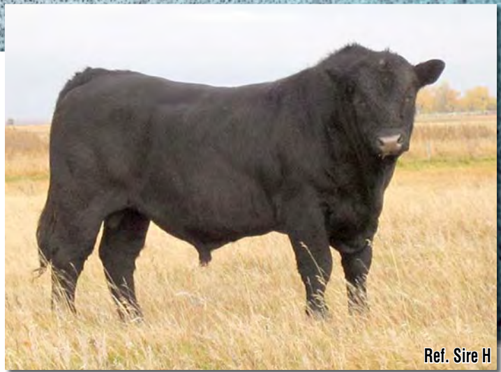
Ref. Sire H

He is the #1 performance bull in the Salers breed with all the markers. He is homozygous black, homozygous polled and also homozygous for good disposition!