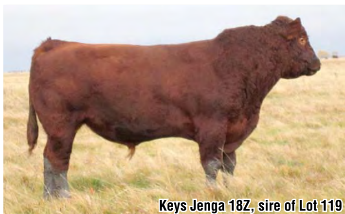
Keys Jenga 18Z, sire of Lot 119

Here is one of our composite bulls carrying all of our desirable DNA markers and is also one of our high gaining bulls.