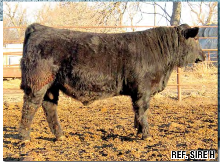
REF. SIRE H

Direct Fire sires moderate, easy fleshing bulls and females with tremendous carcass characteristics with good balance and performance. His sons had an average IMF ratio of 134 and 119 the last two years. His calves are above average for weaning weight and ADG and he is a moderate birth weight sire.