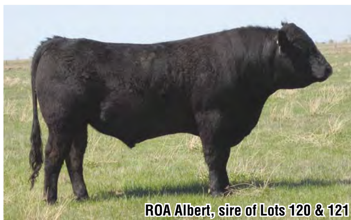
ROA Albert, sire of Lots 120 & 121

He's a quarter Charolais black bull whose mother produced a top seller last year at $6250.