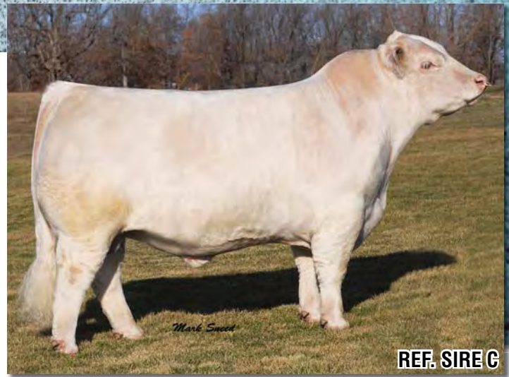
REF. SIRE C

A full brother to last year's high seller that went to Rosenow Ranch for $13,000 and this calf is a spittin' image. Gaining 4.55#/day, out of All State, he is powerful in his makeup, stout and proud in his design, TT and AA for his leptin and PMCH score. Retaining 1/4 interest.