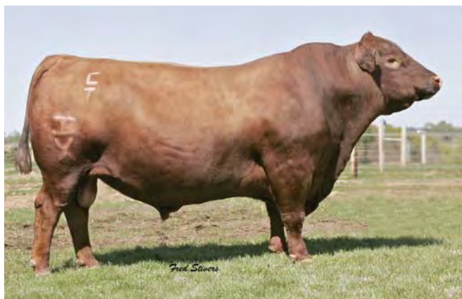
HXC Conquest 4405P

X28 sold in our 2011 sale. ABS purchased him after seeing two calf crops. His EPD profile improves with each calf crop. He is now in the top 6% HB, GM 6%, CED 5%, BW 15%. He covers all the bases, and is very balanced. His dam and grandam are two of our best donor cows that have walked our pastures.