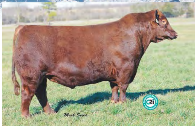
Brown JYJ Redemption Y1334