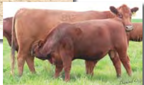
Feddes Blockana Y83, dam