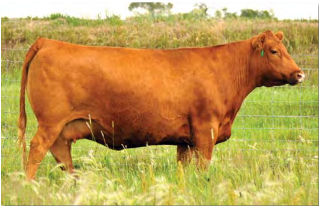
Feddes Lakina 310