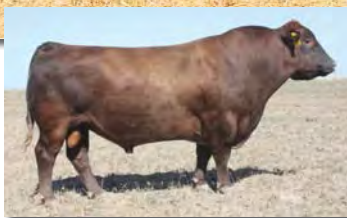
Red Crowfoot Ole's Oscar, maternal grandsire

BULL Birthdate: 1/27/15 Reg. # 3471552 Category 100% 1A Act. BW: 71 205-Wt: 783 365-Wt: 1328 Adj. IMF: 4.05 Adj. REA: 14.2 SC: 37.0 BECKTON NEBULA P P707 BROWN JYJ REDEMPTION Y1334 JYJ MS JOLENE W16 RED CROWFOOT OLE'S OSCAR C-T VERDI 1030 CTDB VERDI 904 BECKTON NEBULA M045 BECKTON LANA M809 EP LJC MISSION STATEMENT P27 HXC JOLENE R548 MLK CRK CUB 722 RED CROWFOOT OMEGA 9179J LMB ELWAY 938 FED'S VERDI 5150