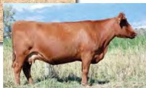
C-T Blockana 1042, dam