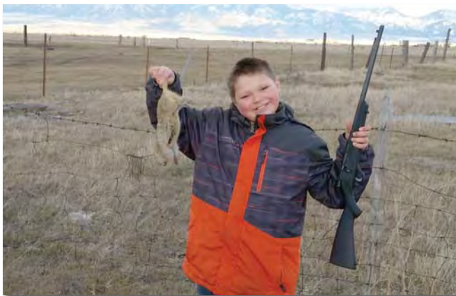
First gopher, second shot, my very own .22 – Yeah Baby!