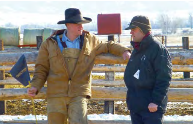
Videoing the bulls