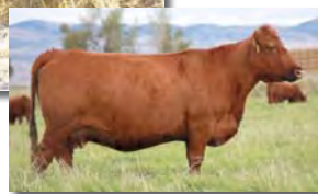
Feddes Sleek 806, dam