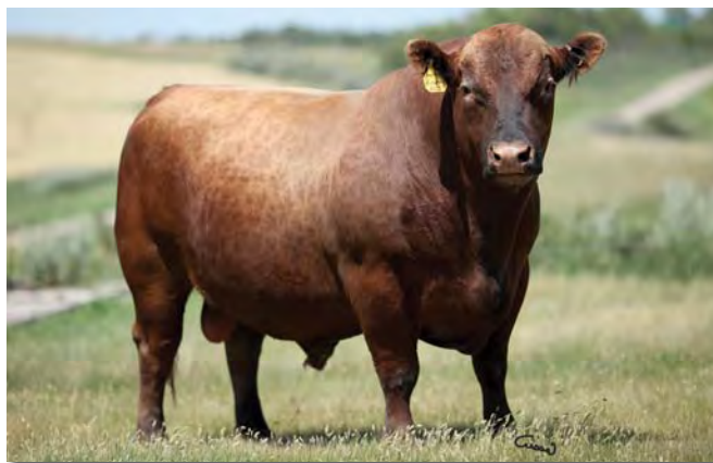
Feddes Granite Z132

Make Mimi is a very proven bull that we have used for many years. His daughters have risen to the top in many herds and his sons are calving ease with very good carcass traits.