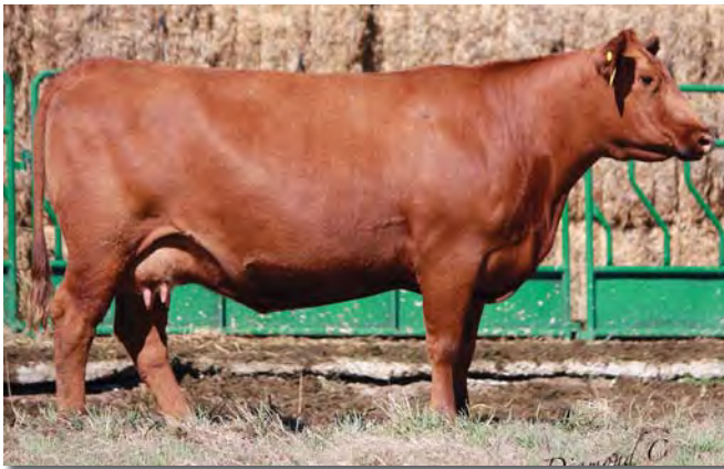
C-T Miss Pan 0954, dam