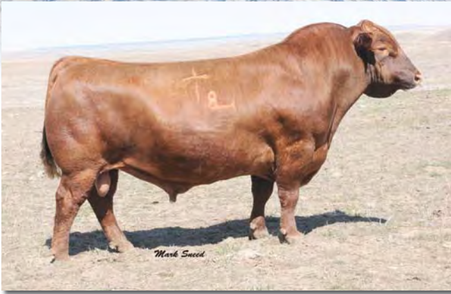
Beckton Epic R397K