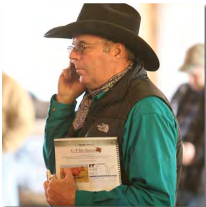
Loves talking bulls.