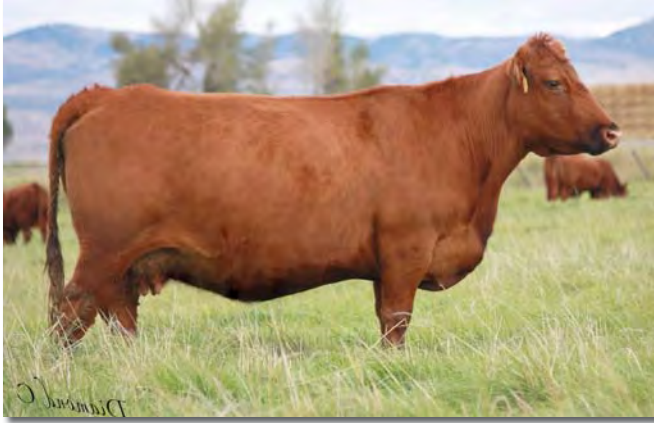
Feddes Sleek 806, dam