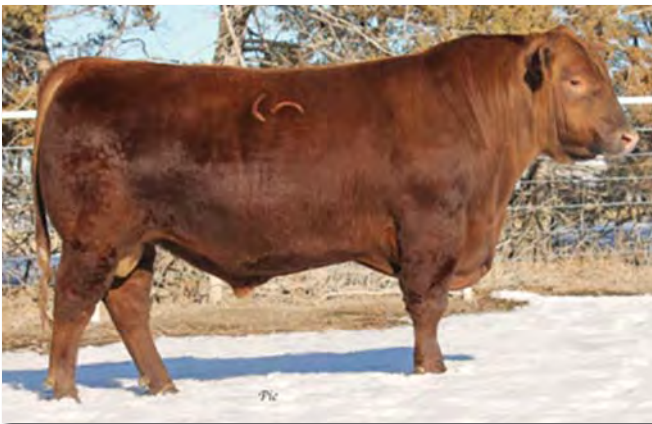
LSF Saga 1040Y

Y34 is a Conquest son with exceptional calving ease along with a little more BW and considerably more growth. His daughters have some very top end sons in this sale offering.