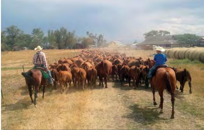
Bringing the ladies home