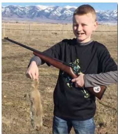
Gopher – It's what's for dinner!

BULL Birthdate: 1/21/15 Reg. # 3469662 Category 100% 1A Act. BW: 69 205-Wt: 695 365-Wt: 1209 Adj. IMF: 4.86 Adj. REA: 13.9 SC: 37.0