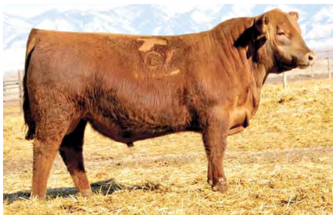
Feddes Big Horn Z150