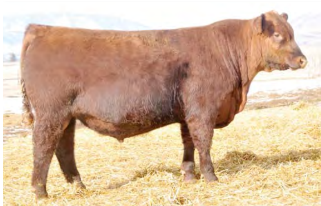
Feddes Oscar X28

He is a great calving ease sire from Genex that is siring some very consistent calves. He comes to the top in many traits, which we are seeing in his offspring.