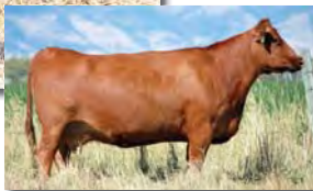
C-T Larkaba 0733, dam

BULL Birthdate: 1/28/15 Reg. # 3471579 Category 100% 1A Act. BW: 78 205-Wt: 737 365-Wt: 1262 Adj. IMF: 4.87 Adj. REA: 14.7 SC: 42.0