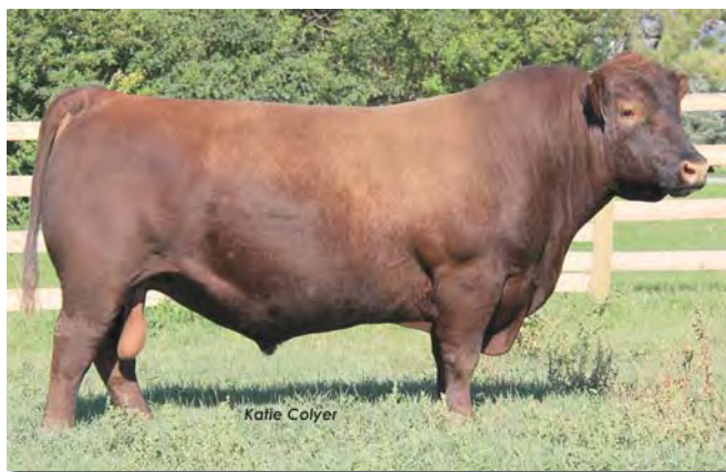
Feddes Montana X44

He is a real calving ease Conquest son that sires a lot of thickness and marbling. He is a maternal brother to Feddes Big Sky R9. His first daughters look really good.