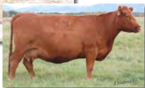
Feddes Blockana 8104, dam