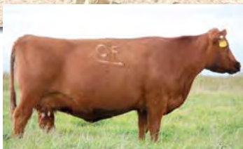
Feddes Lass 7150, dam

BULL Birthdate: 2/6/15 Reg. # 3469696 Category 100% 1A Act. BW: 78 205-Wt: 776 365-Wt: 1337 Adj. IMF: 4.49 Adj. REA: 14.0 SC: 40.0 BECKTON NEBULA P P707 BROWN JYJ REDEMPTION Y1334 JYJ MS JOLENE W16 FEDDES BIG SKY R9 FEDDES LASS 7150 FEDDES LASS R51 BECKTON NEBULA M045 BECKTON LANA M809 EP LJC MISSION STATEMENT P27 HXC JOLENE R548 BIEBER MAKE MIMI 7249 FEDDES LAKINA 310 5L NORSEMAN KING 2291 FEDDES LASS 019