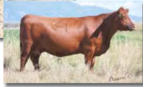
C-T Linsey 0964, dam