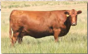
BUF CRK Marigold L231, maternal grandam