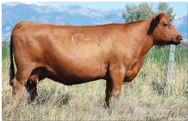
C-T Tina 0946, dam