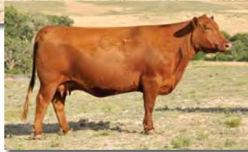
C-T Tina 0972, dam