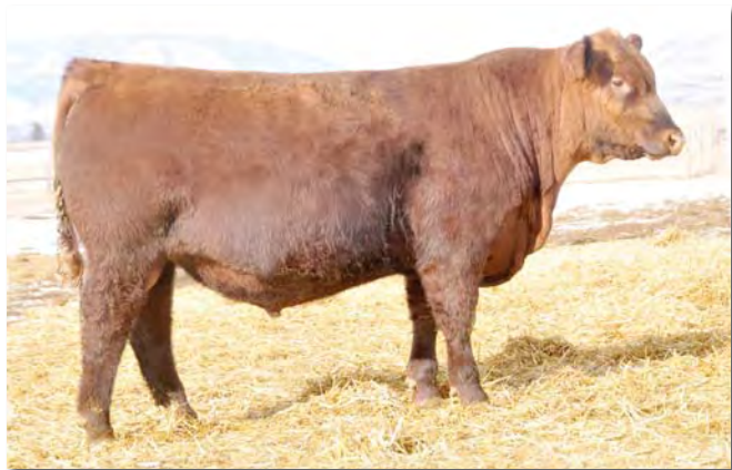
Fettes Oscar X28, sire