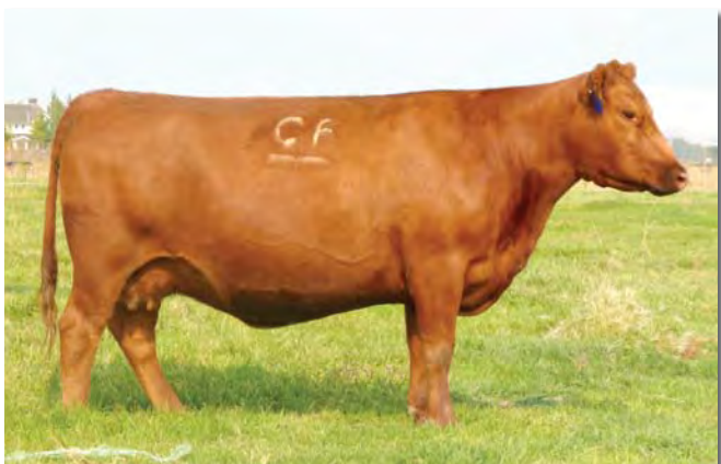
Feddes Blockana 7112, dam