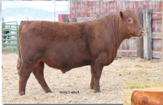
Lot 25 BUF CRK Marigold L231, maternal grandam