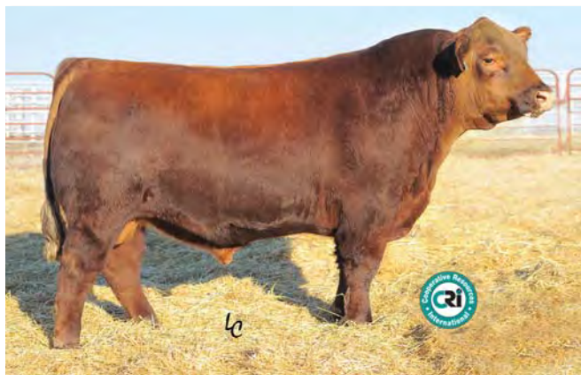
Andras New Direction R240

He is a great maternal calving ease sire from Accelerated Genetics that is siring a very consistent calf crop, with sons and daughters alike coming to the top of the herd.