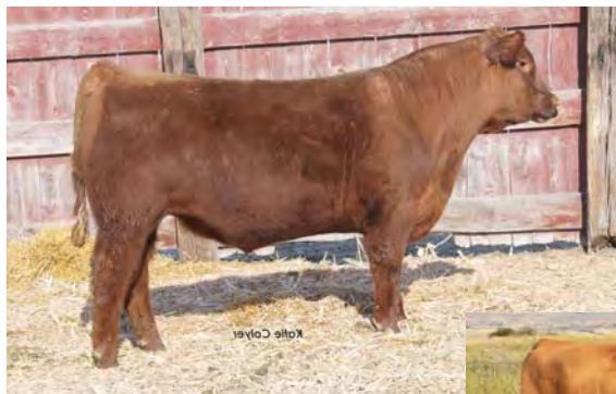
Lot 28 Feddes Lakina 453, dam