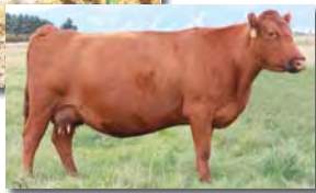
Feddes Blockana 821, dam