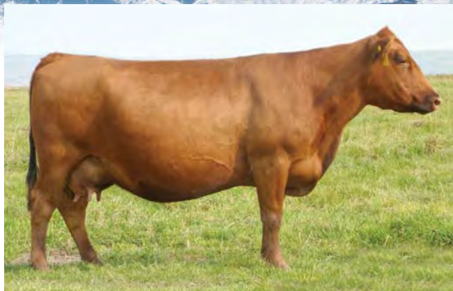
Feddes Blockana R98, dam