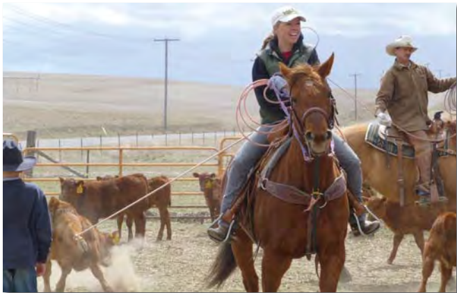
Draggin' one to the fire