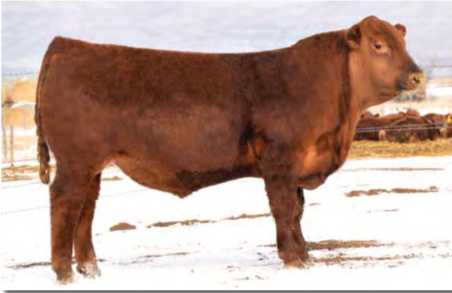
C-T Grand Design 3023

Epic is an ABS bull that sires a lot of growth, fertility and carcass values in a moderate frame.