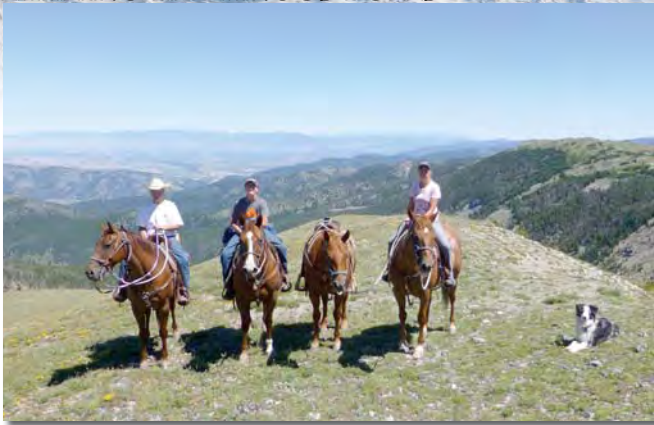
On top of the world