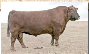
Bieber Make Mimi 7249, maternal grandsire