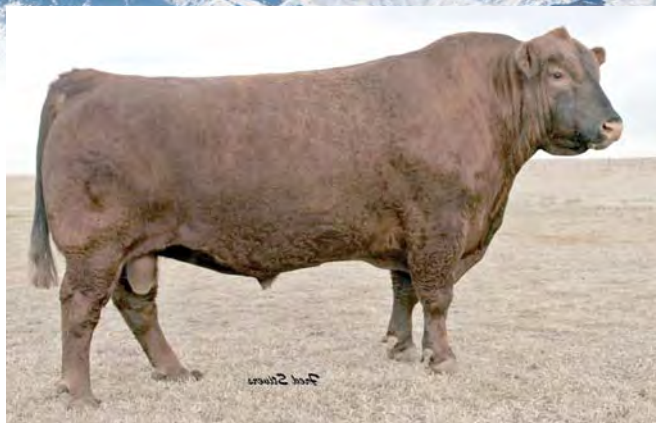
Bieber Make Mimi 7249