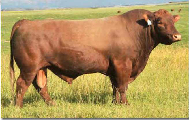
BUF CRK The Right Kind U199