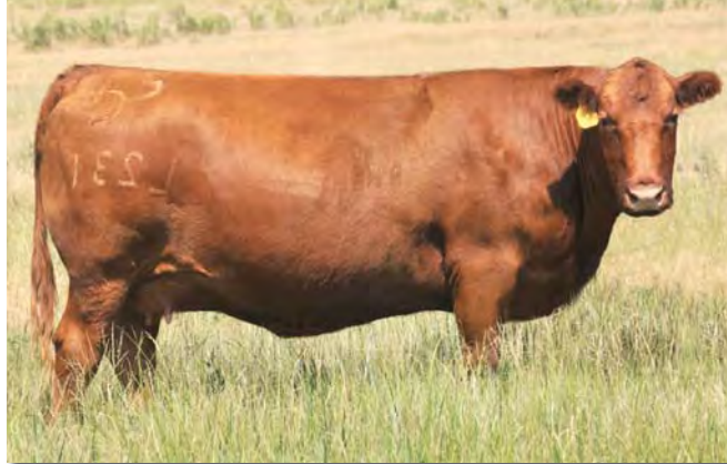
BUF CRK Marigold L231, dam