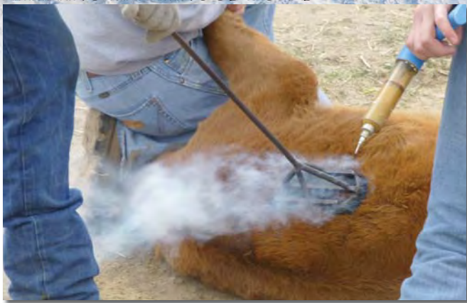
C – T Brand