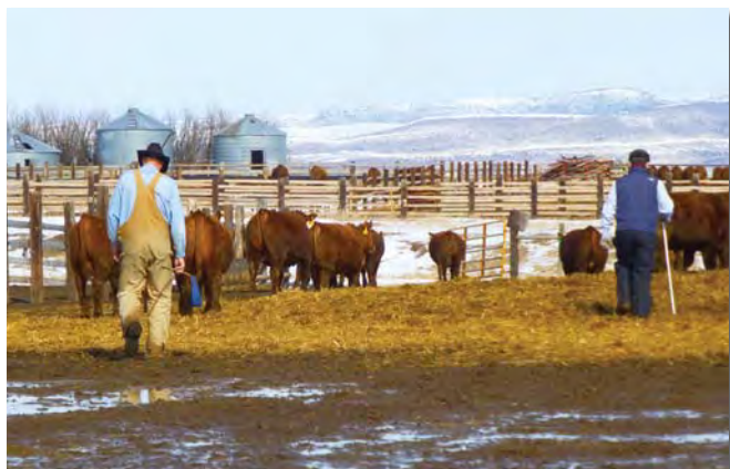
Working the bulls