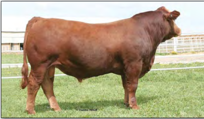
LBR Crockett R81

J LBR CROCKETT R81 #2288554 BD: 2/14/05 PUREBRED POLLED RED BW: 102 WW: 852 WR: 100 YW: 1643 YR: 100