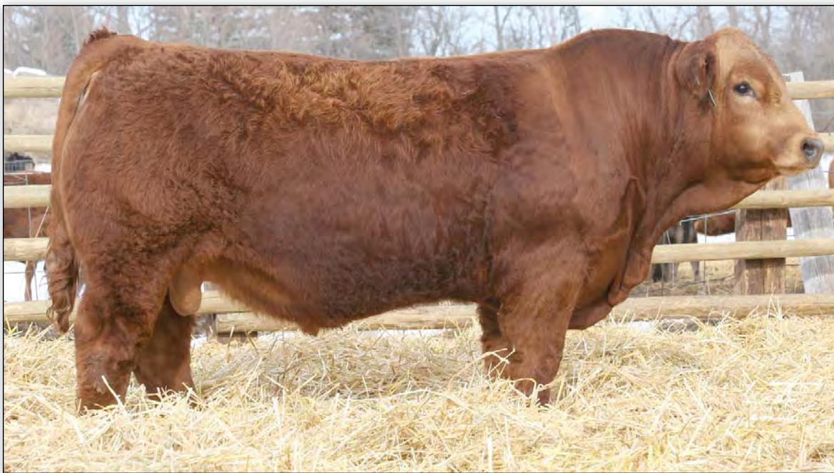
Ellingson Ideal 13X