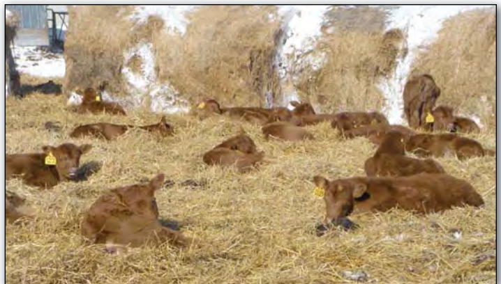
Soaking up the sun!