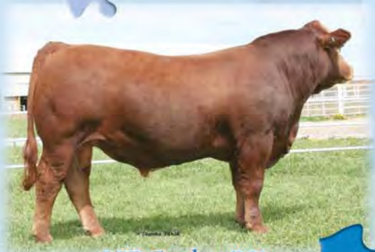
LBR Crockett R81

to produce more profit for your bottom line!