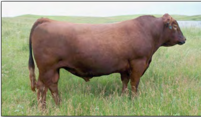
LSF High Yield 8088U