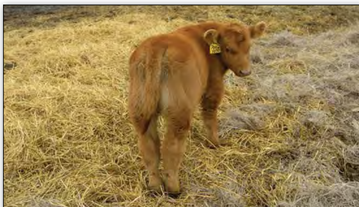
Watch for this Envy son in next year's sale!