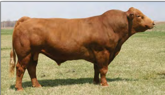
WS Beef Maker R13

M DAVES R S 630 #2372300 BD: 3/19/06 PUREBRED POLLED RED BW: 91 WW: 782 WR: 101 YW: 1293 YR: 103