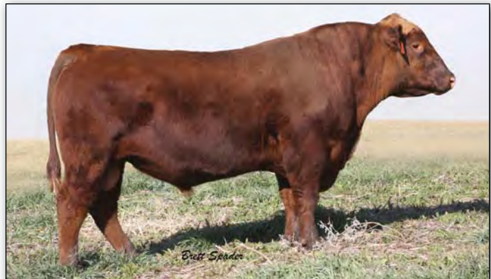
Schuler Envy 7342T

Schuler Envy 7342T offers the power of a Norseman King with a +0 CED. Backed by an Enterprise x Ladies Man dam with an outstanding 107.7 MPPA, impressive individual performance ratios 94 BW, 100 WW, 111 YW, 117 %IMF and 114 REA. Some of his first daughters are calving at Wedel Red Angus and they have great udders and teats, good milk, good mothering ability and are easy keeping cows. We used Envy hard this year with an average BW of 83.8 lbs. ABS bull.