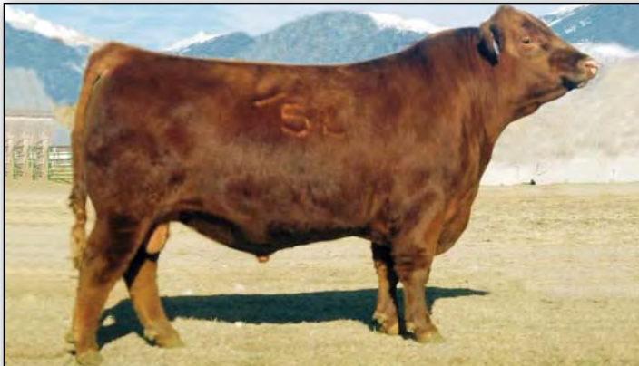
5L Tradesman 1715-6237