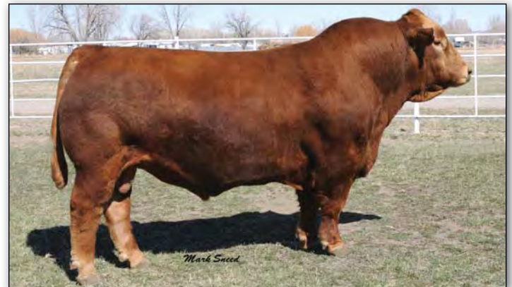
TNT Top Gun R244

L WS BEEF MAKER R13 #2289889 BD: 2/6/05 PUREBRED POLLED RED BW: 92 WW: 794 WR: 102