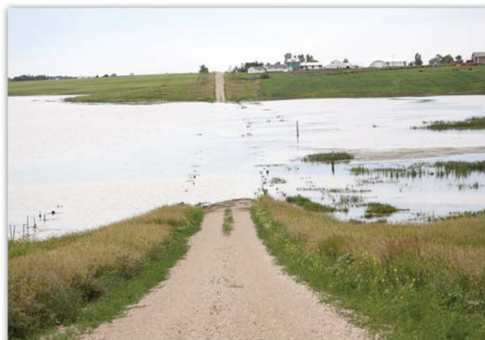
The road under water to the west ranch Lazy J Bar Ranch New Year's Eve Extravaganza