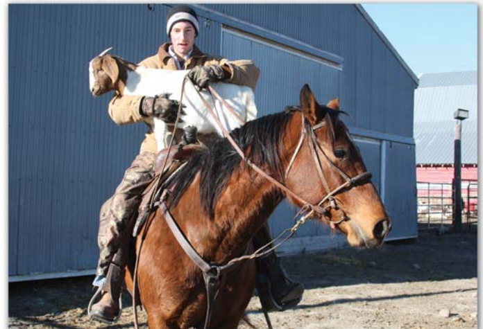
Our horses are "kid" broke!