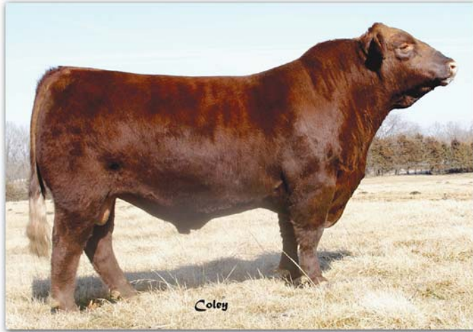
Coley's Mojito 503R