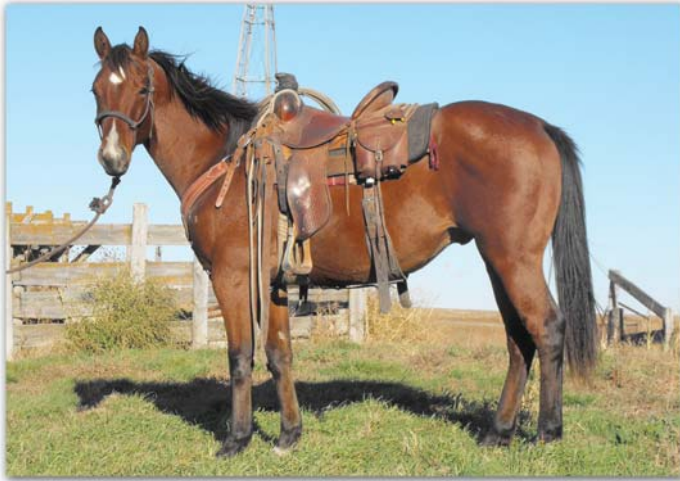
WY Clods Nu Drifter