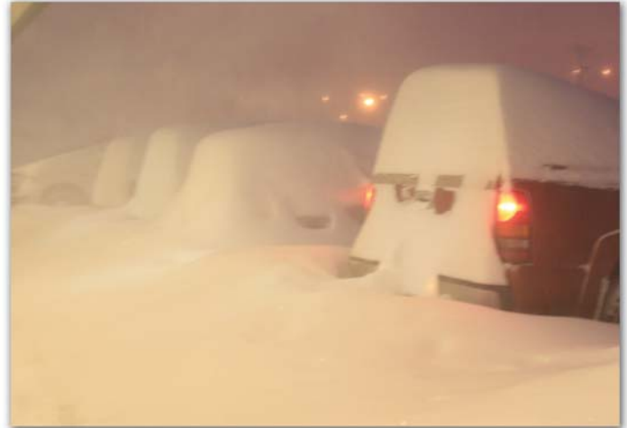
After last year's sale

Right now as you are reading this letter, I hope that you will join me in raising your hand above your shoulder and give yourselves a pat on the back. We have all survived this past year – from blizzard after blizzard, to droughts, fires and sever summer storms across the country. We also need to remember that we are so lucky to live the lives we lead involved in the agriculture industry. I was reading an article on a family the other day that stated how, as farmers and ranchers, we have so much faith and may not even realize it. We have faith that tomorrow will be better, we will get enough rain, that we can make it through another blizzard, drought or flood, that