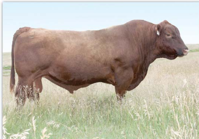
UBAR High Capacity 224