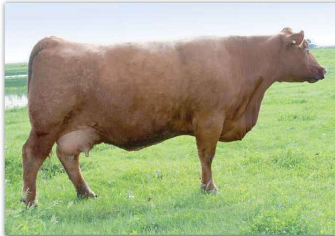
NER Copper Queen 2657, Donor Cow