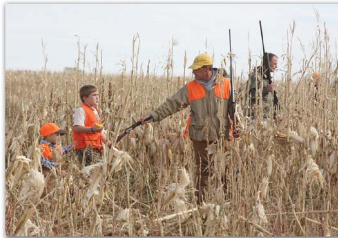
Fall hunting in South Dakota