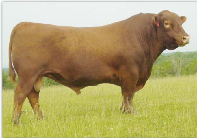
JDB Equals Thunder 302N