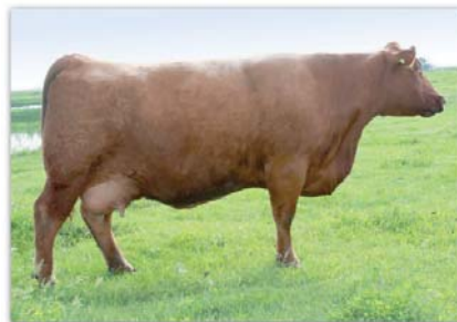
NER Copper Queen 2657

Guarantee one pregnancy if transferred by a certified technician.