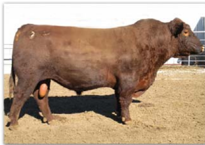
LJC Merlin T179

Ages 4 to 7. Pasture exposed to JDRA Mojito 753, reference sire D, from 6-1-11 to 8-2-11.