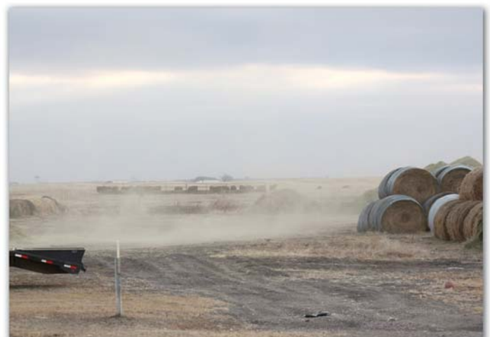
A wet spring to the driest fall on record