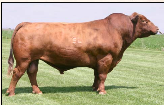
5L Norseman King 2291