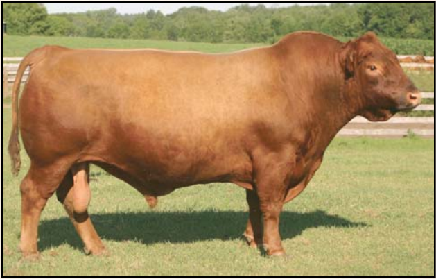
LCC Gravity B252L