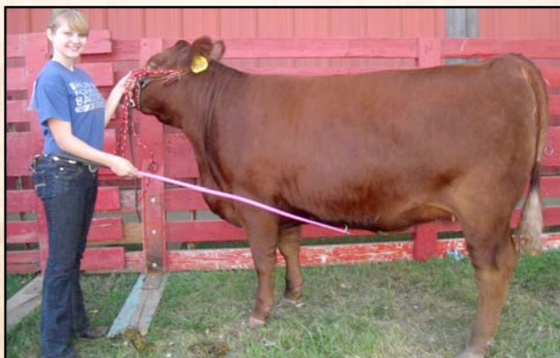
Lot 2's half sister

Printed by Quality Quick Print • Aberdeen, SD