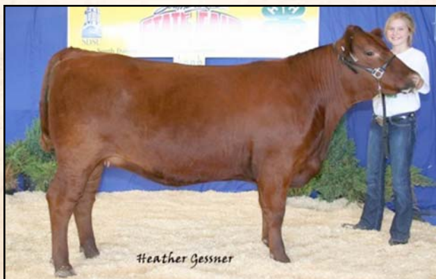
Lot 9's mother and Reserve Champion at SD State Fair in 4-H