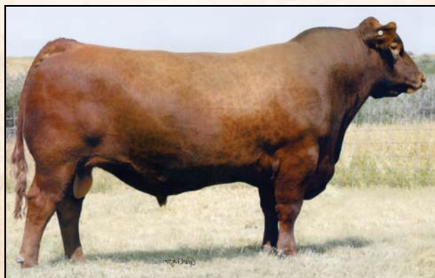
Red Fine Line Mulberry 26P

{ SILVEIRAS RED FORD { RED MC DOUGALL FAYETTE 59A