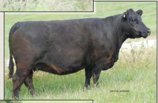
Isadora, Dam of Lot 22A embryos