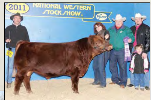
RLL The Fireman, service sire to Lot 30. He is sired by Vitulus Branded Red.

EBC Rossberg 710W XF10141 born 5/8/2009. Bred to RLL The Fireman XM9791, a red 3/4 bull sired by Branded Red.