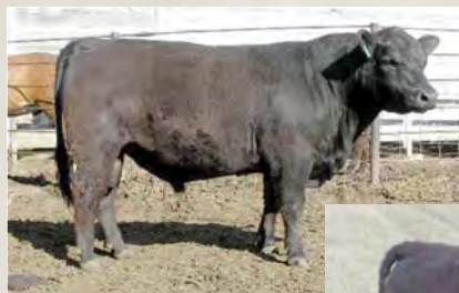
EZ Pete 14P, the sire of lot 19 and his dam 38J, pictured as an 11-year-old cow. Lots of longevity in this pedigree!

Her pedigree is a who's who of leading Australian herdsires...Midshipman, Rouseabout, Mugga Majura, Ardrossan Peter and firmly anchored to the great foundation sires in the 4th generation...Captain Planet, Commodore II, Admiral J222 and Commander K162. She's ultra fancy, a true donor prospect in the making.