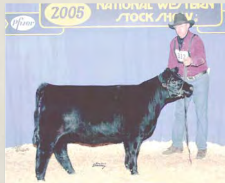
Bar J Nadine 3N57, 2005 National Champion Female. Her dam is a full sister to the dam of Lot 8.

She is bred to Kona Magic FM4572, due for a May 2011 calf. Her sire JJ Atlas is a full brother to JJ Rudy 1R, the 2006 and 2007 Reserve National Champion Bull that sold in 2007 at the National Sale for $15,000. Her dam, Bar J Nadine 9J33 is from the same cow family that produced the 2005 National Champion Female.