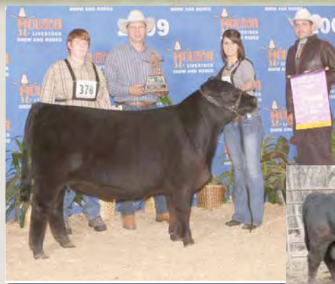
EZ Lacey 55T, dam of Lot 6

She is due for a May 19 calf by EZ Titan 7T FM6146. Velvet is a fantastic daughter of the 2009 Houston Grand Champion Female. Her sire's dam produced the 2005 National Champion Female. The exciting news is she is due on her second birthday to Titan whose dam was the 2004 American Royal Grand Champion Female.