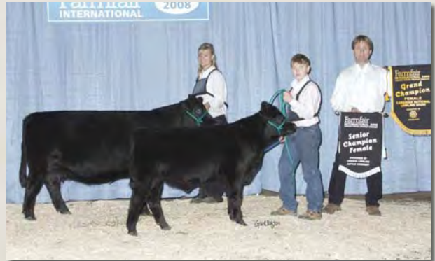
Alta Marie BIL 5N, Dam of Lot 11

Big Island has used their best black cows in their red Lowline breeding program. Macie is carrying the red/wild gene. Macie's dam was the 2008 Canadian National Champion Female and Macie was the Reserve Junior Champion Female at the 2010 Armstrong Fair and the 2010 Canadian National Show. She is open and ready to flush.