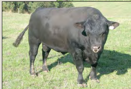
Neron, the sire of Lot 22B embryos