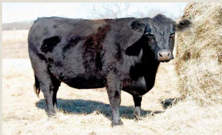
LTL Cimmarron, dam of the Lot 24 embryos

LTL Cimmarron is an exceptional daughter of the National Champion LTL Dillon. She is Flying J & L's foundation cow and their top flush cow, producing double-digit embryos every flush. She is a correct, long bodied cow that weighs 1003#. A Dillon daughter was the high selling female at the 2009 Get Back to Grass Sale. These embryos will be the only offering of this cross. Selling 4 grade 1 embryos stored at Bovine Elite in College Station, TX.