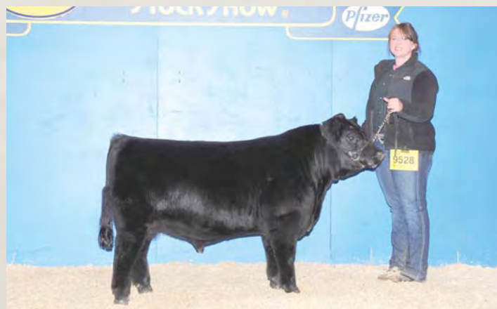
KBW Spartan, full brother to the Lot 23B embryos

We were early believers in both The Brick and Vitulus Yes Yes Yes sired females. Blending the two lines has provided consistently superior results, with KBW Spartan a prime example. 22T is a full sister to both the 2008 National Champion and Reserve National Champion Females. Here is a fantastic opportunity. Selling 3 embryos.