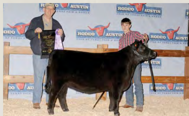
PCF Tivo Lee, 2010 Star of Texas Grand Champion Female. She is a daughter of Lot 9.

She was AI bred to WMF Undercover FM 8963 with sexed heifer semen on February 10. Tildie Lee is the mother of the 2010 Star of Texas Grand Champion Female. Her dam was the #1 flush cow at EZ Ranch in the early years, producing 84 embryos by the time she was 2 years old... very prolific genetics.