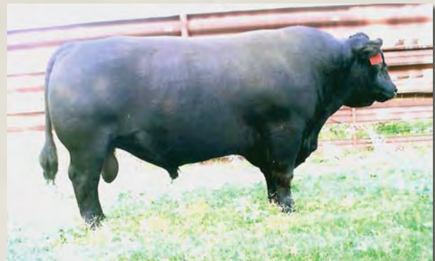
Fairwyn's Machine, sire of Lot 56

Check out this stout made halfblood Machine son.