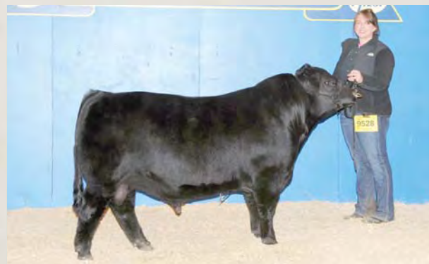
Findon's Monarchy, service sire to Lot 7

She is preg checked safe for a September 2011 calf by MCR Findon's Monarchy FM9340, the 2010 Star of Texas Grand Champion. Ellie is a daughter of Doc Holliday, the sire of champions. Her dam, Double J's Miss 28T is a three quarter sister to the only two time National Champion Fullblood Bull, Double J's The Brick.