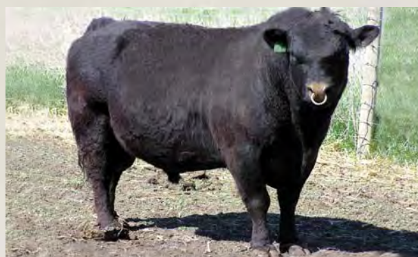
EZ Lexus 18L, grandsire to Lot 20.

This August heifer calf's pedigree is loaded with great Australian genetics including the red factor cow ALM Bess 102H.