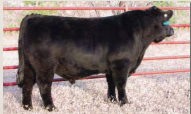
Undercover, Service Sire to Lots 2, 3 and 9

She was AI bred on September 7 to WMF Undercover FM8963 with sexed heifer semen. This powerful three year old out of the direct import Fleur and the great Boris son Hawkhill Douglas is due for a heifer calf by Undercover, a brother to the reigning National Champion Female.