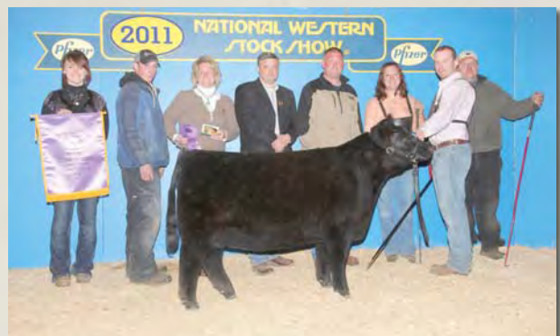
CRF Willa, 2011 National Champion Female. She is a sister to WMF Undercover, the service sire to Lots 2, 3 and 9.

She is bred to Sigels Sunset Maximus FM7885, exposed from August 10 - Sept 9. This long sided daughter of SC Victoria, the extremely productive donor whose dam is a full sister to our EZ Magnum 72J herdsire, has a pedigree that is anchored by a who's who list of great Australian sires.