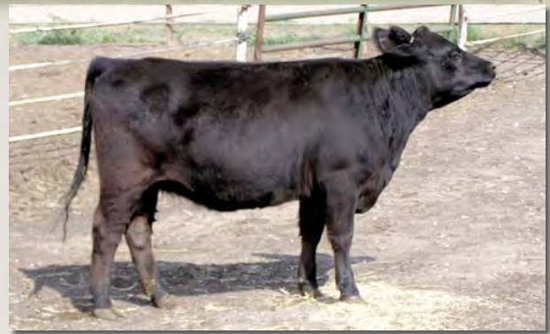
EZ Mugga Mae 6R, the fullblood dam of Lot 25.

She is bred to Kona Magic FM4572 from July 1 - September 1. She is registered as a halfblood but is probably a fullblood. Her mother is Mugga Mae 6R and her sire is one of the fullblood bulls that we slaughtered before we realized he had sired this calf.