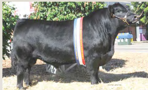
Yarra Ranges Jackaroo, Sire of Lot 51

Black Jack is a growthy May fullblood bull calf with quite a future. He's a brother to the reigning National Bull Calf Champion, EZ Captain Jack 1X.