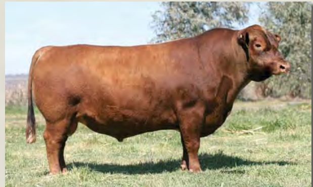
Bluey, sire of Lot 55

Red Hot Bluey is a red halfblood from a top Red Angus donor cow.