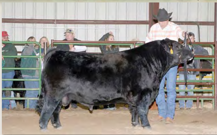
The Brick, sire of the Lots 23A and 23B embryos

Double J's The Brick continues to impress, providing powerful, easy fleshing offspring that can move out. Grace is a foundation female, stemming from the superb Geraldine cow family. She is an ultra-productive donor and a heavy milking, attentive mother. K Bar W has sold 4 Grace daughters in the last 4 months that averaged $6375. Selling 5 embryos.