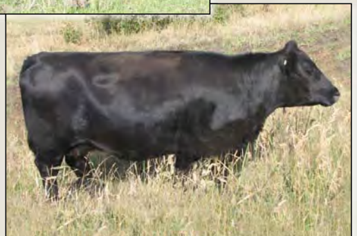
Nardia, dam of Lot 22B embryos