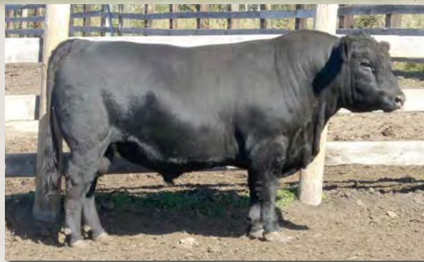
Alta Oz, sire of Lots 34 and 35

Glenna is a flashy heifer with all kinds of future. Her sire, Alta Oz, is a full brother to Alta Wild Card BIL 14T, the sire of the 2011 National Champion Percentage Female and Prospect Steer. Alta Oz sired the 2010 Canadian National Reserve Champion Percentage Female and Champion Percentage Bull.