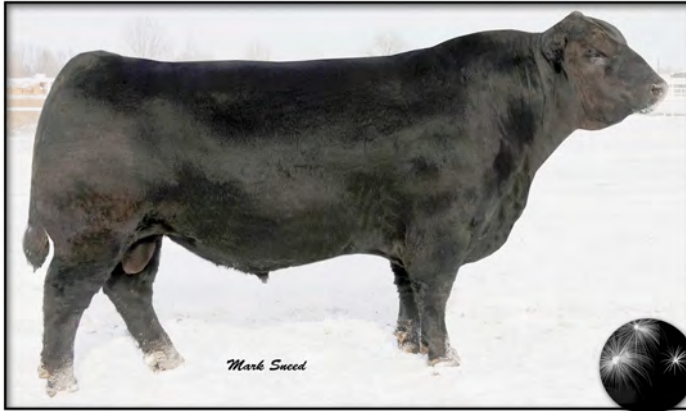
Sitz Upward 307R – Reference Sire