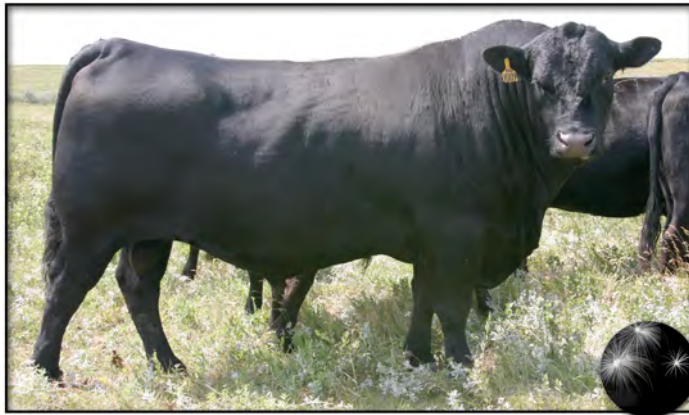
HT Traveler 756 – Reference Sire