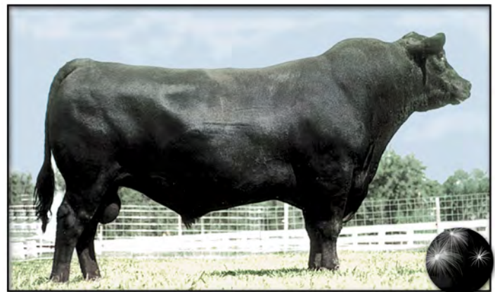
Leachman Right Time – Reference Sire

Right Time son out of a really good Explorer cow. Maternal strength throughout his pedigree. Suitable for heifers.