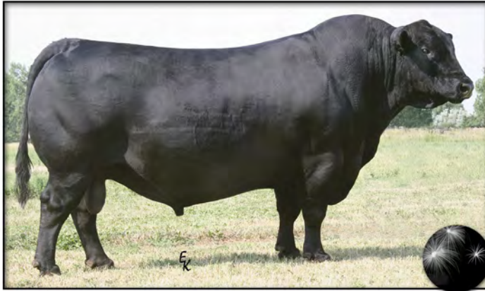
SSV Final Answer 0035 – Reference Sire