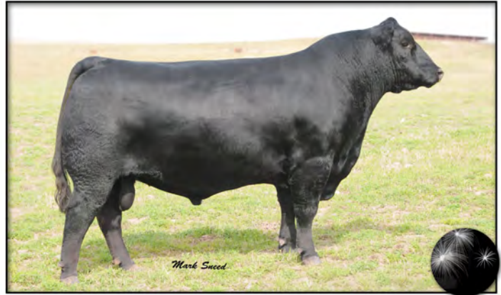
Hoover Dam – Reference Sire

Stout Hoover Dam son out of an awesome female. Good muscle and performance.