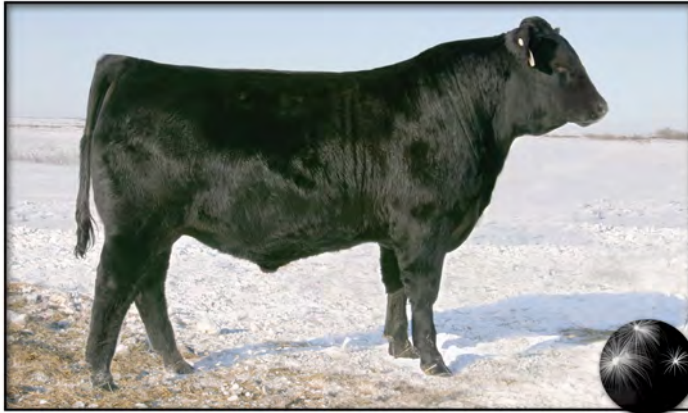
BT Impressive 898 – Reference Sire