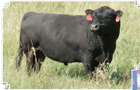
EZ Pistol 23P

Pistol's sisters by Magnum have been very competitive in the show ring and his mother was one of our outstanding direct imports from Australia. His length of body and exceptional muscling coupled with his calving ease on first-calf heifers have made him one of our most exciting young herdsires. Daughter Maggie Mae was Houston Champion this year.