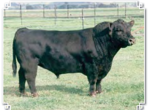
Beau Lad P004