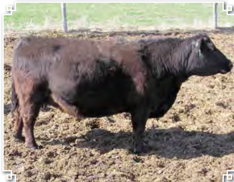
Brambletye St. Louise S208, dam of EZ Captain Jack 1X