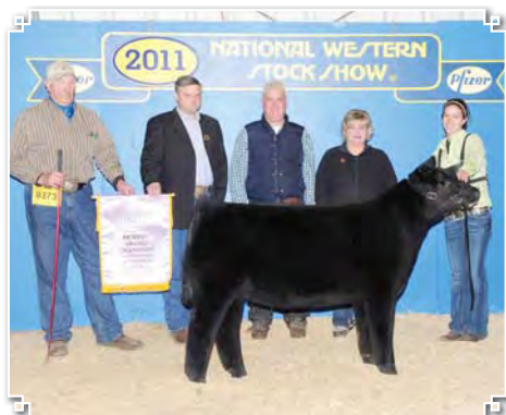
Porterhouse, the 2011 National Reserve Grand Champion Steer and the 2011 Houston Grand Champion Steer. He is a son of Bar J Quail 10R, lot 19.

HSN Penny 27N is a deep-flanked, red-factor BEEF cow. This halfblood is due for a 5/8 Lowline-3/8 Maine calf by Double J's The Forgotten Who 24U for a 5/8 Lowline-3/8 Maine calf, and should calve in June. 24U's dam, Double J's Who Am I, was the 2007 National Champion Percentage Female. Co-owned with Heaven Sent Ranch, Fayetteville, AR.