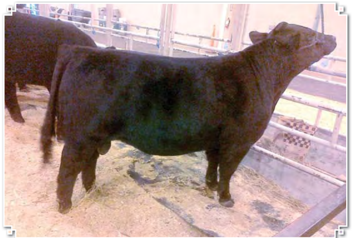
EZ Captain Jack 1X, Jackaroo son

2 EZ Miss Daisy 40S Fullblood Cow Reg # PENDING EPD 5/18/06 BW 38 Black Polled