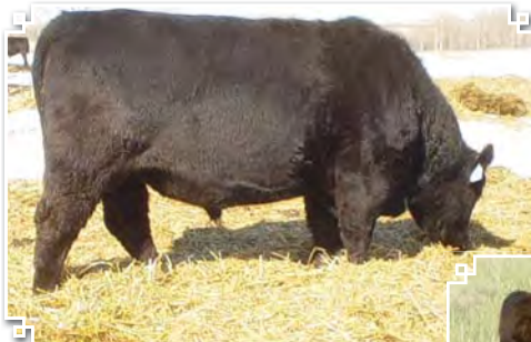
SC Gus S10

SC Gus is a red gene carrier who is a long and deep-sided son of Buzz out of the true red gene carrier brood cow, ALM Bess 102H. We are thrilled with his calves - they are thick topped with plenty of length and great confirmation. My dad always said, "Worry about the quality first, then the color." These Gus calves have the quality.