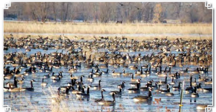
April found us with lots of water - at least the geese enjoyed it!

Here's a long, feminine young purebred. She is due for a purebred heifer in mid October by our red factor fullblood Lazy G Johnnie Walker W203 FM9417.