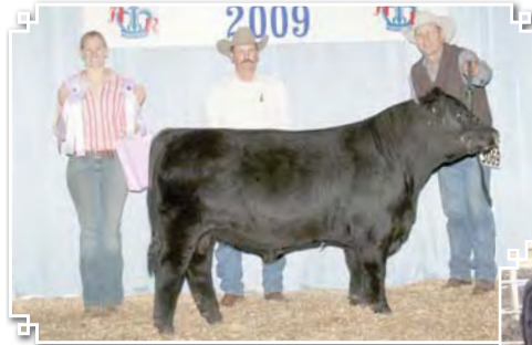
EZ Update 16U

Update is a paternal brother to the 2010 National Champion bull and a maternal brother to EZ Fancy Pants 12R. His dam has produced calves that have gone on to become herd bulls and donor quality females for the breed's leading herds. He is an 8 out of 10 for tenderness on the Igenity DNA test and measured a fantastic 15.1" REA at 1060 lbs. at 19 mo. Co-owned with Southern Hills Lowlines, Hillsboro, Ohio.