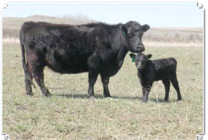
Lot 2 and 2A