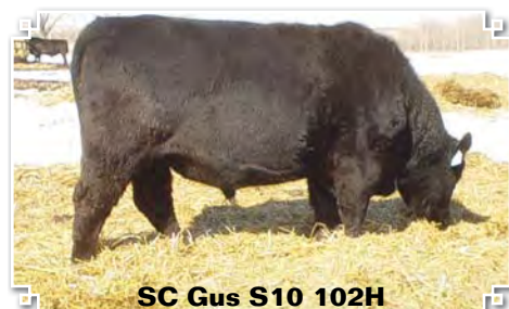
SC Gus S10 102H