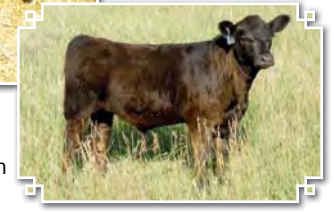
EZ Gusto 305X, son