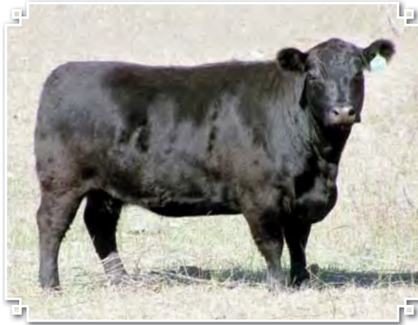
Brambletye W332, dam of '05 American Royal Grand Champion Female