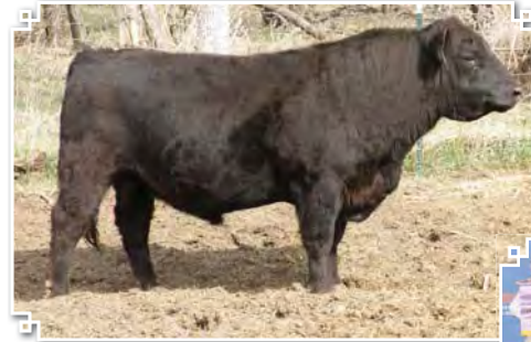
Bar J Sultan 6S96

Sultan is a long sided, clean made and expressively muscled son of the 2005 National Champion Female, Nadine. He is sired by the 2005 Iowa State Fair and American Royal Champion, Bar J Sparks. We have used Sultan very successfully on our first calf heifers. His daughters – both fullblood and percentage – are truly exceptional.