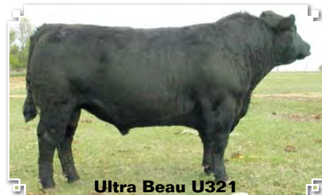
Ultra Beau U321