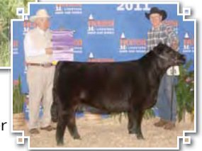
EZ Maggie Mae 19W, daughter