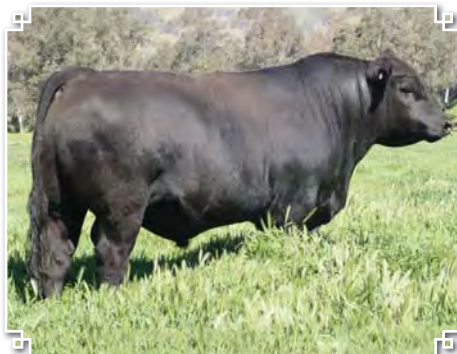
Yarra Ranges Jackaroo, Grand Champion Bull, Sydney Royal Easter Show