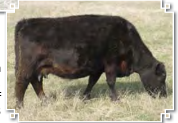
Mugga Lee 9L, dam of Lot 3

Lot 4 - Selling one successful flush in Mugga Lee 9L (4 grade 1 or 2 freezable embryos) to the bull of your choice - either your bull or we will include 2 straws of semen and 4 certificates from our herd bull battery, even including Beau Lad and Utah whose semen has been removed from the open market. Mugga Lee 9L is a big bodied, sound uddered cow that always stays in great shape and always weans a very nice calf. She has produced 4 daughters that have been sold for an average of $5,700 and her dam, Mid Mugga 05J has produced three daughters that have averaged $6,833 per head. This is a great opportunity to flush a very nice, rare Union Pacific daughter and there will be no more of them as there is no longer any Union Pacific semen available.