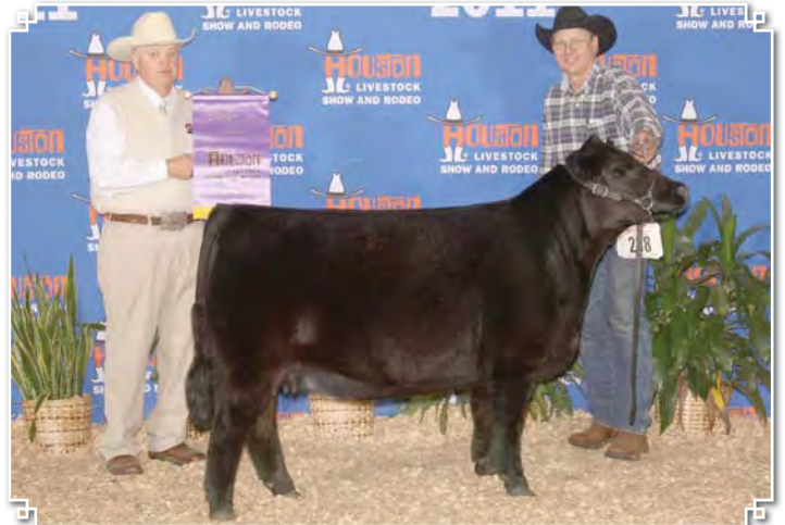
EZ Maggie Mae 19W, 2011 Houston Grand Champion Female. She is a Pistol daughter.

EZ Miss Bosun's Mate 925J Bosun's Mate N066 Angus