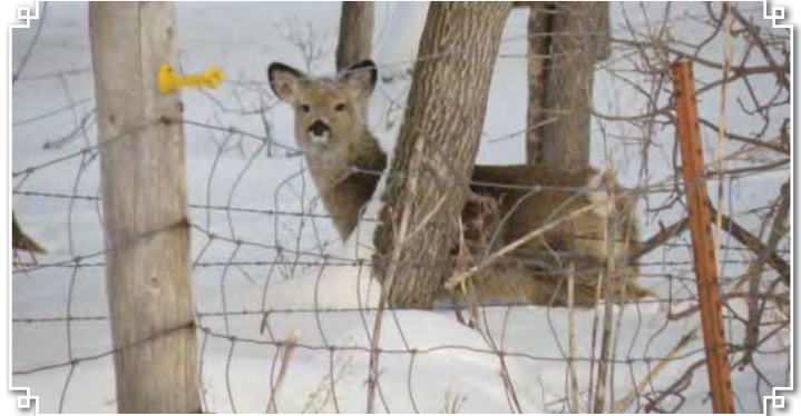
What a winter! Lots of snow and lots of deer to share our feed!

Pamela 121U is a halfblood Union Pacific granddaughter out of a Chi Angus base. She should have a calf at side by sale day.