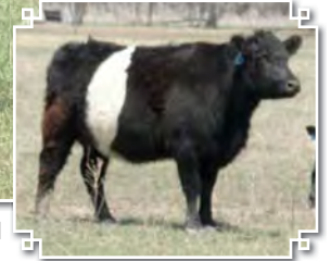
Bar J Bunny T10, Lot 11