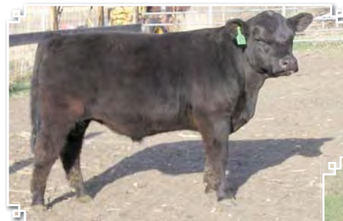
EZ Templeton 4T