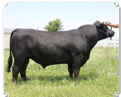
Double J's The Forgotten Who 24U, service sire to lots 19, 20 and 21.