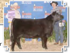
EZ Sultress 335W, daughter