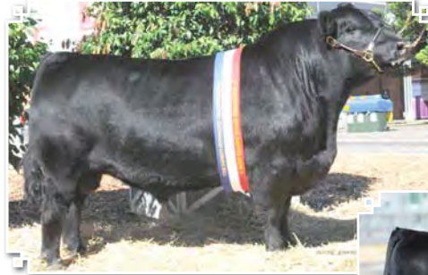
Yarra Ranges Jackaroo

Jackaroo was the Supreme Lowline Champion at the 2008 Melbourne Show and the Grand Champion Bull at the 2010 Sydney Royal Easter Show. He weighed 752# at 11 months with a 11.16" ribeye for a whopping 1.48 REA/CWT. In Sydney he weighed 1522# at 2-1/2 years of age with a 16.5" ribeye. His calves consistently garner rave reviews. They are competitive!