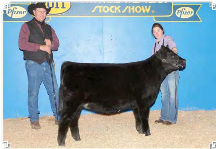
EZ Pepperjack 325X, Jackaroo daughter