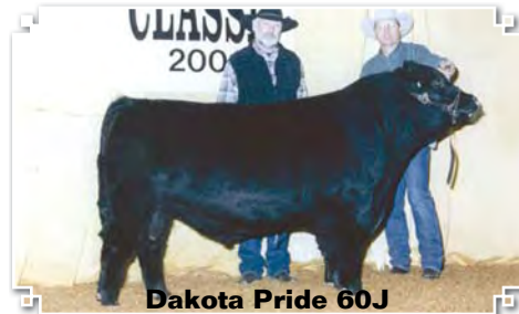
Dakota Pride 60J