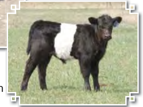
EZ Beltway 303Y, son