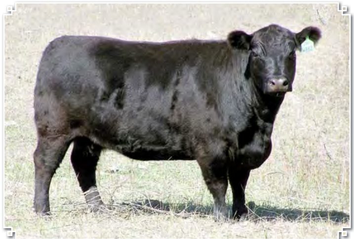
Donor dam Brambletye W332 Lot 6 Flush

Nightcrawler Glen Innes N308 Trangie H153 Trangie H307 Commader K162 Brambletye Perfection F183 Commodore J001 Brambletye Tara J534