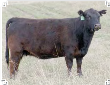
EZ Tayla 38J