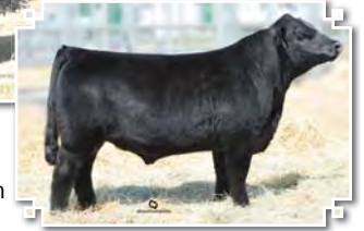
EZ Captain Jack 1X, son