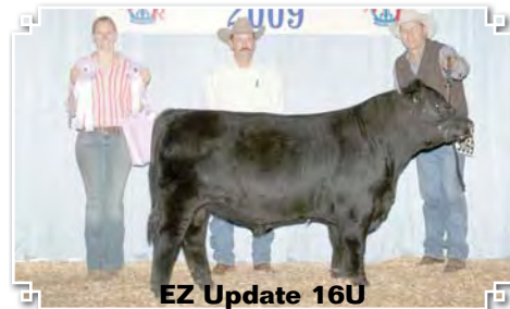
EZ Update 16U