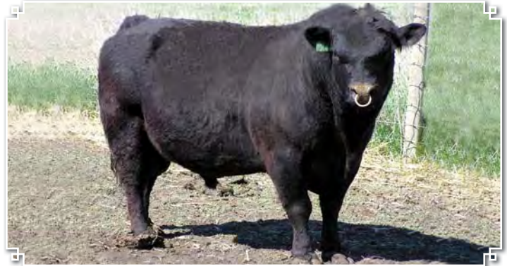
EZ Lexus 18L, sire of Lot 8

Brambletye Bosun L006 Glen Innes J389 Admiral J222 Brambletye Agnes II M044 Midshipman M206 Brambletye Felicity J167