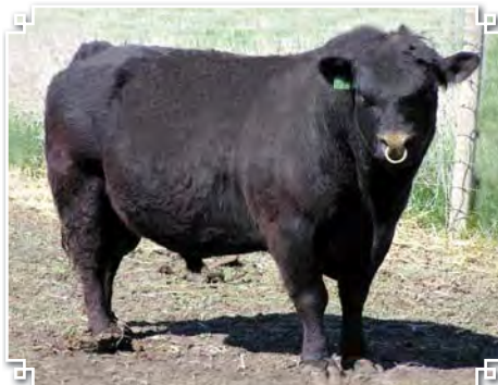
EZ Lexus 18L, '04 American Royal Grand Champ. Bull