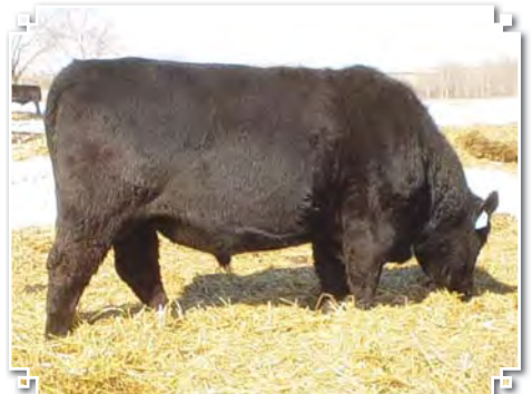
SC Gus S10102H Red Carrier Fullblood