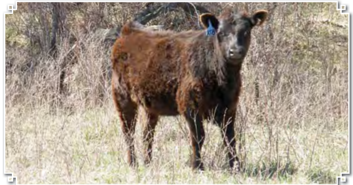
137X, Lot 9's heifer calf

Mugga Majura Trangie J325 Brambletye Arunta L013 Brambletye Cleopatra J284