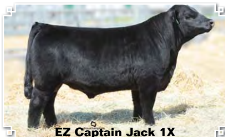
EZ Captain Jack 1X