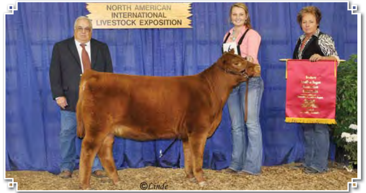
EZ Red Baroness 103W, Red Baron daughter

Bar J Brutus L150 Bar J Babe M227 ALM Payday 51H Angus Quartermaster Q117 750 Bosun's Mate N066 Angus