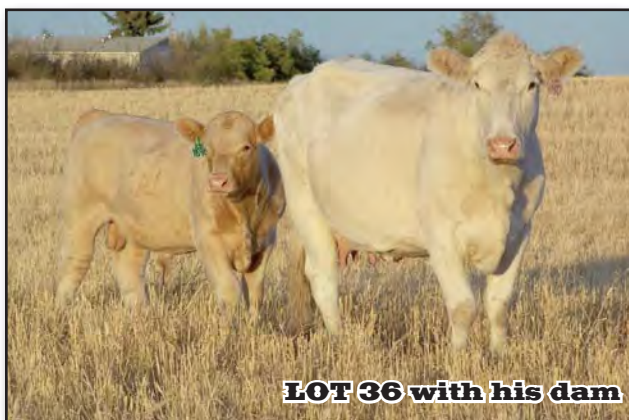
LOT 36 with his dam