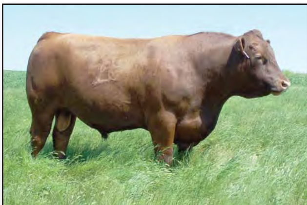
DK Trojan V4001