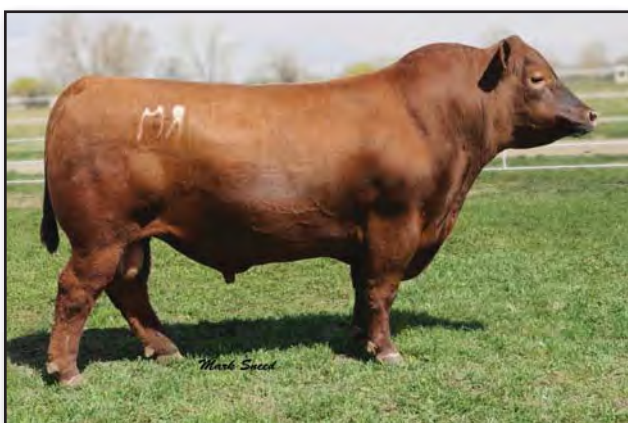
Messmer Packer S008

A.I. sire from Genex. He is the No. 2 registration sire in the breed. His calves are moderate framed and are packed full of muscle.