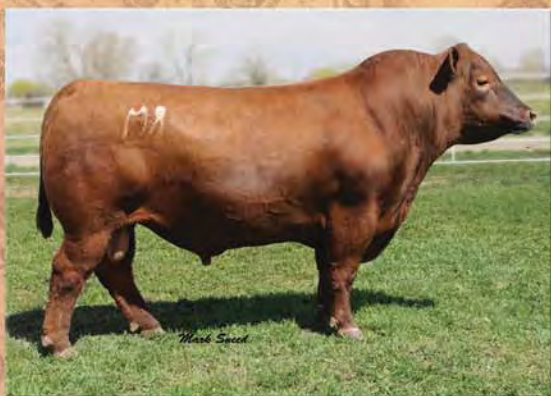
Messmer Packer S008

2 p.m. CST • Sitting Bull Auction, Williston, ND