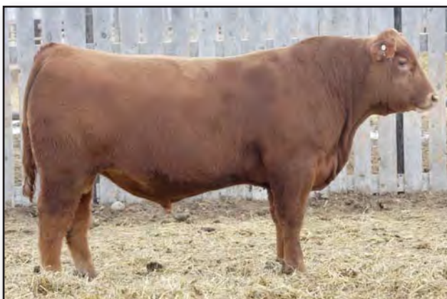
NS Bronson X079

Introducing Bronson, our future herdsire who was the $25,000 high-selling Red Angus bull at the Midland Bull Test. Watch for his calves to hit the ground in 2012.