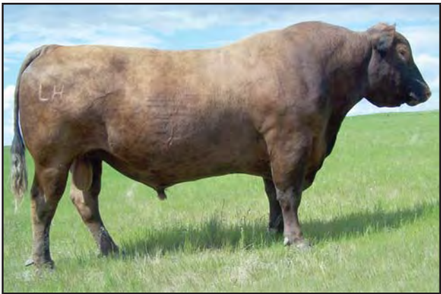
VGW Extra 541

Extra's individual ratios at the Westphal Red Angus were WW 117, YW 115 and REA 114. His calves have EXTRA length, EXTRA performance and EXTRA good dispositions. Extra 541 will give you the EXTRA pounds out of your calves that you want.