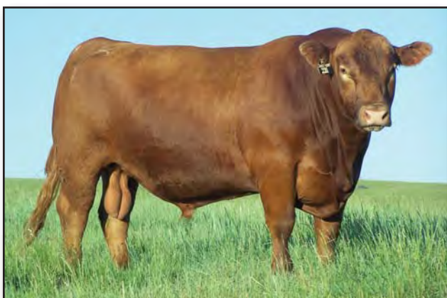
BMRA Mr Statement 998