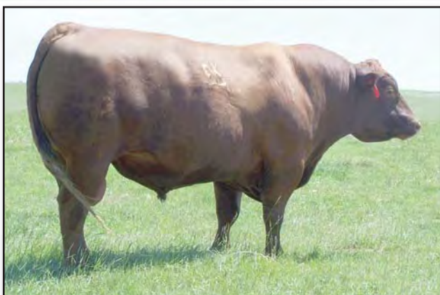
HRR Trojan 709