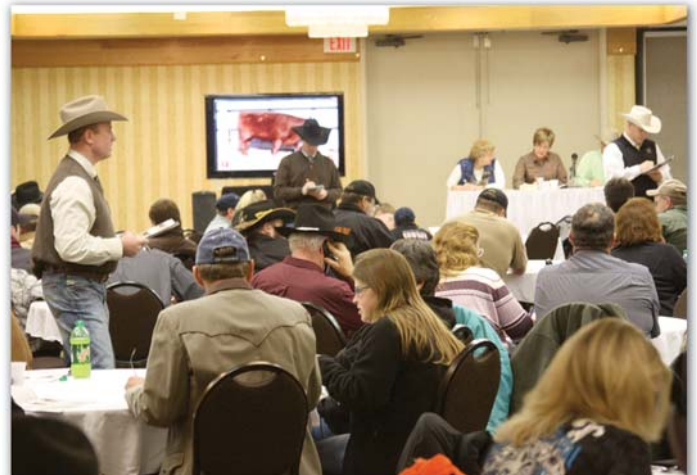
2011 New Year's Eve Extravaganza

Calving ease and performance – what more can you want? He is out of an OS-free tested Romeo dam.