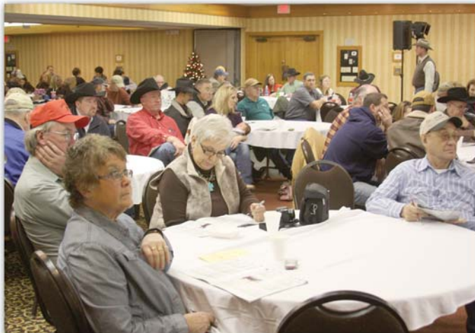
2011 New Year's Eve Extravaganza