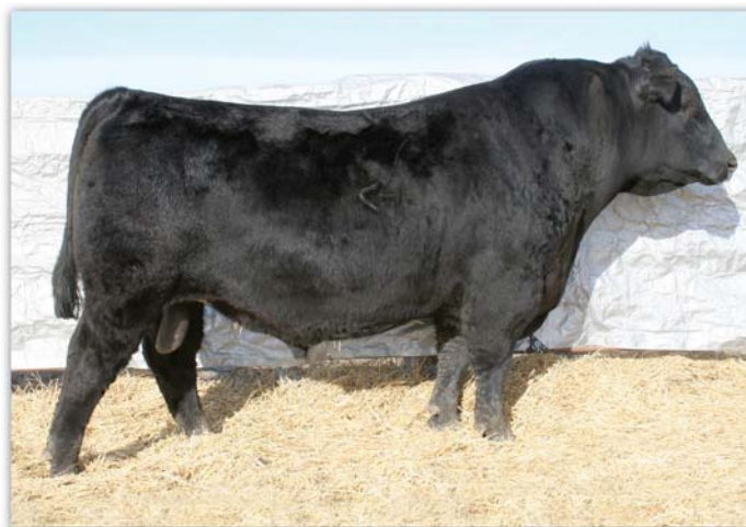
D Firestone T729, sire to Lots 123 and 124

A standout calf since birth, he had a 76# BW and a 836# 205-day wt. A calf with a tremendous amount of rib shape and thickness. His first-calf dam comes from a super cow family. His granddam is 5/99 BR, 5/113 WR, 3/104 YR, 2/112 IMF and 2/105 REA. His great granddam is 5/104 WR, 5/107 YR, 6/109 IMF and 6/100 REA. Now that is cow power at its best. A calf that I'd recommend for heifers. I think this calf is BIG TIME. A calf that I'd like to collect some semen on. Selling full possession but I would like to keep a 1/4 semen interest in the bull.