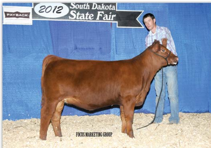
Lot 1, Red Angus calf champion at S.D. State Fair Lazy J Bar Ranch New Year's Eve Extravaganza