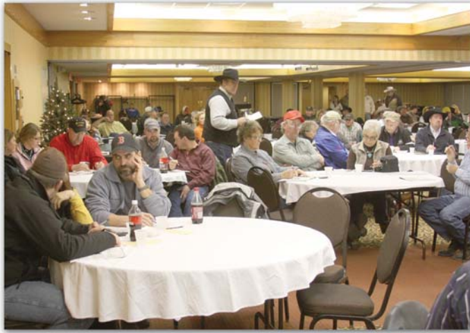
2011 New Year's Eve Extravaganza