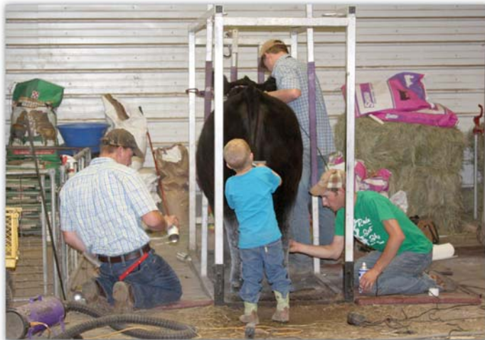
Not too little to help