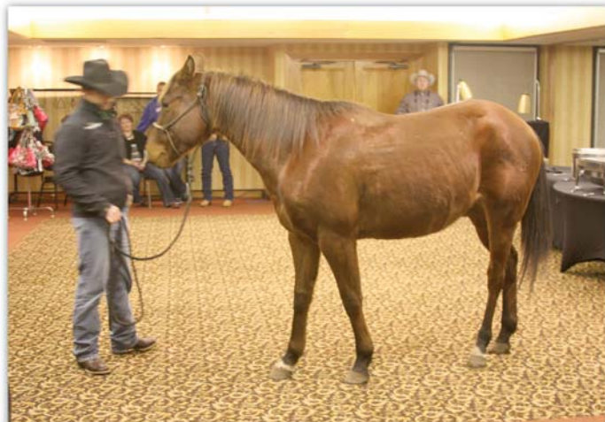
2011 New Year's Eve Extravaganza