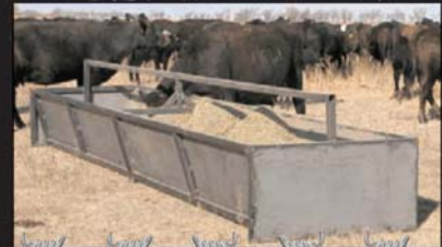
Bottomless Feed Bunks