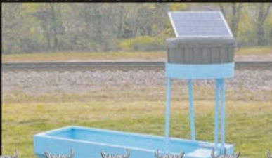
Water Tank & Solar Pump