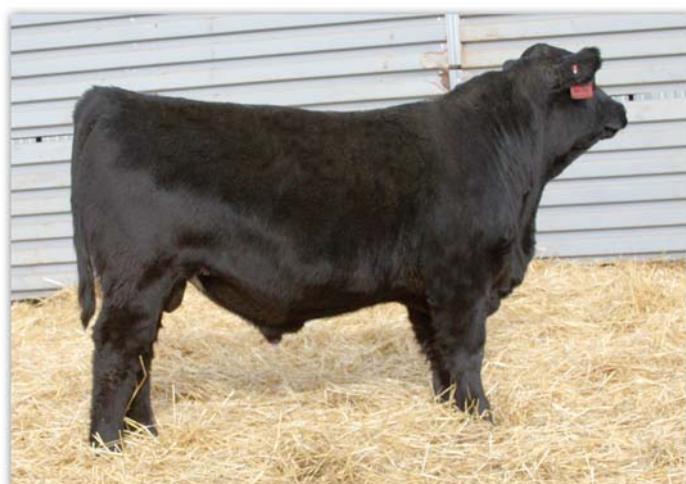
30 Black Angus bulls like this available at private treaty