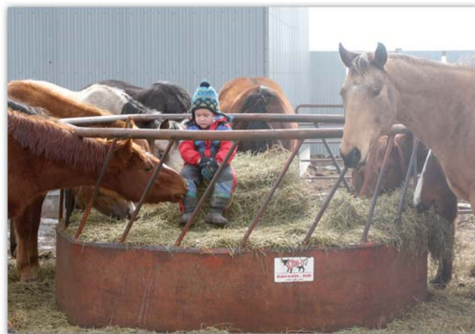
The Horse Whisperer