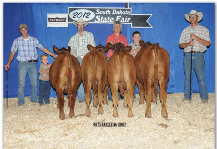
Lazy J Bar was Premier Red Angus Breeder at S.D. State Fair