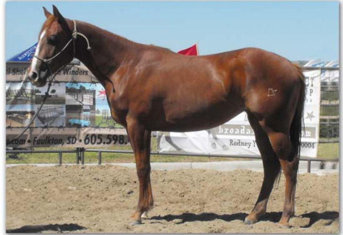
RY Hickory Acres "Tibbs"

Tibbs sire, the red dun Broadaxe Ranch sire, High Whitch, is quickly making a name for himself through his consistency as a sire by producing colts with naturally deep/hard stops, responsiveness, cow-sense, disposition, intelligence, conformation and muscle. "High Whitch is one of only 30 stallions nominated to the Dakota Classic Cutting Horse Futurity each year, and has offspring on track to go into cutting horse training in the near future. High Whitch is an own son of the great High Brow Hickory, who has become famous as a sire for producing the incomparable,