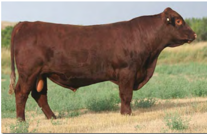
Reference Sire J

188V was our pick of the calving-ease bulls in 5L's 2009 sale. We have used him on heifers the past three seasons and really like his moderate-framed, eye-appealing offspring.