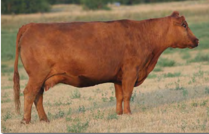
228, Dam of 1123