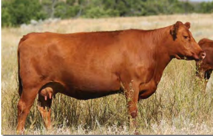
647, Dam of 1115