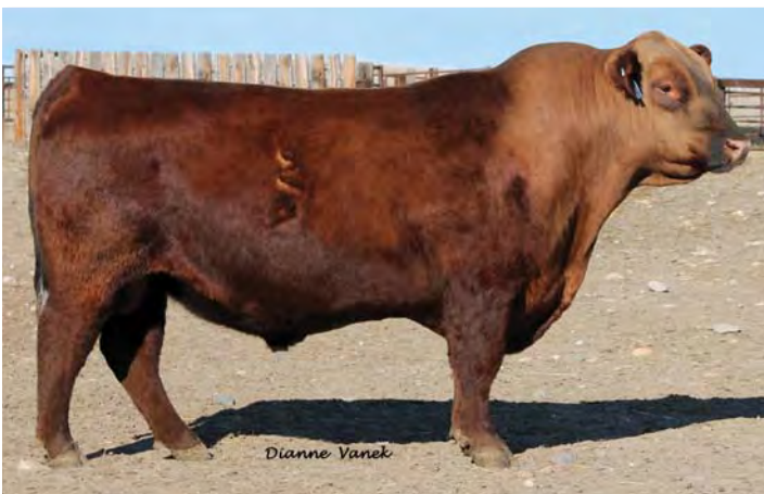
Reference Sire C

This is the sixth bull crop out of the R397K sire. Through the years his sons have been well received because of the depth, thickness, and performance that they offer in a moderate frame. His daughters have also done a good job for us as you will see by some of the bulls in the offering that were produced by them.