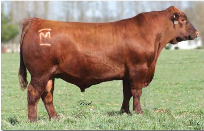
Reference Sire D