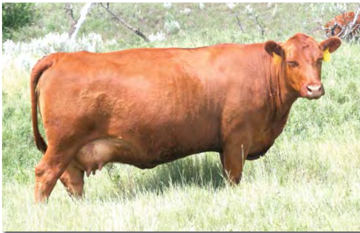
515, Dam of 1122

1121 is a powerful Tradesman son that stood out in the pasture all summer. He has the depth and thickness that we like and is backed by a Foundation daughter that has a 105 MPPA and 107 average weaning ratio and 106 average yearling ratio. (1121 Picture)