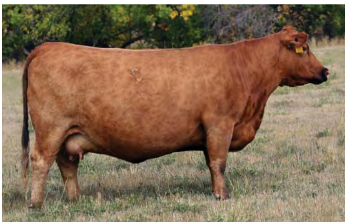
953, Dam of 1204, 1208, 1214 and 12116