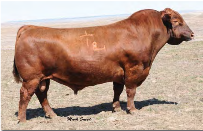
Reference Sire B

We used this 5L bull AI to bring in some of the outcross genetics from the Melhoff program. I think you will like the bulls that were produced.