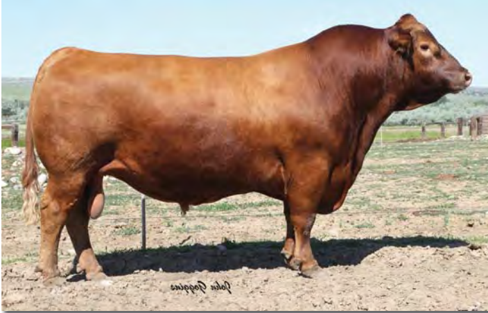
Reference Sire A