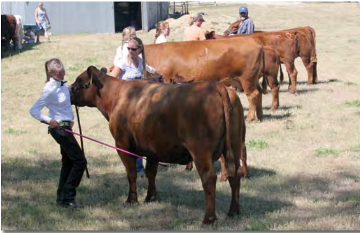
Cele and Jac showing in the Red Angus Overall Class

1145 is an attractive Knight 7153 son that offers good performance and thickness together. He is backed by an attractive young Shoco Data daughter that posts a 98 BWR, 104 WWR and 101 YWR.