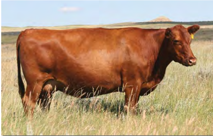
319. Dam of 1231