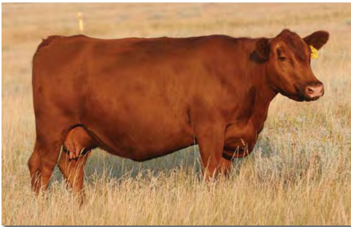
409, Dam of 1124