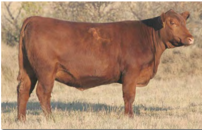
048 - Maternal Sister to 1103

1102 is one the highest gaining bulls in the offering. He has the thickness and depth that we come to expect out of the Tradesman offspring. He sells as a category II bull as he has a small spot of white that we discovered between his front legs.