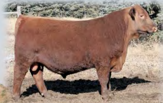
MLK CRK Impressive 1144 #1431572 Mushrush Impressive CA U236 x 5L Blazin Red 1354-6166