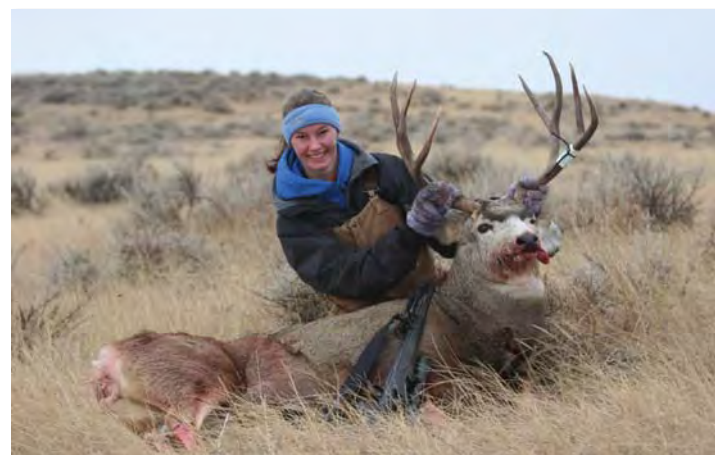
Jac's 2011 Mule Deer