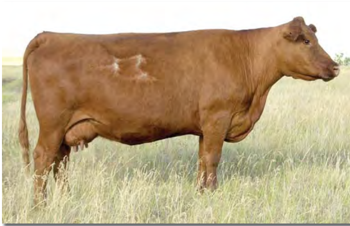
7127. Dam of 1210 and 1211

1210 & 1211 are ET full brothers that are moderate framed, deep and thick. We purchased their dam in the Bootjack dispersion as a bred heifer and her first calf was the Cornerstone bull which produced many great females that sold in our female sale.