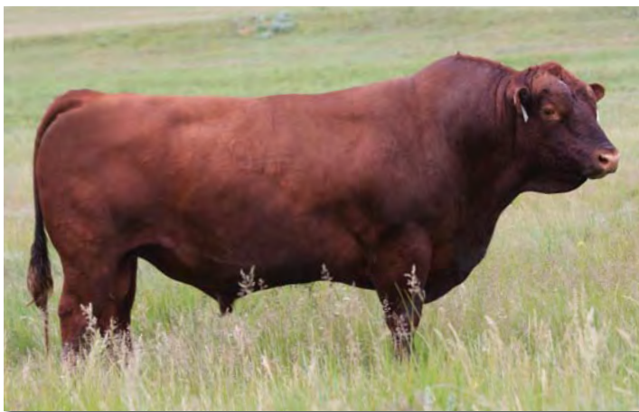
Reference Sire E