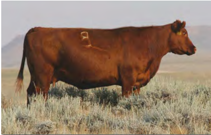
239, Dam of 1125