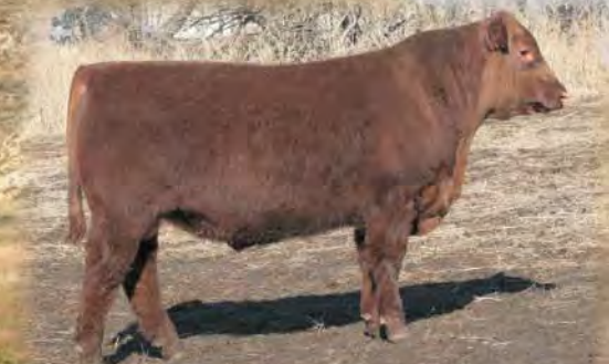
MLK CRK Redstone 1195 #1431594 MLK CRK Redstone x Beckton Epic R397 K