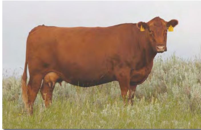
189. Dam of 1105 and 1106