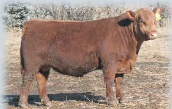
MLK CRK Expressive 1122 #1431495 MLK CRK Express 9127 x Shoco Data