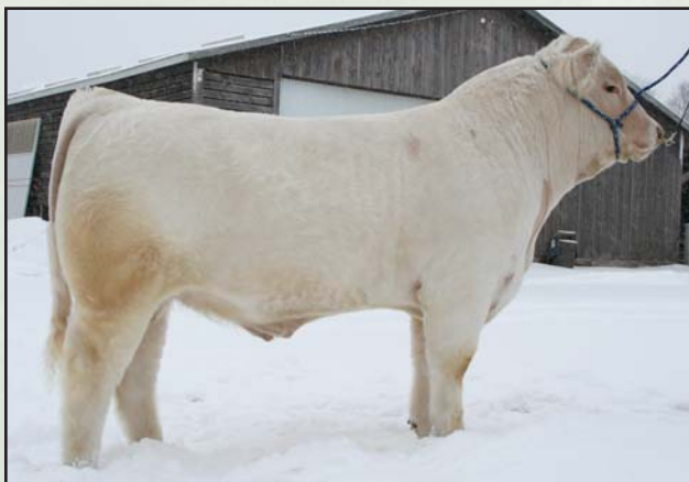
JAB Top Shelf 690 Polled

Our main herdsire that just keeps on ticking. Makes them good and makes them full of meat. And is making some nice females too, besides what his Milk EPDs say. His progeny are being well accepted by top commercial cattlemen. Very attractive and easy-fleshing progeny.