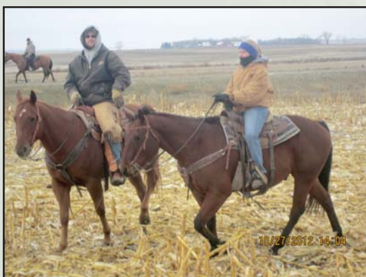
Troy and Jess

Youngest bull in the sale which should work on heifers, that is a good looking animal.