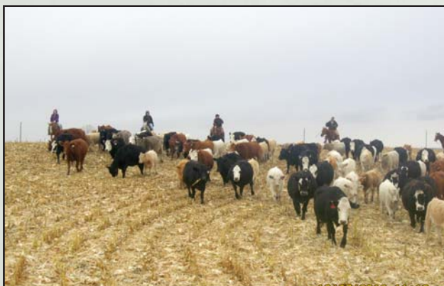
Bringing home the commercial herd for the winter