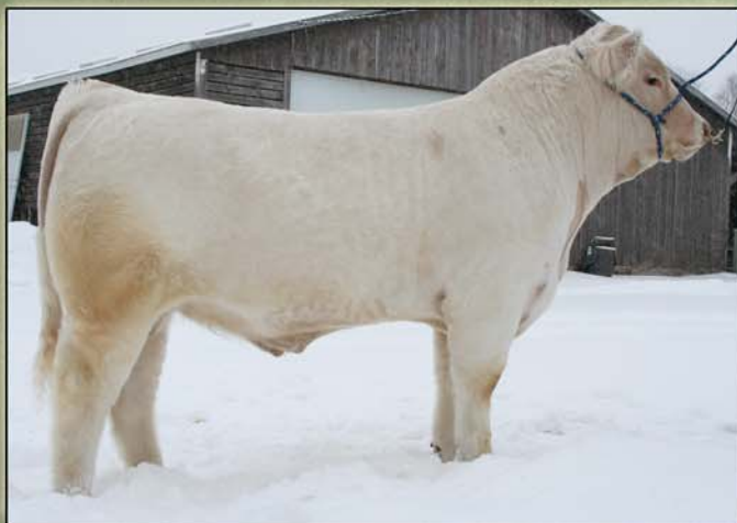
JAB Top Shelf 690 Polled

5 Fancy yearling registered Charolais heifers