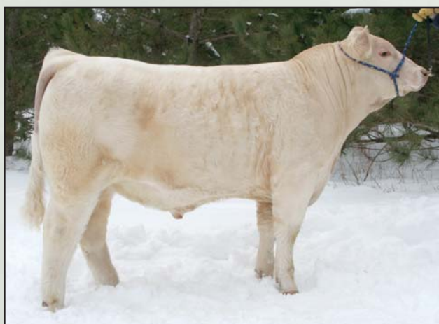
JAB Hedge Hog 995 PLD

High seller at BHSS. His calves have come along very nice. The older they get, the more I like them. His progeny will be appealing to most.