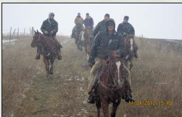
Riding crew bringing home the cows in the fall

This guy will put some hair on your calves. Nice son of Top Shelf.