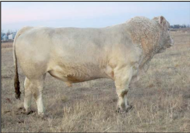
WF All Star 764 Pld

We used this guy on heifers for three years and were impressed enough to start using him on cows, and we are very impressed with them now. Thick, long, and good-doing progeny from this guy.