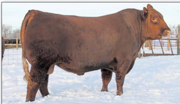
Badlands Net Worth 23U

Schuler Envy offers the power of Norsemen King backed by an Enterprise x Ladies Man dam with an outstanding 107 MPPA. Impressive individual performance ratios - 04 BR, 109 WR, 111 YR, 117 IMF-R, and a 114 REA-R. We have calved out some of his first daughters this spring; they are moderate with easy flushing ability and good milk.