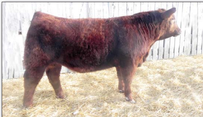
Red SVR Warrior 99X

Chester is showing a unique balance and maternal. His calves this year have an average BW of 81 lbs. Chester's dam exhibits depth, thickness, udder quality and soundness.