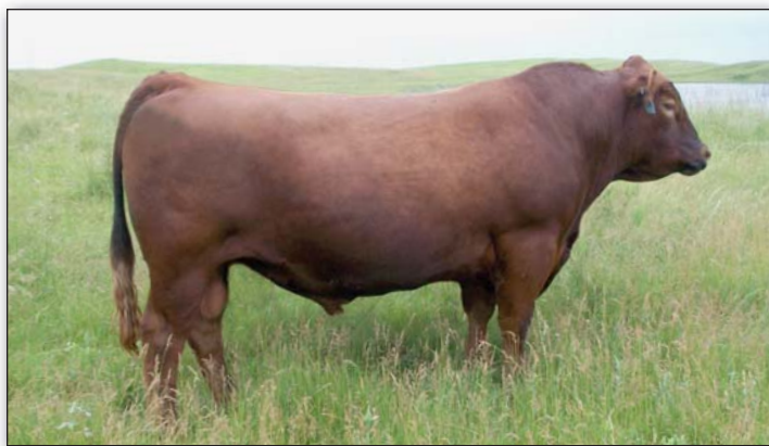
LSF High Yield 8088U