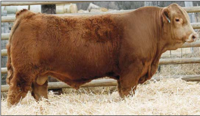
Ellingson Klondike Y123