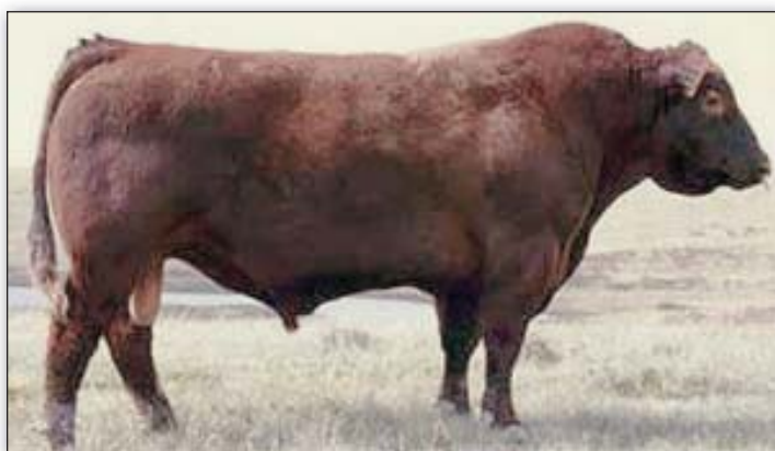
Red Towaw Indeed 104H

Badlands Net Worth 23U is a powerful sire with excellent performance ratios. His daughters are moderate with easy flushing ability and good milk.