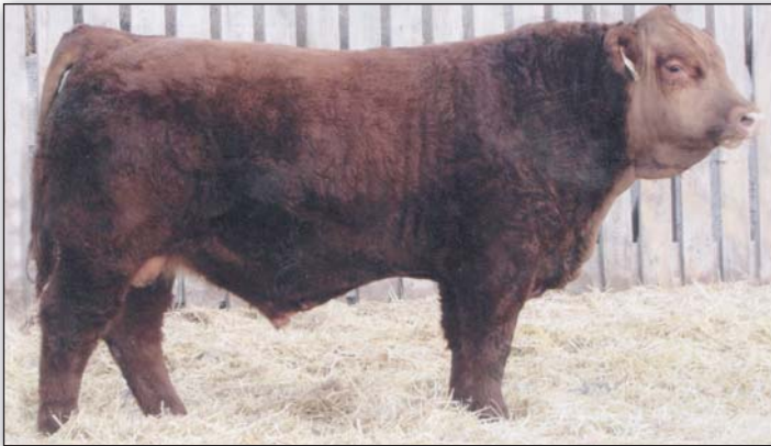
LRX Buckeye 72Y