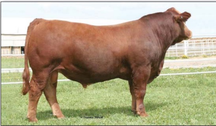
LBR Crockett R81

K LBR CROCKETT R81 #2288554 BD: 2/14/05 PUREBRED POLLED RED