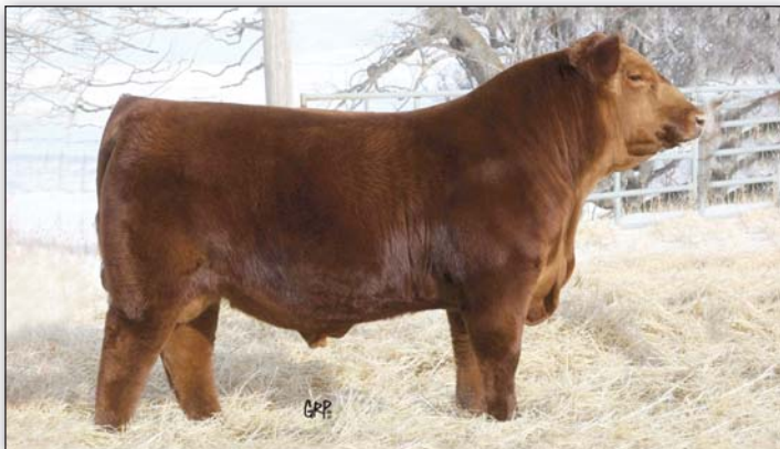
Six Mile Win-Chester 745W

Bond is a rock-solid heifer bull. His average BW on 48 calves is 77 lbs. They have a lot of eye appeal, are long and thick, but smooth made with a nice little head. The Bond Girls are showing me a lot of promise with a good, full, level uddered and small teats. This is probably Bond's true strength.