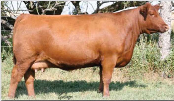
Six Mile Lassi 377P, Dam of Lot 26