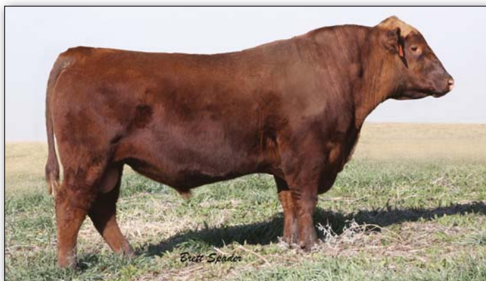
Schuler Envy 7342T

High Yield is still doing a wonderful job for us. We have used him on heifers as well as cows with an average BW of 80 lbs. His progeny ratioed 105 for marbling and 101 for Ribeye. We truly believe this is one of his many strengths. His first daughters have calved this spring and are showing good milk with a solid udder and great mothering ability. Owned with Koester Red Angus and Ludvigsons Stock Farm, and leased to Accelerated Genetics.