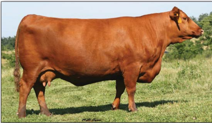
BJR Windsong 2269, Dam of Lot 23

This Warrior son has a great foot, is straight topped and has calving ease. I believe he can work on heifers. He is also an outcross genetic bull that will put some beautiful daughters back into anyone's program.