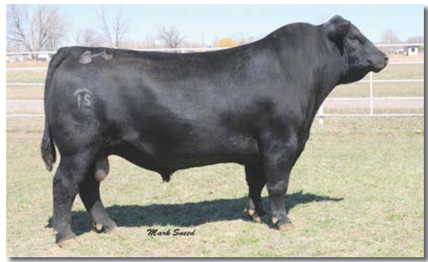
HARB Pendleton 765 JH, maternal grandsire

BW: 89 ADJ. YW: 1182 ADJ. WW: 637 ADJ. SC: 37.6