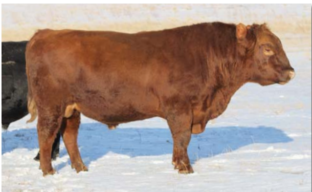
TBS Alli Cedar 0237

BW: 78 ADJ. YW: 1010 ADJ. WW: 654 ADJ. SC: