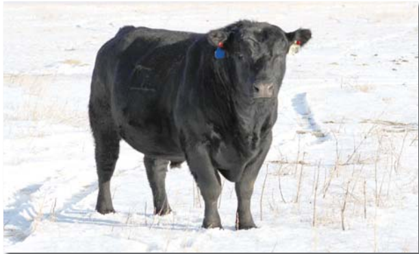
JSK Black Bull 1103

BW: 80 ADJ. YW: 1341 014 was the high-selling bull at Sletten's Angus Bull Sale 2011. He had the heaviest YW of 1341, 205-day wt of 727 and BW 80. ADJ. WW: 727