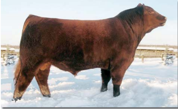
Red Northline Fat Tony 605U