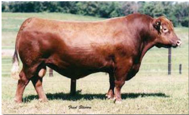
LCHMN Red Spread 1271F