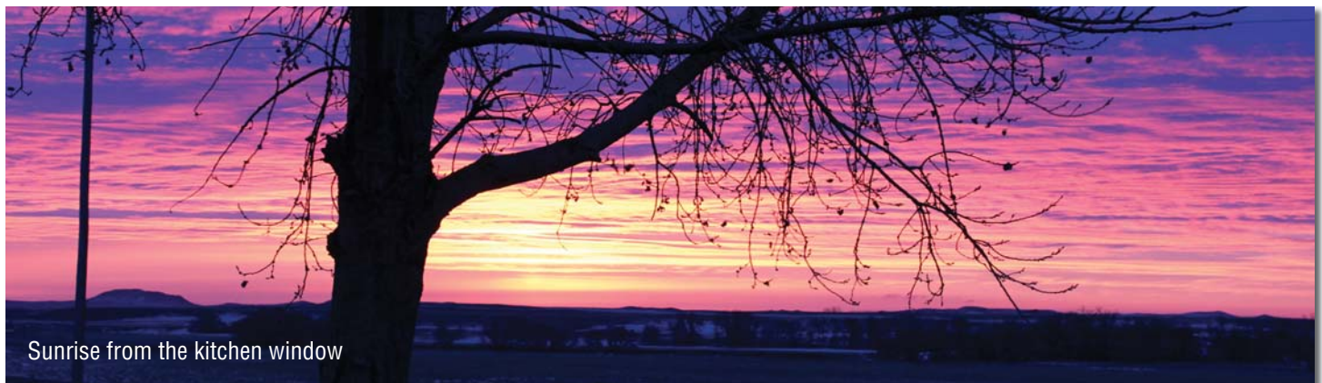
Sunrise from the kitchen window