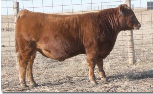
LazyJ Cowboy Way 1204-N460