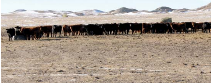
2014 Brenner Angus