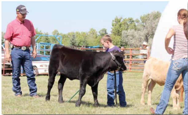
Woodrow's first show

BW: 76 ADJ. YW: 1300 ADJ. WW: 724 ADJ. SC: 38.8 Suitable for heifers.