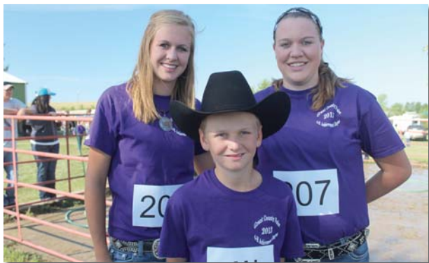
Werner kids at the fair

BW: 77 ADJ. YW: 1175 ADJ. WW: 634 ADJ. SC: 31.9