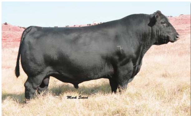
Kesslers Frontman R001, grandsire