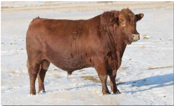
Forster Hobo X001