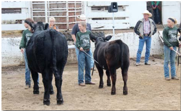
Laredo at the Lemmon Show