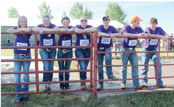
Show day at the fair

BW: 98 ADJ. YW: 1315 ADJ. WW: 700 ADJ. SC: 35.3