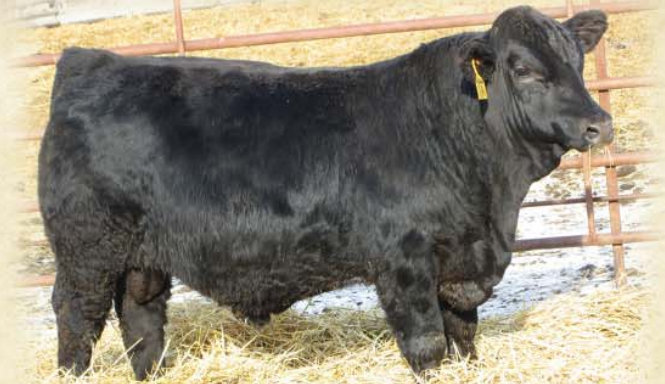
DDGR ALL IN 1A