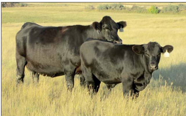
132A and his dam

Frisco is a very stylish calf with a great profile. We have been very happy with our calves out of the KKC Nobility sire and he is one of our favorites.