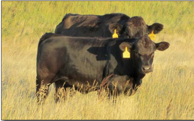
87R and her heifer calf