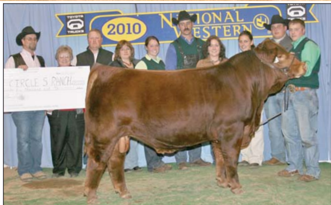
CIRS Decade 278U2