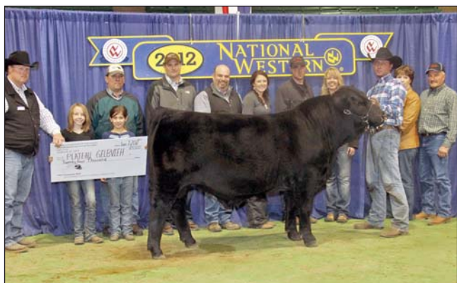
PLA Big Dog 101Y

We saw his progeny in Denver and knew we needed to use him. He has a great EPD profile and produces thick-made, eye-appealing calves.