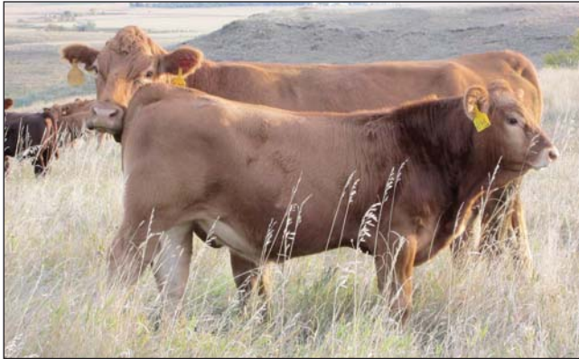
84A and his dam

The SAV Iron Mountain sons are attractive calves with lots of thickness. This calf also has nicely balanced EPDs, ranking in the top 15% for calving ease.