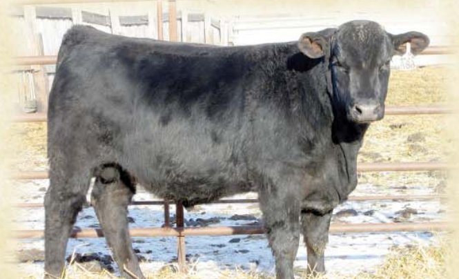
DDGR SMOKIN JOE 68A