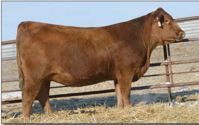
Our 2014 Golden Rule consignment – A Conquest daughter

32Z DDGR DDGR CHIFFON 32Z Red Purebred Polled Cow BD: 3/2/2012 BW: 62 Adj. WW: 537