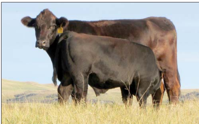
136A and his dam

This bull is long bodied and out of a My Season dam who's doing a great job in our herd. His granddam is a Dam of Distinction.