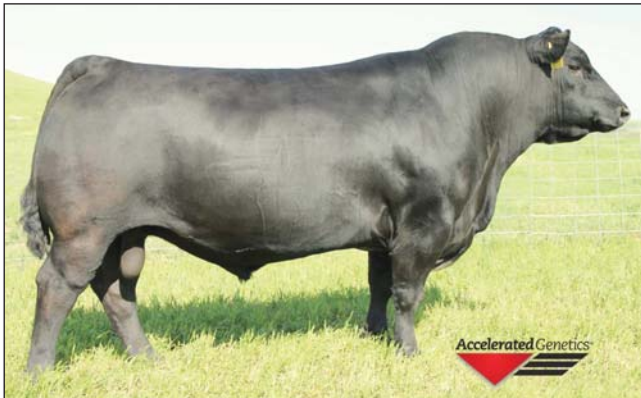
S A V Iron Mountain 8066

A moderate-framed, well-muscled, calving-ease bull we purchased in Canada. He brings outcross genetics and calving ease EPDs in the top 10% to our program.