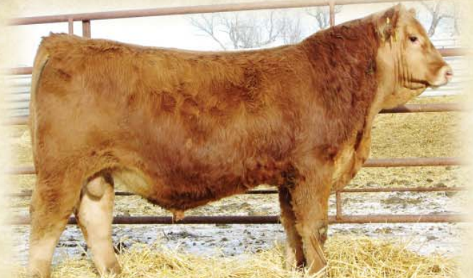
DDGR NITRO 84A