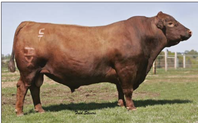
HXC Conquest 4405P

A moderate-framed Red Angus AI sire we used to lower birthweight and add thickness to his calves.