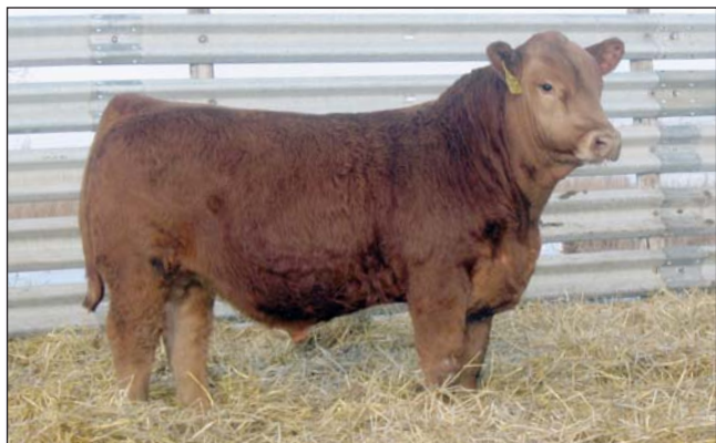
DDGR High Impact 40X

Denver futurity winner that combines Black Impact and Fosters genetics. We are happy with his calves as are the other syndicate owners.