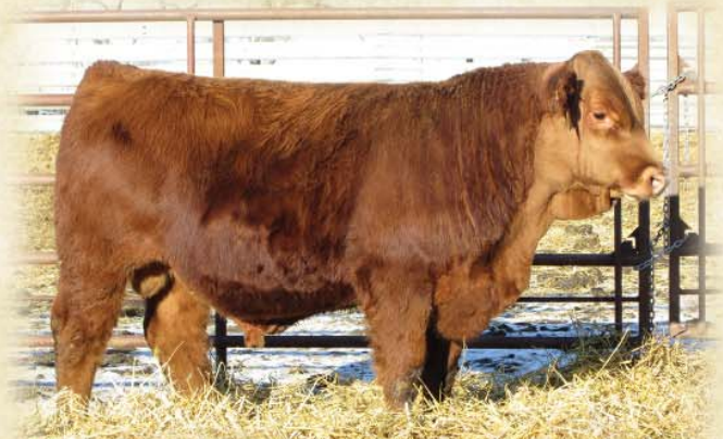
DDGR FRISCO 130A