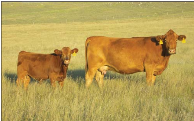
190A and his dam

This is a moderate-framed calf out of our new herd sire FIR River Ted. His Milk EPD is in the top 1% and his dam is a consistent, strong producer. Use him to add maternal in your herd. His dam is a Dam of Merit.