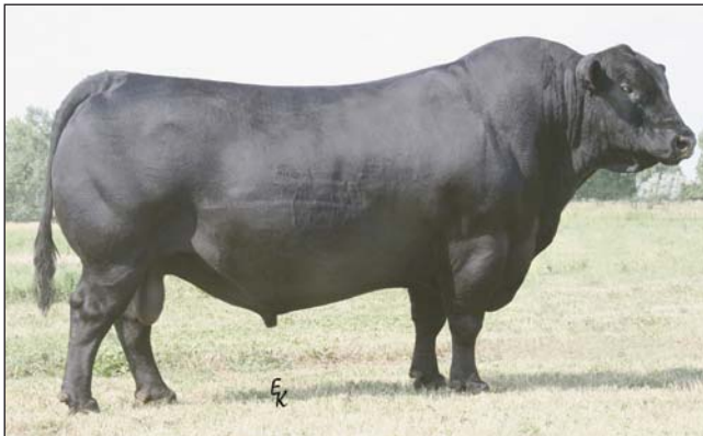
S A V Final Answer 0035

The most-popular Angus sire ever used that adds calving ease, thickness and carcass traits to his calves.