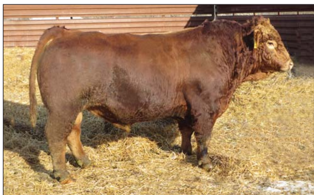
DVE Davidson Mr Dakota 151X

An Astro son of the DDGR 62R dam, we raised this bull and sold him to Chimney Butte Ranch. He adds frame and performance to his calves.