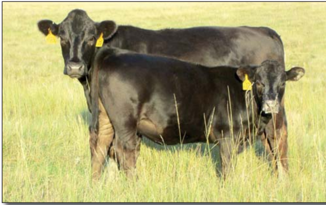
158Y and her heifer calf