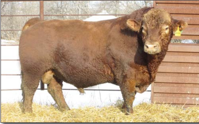
DDGR Home Run 35W