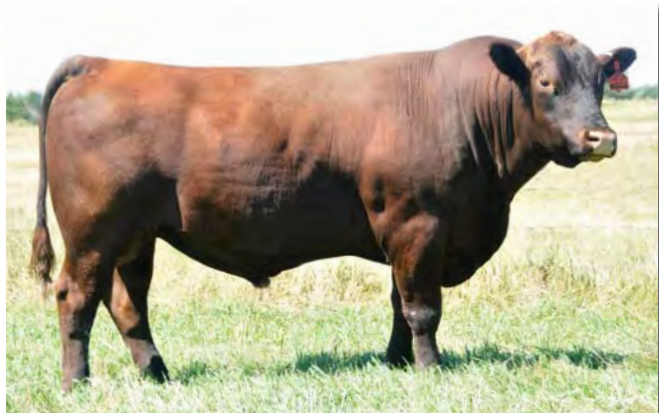
5L BLAZIN NORSE 1134-222W

BECKTON LANCER T A664 LJC HB LIZZIE 606 HOLDEN HI HO 753 LJC KJ JAMIE 516 BJR MAKE MY DAY 981 BIEBER SIRENA 6708 LCHMN RED SPREAD 1271F GMRA MESA MAID 321