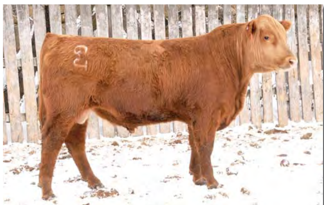
Lot 23 – Jacobson Advantage 3136

This thick-made, dark red bull will make friends sale day! Good ratios across the board: 108 WR, 106 YR, 123 IMF and 105 REA!