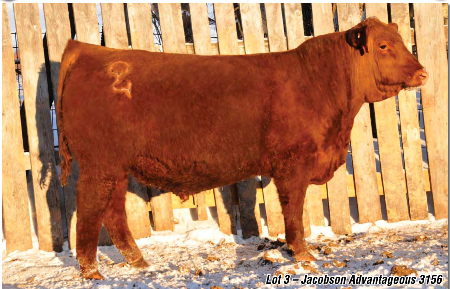
Lot 3 – Jacobson Advantageous 3156