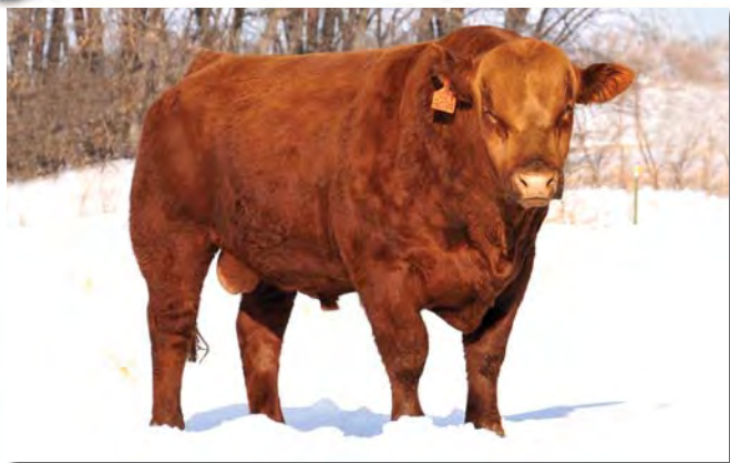
Lot 59 – Jacobson King 20134