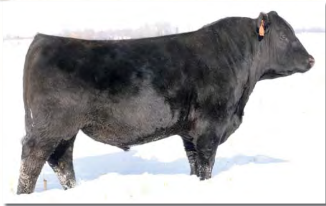
Lot 63 – Jacobson Blaze On 2078