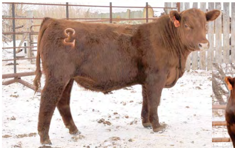
Lot 18 – Jacobson Mully 3180