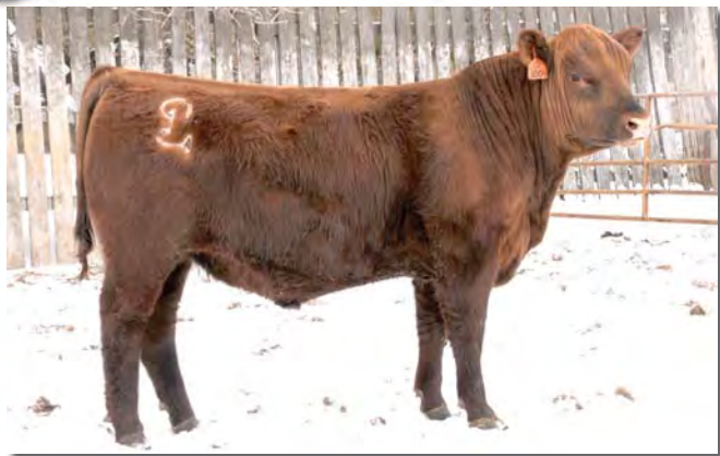
Lot 5 - Jacobson Indy Pend 3004