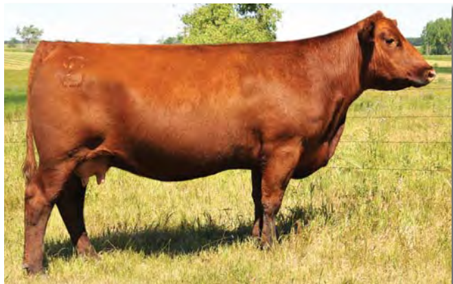
3K Red Crystal 6228