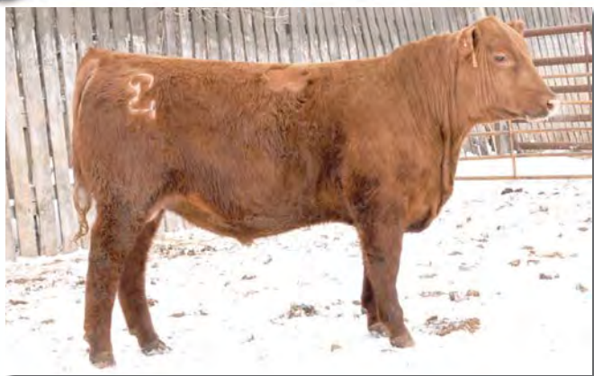
Lot 20 – Jacobson Advantage 3135