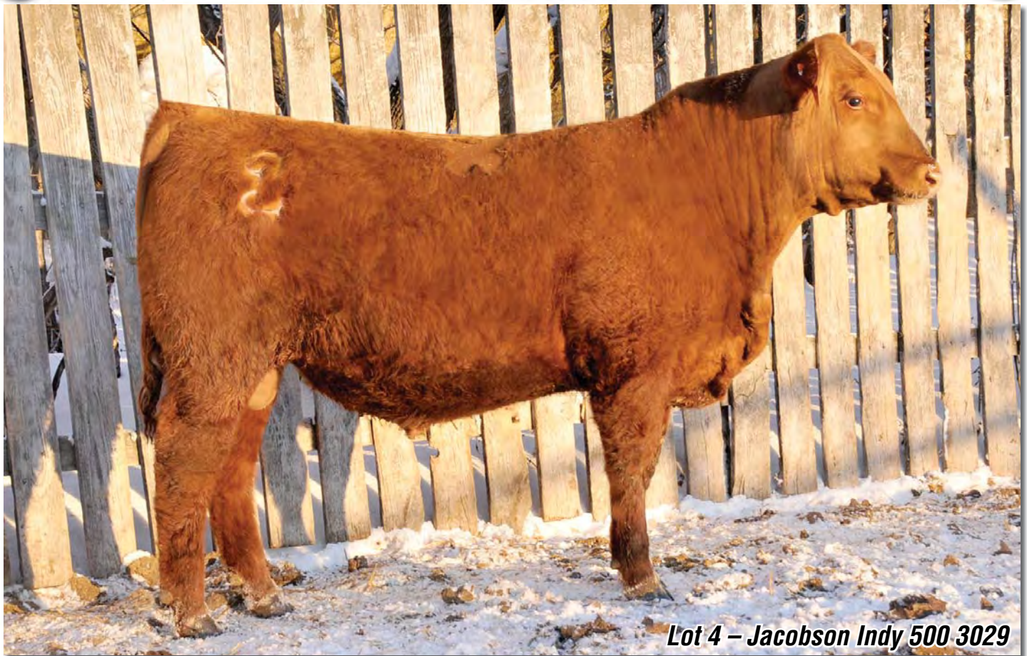
Lot 4 – Jacobson Indy 500 3029