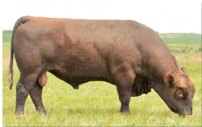
Jacobson Blazin On 0057, sire of Lots 29 - 31

Smooth-made calving ease bull that will work on heifers.