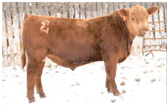
Lot 32 – Jacobson Blazin 3088

Another clean-made, calving ease son of Blaze On. He sports a -2.4 BW and top 20% REA!