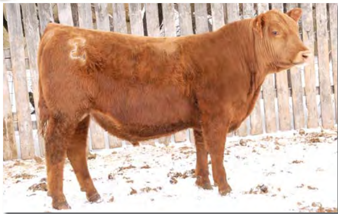
Lot 44 – Jacobson Statement 3095

ultrasound scans! Her foundation bloodlines include maternal leaders, Dreammaker and Rambler 5162. Full brother sold in Sonstgard sale for $9,000 to Kemen Farms, MN.