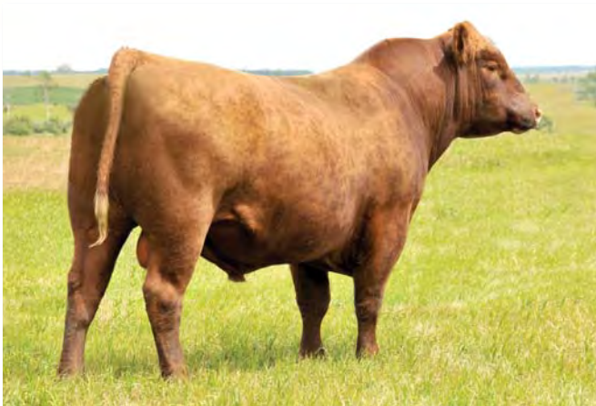
5L Independence 560-298Y, sire

VGW KING OF THE WEST NORSEMAN 1312 PJM LCC HEAVEN OR BUST1000B PSR BRIDGET 6278