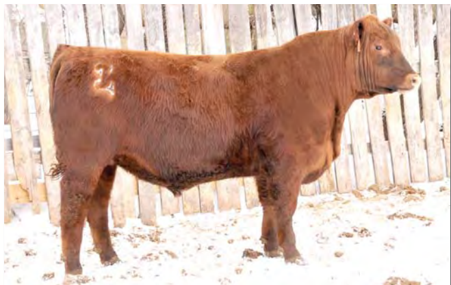
Lot 45 – Jacobson Mission 3009

Here is a rare ET Mission Statement son out of our top donor, Seeger Heidi 9905! 3095 boasts some of the most balanced data in the offering, with a -1.9 BW to 92 YW spread, and a top 23% Marbling and top 3% REA EPD. The dam, Heidi, has been the main building block in our herd. She has numerous daughters within the herd, and there have already been 27 calves reported with