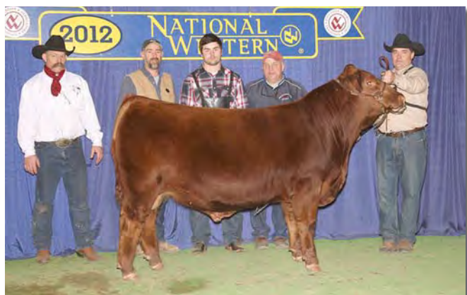
RRA ABSOLUTE POWER 125

S A V 8180 TRAVELER 004 RRM-NANCY-8965-9606 LCC CHEYENNE B221L BADLANDS MEDORA 440 RD ER DREAMMAKER 36D BJR EMILY 9097-977 BJR RAMBLER 5162 GMRA LARKABA 84