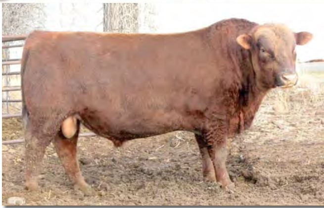
5L ADVANTAGE 3267-221Y