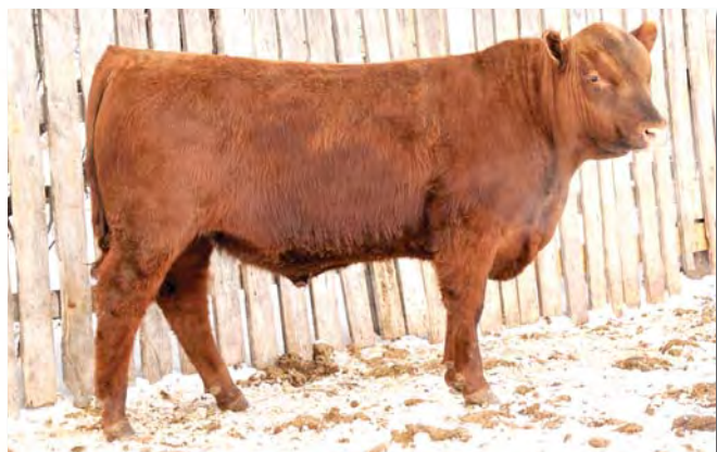
Lot 38 - LSCC301 Lancer Valley

New deal here... great performance in a calving ease package, he ranks in the top 2% for BW and the top 16% for Marbling.