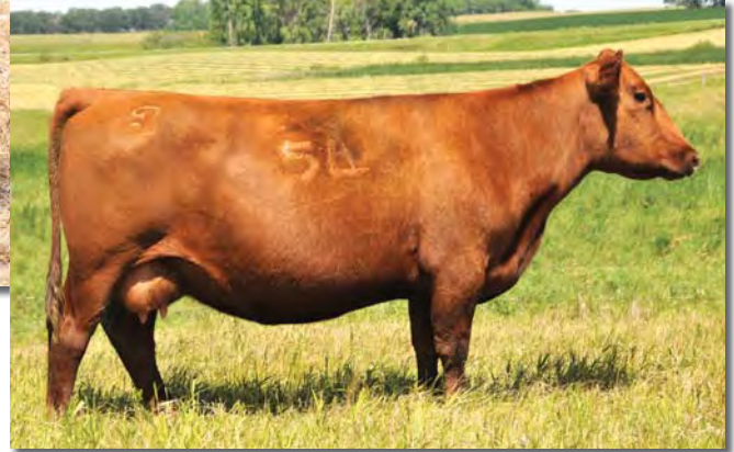
5L Fuschia 643-3668

O C C HUNTER 928H XXX MATTIE 589 HM 5L PRIME TIME 2559 5L FUCHSIA 45-27