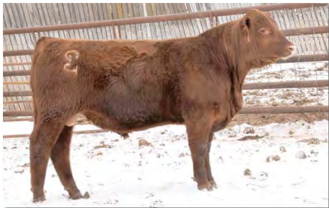
Lot 46 – Jacobson Mission 3138

One of the standout bulls in the pen, Mission 3009 posted a 103 WR and 111 YR. OS Carrier.