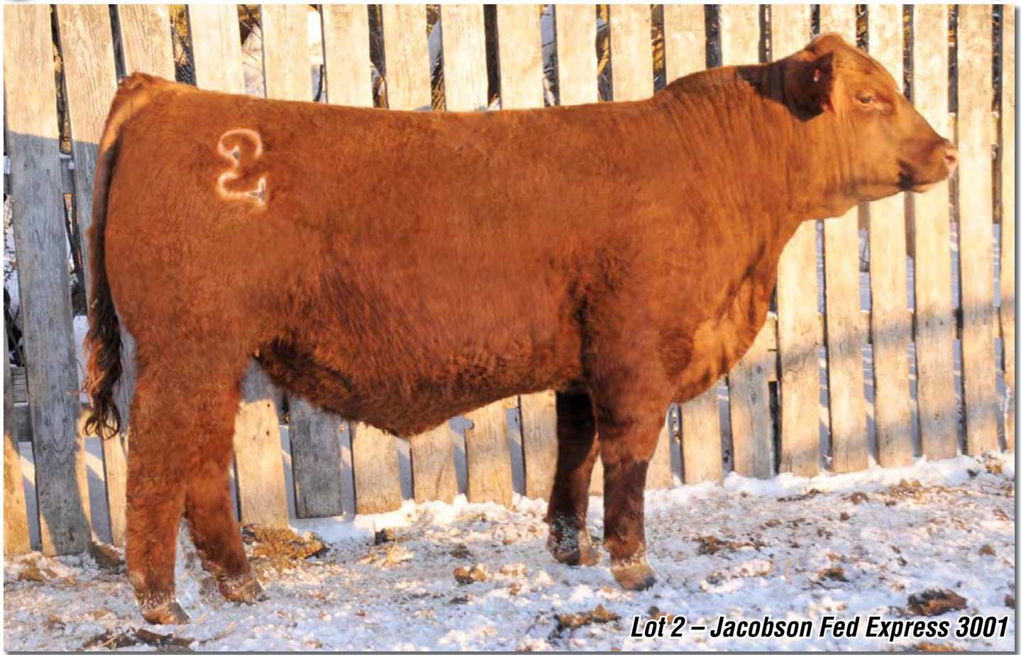
Lot 2 – Jacobson Fed Express 3001