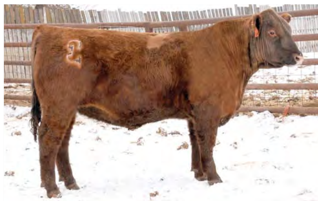
Lot 42 – Jacobson Express 3014

GLACIER CHATEAU 744 4L MR RAMBO R709 BJR MAKE MY DAY 402 PJMC PATTY SOLOM 24Z