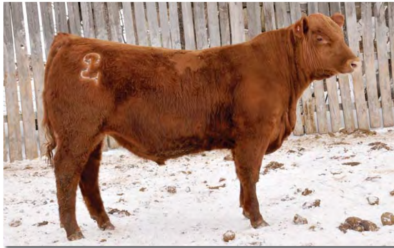
Lot 16 – Jacobson Mulberry 3077