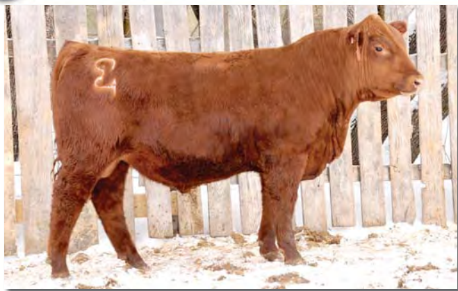
Lot 54 – Jacobson Worth 3175