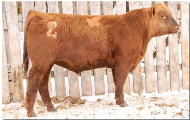
Lot 7 - Jacobson Indypendence 3005

Top 3% CED, 9% BW, 2% CEM, and 5% Marbling!