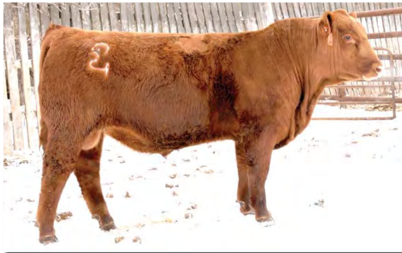
Lot 15 – Jacobson Mulberry 3248

The first of two ET Mulberry sons out of our top donor, Forever Queen 950-2657. You will not find many bulls as attractive and balanced as 3193. His dam is a maternal sister to our past herd sire, Coley's Mojito, and she is also the dam of Lot 2!