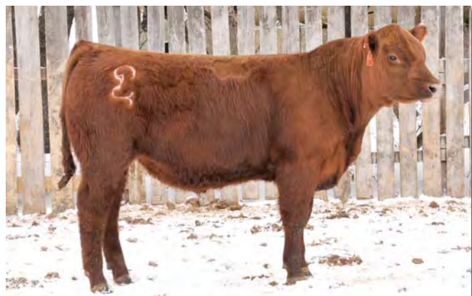
Lot 30 – Jacobson Blazin On 3067

The top performing bull in the offering with an amazing 122 WR and 120 YR!