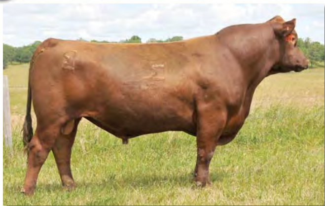
GMRA MISSION STATEMENT 1276