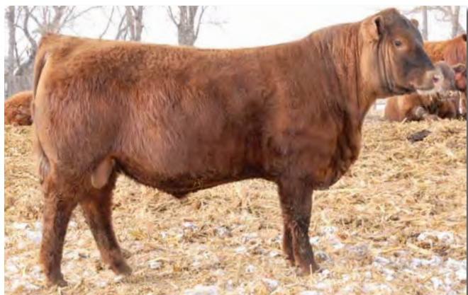
Lot 22 – Jacobson Advantage 3164

Nice -1.4 BW to 96 YW EPD spread, and a 118 IMF ratio!