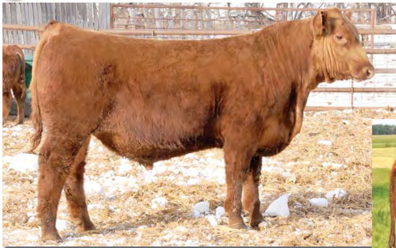
Lot 12 – Jacobson Power 3021