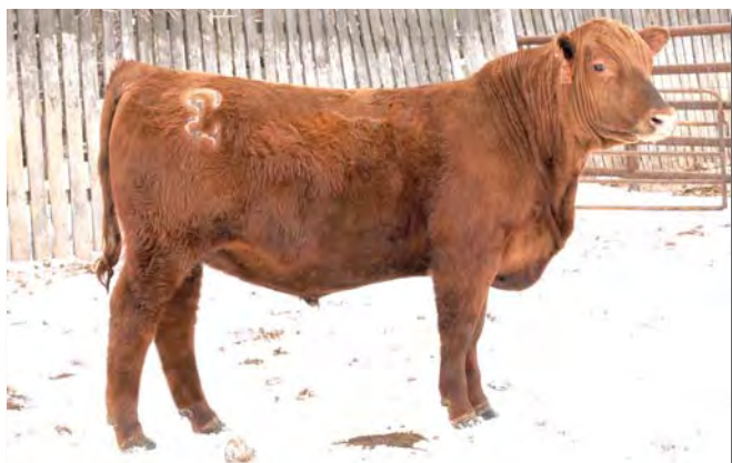
Lot 25 – Jacobson Advantage 3137