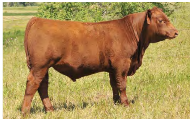
Advantageous showing off his advantages this past summer.