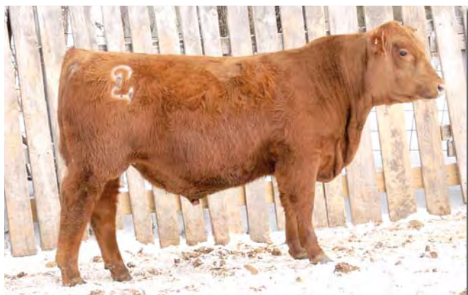
Lot 21 – Jacobson Advantage 3139

Bigtime performer with a 113 WR, 109 YR and 124 REA ratio!