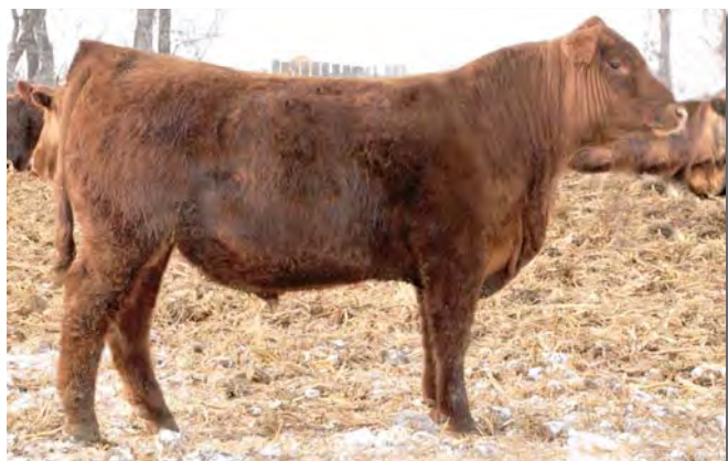
Lot 8 - Jacobson Indy 3007

Out of a good Terrain daughter, he is in the top 11% for CED and BW, and the top 7% for Marbling!