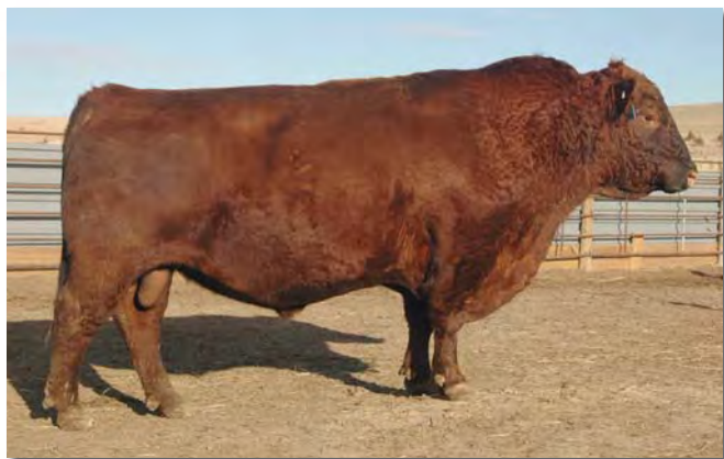
MLK CRK EXPRESS 9127

5L DIRECT FIRE 1641-6443 5L ADINA 525-893 O C C LEGEND 616L 5L HAZEL 1821-203 LMAN KING ROB 8621 LRNZ COUNTESS B028-4023 RED PROFESSOR 718 RED BETSY 7088