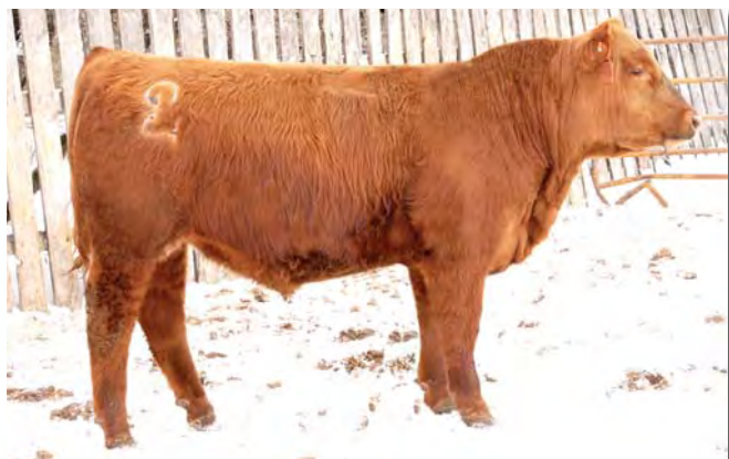
Lot 40 – Jacobson Chivas 3158

Our first Chivas sons, and 3015 is out of a super powerful Robin Hood daughter.