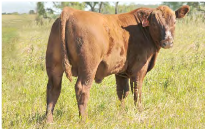
Lot 1 – Expression was already expressing himself this past summer.