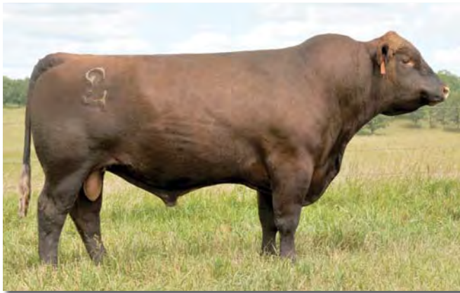
JACOBSON BLAZIN ON 0057

TC STOCKMAN TC PRIDE 0014 GLACIER LOGAN 210 5L ADINA 109-293