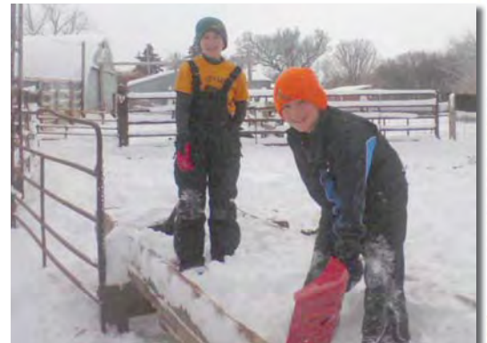
Grandsons shoveling out feed bunks