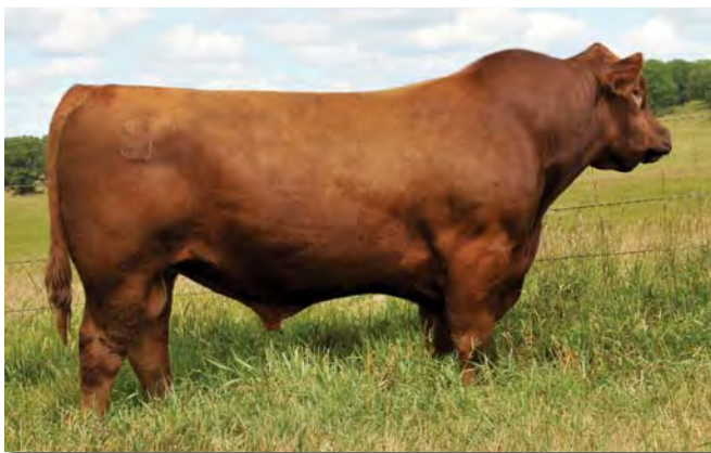
KOESTER CHIVAS 005

O C C HUNTER 928H XXX MATTIE 589 HM 5L PRIME TIME 2559 5L FUCHSIA 45-27