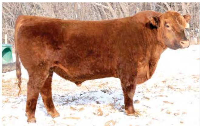
Lot 60 – Jacobson King 2069

The first of four age-advantaged SMxRA hybrid bulls, King 2034 posted a 120 WR, 123 IMF ratio and 118 REA ratio!