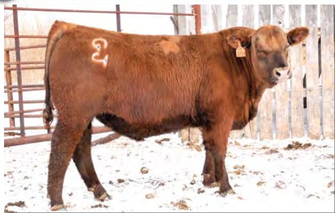
Lot 29 – Jacobson Blazin On 3173