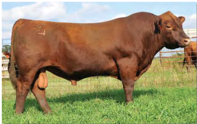
JACOBSON SHOOTER 9055

VGW ACE 613 VGW MT TABITHA 9633 376 P J M 141 P J M POWERPOINT 2009 D H D TRAVELER 6807 DIXIE ERICA OF C H 1019 BJR RAM 5162-6243 BIEBER TESS 4634