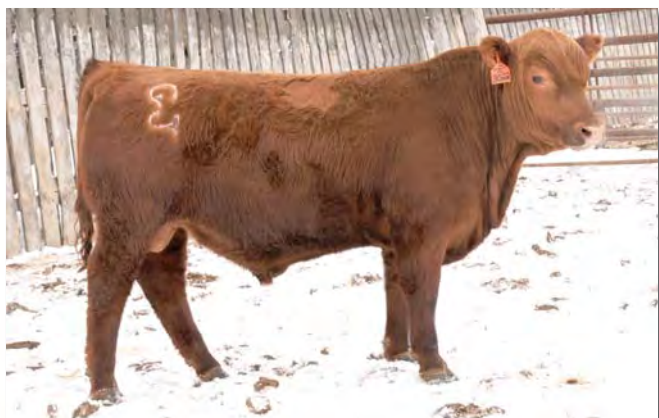
Lot 28 – Jacobson Conquest 3022

Lone Ole's Oscar son in the sale... check out his awesome EPD spread!