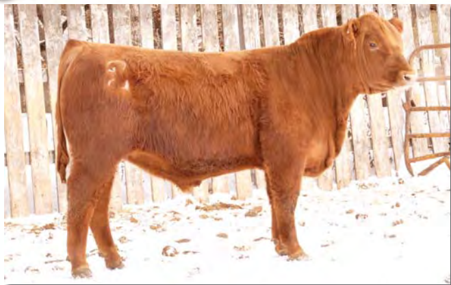
Lot 39 – Jacobson Chivas 3015