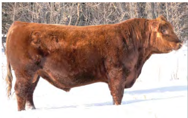
Lot 62 – Jacobson King 2067

Big spread with a -1.6 BW to 103 YW, and he ranks in the elite top 1% of the breed for REA!