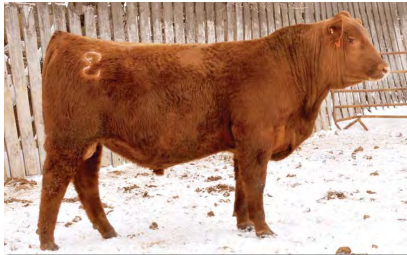
Lot 13 – Jacobson Power 3031

Are you ready for some power? Power 3021 is a meat wagon! With growth ratios of 115 for weaning and yearling, and a 105 REA ratio, use this bull on your cows to add those extra pounds of performance and red meat yield.