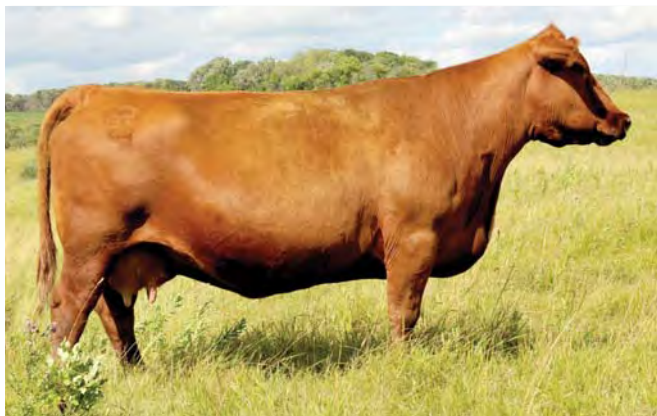
Glacier Fritz 501 ET