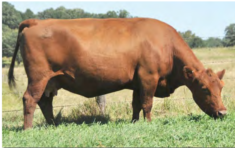
Glacier Fritz 501 ET, dam of Lot 17 and granddam of Koester Chivas 005

RED HR RAMBO ET 91K RED BRYLOR MISS ROC 20H SILVEIRAS REDFORD RED MC DOUGALL FAYETTE 59A LMAN KING ROB 8621 GLACIER REBALA GLACIER STATURE 318 GLACIER FRITZ 241