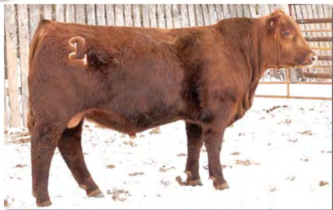
Lot 48 – Jacobson Mully 3097