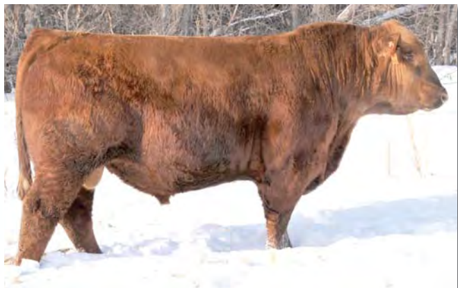
Lot 61 – Jacobson King 2080

Awesome 80 WW EPD on this hybrid... and check out his .63 REA EPD ranked in the top 2% of the breed.