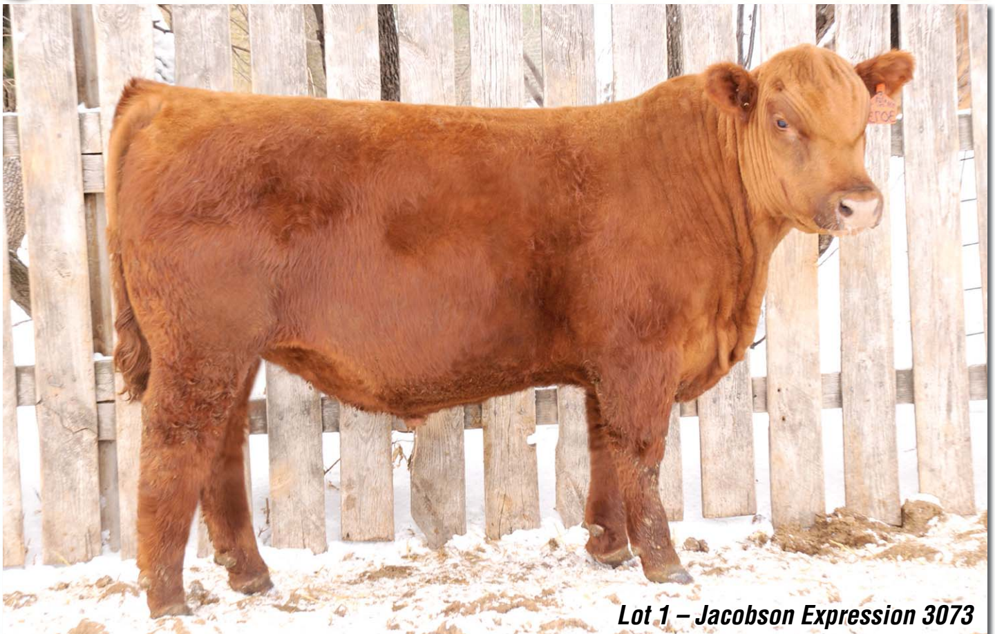
Lot 1 – Jacobson Expression 3073