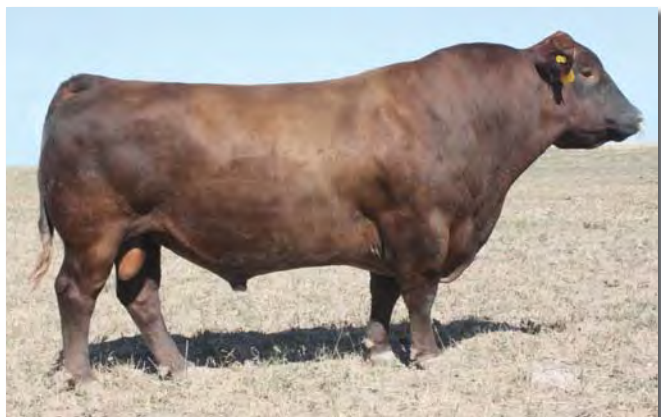
RED CROWFOOT OLE'S OSCAR