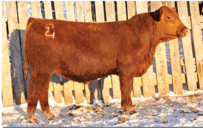
Lot 14 – Jacobson Mulberry 3193