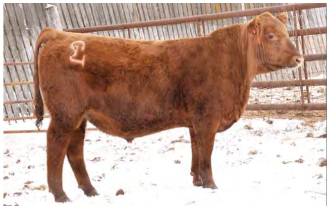
Lot 37 - LSCC304 Ocho Valley

One of the top heifer bull prospects in the entire offering with a -4.0 BW and top 21% REA!