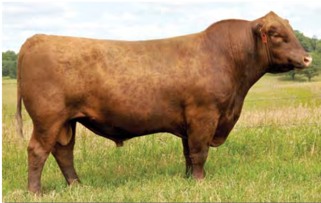
5L INDEPENDENCE 560-298Y

O C C LEGEND 616L 5L HAZEL 1821-203 5L WESTRN KING 454-2401 5L ADINA 518-2113