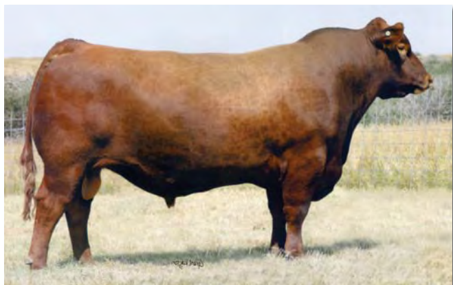
RED FINE LINE MULBERRY 26P

BECKTON JULIAN 6592 BKT BELGA 6746 GS BKT JULIAN 7526 G BKT MARTA 6498 XM BUF CRK CHF 824-1658 MRM 1431 8611 9109 LMAN KING ROB 8621 HXC 329C