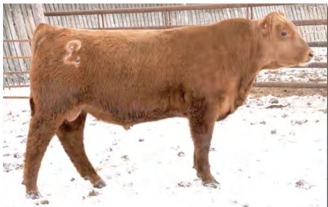
Lot 6 - Jacobson Indy 3040

Indy Pend 3004 leads off a great set of calving ease Independence sons... Lots 5 through 8 have averages of: 10 CED, -3.5 BW and .76 Marbling!