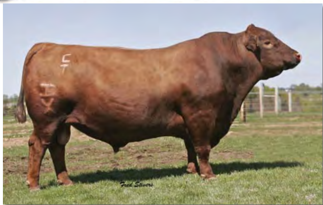
HXC CONQUEST 4405P