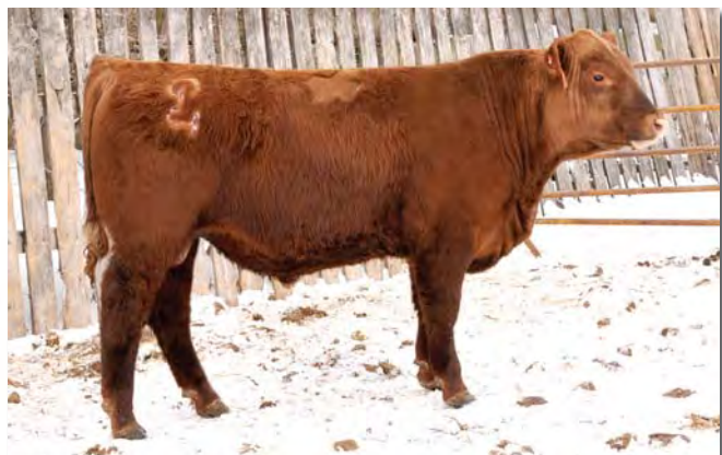
Lot 11 - Jacobson Indy 3070

Wow... out of an outcross dam he is in the top 3% for CED and the top 14% for Marbling!