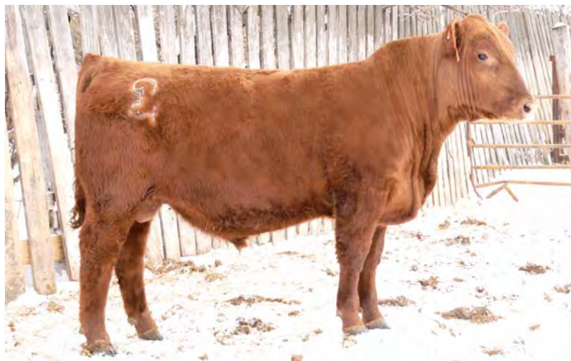
Lot 19 – Jacobson Shooter 3087

His sire, Mully 1119, was one of our stoutest calves from our '11 calf crop, and he stamps his calves with the same look that he had at that age. Rusty Spur Red Angus from Valley City, ND picked him out in the spring of '12.