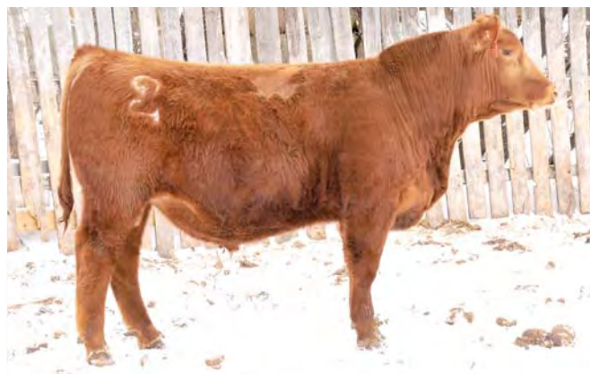
Lot 52 – Jacobson Tide 3064

Top percentiles for weaning and yearling growth, 3064's dam is a descendant of our great Heidi 9905 donor cow. Pictured below.