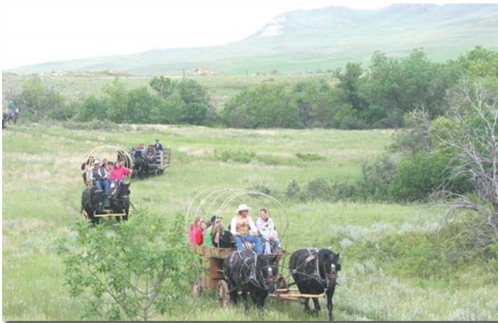
Wagon Train for JRA Round-Up