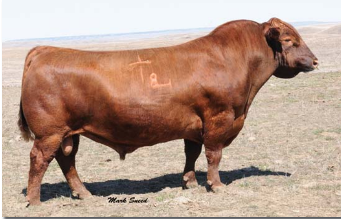
Beckton Epic R397 K, maternal grandsire