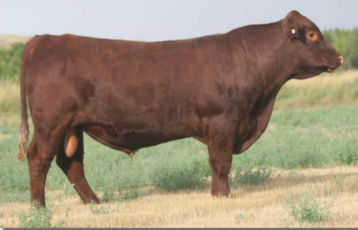
MLK CRK REDSTONE