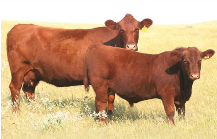
812 pair (dam of 3258)

This moderate framed Trailblazer son offers good thickness and depth of rib with fleshing ability. I really like the Trailblazer daughter that we have in production and I think this bull will leave a lot of good daughters that are the right size and type.