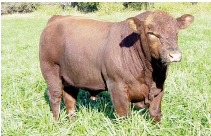
LACY KING 9240

X116 is a calving ease bull that we purchased in Buffalo Creek's final bull sale. This is his first calf crop for us and we are pleased with the type and kind that he has produced.