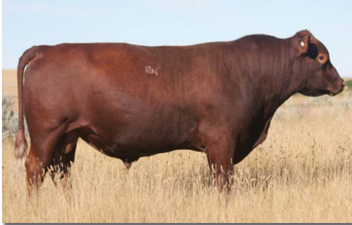
5L TRAILBLAZER 1766-188V