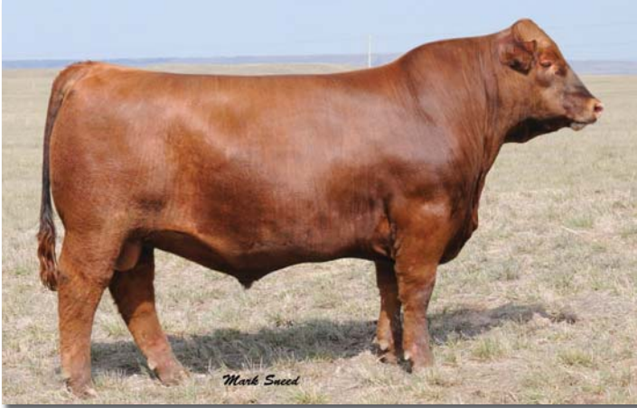
C-T GRAND STATEMENT 1025