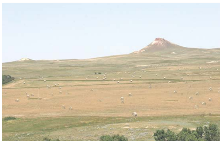
Cele spent the month of July baling and stacking hay

Grand Statement crossed with Beckton Epic produces a very balanced package which includes phenotype, performance and EPDs. 3249 packages a moderate birth weight with above-average weaning, yearling and gain ratios. His depth of side and muscle expression tends to complete the package very nicely. His dam has posted an 88 birth ratio with a 101 weaning and 107 yearling ratio on her progeny.