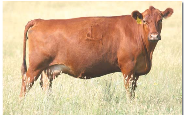
Dam of 3246