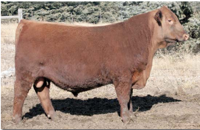
MLK CRK Impressive 1144, sire of Lots 3201 and 3225