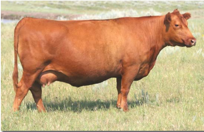
Dam of 3231