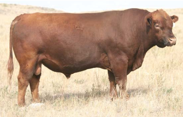
RIDGE TRADESMAN 6237-0002

The Impressive progeny continue to be the type of progeny we like. They are thick, deep and moderate but offer calving ease also. We are calving the 2nd set of daughters this spring and really like what we are seeing in the females.