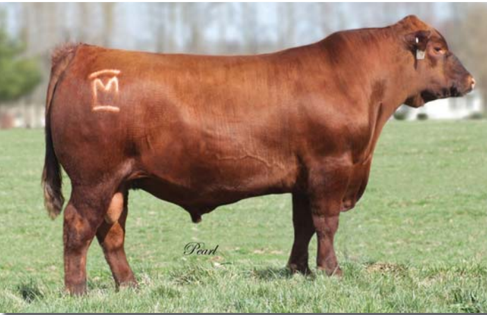
MUSHRUSH IMPRESSIVE CA U236

Redstone has been used as a cleanup sire for our heifers two years and then on cows for two years. This past year we used Redstone both AI and cleanup which has given us a larger group of progeny to offer. His progeny are dark red in color and have performed very well throughout. He balances the numbers very well but I think his daughters will be his most noted attribute.