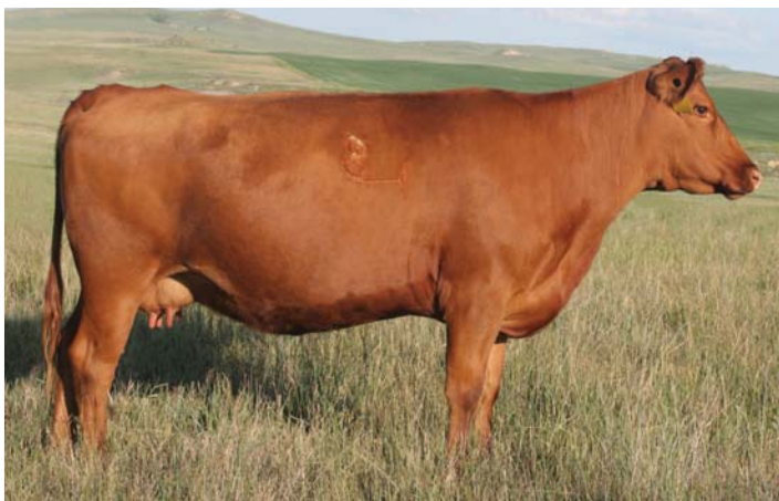
Dam of 3213

3213 is a moderate-framed Grand Statement son that is very balanced in his phenotype, pedigree and performance. His dam is a moderate-framed cow with a beautiful udder and has a 106 weaning and 102 yearling ratio on her progeny.