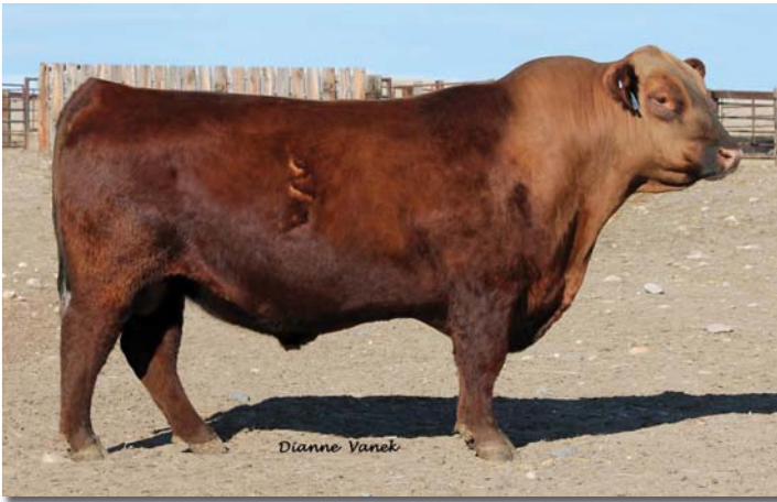
MLK CRK EXPRESS 9127

Grand Statement has been used as an AI sire the past two breeding seasons. This year's group of bulls has performed very well both at weaning and yearling. We have found that 1025 has thrown more frame in his progeny this year than he has previously.