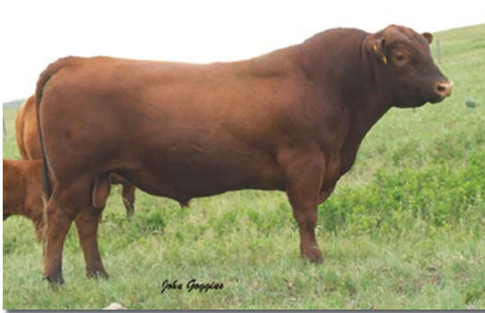
BUF CRK MEDALLION N328, sire of Ref. Sire B

Trailblazer was our pick of the calving-ease bulls in 5L's 2009 sale. We have used in as a cleanup bull on heifers since his purchase but lost him this past breeding season due to a fighting injury. We appreciate the moderate framed easy keeping daughters that he has left in the herd.