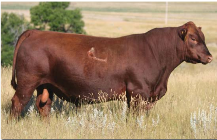
MLK CRK EXPRESS 9141

The 9127 progeny are moderate in their frame with a tremendous depth of rib and are very easy keeping. We calved the first daughters last spring and they held their flesh well and are going to be the right type of cows for our environment.