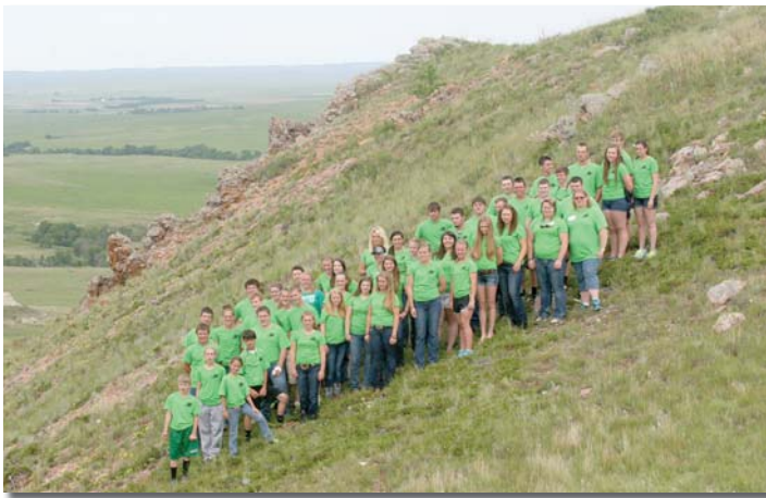
2013 JRA Round-Up Group

3235 stacks generations of calving ease with low birth weight sires in his pedigree that we have used successfully on heifers in our operation. His 72 pound birth weight and -5.6 BW EPD combined with a 7 Calving Ease Direct EPD should allow you to use him on heifers with confidence.