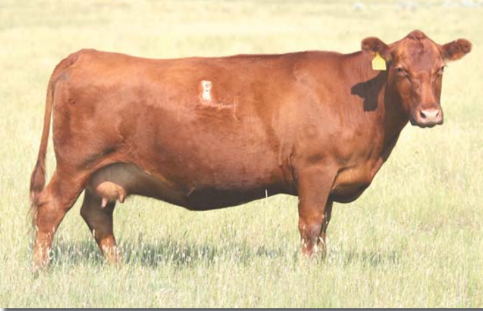
Dam of 3245