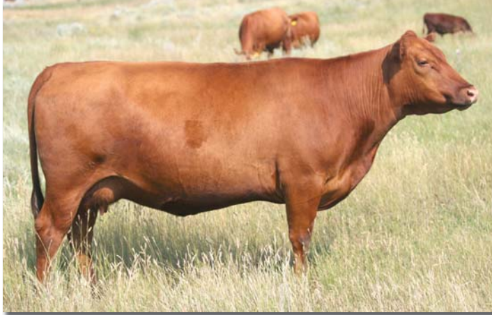
Dam of 3254