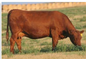
MLK CRK Sheba 079, donor dam