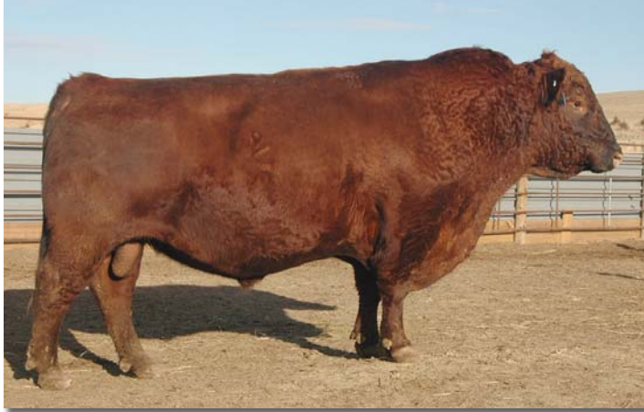
MLK CRK Express 9127