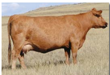
MLK CRK Lakota 953, donor dam