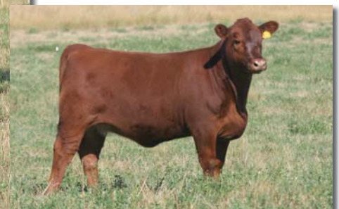
2011 NILE selection, daughter