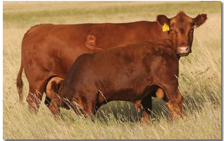
Lot 16 with bull calf at side

Bred AI on 5/10/14 to RED CROWFOOT MOONSHINE 8081U for an expected calving date of 2/19/15, bull. A solid cow with three daughters in the Milk Creek herd. Her 101.6 MPPA exhibits she has been a reliable and important member of the program with a top 4% HPG, top 9% STAY, top 5% MARB. These Shoco Data daughters are among the top in the mature cow section of this auction – don't miss your chance to own a great one!