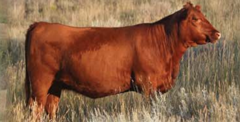
MLK CRK SHEBA 374 (#1615217)