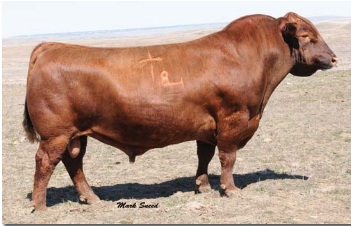
Beckton Epic R397 K