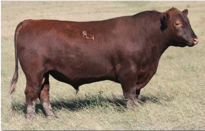
Ridge Legend 2069