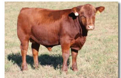
Epic x 523