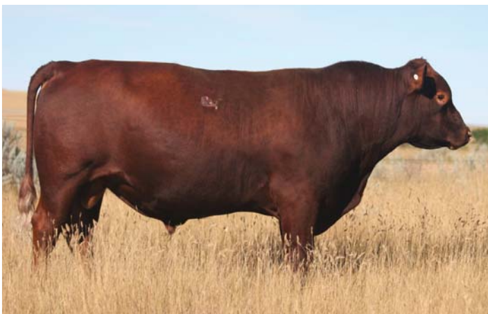
5L Trailblazer 1766-188V, sire

Lot 41 could produce your next herd bull with an Impressive calf due in February. Her dam is a highly regarded 7-year-old that just missed the cut for this auction of Mature Females. We will see her in the 2017 offering and it is hard to tell what her 103.1 MPPA may be by then. Don't miss out on this amazing pen of Red Angus bred heifers October 29.