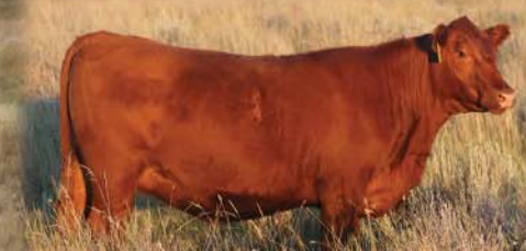
MLK CRK LAKOTA 376 (#1615341)