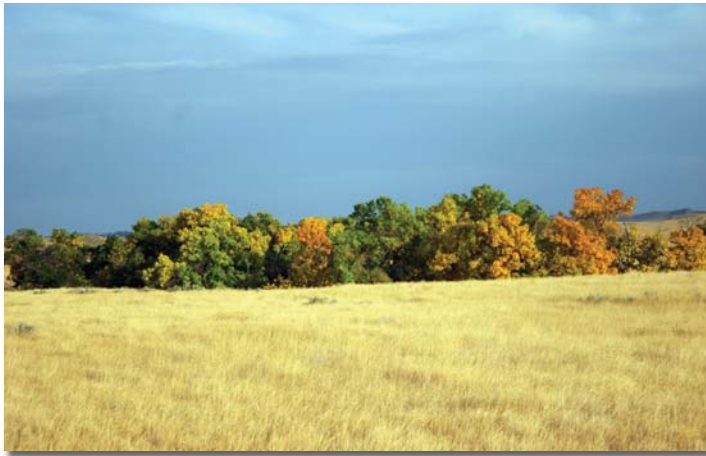
Golden autumn in southeast Montana

When you see this heifer, you would take a boat load just like her. Don't miss her 98 BR and 675-lb. weaning weight to ratio 106!