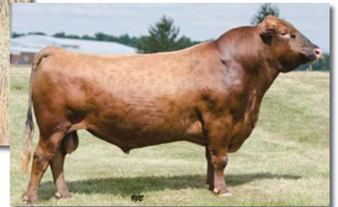
Select Sire's MLK CRK Epic 8171 , son of Lot 2

This outstanding cow is the dam of MLK CRK Epic 8171 standing at stud at Select Sires. All of her daughters are still producing and are very highly regarded in the Milk Creek herd with one daughter (600) being in this sale. Her carcass data is of particular interest, posting an IMF 4.06 to ratio 123, and a REA 12.50 to ratio 105. Sheba 403 ranks in the top 6% of the breed for CEM.