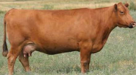
MLK CRK BLOCKANNA 459 (#987157)