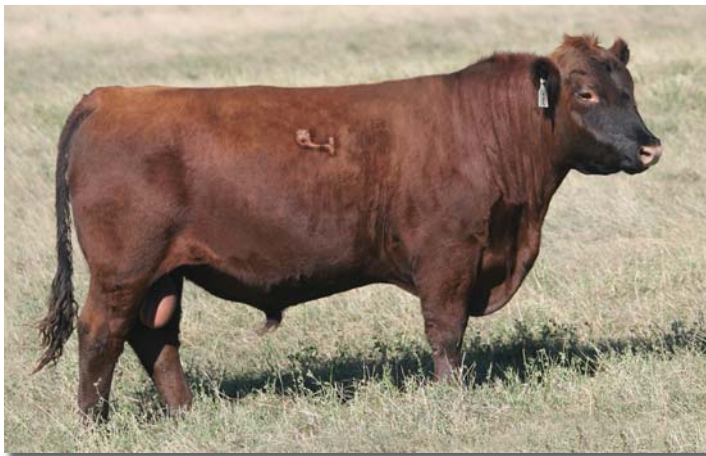
Ridge Admiral 3411

9127 is the sire to some of the bred heifers in the sale and will sire the right type of cattle for environments that require fleshing ability. He produces that soft made type of cattle that are easy calving, perform well and are making nice young females in our herd.