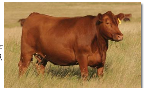
MLK CRK Lakina 970, daughter

Without question this is one of the top females in the offering and has been a flush cow for the Milk Creek program. She has a herd dominating 110.7 MPPA with a 113 AWR and a 107 AYR on seven head of progeny. The Milk Creek program also have a tremendous set of ET calves from this great cow. She ranks in the top 9% of the breed for Milk, top 4% for TM and top 3% HPG. She also posts progeny averages of 3.38 IMF to ratio 113!