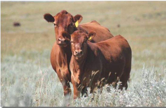
Lot 15 with 2011 heifer calf at side

Bred natural service to HRR IMPRESSIVE 227 for an expected calving date of 3/17/15, heifer. This gorgeous Red Angus female has been a "photo cow" for the 2011 sale with her cow-calf pair photo being used in all of the advertising and promotion associated with that auction. She ranks in the top 4% WW and top 3% STAY and she is carrying a HEIFER for 2015!