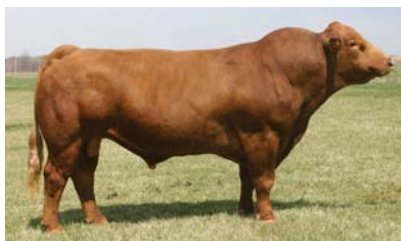
WS Beef Maker R13, sire of Lots 88-91

Bred natural service to RIDGE ADMIRAL 3411 for an expected calving date of 4/16/15. A top Beef Maker daughter from one of Milk Creek's solid Sheba cows posting a 102.4 MPPA. Buy all five of these F1 hybrids to start a super outcross package for your cattle program.