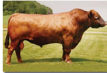
Glacier Logan 210