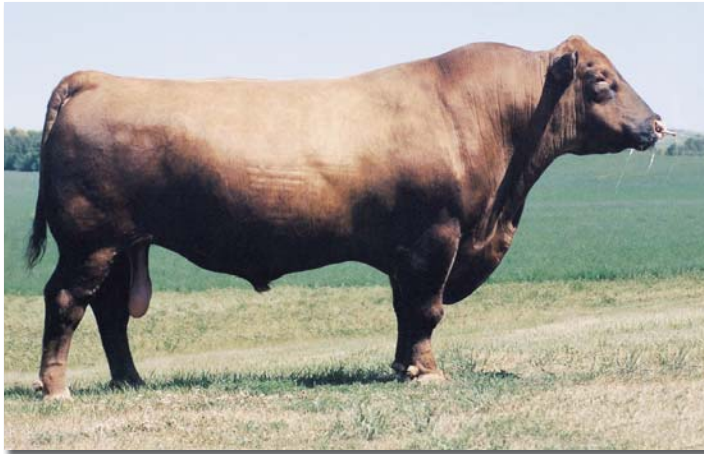
LCC Vaquero 1412J, sire