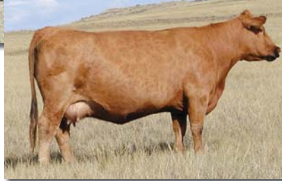
MLK CRK Lakota 953, donor dam