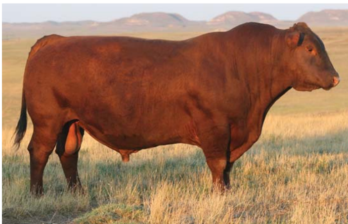
MLK CRK Express 9141

Impressive 227 was purchased from the 2013 Heart River Red Angus sale for his calving ease and the young dam behind him. His first progeny averaged 99 for birth weight and 104 for weaning weight. He has performed well during his first two breeding seasons and has maintained his flesh very well.