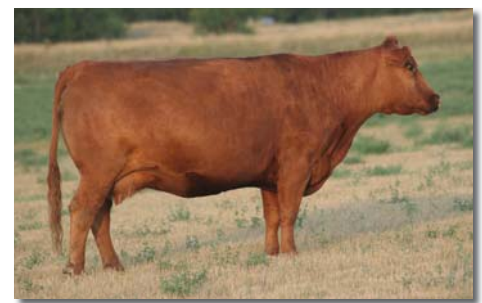
Lot 4's dam, MLK CRK Lakina 228, sold to Brad Grill of S.D. in our 2011 female sale.