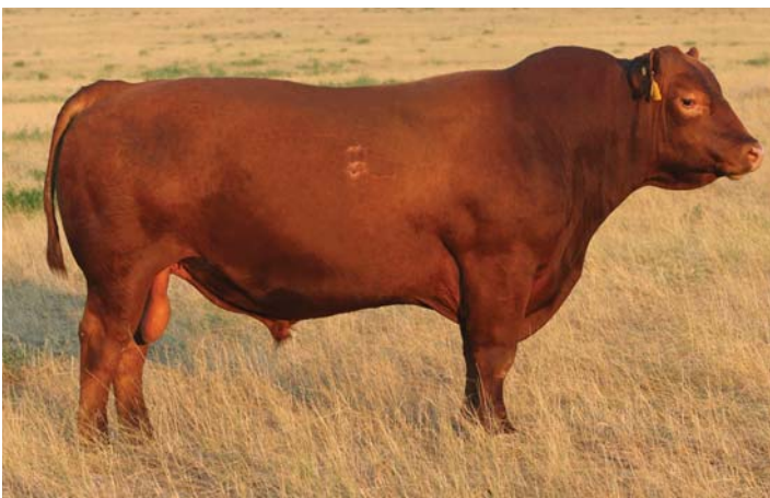
MLK CRK Blazin Trail 1162

Moonshine is a service sire to a few cows in the sale. We were able to view the bull and many of his progeny at the Crowfoot dispersion sale last November. We sampled him this spring to see how he will work on our genetics.