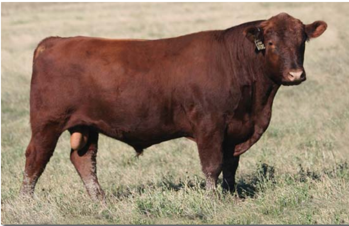
Red Crowfoot Redman 3107A, service sire

Bred natural service to RED CROWFOOT REDMAN 3107A for an expected calving date of 3/14/15, bull. This female comes with a top 3% BW EPD and a top 9% MARB! A direct Impressive daughter, get a jump on the competition with a super bred heifer from a 101.4 MPPA dam. Her Crowfoot Redman bull calf should add a lot of excitement in the calving barn next March.