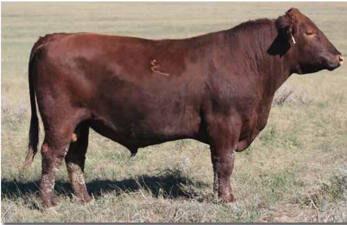
HRR Impressive 227, service sire

One of the highest production cows in the Milk Creek program for 10-year-olds is this 106 MPPA, 107 AWR and 107 AYR cow selling as Lot 10. She is Foundation x Cornerstone from the Bootjack Firefly cow family. You will drive thousands of miles to find one that will match her. If you are starting a new Red Angus program or adding to an existing one, cows like MLK CRK Firefly 4109 must be on your radar!