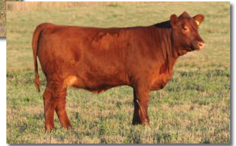
2014 NILE selection, daughter

Bred AI on 5/10/14 to ANDRAS FUSION R236 for an expected calving date of 2/17/15, twin heifers.