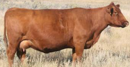
MLK CRK SHEBA 403 (#987012)