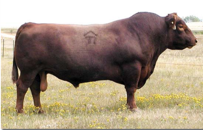
Shoco Data, sire