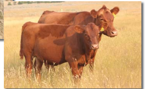
Lot 17 with heifer calf at side

TheLma 331 is a solid 102.5 MPPA cow (not sure what Tena was drinking when she numbered her, yes she is a 2005 model) in the 9-year-old section of the Milk Creek Mature Cow Dispersal. Her 2015 Epic bull calf should make a calving-ease sire for the ever growing heifer market – invest with confidence.