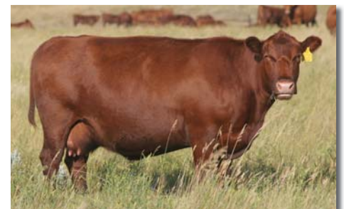
MLK CRK Sheba 900 , daughter Catalog and video online at www.milkcrekreds.com

This outstanding cow is the dam of MLK CRK Epic 8171 standing at stud at Select Sires. All of her daughters are still producing and are very highly regarded in the Milk Creek herd with one daughter (600) being in this sale. Her carcass data is of particular interest, posting an IMF 4.06 to ratio 123, and a REA 12.50 to ratio 105. Sheba 403 ranks in the top 6% of the breed for CEM.