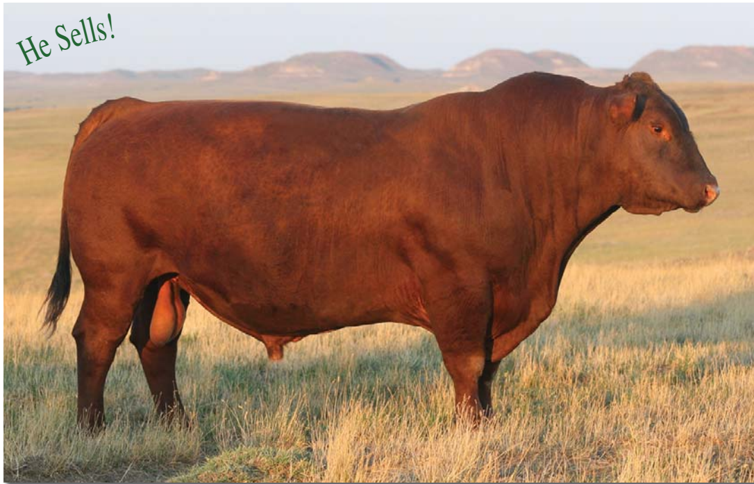
MLK CRK EXPRESS 9141