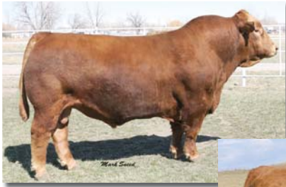
TNT Top Gun R244, sire