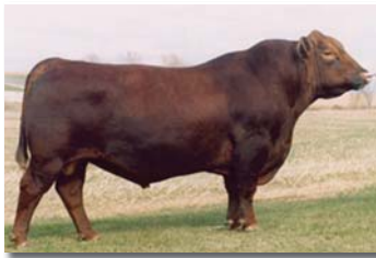
MLK CRK Capstone 901