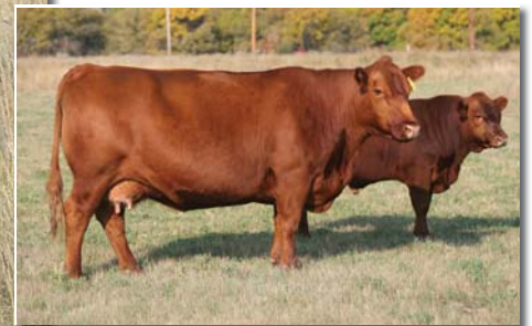
Lot 14, MLK CRK Lakina 523, is a maternal sister

Lakina 425 sells open and ready to flush. What an opportunity to invest into this great, proven cow carrying a sensational 105 MPPA and a 99 ABR, 106 AWR and a 102 AYR. Her impeccable record includes a top 9% CED, top 9% BW, top 1% Milk, top 1% TM, top 2% CEM and top 2% STAY! She is definitely a donor matron all the way with proven, breed-leading performance!