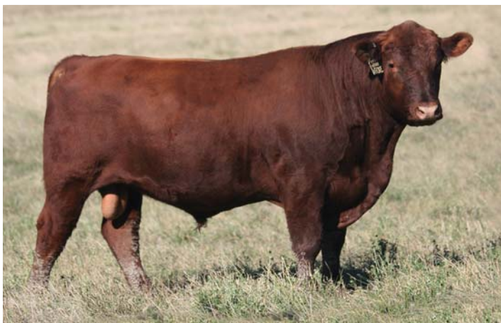
Red Crowfoot Redman 3107A

We selected 3411 out of the 2014 Flat Water Gang's sale for his fleshing ability, moderation of frame, and muscle pattern. He was turned in with 55 head of cows and first calf heifers and did a good job covering ground to get the cows bred. More importantly, he came out of pasture looking like he had been on feed during the breeding season. We are excited to see how his first progeny will look like and if he can pass on his fleshing ability to his offspring.