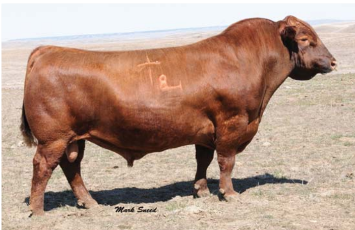
Beckton Epic R397 K, maternal grandsire

Lot 57 is a solid Red Top daughter that will pay her way in 2015 with a Crowfoot Redman bull calf. These young females have their entire life ahead of them to create and propagate breed-leading Red Angus calves for years to come. Invest in your future October 29 and put some of the best beef industry experts to work in your pastures – Red Angus females!