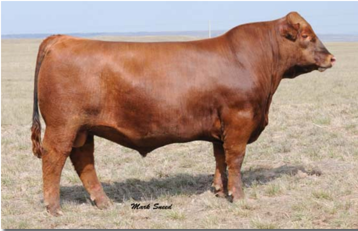
C-T Grand Statement 1025, sire