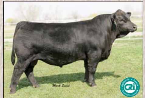
TNT Tanker U263