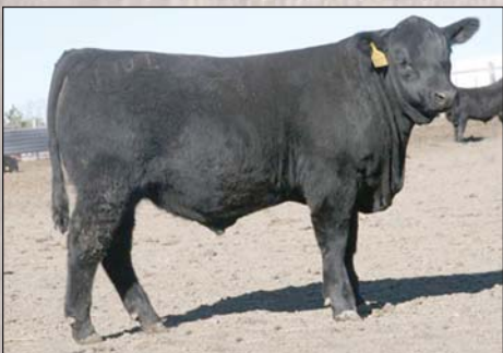
TNT Scholar X321