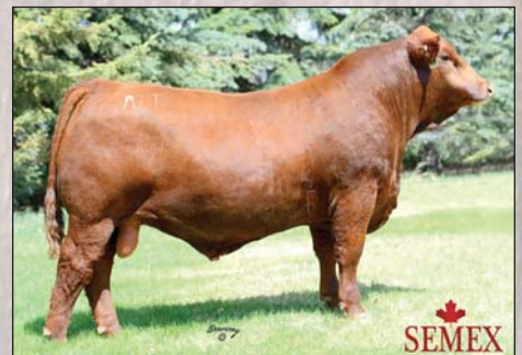
TNT Bootlegger Z268