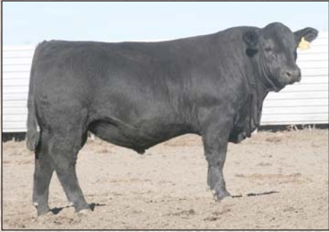
TNT Bullet Proof X240