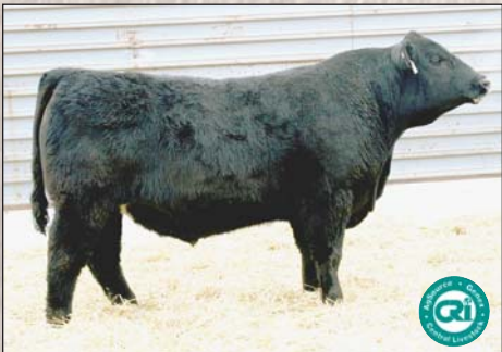
TNT Tuition U238