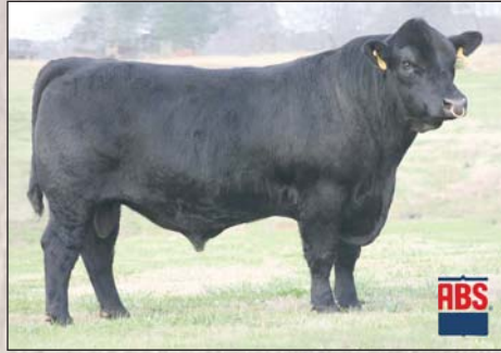
TNT Dual Focus T249