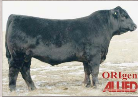
TNT Axis X307