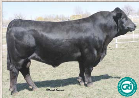
TNT Knockout R206