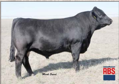
TNT Final Choice W210