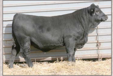
TNT Double Vision T205