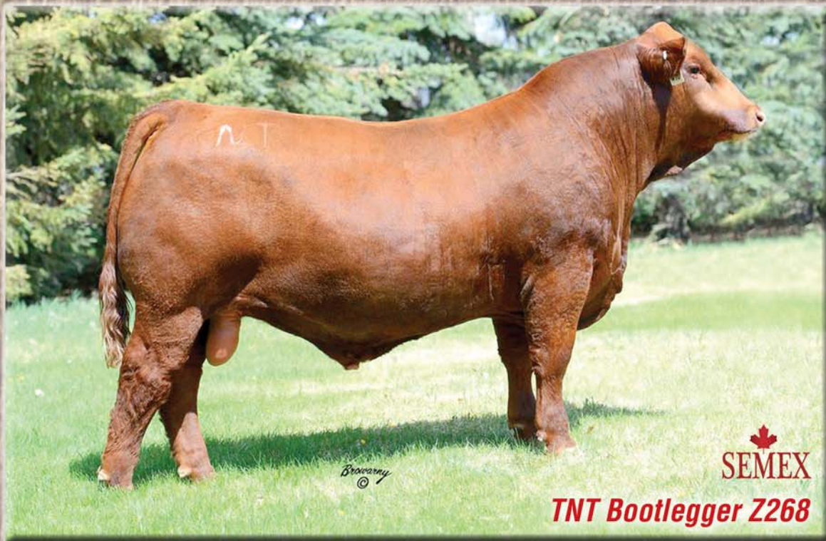
Our high-selling bull in 2013 owned by Trade Wind Ranch of Tioga, ND

This sale will be broadcast live on the internet. DVAuction Broadcasting Real-Time Auctions Real time bidding & proxy bidding available.