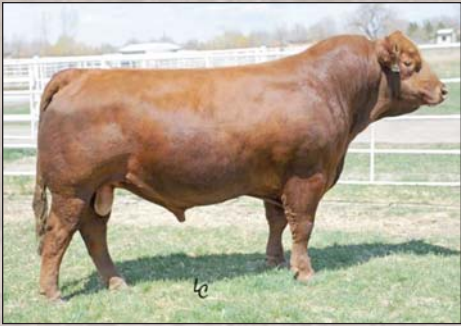
DCR Mr Moon Shine X102