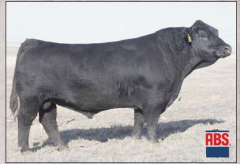
Mr NLC Superior S6018