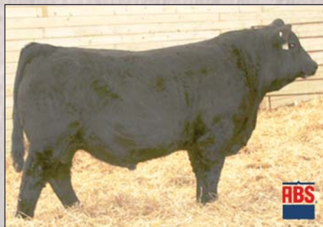
TNT Punch Y260