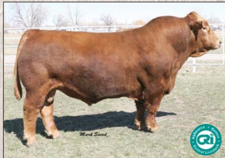
TNT Top Gun R244