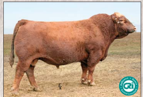
TNT Gunner N208